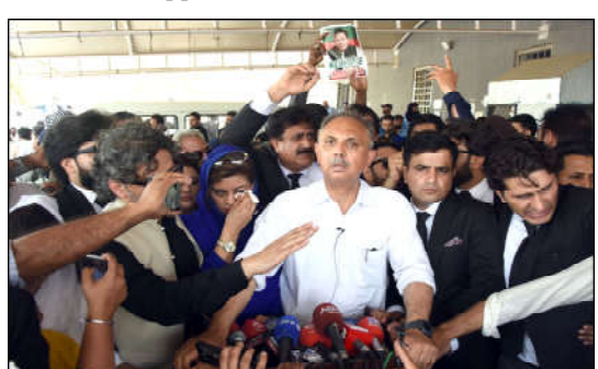
ISLAMABAD: Opposition Leader in the National Assembly Omar Ayub Khan talking with media persons outside district court in the Federal Capital, as the court rejects Imran Khan, wife appeal in unlawful marriage case.

Dr. Buladi acknowledged that the people of Balochistan are facing numerous problems, but with good governance, these issues can be resolved.