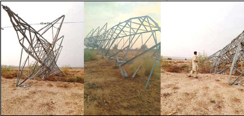
A view of towers of 132 KV Sui-Dera Bugti transmission line fell due to heavy rains and stormy winds

ISLAMABAD (APP): The Benazir Income Support Programme (BISP) and the Ministry of Information Technology (MOIT) have agreed to devise a strategy to combat fraudulent activities targeting innocent people. During a meeting with Minister of State for IT and Telecommunication, Shaza Fatima Khawaja, Chairperson of Benazir Income Support, Senator Rubina Khalid, emphasized the need for a national-level strategy with MOIT's assistance to protect people from deceptive practices exploiting the BISP name. He pointed out that increasing the number of pro-Kashmiri voices in the British Parliament, especially within the All-Parties Kashmir Committee, could significantly enhance the effectiveness of their advocacy for Kashmir's right to self-determination.