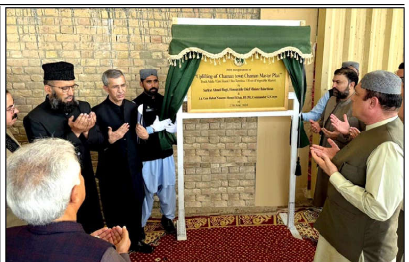
CHAMAN: Chief Minister Balochistan Mir Sarfaraz Bugti offering Dua after inaugurating Chaman Master Plan

It was highlighted during the briefing that there was substantial potential for energy cooperation with Azerbaijan, and discussions were ongoing for a preferential trade agreement between both countries.