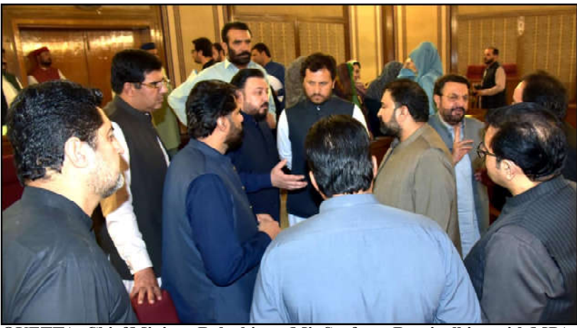
QUETTA: Chief Minister Balochistan Mir Sarfaraz Bugti talking with MPs after Assembly session.