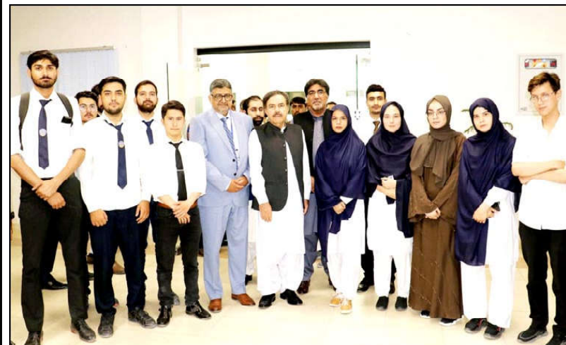
QUETTA: Governor Balochistan Sheikh Jaffar Khan Mandokhail in a group photo with students during his visit to BUIITEMS.