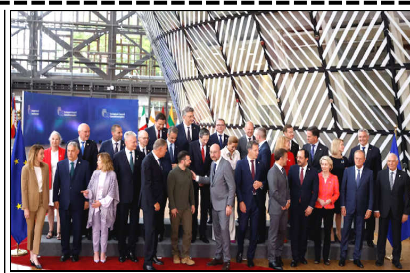
Ukrainian President Volodymyr Zelenskyy and European leaders attend a family photo session, during the European Union leaders' summit in Brussels, Belgium.