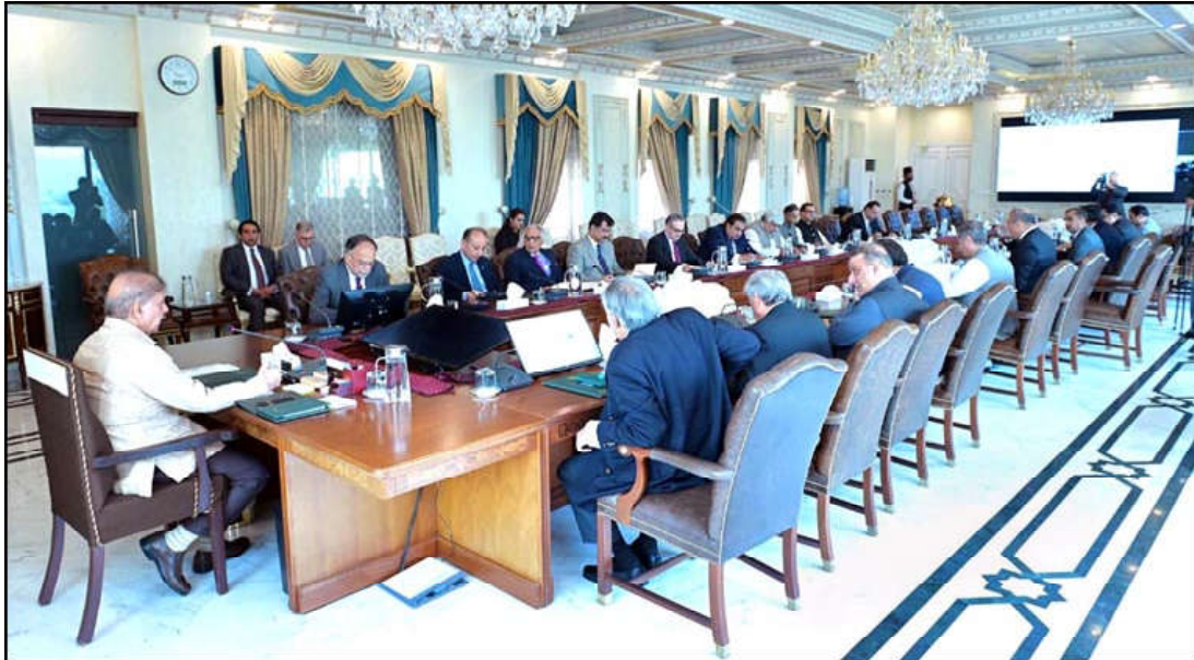
ISLAMABAD: Prime Minister Muhammad Shehbaz Sharif chairs a meeting regarding promotion of Pakistan-Azerbaijan economic ties.

Ph: 2841470/2841473 Vol: XIX No. 133, Zil Hajj 21, 1445 AH Friday June 28, 2024, Pages 04, Price Rs.15