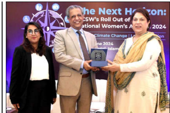
ISLAMABAD: NCSW Chairman Nilofer Bakhtiar Presenting Shield to Minister for law and Justice and Human Rights Senator Azam Nazeer Tarar.

ISLAMABAD (INP) - Former federal minister and Awami Muslim League chief Sheikh Rashid said on Thursday that whoever intended to hold negotiations with the government would end up ridiculing himself. Speaking to media outside the Islamabad sessions court, the former minister said the situation in Khyber Pakhtunkhwa and Balochistan was worsening.