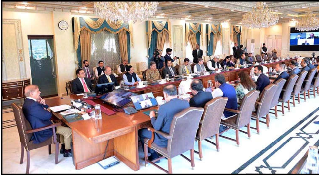
ISLAMABAD: A delegation of an International Consultancy Firm called on Prime Minister Muhammad Shehbaz Sharif.

Ph: 2841470/2841473 Vol: XIX No. 124, Zil Hajj 08, 1445 AH Saturday June 15, 2024, Pages 04, Price Rs.15