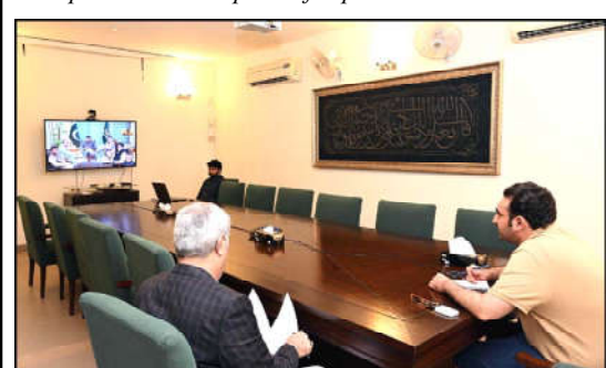
KARACHI: Peoples Party (PPP) Chairman, Bilawal Bhutto Zardari briefed by Sarfraz Bugti, Balochistan Chief Minister on his government performance, future plans and other measures regarding solving public problems in the province through video link, in Karachi.

He said he had requested the Principal Information Officer to add those who died of unnatural causes, in the insurance package so that financial assistance should be provided to their families as well.