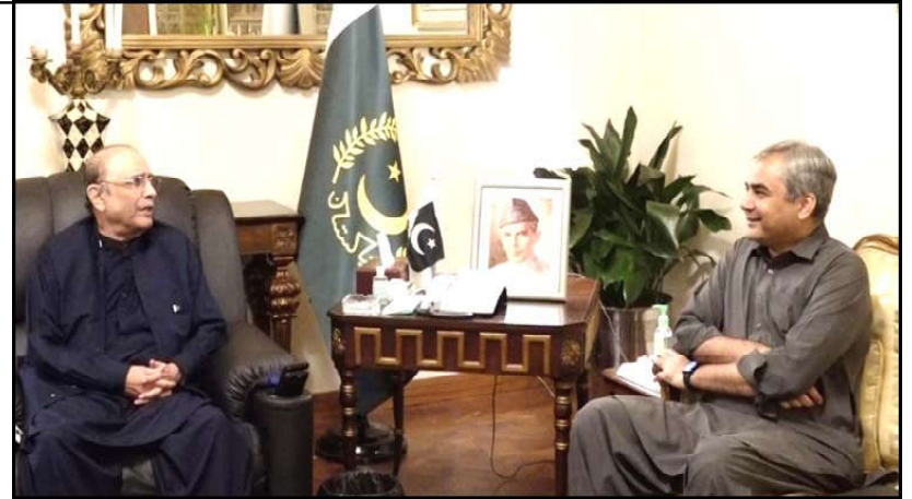
ISLAMABAD: Interior Minister Mohsin Naqvi meeting with President Asif Ali Zardari

Federal Interior Minister Mohsin Naqvi concurred that any challenge can be countered through the power of unity and solidarity.