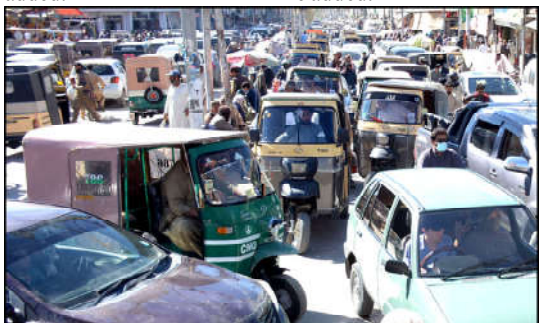
QUETTA: A view of traffic jam due to rush on bazaar during eid shopping.

The governor regretted that the promises made to federally and provincially administered tribal areas (FATA & PATA respectively) had not been fulfilled whereas the issues pertaining to the new taxes for the newly merged districts needed to be resolved. "Everyone knows about the security situation in Khyber Pakhtunkhwa and the KP chief minister must call an emergency meeting of the apex committee," Kundi said. The Pakistan Tehreek-e-Insaf (PTI) government was bragging about its education reforms whereas 26 universities in the province did not have a vice chancellor, he added.