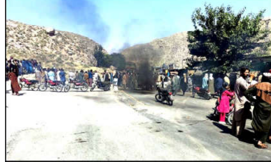
QUETTA: Tribals from Hanna Lake and Urak block road and burn tires as they are holding protest demonstration against race and one-wheeling by youths, at Hanna road.

The counsels of Pervaiz Elahi filed petition for exemption from attendance. They also filed medical certificate of Chaudhry Pervaiz Elahi wherein it was stated that doctors have stopped Chaudhry Pervaiz Elahi from travelling. Rib fracture of Chaudhry Pervaiz Elahi has also been not healed. The petition said Chaudhry Pervaiz Elahi is suffering from heart pain, therefore, his plea for exemption from attendance be accepted.