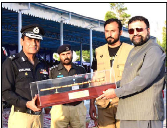
QUETTA: Inspector General of Police Balochistan Abdul Khaliq Sheikh presenting souvenir to Chief Minister Balochistan Mir Sarfaraz Ahmed Bugti during a ceremony of 100 th Passing Out Parade of Balochistan Police

their work by readers and go home after sipping tea. CCTVs have been installed in court rooms to see the presence of judges. The chief justice's comments came after six Islamabad High Court (IHC) judges wrote a letter Supreme Court on March 25, accusing spy agencies of meddling in judicial affairs. The IHC judges had demanded Chief Justice of Pakistan Qazi Faez Isa to convene the judicial convention to consider the matter of alleged interference of intelligence operatives in the judicial functions or "intimidation" of judges in a manner that undermined the independence of the judiciary.