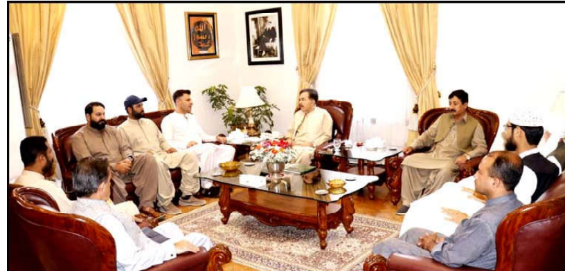
QUETTA: A delegation of Youth Wing Balochistan led by Sardar Naqeeb Tareen meeting with Governor Balochistan Sheikh Jaffar Khan Mandokhail