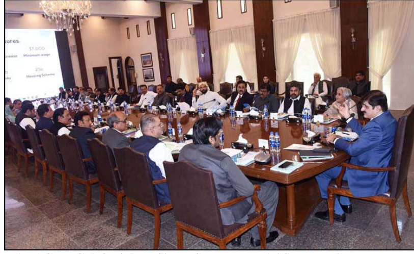
KARACHI: Chief Minister Sindh, Syed Murad Ali Shah presides over a pre-budget cabinet meeting at CM House.

which are serving humanity should be encouraged. He said that blood donation is a hope of new life for people suffering from life-threatening diseases including children suffering from thalassemia and hemophilia. Sardar Saleem Haider said that millions of patients get new lives every year through blood donation while it is harmless for the persons who donate blood. Speaking to the media, the Punjab Governor, Sardar Saleem Haider Khan said that Sundus Foundation has a good reputation as a reliable organization which is serving the persons suffering from thalassemia and hemophilia. He said that the people have faith