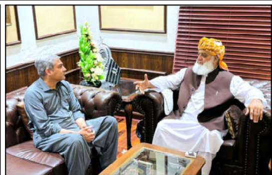
ISLAMABAD: Federal Minister for Interior Mohsin Naqvi in a meeting with JUI (F) Chief Maulana Fazlur-Rehman.