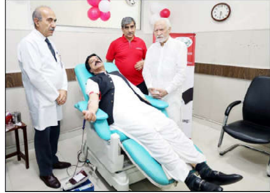
LAHORE: Punjab Governor, Sardar Saleem Haider Khan donating blood for children suffering from thalassemia and hemophilia during his visit to Sundus Foundation on World Blood Donor Day.