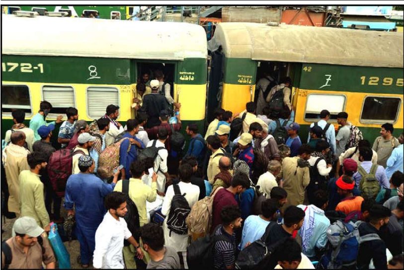
KARACHI: A large number of people gather for boarding on special Eid train as they are going to their native areas for celebrate upcoming festival Eid-ul-Azha with their family members, at Cantt Railway Station in Karachi.