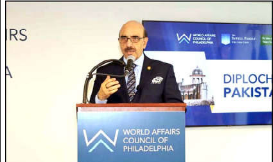
PHILADELPHIA: Ambassador of Pakistan to the United States Masood Khan addressing at World Affairs Council of Philadelphia, U.S.A.

tals across the district including Machh, Bhag Dhadar. All our efforts will be continued so that people do not face any kind of problems regarding health, if any citizen of any area, village has any kind of complaint, they can contact me in time 24 hours, he said. He said that his complaint would be redressed immediately and departmental action to be initiated against the negligent official. Due to the large number of problems, the responsibility will be carried out efficiently without wasting time in solving them, he said.