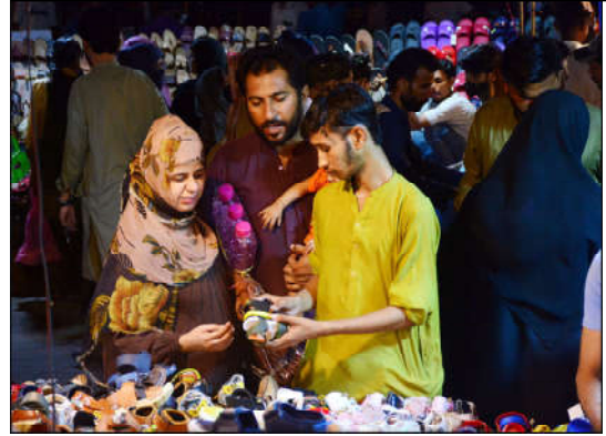
HYDERABAD: Family busy in selecting and purchasing sandal on a roadside stall in connection with Eid-ul-Azha at Resham Bazaar.