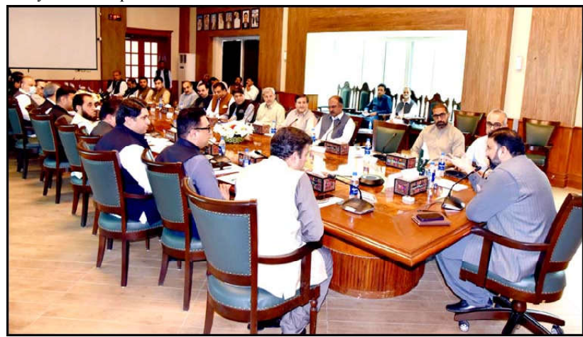
QUETTA: Chief Minister Balochistan Mir Sarfraz Ahmed Bugti presiding over a meeting to review preparation of provincial budget for next financial year 2024-25