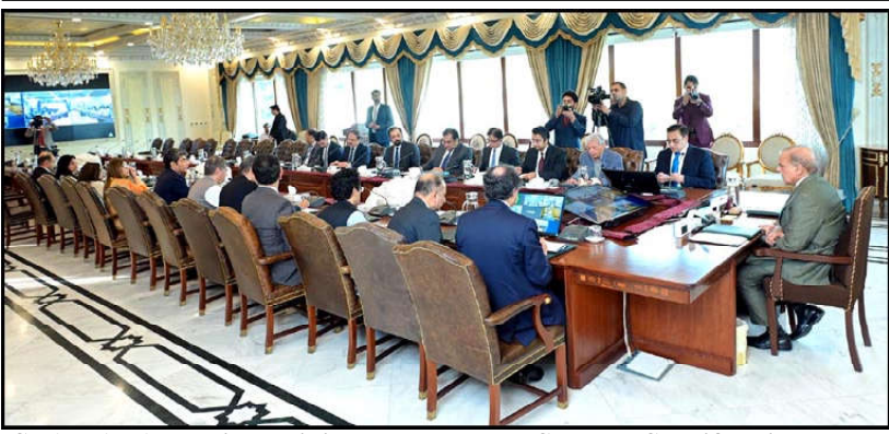
ISLAMABAD: Prime Minister Muhammad Shehbaz Sharif chairs a meeting on ease of doing business.