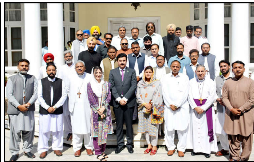
PESHAWAR: Khyber Pakhtunkhwa Governor Faisal Karim Kundi in a group photo with representative delegation of minorities who called on him at Governor House.

to the Party for honoring him with governorship of the province and headship of Benazir Income Support Programme (BISP). Today, he said the minority delegations which came to the Governor House consisted of all the political parties and not only from PPP. The Governor maintained that half of the national cricket team comprised of players from Khyber Pakhtunkhwa but sadly our historical cricket ground, Arbab Niaz Stadium was yet to be completed despite passage of 10 years. There is no First-Class Cricket in the province for a long time, he added. Kundi further assured the delegations that he would not let down the minorities and a special quota for them would be created in educational institutions adding that all other missing privileges would be provided to them.