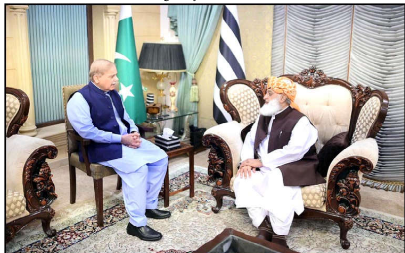
ISLAMABAD: Prime Minister Muhammad Shehbaz Sharif meets Maulana Fazlur Rehman.