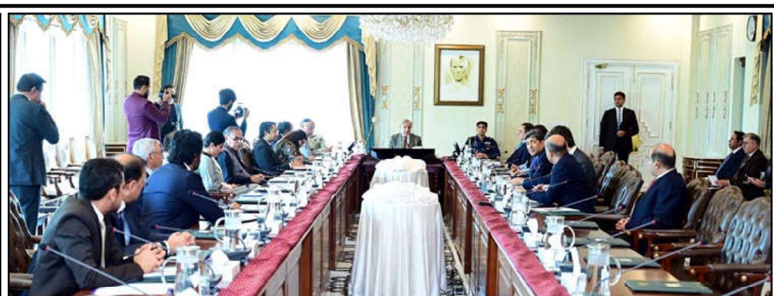
ISLAMABAD: Prime Minister Muhammad Shehbaz Sharif chairs a meeting on digitisation of the Federal Board of Revenue.

Banks, Real Estate, HealthCare and Retail. The event has given industry related experts to share their insights, interact and network with one another to discuss modern world technology challenges and how Huawei's cutting edge solutions can make organizations stay one step ahead of them. Over 100+ customers participated, representing a broad spectrum of industries. Also High-profile attendees, including C-level customers from key organizations were present.