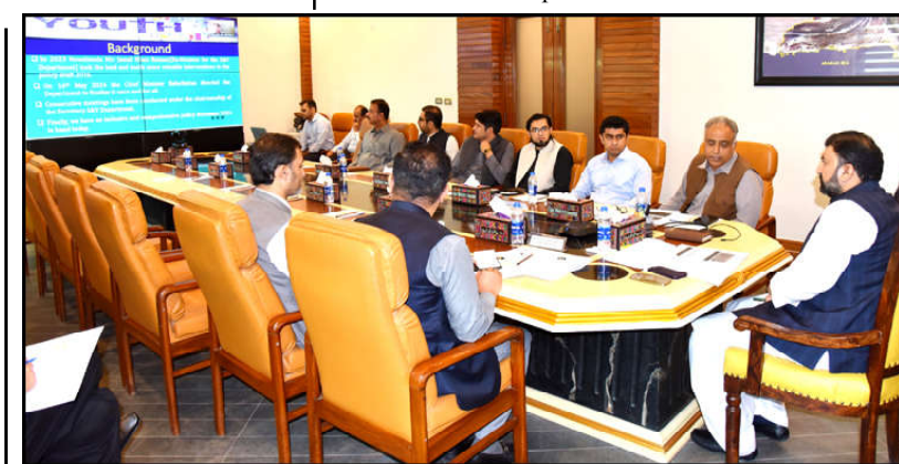
QUETTA: Chief Minister Balochistan Mir Sarfraz Ahmed Bugti presiding over a meeting regarding formation of Youth Police 2024

He said that we have not forgotten our martyrs and they would be remembered forever.