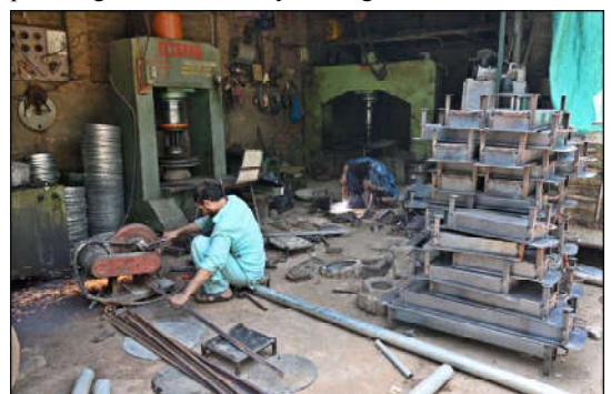
RAWALPINDI: A worker busy in preparing new grills to be used for Barbecue ahead of Eid ul Ahzai at his workplace, Pirwahai.

She also appreciated the increased allocation of the Benazir Bhutto Income Support Programme and congratulated Prime Minister Shehbaz Sharif and his cabinet for announcing a historical budget.