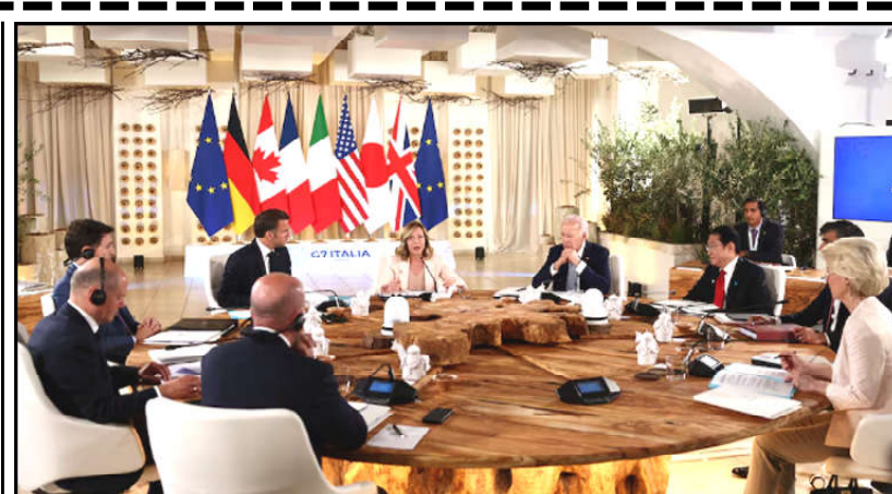
Italy's Prime Minister Giorgia Meloni, U.S. President Joe Biden, French President Emmanuel Macron, Canada's Prime Minister Justin Trudeau, German Chancellor Olaf Scholz, Britain's Prime Minister Rishi Sunak, Japan's Prime Minister Fumio Kishida attend a session on Africa, climate change and development on the first day of the G7 summit at the Borgo Egnazia resort, in Savelletri, Italy

to use the frozen Russian assets to benefit Ukraine comes several months after the White House broke through a logjam in Congress that stalled approval of some $60 billion in U.S. aid for Ukraine. The delay gave Russia time to make up ground on the battlefield. Earlier Thursday, Biden's national security adviser, Jake Sullivan, described the security pact as a "real marker" of the U.S. commitment to Ukraine, "not just for this month and this year, but for the many years ahead." Zelenskyy, on social media, said the document is "unprecedented, as it should be for leaders who support Ukraine." Sullivan said the agreement would not commit U.S. troops directly to Ukraine's defense against Russia's invasion. That is a red line drawn by Biden, who does not want to have the U.S. pulled into a direct conflict with nuclear-armed Moscow.