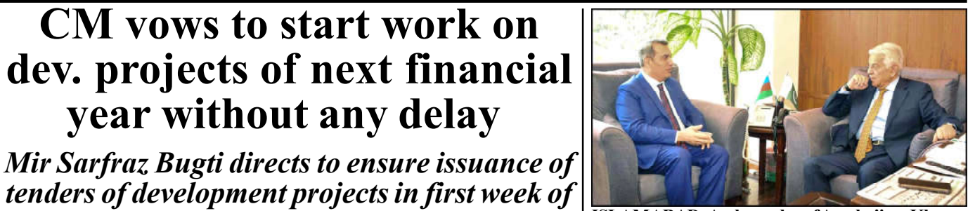
ISLAMABAD: Ambassador of Azerbaijan, Khazar Farhadov calls on Minister for Defence & Defence Production, Khawaja Muhammad Asif.