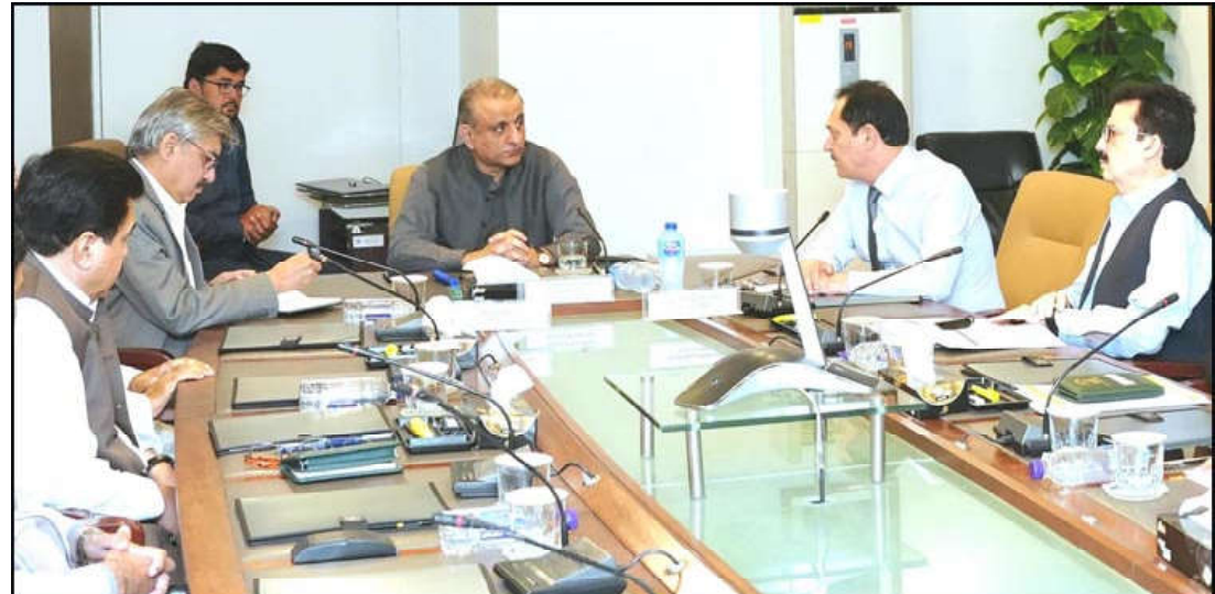
Federal Minister for Communications, Privatization and Investment Board Abdul Aleem Khan presiding over a meeting of NHA in Islamabad.

Matiari—Moro-R Khan. For New Scheme, an amount of Rs 6,250 million has been earmarked for land acquisition for GENCO-I installation of 1200 MW solar power plant Layyah, Rs 4,500 million for electricity distribution improvement and Rs 6,000 million for installation of assets performance management system on 100 kV and 200 kV distribution transformers.