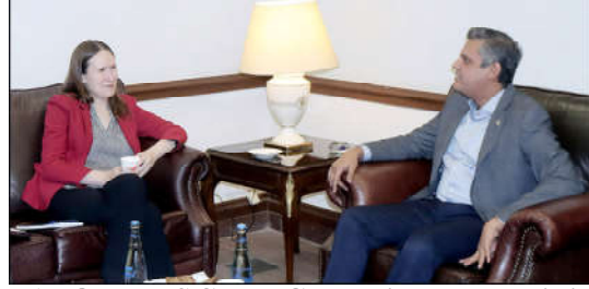
LAHORE: U.S Consul General in Lahore Kristin K. Hawkins meeting with Punjab Transport Minister Bilal Akbar Khan.

facilitating the lawyers, the web application has the streamlines processes and feature of displaying a real-time online cause list. judicial procedures by making them more cost-