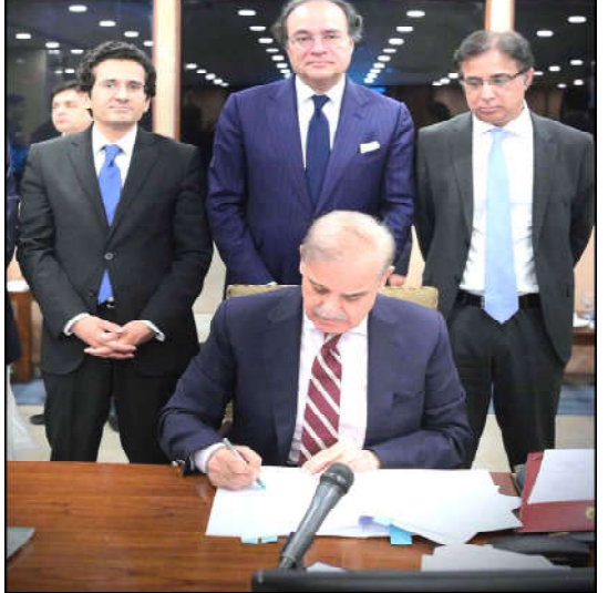
ISLAMABAD: Prime Minister Muhammad Shehbaz Sharif signs the documents of the Federal Budget 2024-25 after its approval from the Federal Cabinet to be laid before the National Assembly.

Presenting the federal budget 2024-25 in the National Assembly, the fifiscal year 2024-25 is fixed at 3.6 percent, whereas the inflation rate is expected to remain 12 percent