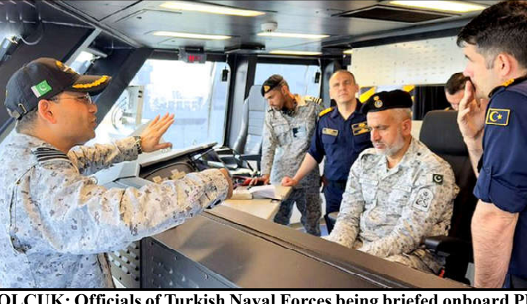
GOLCUK: Officials of Turkish Naval Forces being briefed onboard PNS BABUR at Golcuk Naval Base, Turkiy.

Transmission and Dispatch with the support of provin Company and the progress cial governments.