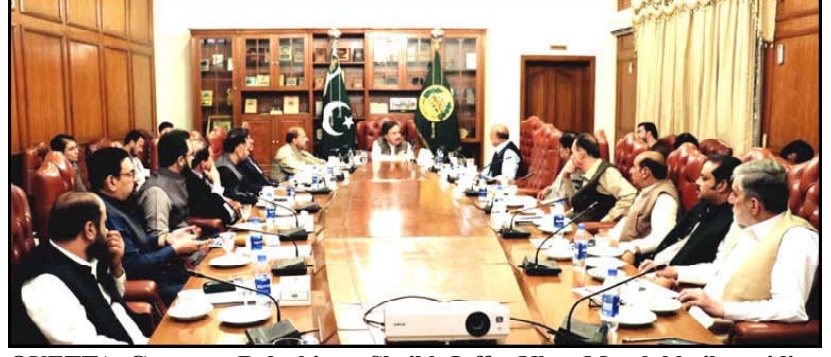
QUETTA: Governor Balochistan Sheikh Jaffar Khan Mandokhail presiding over a meeting regarding performance of Federal departments in the province