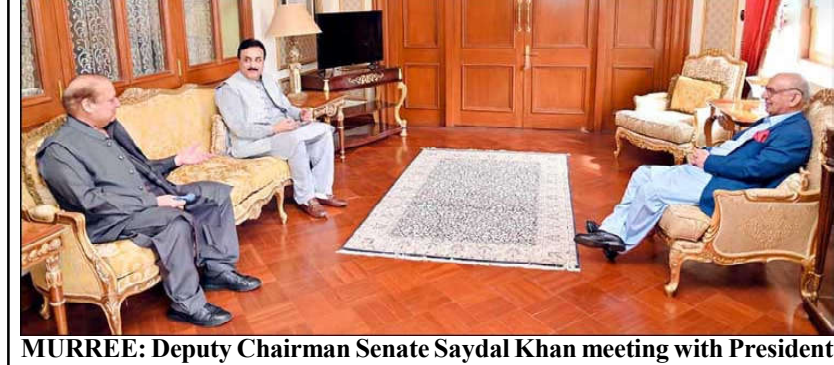
PML (N) Muhammad Nawaz Sharif.

'District administration taking measures to open road": Zayreen coming from Iran stranded at Pak-Iran border in Gwadar area due to road block by local dwellers: Rind