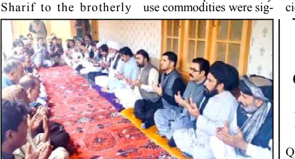
QUETTA: Chief Minister Balochistan Mir Sarfaraz Ahmed Bugti offering Fateha on sad demise of cousin of Provincial Minister Noor Muhammad Dummar

Pakistan to boost 26% BISP funding for poorest amidst IMF demands