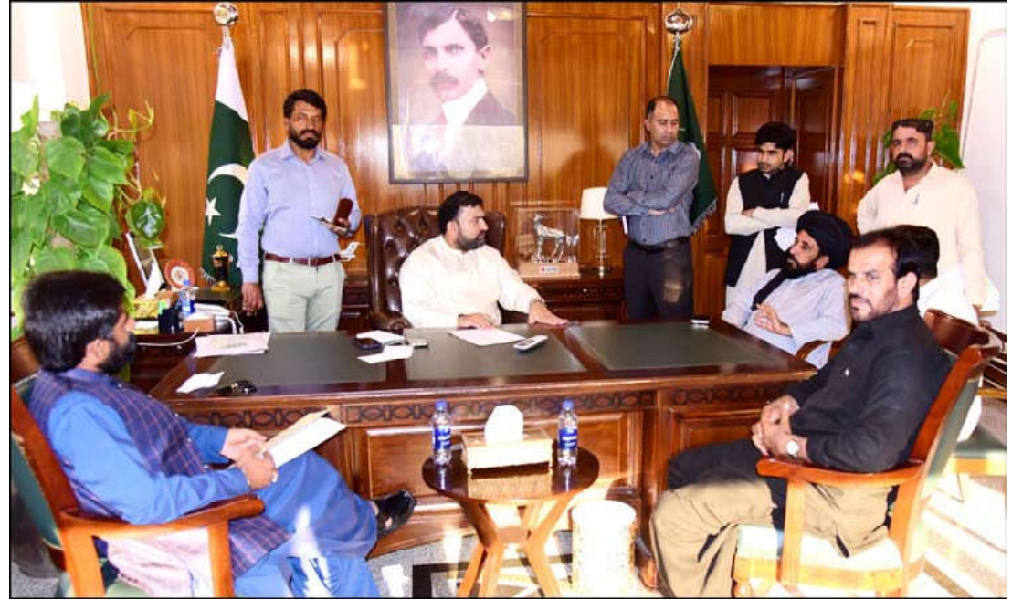
QUETTA: Chief Minister Balochistan Mir Sarfaraz Ahmed Bugti issuing orders after listening the problems of the masses

Ph: 2841470/2841473 Vol: XIX No. 119, Zil Hajj 03, 1445 AH Monday June 10, 2024, Pages 04, Price Rs.15