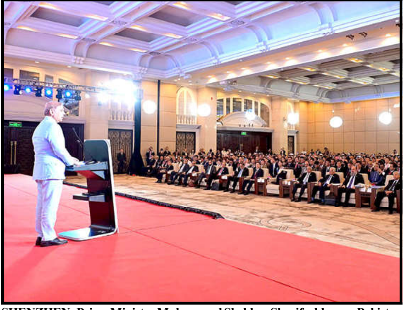
SHENZHEN: Prime Minister Muhammad Shehbaz Sharif addresses Pakistan China Business Conference.

Ph: 2841470/2841473 Vol: XIX No. 116, Zeeqad 28, 1445 AH Thursday June 06, 2024, Pages 04, Price Rs.15