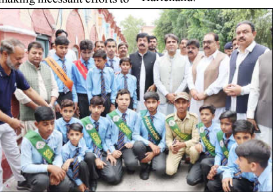
ATTOCK: Punjab Governor Sardar Saleem Haider in a group photo with students during his visit to Government Pilot School.

The minister also planted a sapling in the College and assured cooperation to the College administration rules and regulation was resolution of their problems. He was also underway, adding that it would resolve all the issues including financial problems of Islamia briefed by the faculty about various properties of the College in Khyber College. He said that the government was also Bazar, Charsadda and making incessant efforts to Harichand.