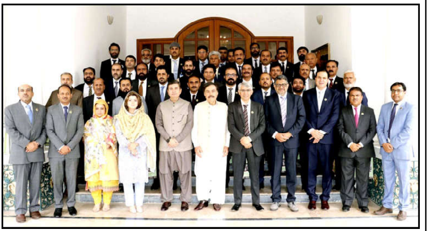
OUETTA: Governor Balochistan Sheikh Jaffar Khan Mandokhail in a group photo with under trainee officers of Midcare Management Course

Assembly and Ministers also visited Chaman on di-