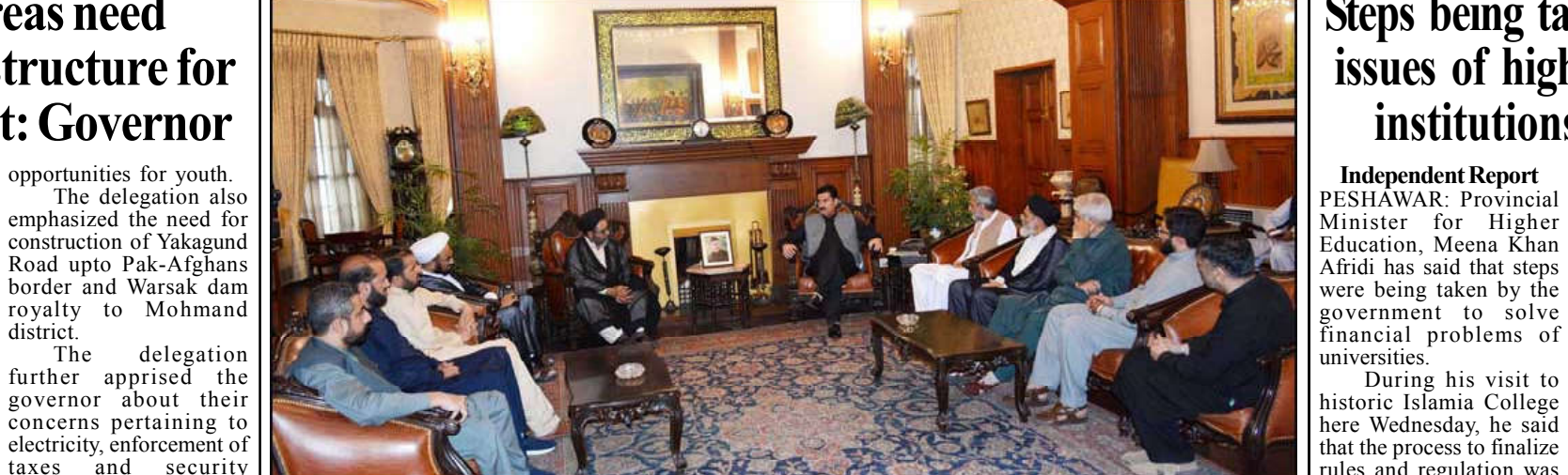
Khyber Pakhtunkhawa Governor Faisal Karim Kundi talking to representatives of Imamia Council Peshawar at Governor House.

The statistics showed besides slow-moving carts that 231 accidents were were involved in the reported in Lahore which accidents.