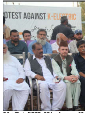
KARACHI: Workers of Mohajir Qaumi Movement participating in the protest demonstration against the worst load-shedding and over-billing of electricity in the port city.

All Divisional Commissioners and Deputy Commissioners participated in the meeting via video link.