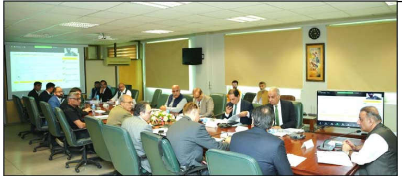
Federal Minister Abdul Aleem Khan presided meeting of Privatization Commission Board.