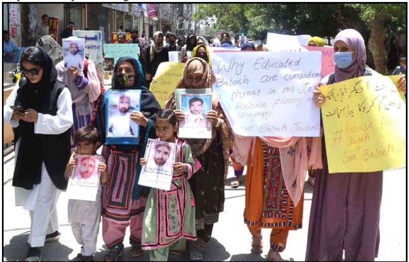
QUETTA: Relatives of missing persons are holding protest demonstration for recovery of their loved one, at Quetta press club.