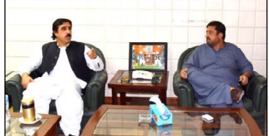
QUETTA: Opposition leader Mir Younis Aziz Zehri meeting with Provincial Food Minister Haji Noor Muhammad Dummer.