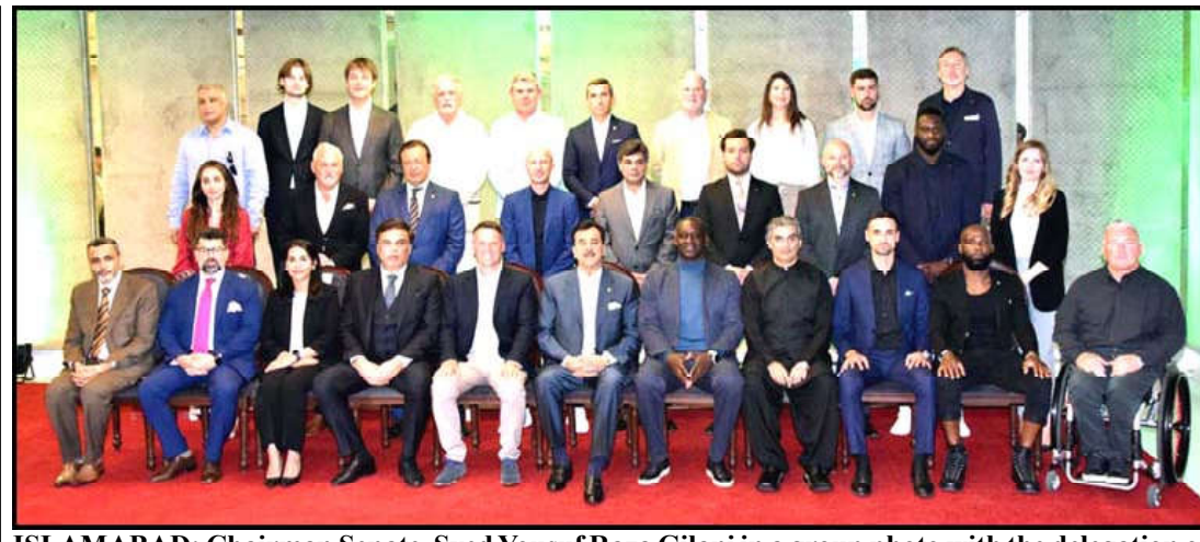
ISLAMABAD: Chairman Senate, Syed Yousuf Raza Gilani in a group photo with the delegation of World Football and Pakistan Football League (UK) at Parliament House.