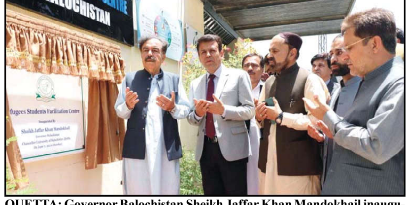
QUETTA: Governor Balochistan Sheikh Jaffar Khan Mandokhail inaugurating new Refugees Students Facilitation Centre during his visit of University of Balochistan.