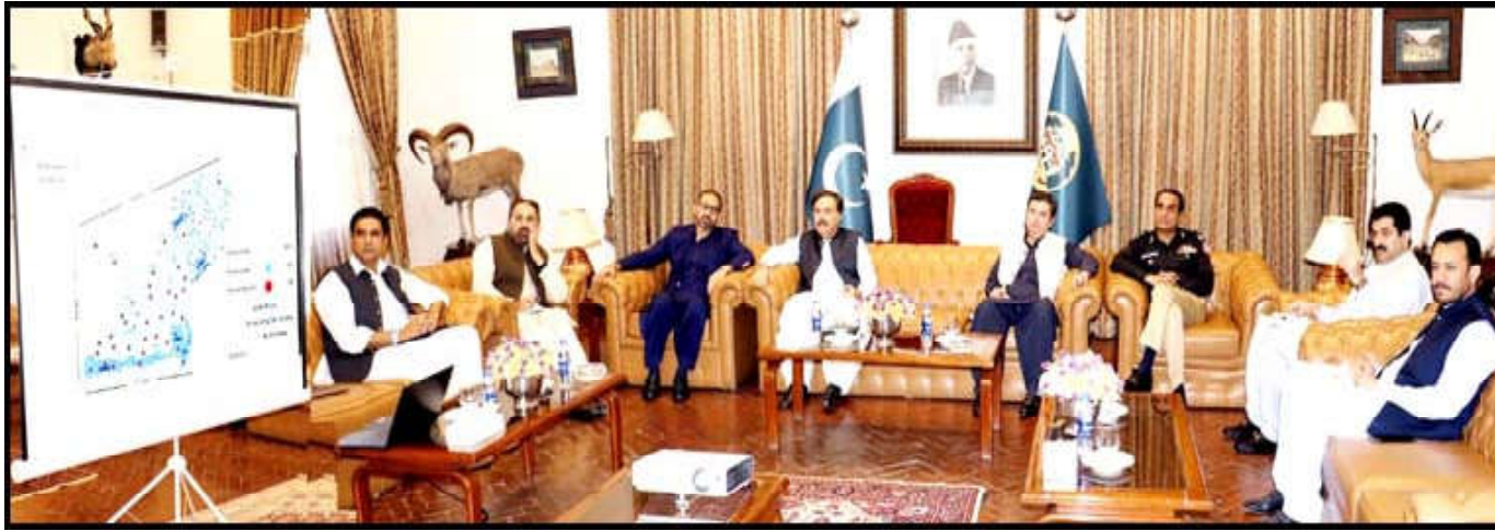
QUETTA: Governor Balochistan Sheikh Jaffar Khan Mandokhail being about law and order situation in the province

Ph: 2841470/2841473 Vol: XIX No. 114, Zeeqad 26, 1445 AH Tuesday June 04, 2024, Pages 04, Price Rs.15