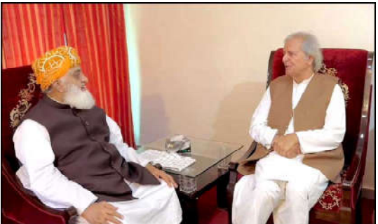
MULTAN: Senior politician Javed Hashmi meeting with Chief of JUI Maulana Fazlur Rehman.

These guides help pilgrims travel through their designated routes, ensuring that they reach their destination without any difficulties. To address any concerns or queries the pilgrims may have, the guides also provide valuable information and support to them.