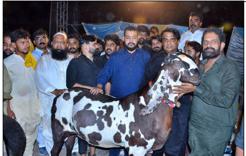
FAISALABAD: Owners proudly display their pets during the competition 26th International camel and Goat contests of beautification, weigh and milk, contest is jointly arranged by the Faculty of Animal Husbandry (FAH), UAF and International Goat and Bull Association at UAF Stadium.