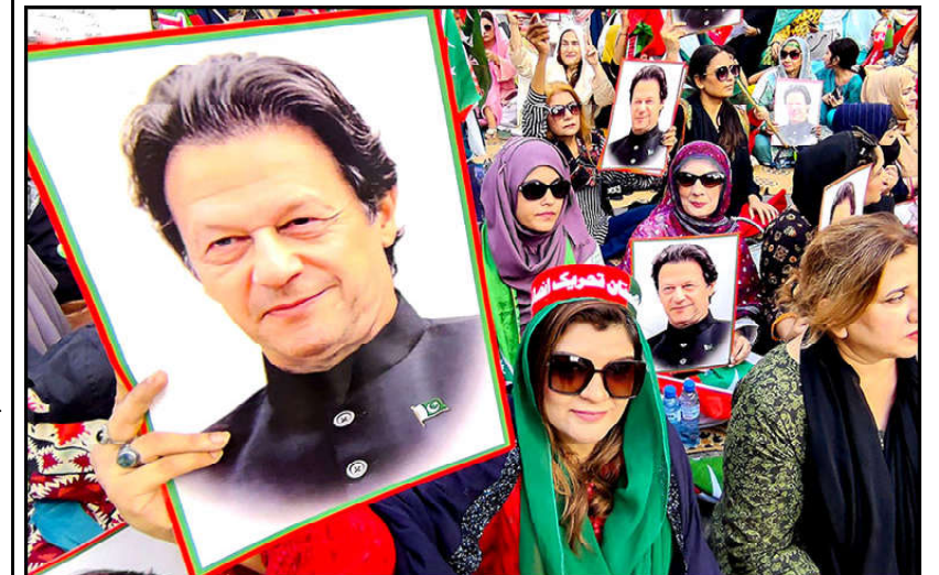
KARACHI: Supporters of PTI hold a protest in favor of their demands in front of Karachi Press Club.

The party has been invited to join the federal as well as Punjab government as an ally.