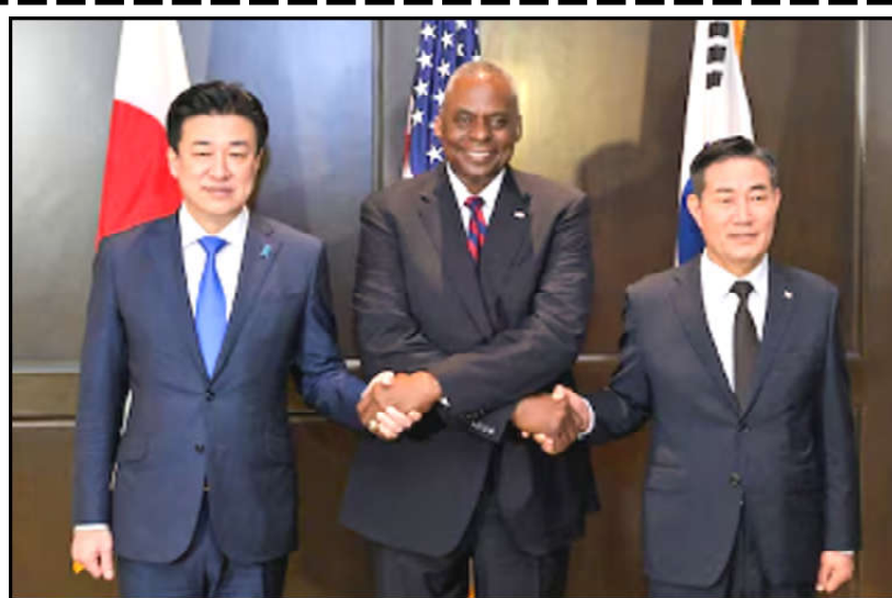
Japanese Defense Minister Minoru Kihara, U.S. Defense Secretary Lloyd Austin and South Korean Defence Minister Shin Won-sik attend a trilateral meeting on sidelines of the Shangri-La Dialogue in Singapore.

Chinese Defense Minister Dong Jun spoke before Zelensky at the Shangri-La conference but he did not appear to be in the room when Zelensky made his appeal.