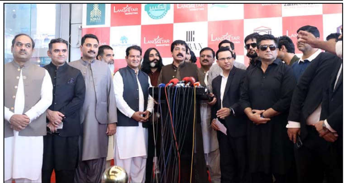
LAHORE: Governor Punjab Sardar Saleem Haider Khan talking to media persons during his visit to Property Exhibition at Expo Centre Lahore.

top quality benchmarks, according to press release issued by the ministry. The minister said that PPD would be developed on modern lines to enhance its efficiency and effectiveness and all resources would be utilized to address staff shortages within the department. "We have a strong commitment to promote merit and transparency