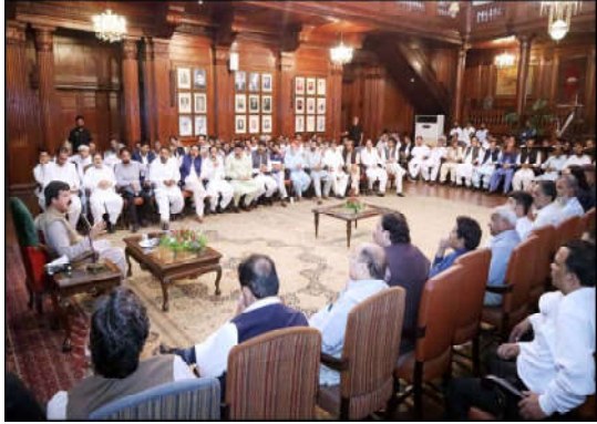
LAHORE: A delegation of Pakistan Peoples Party Lahore Division called on Punjab Governor Sardar Saleem Haider Khan at Governor House.

The CM has directed the concerned authorities to collect the actual data of deserving girls from all the districts and to provide quota in proportion to the population of each district, so that the decision regarding mass marriage program would be implemented in a transparent manner. "We need to have an efficient scrutiny mechanism in order to ensure that only deserving girls would be selected for that programme," he said.