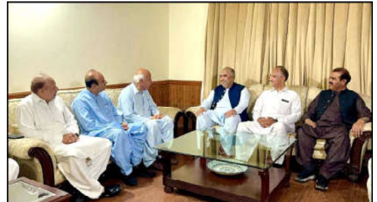
ISLAMABAD: Leadership of Tehreek Tahafuz Aine-Pakistan meeting with President National Party Dr. Abdul Malik Baloch

PM Shehbaz Sharif will also visit Guangdong and Shaanxi provinces. Mao Ning pointed out that China and Pakistan are all-weather strategic partners and "iron-clad" friends. China-Pakistan friendship has been tested by the winds and clouds of the times, and is as solid as a rock and as stable as Mount Taishan, she added.