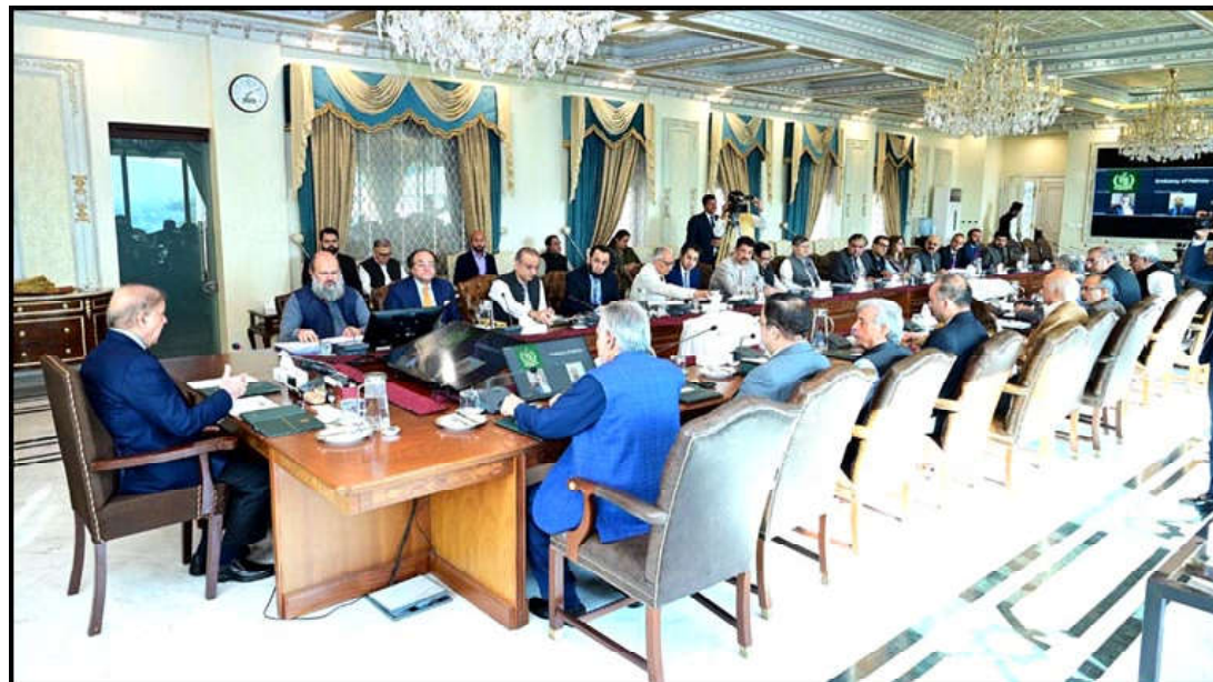
ISLAMABAD: Prime Minister Muhammad Shehbaz Sharif chairs a review meeting on preparation of his upcoming visit to China.