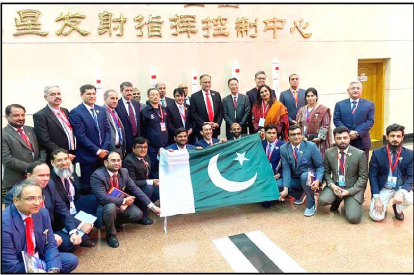
XICHANG: Planning Minister Ahsan Iqbal with Pakistani scientists and engineers at Mission Control Centre in Xichang city on the launch day of PAKSAT-MM1 satellite.