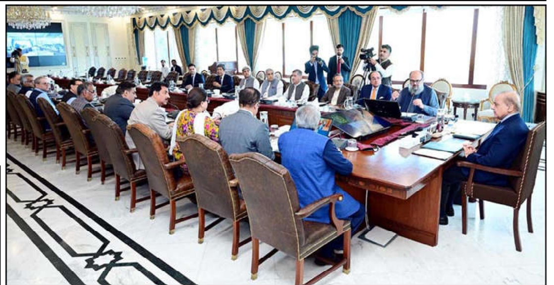
ISLAMABAD: Prime Minister Muhammad Shehbaz Sharif chairs a meeting on Pakistan Single Window Company.