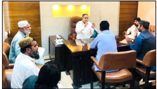
QUETTA: People from different walk of life meeting with Provincial Minister for Communication & Works Mir Saleem Ahmed Khosa at his office

The spokesperson mentioned a symposium held by the foreign ministry in connection with Vesak Day that brought together foreign delegates, including at the ministerial level, prominent Buddhist monks, and scholars on Buddhism and interfaith understanding.