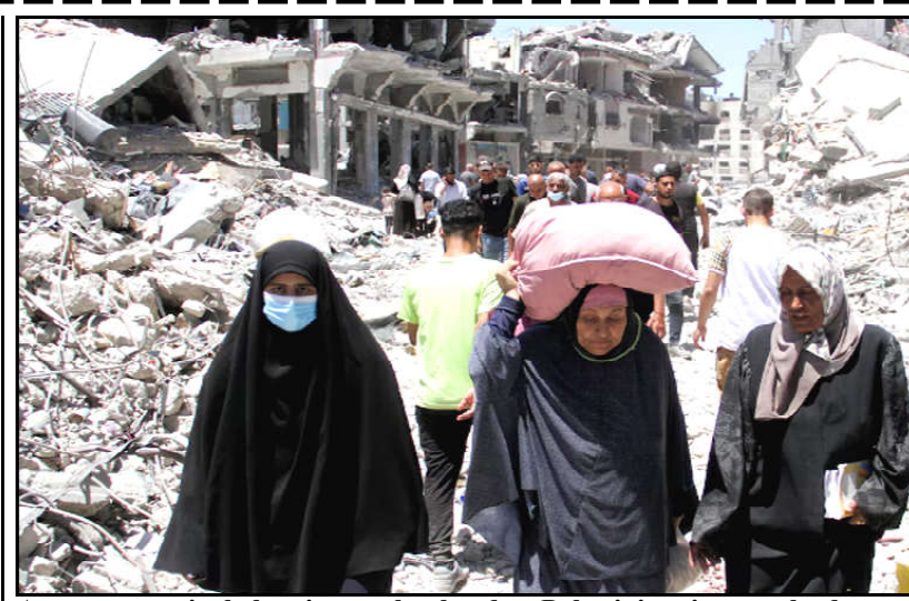
A woman carries belongings on her head, as Palestinians inspect the damage after Israeli forces withdrew from Jabalia refugee camp, following a raid, in the northern Gaza Strip.

300km, and other long-range US weapons for deep strikes inside Russia. The US is the biggest supplier of weapons to Ukraine in its battle against the full-scale invasion launched by Russian President Vladimir Putin in February 2022. Ukrainian President Volodymyr Zelensky said on Friday that Ukraine using any Western weapon to strike Russian territory is "a question of time". "I think that using any weapon, Western kind of weapon, on the territory of Russia is a question of time. Otherwise, it is not about just peace," Zelensky told reporters on a visit to Stockholm. Ukraine has stressed the urgency for the use of Western-supplied arms to conduct strikes inside Russia as it defends against Russian advances in the northeastern Kharkiv region. This spring, Ukraine found itself on the back foot in the 27-month-old full-scale invasion as it faces delays in military aid from the US, increased attacks on its energy infrastructure and Russia's push to expand the frontline.