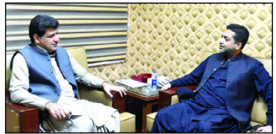
QUETTA: Provincial Minister P&D Mir Zahoore Ahmed Buledi meeting with Home Minister Mir Ziaullah Logo.

Numerous schools have been made functional in the region, providing a conducive learning environment for girls. Moreover, mobile infotainment and education schools are reaching out to remote areas, ensuring that no girl is left behind. To equip women with modern skills, computer labs have been set up at Women's Degree College Miran Shah and Women's Vocational Training Center. This initiative aims to empower women with technological knowledge, enabling them to contribute to the region's development.