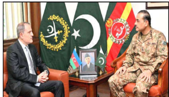
RAWALPINDI: The Foreign Minister of Azerbaijan, Jeyhun Bayramov, called on General Syed Asim Munir, NI (M), Chief of Army Staff (COAS), at the General Headquarters (GHQ).

They urged all segments of the society to cooperate with the health workers for making the anti-polio campaign success.