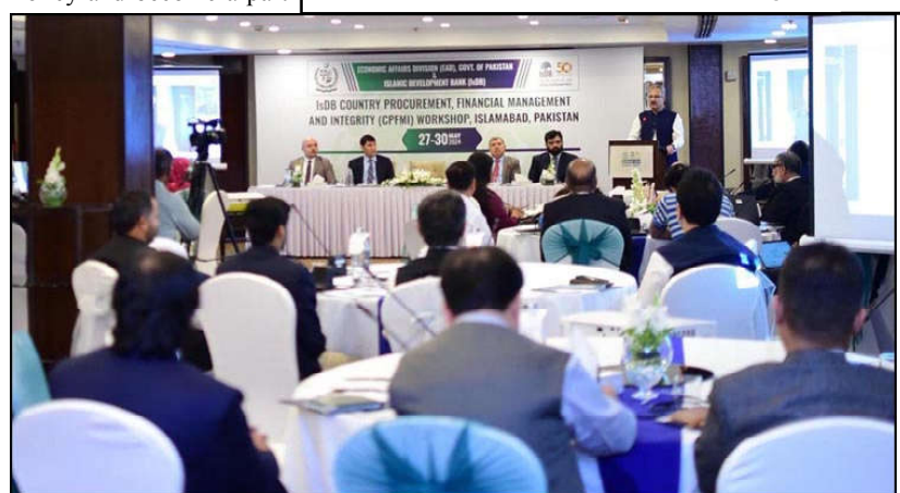
ISLAMABAD: ISDB Organizes Country Procurement, Financial Management and Integrity Workshop in Islamabad.