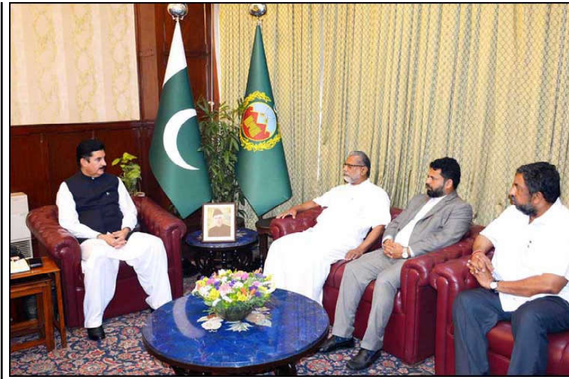
Sri Lanka Minister for Buddhist Affairs, Religious and Cultural Affairs Vidura Wikramanayaka calls on Governor Khyber Pakhtunkhwa Faisal Karim Kundi at Governor House Peshawar.