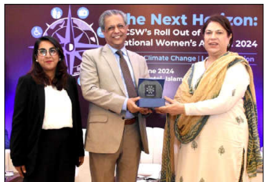
ISLAMABAD: NCSW Chairman Nilofer Bakhtiar Presenting Shield to Minister for Law and Justice and Human Rights Senator Azam Nazeer Tarar.

In building E-Pakistan, the Planning Minister mentioned the framework agreement signed with China's technology giant Huawei during PM's China trip, under which Huawei will provide free training to 200,000 Pakistani youth in the field of information technology.