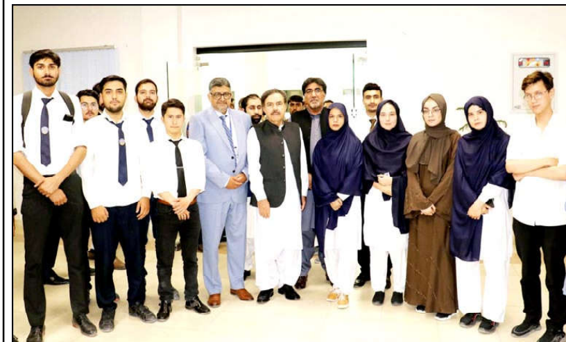
QUETTA: Governor Balochistan Sheikh Jaffar Khan Mandokhail in a group photo with students during his visit to BUIITEMS.

The Governor expressed these views during visit to the Balochistan University of Information Technology, Engineering and Management Sciences (BUIITEMS) here on Thursday.