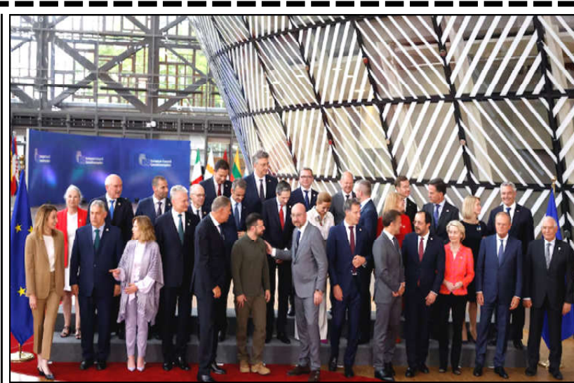
Ukrainian President Volodymyr Zelenskyy and European leaders attend a family photo session, during the European Union leaders' summit in Brussels, Belgium.

ing a Canadian warning from the day before, "urgently requested" its citizens in Lebanon leave the country. "The current heightened tensions in the border area with Israel could escalate further at any time," updated foreign ministry advice in Berlin said. UN humanitarian coordinator Martin Griffiths told reporters in Geneva on Wednesday that Lebanon was "the flashpoint beyond all flashpoints". "It's beyond planning. It's potentially apocalyptic," warned Griffiths, whose term ends this week. A war involving Lebanon "will draw in Syria... it will draw in others", he added. "It's very alarming." Lebanon's national news agency reported about 10 Israeli strikes on areas near the border on Wednesday, including one around 10:00 pm that destroyed a building in Nabatiyeh, wounding five people.