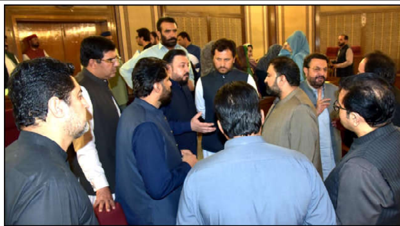
QUETTA: Chief Minister Balochistan Mir Sarfaraz Bugti talking with MPs after Assembly session.

The Khuli Kachehri showcases NAB's determination to combat corruption in all its forms, encouraging the public to continue reporting corruption cases to the National Accountability Bureau. DG NAB stressed to ensure the efforts to eradicate corruption and protect the people of Balochistan from fraud and deceit, leaving no stone unturned in pursuit of justice.