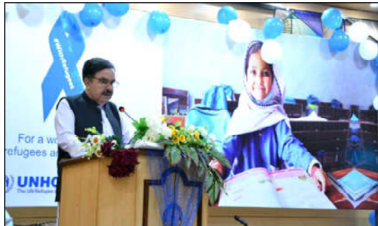
QUETTA: Balochistan Governor, Sheikh Jaffar Khan Mandokhail addresses during ceremony in connection of World Refugee Day organized by United Nations High Commissioner for Refugees (UNHCR) held in Quetta.

The prime minister directed the development of a comprehensive action plan to boost trade efficiency and expand current trade between the two countries. During the meeting, the prime minister was briefed on initiatives aimed at enhancing trade volume, capacity, and trade and investment between Pakistan and Azerbaijan.