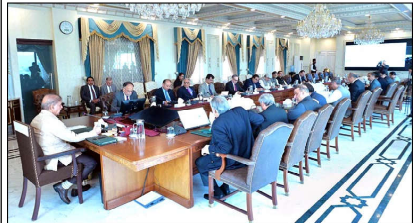
ISLAMABAD: Prime Minister Muhammad Shehbaz Sharif chairs a meeting regarding promotion of Pakistan-Azerbaijan economic ties.

He said that Pakistan believed in constructive dialogue and engagement based on mutual respect and understanding. Such resolutions, he noted, were neither constructive nor objective.