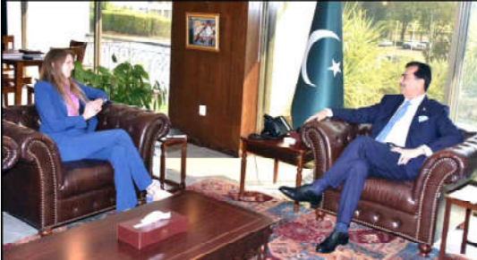
ISLAMABAD: British High Commissioner to Pakistan, Ms. Jane Marriot calling on Chairman Senate, Syed Yousuf Raza Gilani at Parliament House.

hibited an impressive performance, which was applauded by the minister and the participants. The Interior Minister highly commended the quick response of FC troops for support of law enforcement agencies for maintenance of law and order and security whenever it was called for help across the country. He said that every war and battle can be won through unity. "We all are Pakistani and ready to give every sacrifice for its defence and protection" he said. He said that FC would continue to work for the stability, progress and prosperity of Pakistan. Mohsin Naqvi paid glowing tributes to all martyrs of Frontier Constabulary and announced to increase FC martyrs package from Rs three million to Rs10 million.