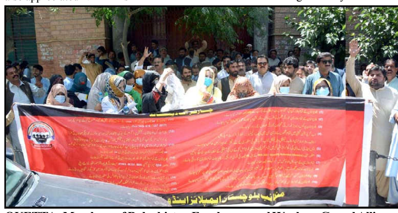
QUETTA: Members of Balochistan Employees and Workers Grand Alliance are holding protest demonstration for acceptance of their demands