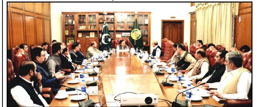
QUETTA: Governor Balochistan Sheikh Jaffar Khan Mandokhail presiding over a meeting regarding performance of Federal departments in the province