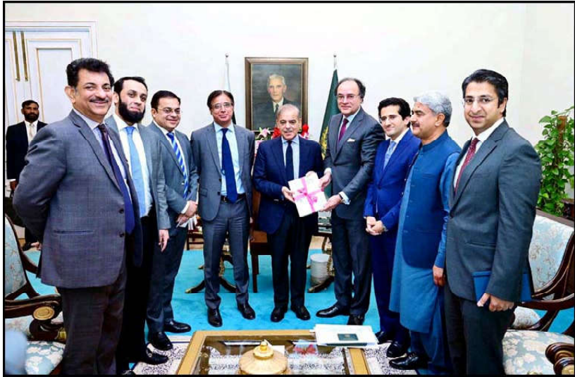
ISLAMABAD: Federal Minister for Finance and Revenue Muhammad Aurangzeb presenting a copy of Economic Survey of Pakistan 2023-2024 to Prime Minister Muhammad Shehbaz Sharif prior to its official launch.

Ph: 2841470/2841473 Vol: XIX No. 347, Zil Hajj 05, 1445 AH Wednesday June 12, 2024, Pages 04, Price Rs.15