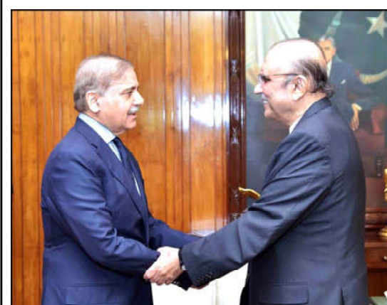
ISLAMABAD: President Asif Ali Zardari welcoming the Prime Minister, Muhammad Shehbaz Sharif, at Aiwan-e-Sadr.

Further investigation was underway to figure out the cause of the incident, it was said.