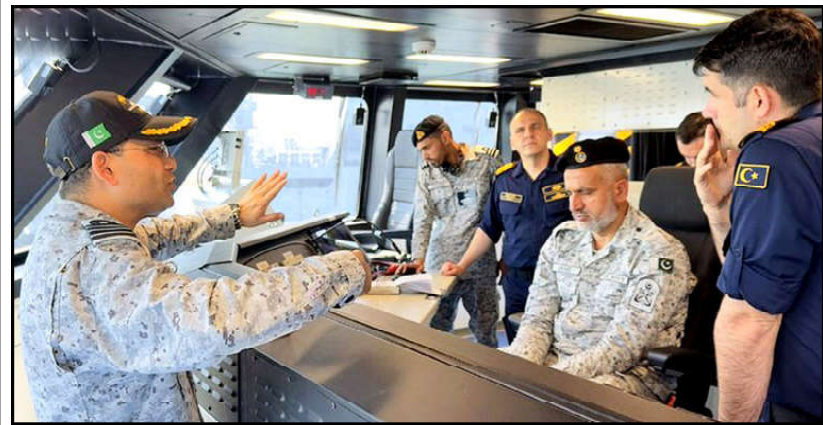
GOLCUK: Officials of Turkish Naval Forces being briefed onboard PNS BABUR at Golcuk Naval Base, Turkey.