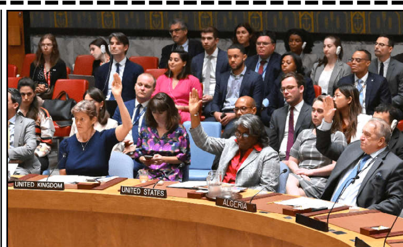
US Ambassador to the United Nations Linda Thomas-Greenfield votes during a UN Security Council meeting on the situation in the Middle East at UN headquarters in New York.

It was not clear what the United States might offer Hamas in exchange, according to the report, which cited two current and two former US officials.