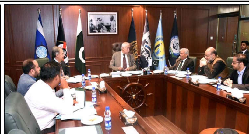
ISLAMABAD: A meeting of the Committee to assess and facilitate the reconstitution of Board of Korangi Fisheries Harbour Authority (KoFHA) held under the Chairmanship of Federal Minister for Maritime Affairs Qaiser Ahmed Sheikh. Federal Minister for Industries & Production Rana Tanveer Hussain also present as member of the committee.

RAWALPINDI (APP): Rawalpindi Cantonment Board announced a 10% tax rebate. Tax bills including property and other taxes have been distributed among the payers by the RCB officials. According to the details, the 10% discount on the payment of T-tax and other taxes can be availed by depositing the taxes by 30 th June 2024.