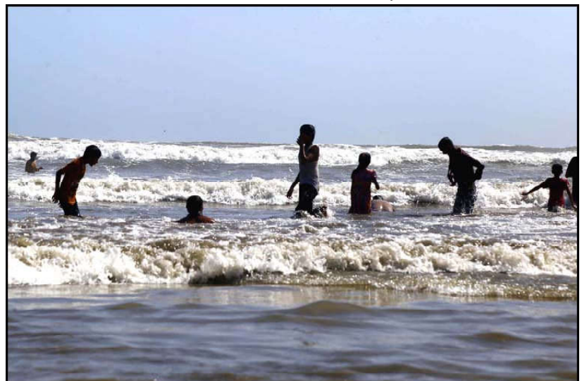
KARACHI: A large number of citizens are enjoying and cooling themselves during the hot weather of summer season, at Sea View Beach in Karachi.

quiring further financial support. Negotiations are underway with the World Bank for loans to achieve this target, particularly for improving health and education outcomes under BISP's conditional cash transfer program. While the BISP expansion brings relief to the poorest, concerns remain for the lower-middle class. This segment, often hit harder by inflation due to a lack of safety nets, might see their struggles worsen due to other IMF conditions. The IMF is pushing for the withdrawal of reduced sales tax rates and elimination of exemptions, potentially leading to widespread price hikes on essential goods. Additionally, limiting electricity subsidies to BISP beneficiaries could further burden lower-middle-class families.