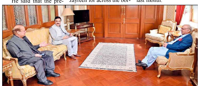
MURREE: Deputy Chairman Senate Saydal Khan meeting with President PML(N) Muhammad Nawaz Sharif.