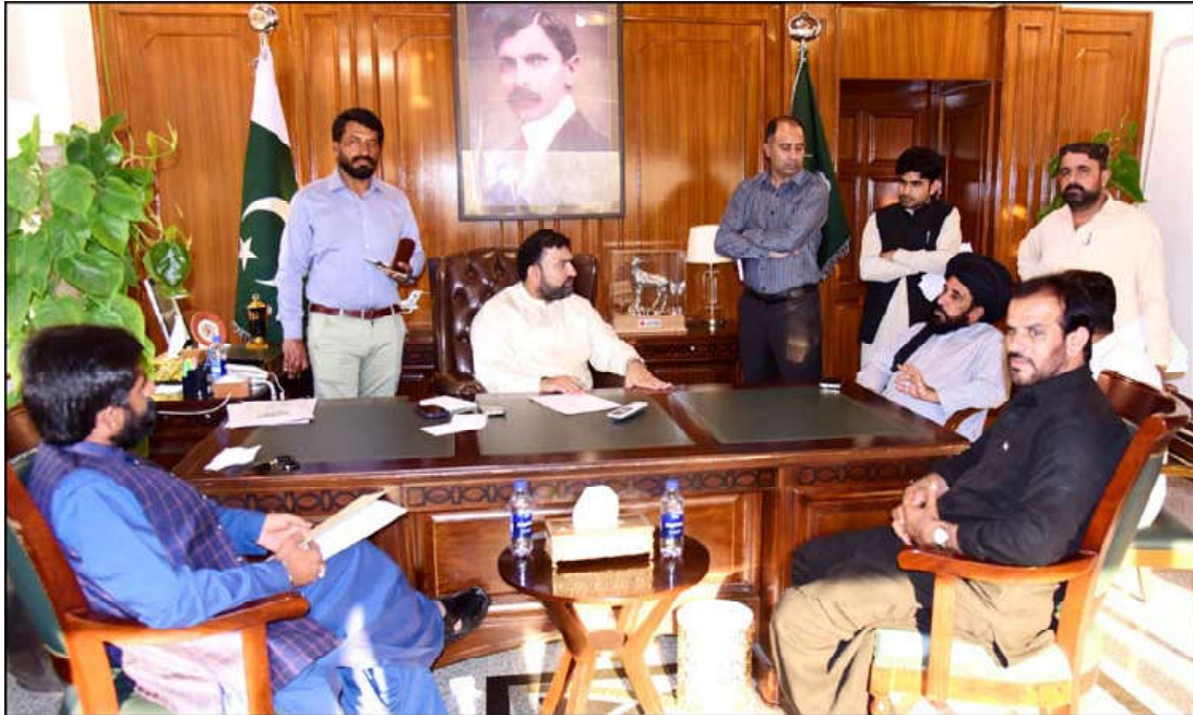
QUETTA: Chief Minister Balochistan Mir Sarfaraz Ahmed Bugti issuing orders after listening the problems of the masses

Ph: 2841470/2841473 Vol: XIX No. 345, Zil Hajj 03, 1445 AH Monday June 10, 2024, Pages 04, Price Rs.15