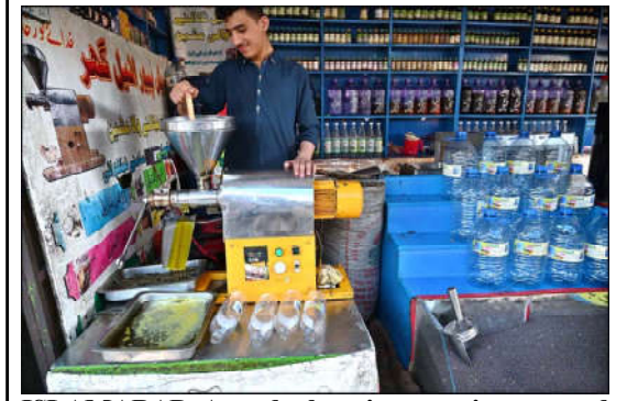
ISLAMABAD: A vendor busy in extracting mustard oil at his stall in weekly Sunday Bazaar, H-9 Sector.

Malik Imran Ahmad country head Campaign for Tobacco-Free Kids (CTFK) said, "Higher taxes on tobacco products can lead to increased revenue for the government. Pakistan currently holds the highest proportion of young people, as 64% of the total population of Pakistan is below the age of 30.