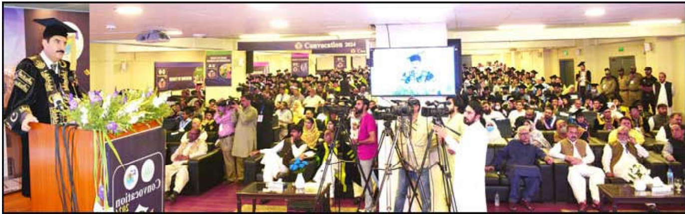
PESHAWAR: Khyber Pakhtunkhwa Governor Faisal Karim Kundi addressing the Annual Convocation of the Allama Iqbal Open University.