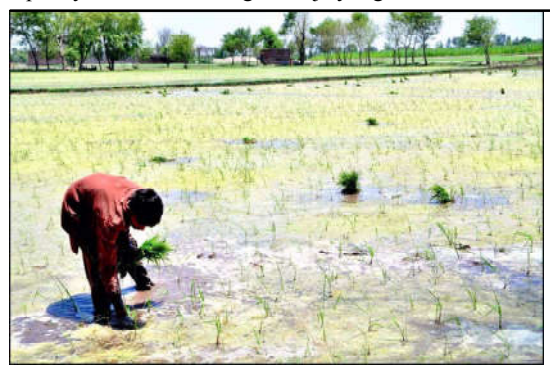
SARGODHA: A farmer busy in planting saplings of rice in his field along Shekan Road.