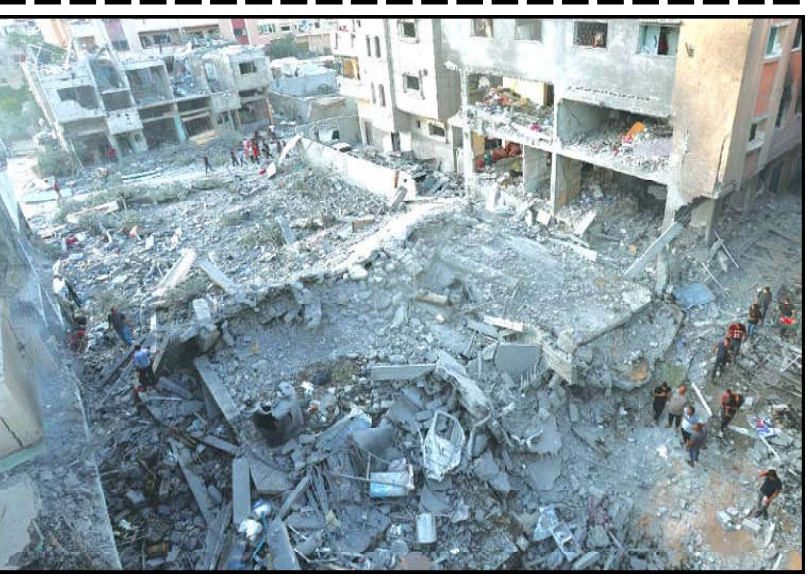
Palestinians inspect a house hit in an Israeli strike in Nuseirat refugee camp, in central Gaza Strip.