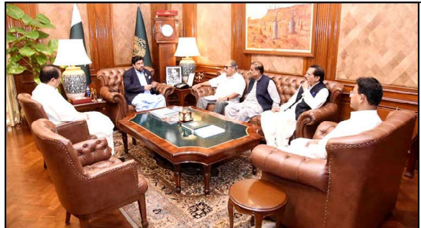
KARACHI: A 5-member delegation of PML(N) led by central senior Vice President Shah Muhammad Shah meeting with Governor Sindh Kamran Khan Tessori.