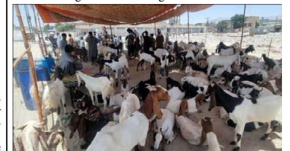
QUETTA: Sacrificial animals wait for their buyers at a makeshift sacrificial animals market established for the upcoming festival Eid-ul-Azha.