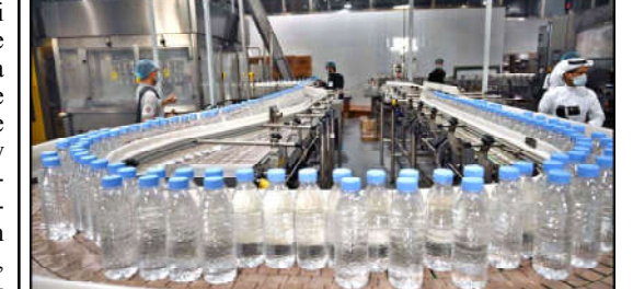
SAUDI ARABIA: Workers busy in packing zamzam water in Zamzama Factory for distributing among the hujjaj at Zaidiah.

Modi, who started as a publicist of the Hindu nationalist Rashtriya Swayamsevak Sangh (RSS), the ideological parent of his Bharatiya Janata Party (BJP), is only the second person after Jawaharlal Nehru to serve a third straight term as prime minister.