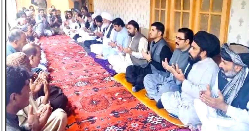
QUETTA: Chief Minister Balochistan Mir Sarfaraz Ahmed Bugti offering Fateha on sad demise of cousin of Provincial Minister Noor Muhammad Dummer

ership long ago", he added. The former Sindh governor said currently he has not decided to join any political party and will make a decision regarding this in the near future. Muhammad Zubair said PML-N deviated from its "Vote Ko Izzat Do" slogan. Earlier, Mohammad Zubair said that PML-N had abandoned the "vote ko izzat do" (respect the vote) narrative days before the PDM government. The former governor said that PML-N started with a confrontational narrative, then turned to reconciliation and now they are running the campaign on the economic narrative.