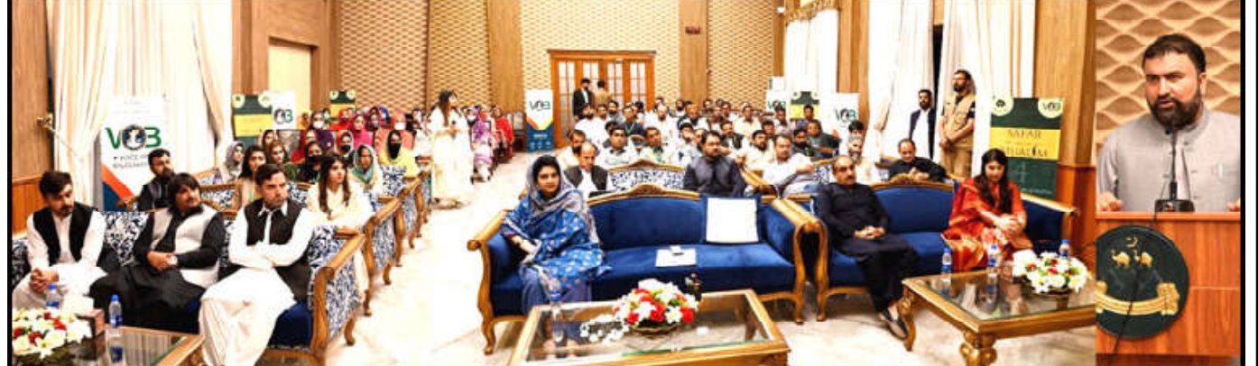
QUETTA: Chief Minister Balochistan Mir Sarfaraz Ahmed Bugti addressing "Safar-e-Mualim" ceremony organized by Voice of Balochistan