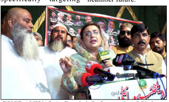
GUJRANWALA: Punjab Information Minister Azma Bukhari talking to media person on the eve of collective marriage ceremony.

Speaking on the occasion Minister for Health KP, Syed Qasim Ali Shah, said the health and nutrition of mothers and children are foundational pillars for the overall development of our society, emphasising the critical role of maternal nutrition in ensuring the well-being of both mothers and children. The minister highlighted the urgency of addressing maternal malnutrition and the essential role of healthcare providers in fostering a healthier future.