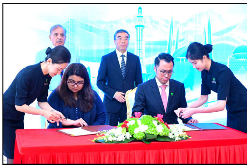
SHENZHEN: Prime Minister Muhammad Shehbaz Sharif witnesses the signing of framework agreement between the Ministry of Information Technology of the Government of Pakistan and Huawei.