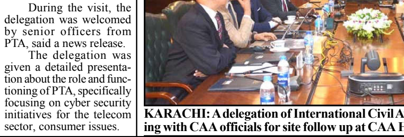
KARACHI: A delegation of International Civil Aviation Organization meeting with CAA officials for site follow up at CAA Headquarters

The delegation was given a detailed presentation about the role and functioning of PTA, specifically focusing on cyber security initiatives for the telecom sector, consumer issues.