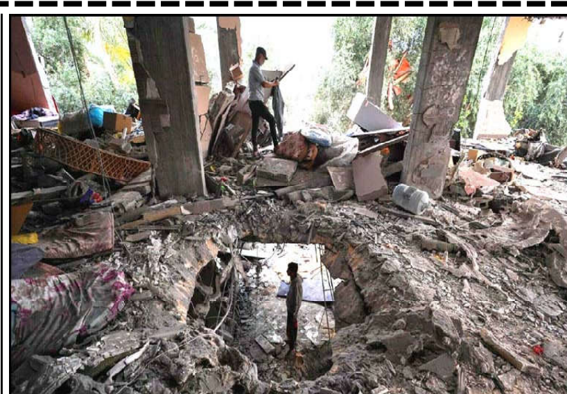
Palestinians inspect the damage to a house after it was hit in an Israeli strike in al-Bureij camp in the central Gaza Strip.

1,200 people and taking more than 250 people hostage, according to Israeli tallies. About 120 hostages remain in Gaza. The Israeli military campaign has killed more than 36,000 people in densely populated Gaza, according to its health authorities, who say thousands more bodies are buried under rubble. Qatar said on Tuesday it had delivered an Israeli ceasefire proposal to Hamas that reflected a three-phase proposal presented on Friday by US President Joe Biden, and that the paper was now much closer to the positions of both sides. Qatar, which has been mediating on Gaza between Israel and Hamas, also stressed that there should be a clear position from both parties to clinch a deal, its foreign ministry spokesperson said in a press briefing.