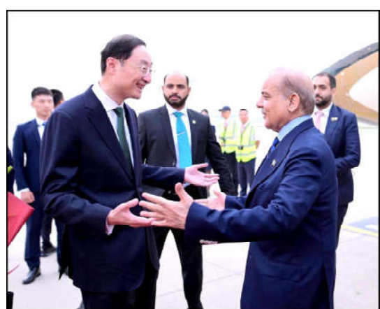
BEIJING: Vice Foreign Minister of People's Republic of China, Sun Weidong receives Prime Minister Muhammad Shehbaz Sharif at Beijing Capital International Airport.

He said that heavy responsibilities rests with the government officers with regard to establish good governance and become voice of the voiceless people of the society.