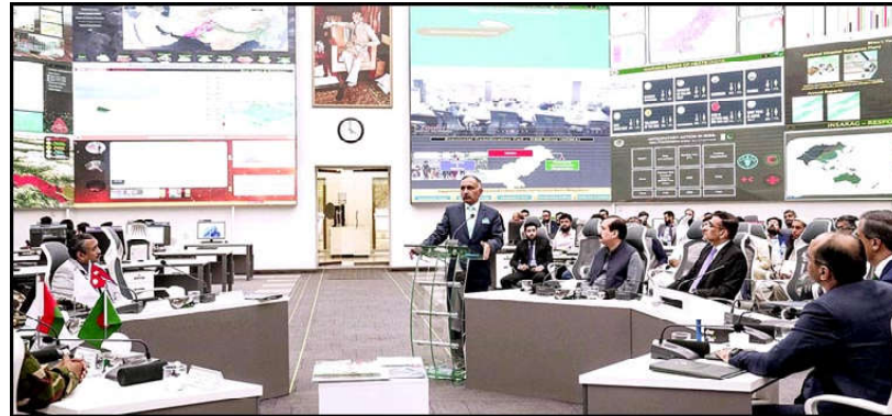
ISLAMABAD: NDMA conducts National Simulation Exercises Focusing on Monsoon Preparedness at NEOC, NDMA HQs.

Referring their problems, the Governor said that he is well aware of their issues just because he has also been part of the Chamber of Commerce and Industry.