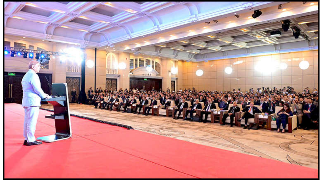
SHENZHEN: Prime Minister Muhammad Shehbaz Sharif addresses Pakistan China Business Conference.

“I will go back to Pakistan with this resolve, come what may, we will follow this model of great economic transformation in Pakistan. This model is enough to copy and simulate if we are sincere to our purpose and