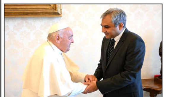
VATICAN: Federal Minister for Interior shaking hands with Pope Francis.

trade gateway for China's business linkages with Pakistan. Reaffirming 'the time-honoured All-Weather Strategic Cooperative Partnership between Pakistan and China', the two sides agreed on the need to explore opportunities for increased cooperation between Pakistan and the Guangdong province particularly under CPEC. Prime Minister Shehbaz and Party Secretary Meng underlined the importance of robust linkages and exchanges between scientists, innovators and businessmen to harness the true potential for enhanced partnership in science and technology, innovation and trade and economic cooperation.