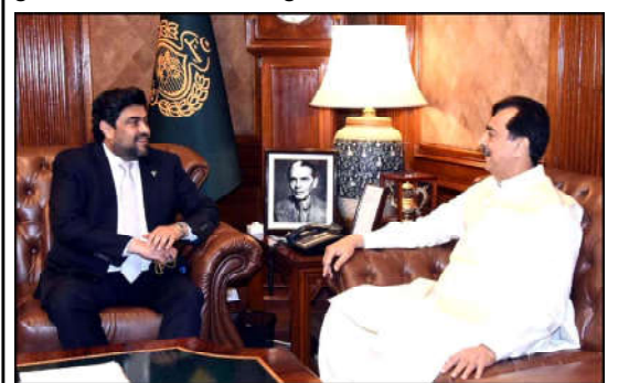
KARACHI: Chairman Senate, Syed Yusuf Raza Gilani exchanging views with Kamran Tessori, Governor of Sindh during meeting held at Governor House in Karachi.

peace in the world." He also stated that the Prime Minister of Pakistan had invited him for a visit and he would try his best to visit Pakistan soon. The Pope expressed concern over the situation in Palestine, stating that it was a cause of huge concern. He added that he stayed updated on the humanitarian situation in Palestine through daily briefings with workers engaged in relief efforts. He emphasized that the interfaith dialogue and harmony was the key to resolve issues. Minister, Mohsin Naqvi thanked him for his effective stance on the Palestine issue, which had been widely appreciated.