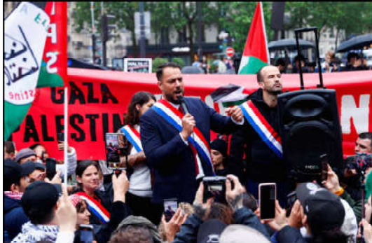
Sebastien Delogu, deputy for La France Insoumise (LFI) party attends a pro-Palestinian protest in central Paris, France.

"This is a pre-condition for lasting peace in Palestine and the entire Middle East beginning with the immediate declaration of a ceasefire in Gaza and no further military incursions into Rafah," they said. "A two-state solution remains the only internationally agreed path to peace and security for both Palestine and Israel and a way out of generational cycles of violence and resentment." Israel's Foreign Ministry did not respond immediately to a request for comment. With their recognition of a Palestinian state, Spain, Ireland and Norway said they sought to accelerate efforts to secure a ceasefire in Israel's war with Hamas in Gaza.