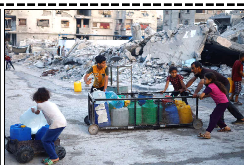
A Palestinian man and children push a cart with water containers, amid the ongoing conflict between Israel and Hamas, in southern Gaza City, in the Gaza Strip.