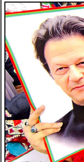
KARACHI: Supporters of PTI hold a protest in favor of their demands in front of Karachi Press Club.

The dacoits had also snatched a motorcycle and cash from the deceased.