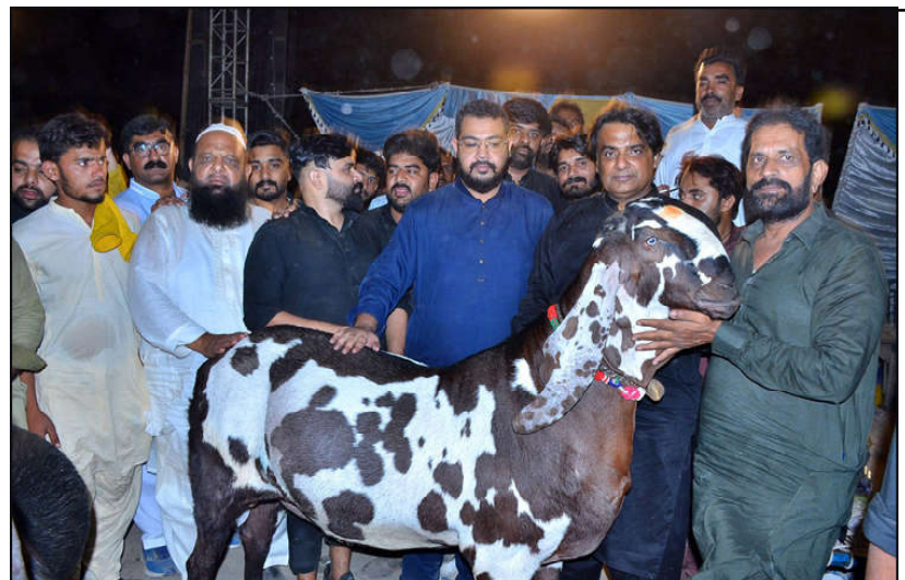
FAISALABAD: Owners proudly display their pets during the competition 26th International camel and Goat contests of beautification, weigh and milk, contest is jointly arranged by the Faculty of Animal Husbandry (FAH), UAF and International Goat and Bull Association at UAF Stadium.