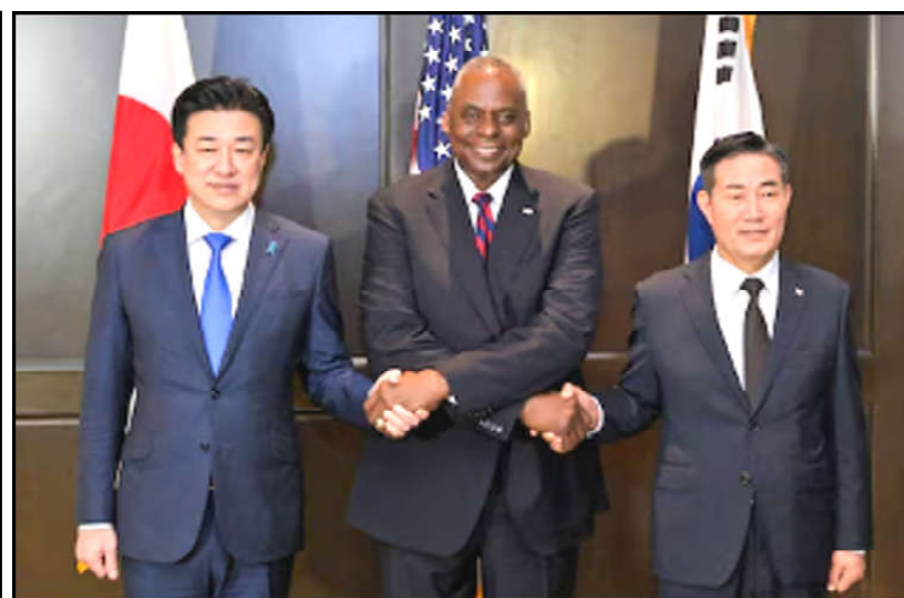
Japanese Defense Minister Minoru Kihara, U.S. Defense Secretary Lloyd Austin and South Korean Defence Minister Shin Won-sik attend a trilateral meeting on sidelines of the Shangri-La Dialogue in Singapore.

expectations of the international community," Mao said. "This makes it difficult for China to participate in the meeting." The foreign ministry did not respond immediately to a request for comment on Zelensky's accusation. The Ukrainian leader said of China's pressure on others, "That is not only support to Russia, that is basically support of war." In a speech to the security conference earlier in the day, Zelensky urged top defense officials to attend the upcoming talks in Switzerland, saying he was disappointed at the failure of some countries to commit to joining. Chinese Defense Minister Dong Jun spoke before Zelensky at the Shangri-La conference but he did not appear to be in the room when Zelensky made his appeal.