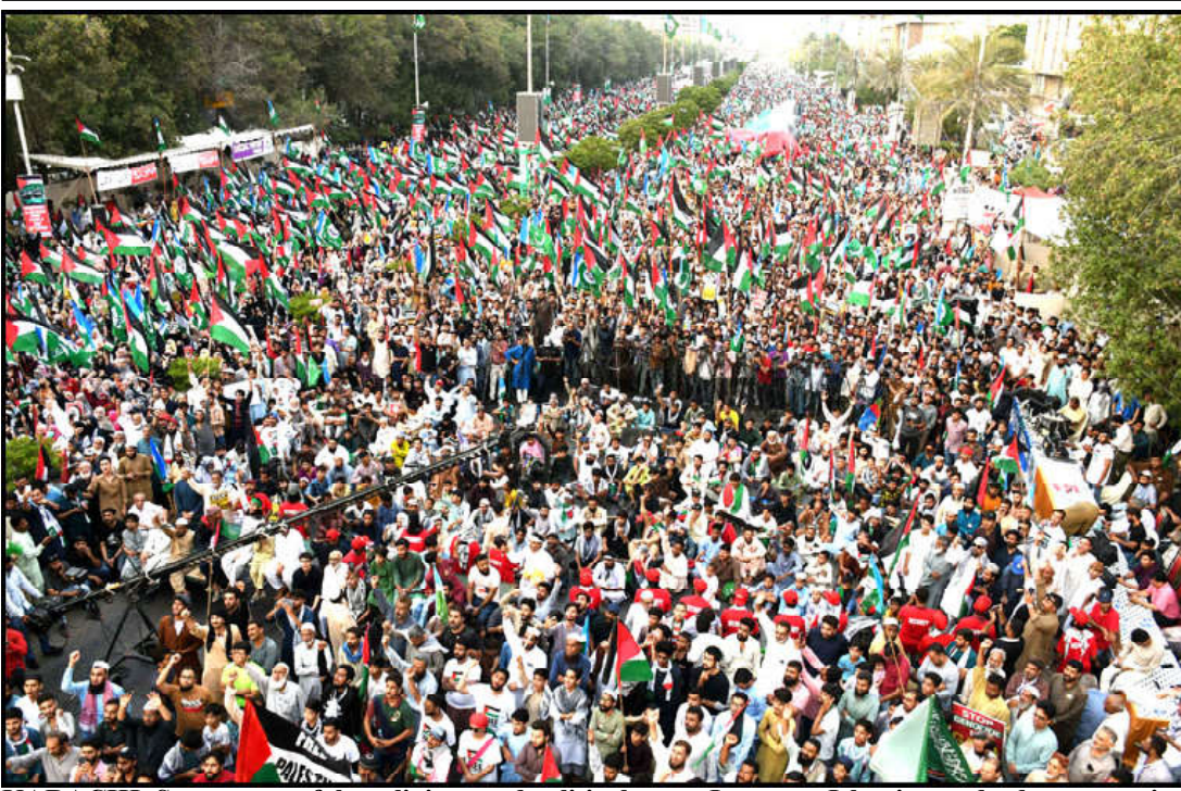
KARACHI: Supporters of the religious and political party Jamaat-e-Islami attend a demonstration against Israeli airstrikes on Gaza, to show solidarity with Palestinian people, in the Provincial Capital.