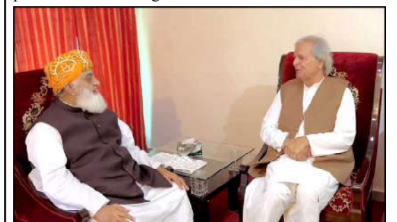
MULTAN: Senior politician Javed Hashmi meeting with Chief of JUI Maulana Fazlur Rehman.

These guides help pilgrims travel through their designated routes, ensuring that they reach their destination without any difficulties. To address any concerns or queries the pilgrims may have, the guides also provide valuable information and support to them.