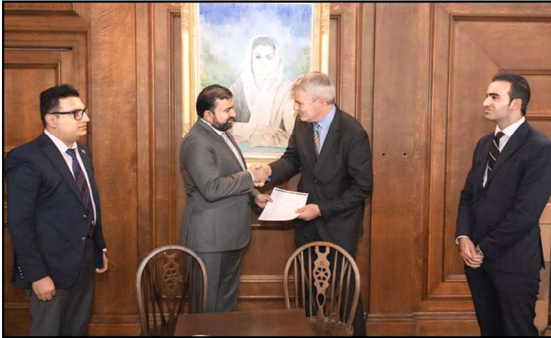
LONDON: Chief Minister Balochistan Mir Sarfaraz Ahmed Bugti and officials of Oxford University exchanging documents of Benazir Bhutto Scholarship Program.

Ph: 2841470/2841473 Vol: XIX No. 339, Zeeqad 25, 1445 AH Monday June 03, 2024, Pages 04, Price Rs.15