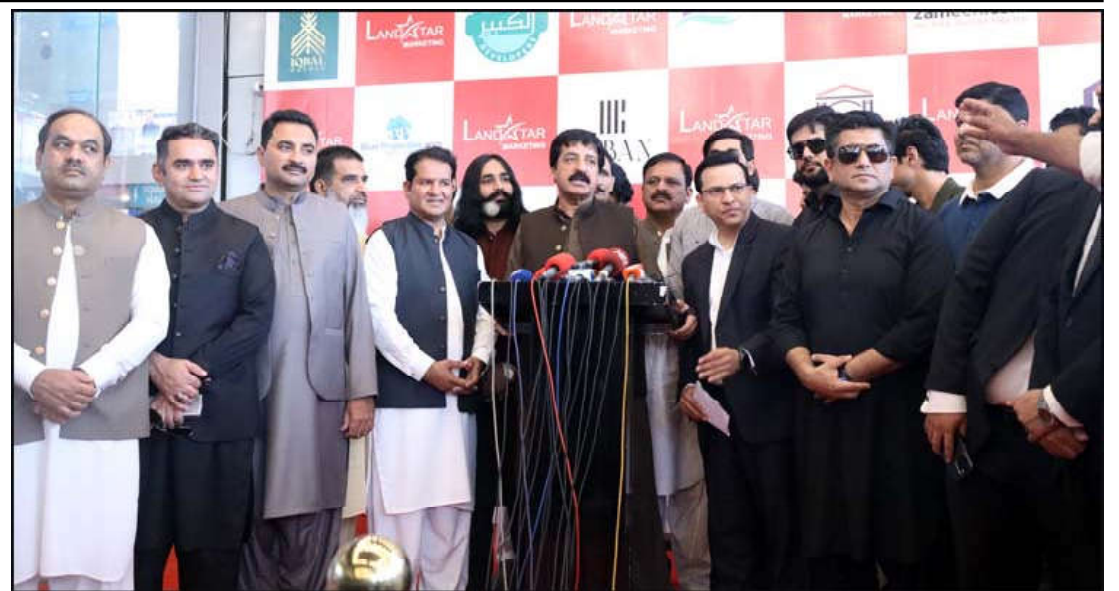
LAHORE: Governor Punjab Sardar Saleem Haider Khan talking to media persons during his visit to Property Exhibition at Expo Centre Lahore.

top quality benchmarks, according to press release issued by the ministry. The minister said that PPD would be developed on modern lines to enhance its efficiency and effectiveness and all resources would be utilized to address staff shortages within the department. "We have a strong commitment to promote merit and transparency