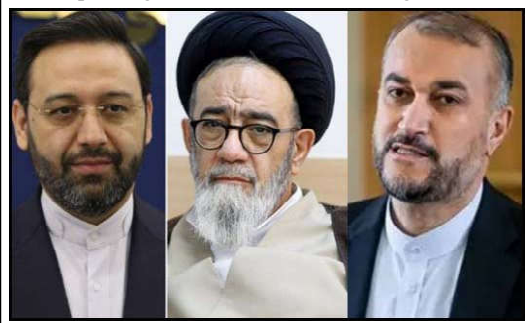
Governor Balochistan calls Iranian ambassador; expresses grief over death of President Raisi, others

ban, which signified that he was a Sayyed - a descendant of the Prophet Muhammad, a status with particular significance among Twelver Shia Muslims. Raisi racked up experience as a prosecutor in multiple jurisdictions before coming to Tehran in 1985. It was in the capital city that, according to human rights organisations, he was part of a committee of judges who oversaw executions of political prisoners. The late president was a long-time member of the Assembly of Experts, the body that is tasked with choosing a replacement for the supreme leader in the event of his death. He became attorney general in 2014 for two years, when he was appointed by Khamenei to lead the Astan Quds Razavi.