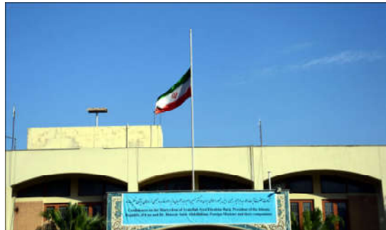
ISLAMABAD: Iranian National Flag flies at half mast at the Iranian Embassy in the Federal Capital, in honour of Iranian president Dr Syed Ebrahim Raisi's death in a helicopter crash.

The Chief Justice ruled that either a special cabinet meeting should have been called or the government committee should have appeared before the court after completing its task.