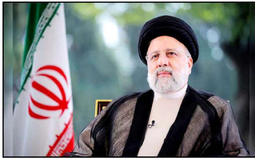
Announces a day of mourning PM visits Iranian Embassy to condole deaths of President Raisi & FM in tragic incident

Who was Ebrahim Raisi? From Qom to Tehran Iranian President Ebrahim Raisi, who represented conservative forces in the country, has died after a helicopter carrying