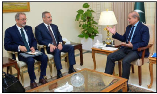
ISLAMABAD: Foreign Minister of Turkey Hakan Fidan calls on Prime Minister Muhammad Shehbaz Sharif.

Admiral Tan Sri Abdul Rahman bin Ayob is a close friend of Pakistan and has played a prominent role in promoting cooperation between the Royal Malaysian Navy and the Pakistan Navy.