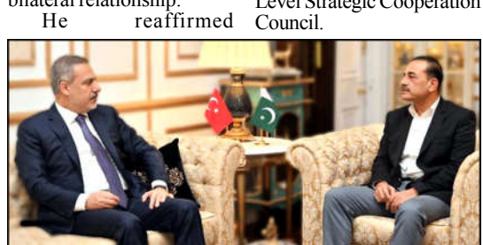
RAWALPINDI: Chief of Army Staff (COAS), General Syed Asim Munir exchanging views with Hakan Fidan, Turkish Foreign Minister during meeting held in Rawalpindi.

While underscoring the special bonds of brotherhood between Pakistan and Türkiye, the prime minister expressed satisfaction over the positive momentum in bilateral relationship. He reaffirmed