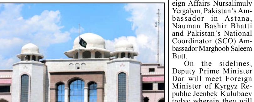
ISLAMABAD: National flag flies half mast at PM office as Prime Minister announce a day of mourning in the country over the death of Iranian President Ebrahim Raisi who died in a helicopter crash.

The government was well aware of the problems of the administration of the National Press Club regarding the improvement of the National Press Club, he re-