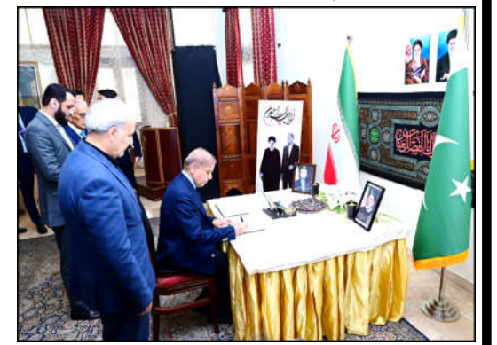
ISLAMABAD: Prime Minister Shehbaz Sharif recording condolence remarks in the visitor's book of the embassy in honor of the Iranian President.

The Governor said that Pakistan and Iran are two brotherly Islamic countries. He paid rich tributes to the late President Raisi for making sincere efforts for strengthening the relations between the two countries further.