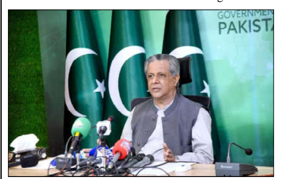
ISLAMABAD: Federal Minister for Law and Justice, Senator Azam Nazeer Tarar addressed an important press conference.