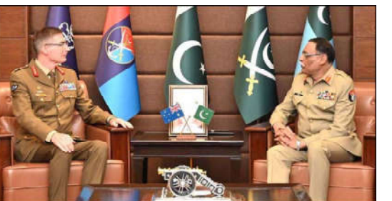
RAWALPINDI: General Angus J. Campbell, Chief of Defence Forces Australia called on General Sahir Shamsah Mirza, Chairman Joint Chiefs of Staff Committee, at Joint Staff Headquarters.

Australian Defence Chief calls on Chairman Joint Chiefs of Staff Committee RAWALPINDI (APP): Relations (ISPR) news release said. Both sides reiterated the resolve to further strengthen and enhance security and defence cooperation between the two countries. The Australian dignitaries remained appreciative of the high professional standards of Pakistan Armed Forces, their achievements in fight against terrorism and continued efforts for regional peace and stability. Earlier upon arrival at Joint Staff Headquarters, General Angus J. Campbell, was presented "Guard of Honour" by a smartly turned-out tri-services contingent.