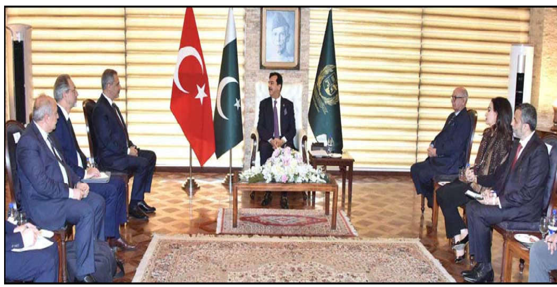
ISLAMABAD: Chairman Senate, Syed Yusuf Raza Gilani in a meeting with Turkish Foreign Minister Hakan Fidan at Parliament House.