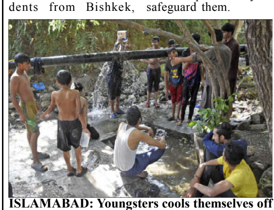
with water at Margalla road on a hot day in the

inquired about their wellbeing. He also inquired about the tragic incident in Bishkek and the challenges faced by the students. He emphasized that Pakistani students in Kyrgyzstan are the nation's children, and it's the government's foremost responsibility to