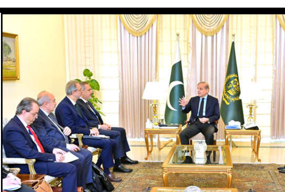
ISLAMABAD: Foreign Minister of Turkiye Hakan Fidan calls on Prime Minister Muhammad Shehbaz Sharif.