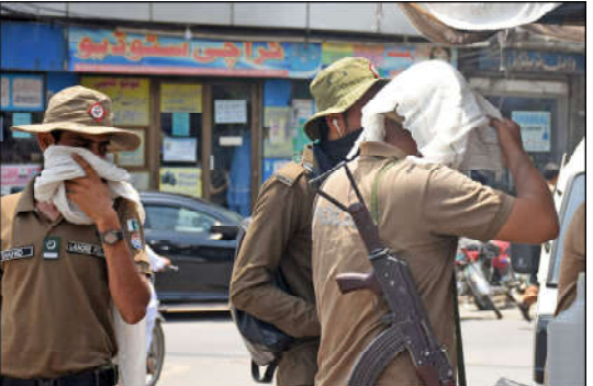
TAHORE: Police personals covered their face with men scarf due to hot weather in the Provincial Capital.