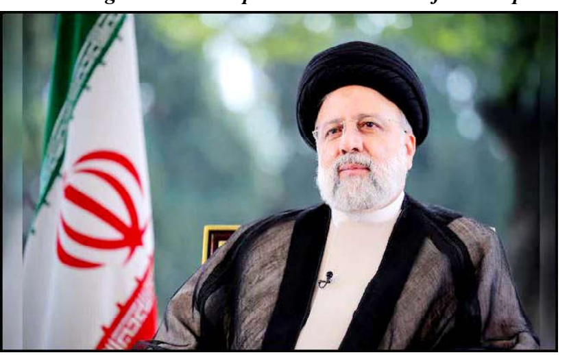
Announces a day of mourning