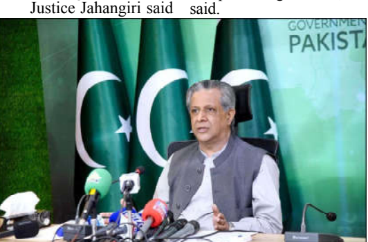
ISLAMABAD: Federal Minister for Law and Justice, Senator Azam Nazeer Tarar addressed an important press conference.

ECP's counsel said that these evidences are recorded in the presence of all the candidates. The original Form 45 is given to the presiding officer, he