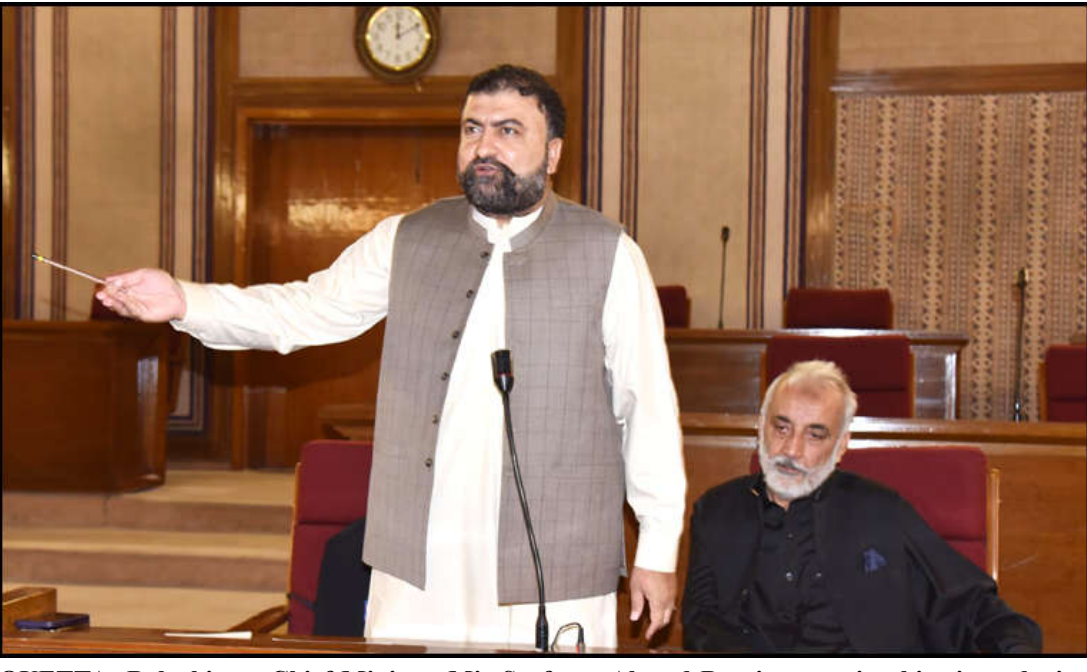
QUETTA: Balochistan Chief Minister Mir Sarfaraz Ahmed Bugti expressing his views during Balochistan Assembly session

He also offered heartfelt condolences to the government of Islamic Republic of Iran and citi-