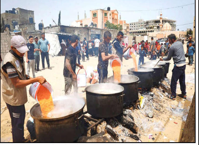
Volunteers prepare food for displaced Palestinians in Rafah, in the southern