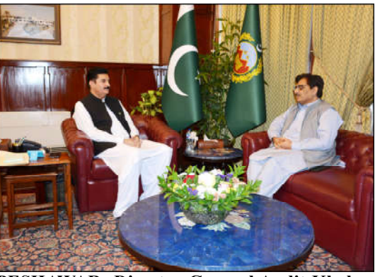
PESHAWAR: Director General Audit Khyber Pakhtunkhwa Siraj ul Haq calls on Governor Khyber Pakhtunkhwa Faisal Karim Kundi at Governor's House.

Pakistan and Sweden could benefit from each other's experiences in the field of technology, she the present government added. The minister said the private sector was being fully supported and facilitated under the vision of Prime Minister Shehbaz