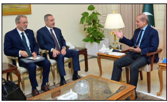
ISLAMABAD: Foreign Minister of Turkiye Hakan Fidan calls on Prime Minister Muhammad Shehbaz

Admiral Tan Śri Abdul Rahman bin Ayob is a close friend of Pakistan and has played a prominent role in promoting cooperation between the Royal Malaysian Navy and the Pakistan