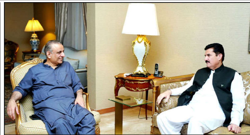
Khyber Pakhtunkhwa Governor Faisal Karim Kundi meeting with Federal Minister for Board of Investment, Privatization and Communication Abdul Aleem Khan in Islamabad.

IDBP for the provision of loans on easy terms to promote industry in the province. He mentioned that from 30 to 32 billion dollars through human resources were official and the same figure amount was unofficial in the shape of foreign exchange. Therefore, he called for launching a special technical training program for human resources of the country. The conference was attended by presidents of all chambers of Pakistan, FPCCI office bearers and association presidents. The SCCI president said that KP was producing 6500 megawatt electricity in which 2700 megawatt was utilized in summer and only 1100 megawatt in winter season, rest of the produced electricity exported to the national grid.