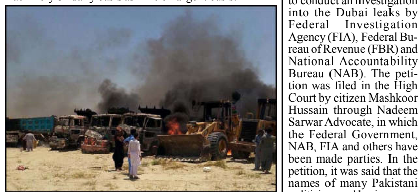
GWADAR: View of huge fire flames rise from burning construction Machinery, due to unidentified armed men set fire to the machinery of a local contractor while local people are busy in exhausting fire.

He said that all possible measures have been taken to provide relief to the public on urgent basis.