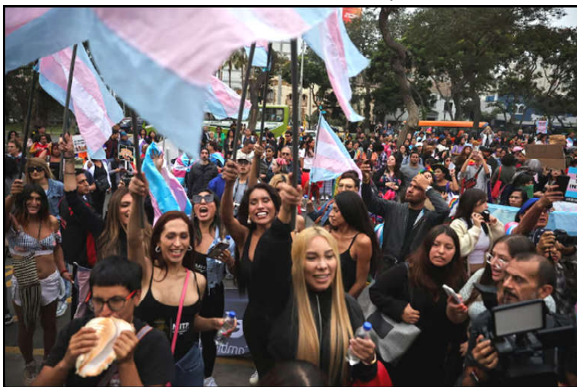
LGBT community groups protest against a new government decree listing transsexualism as a "mental disorder", in front of Peru's Ministry of Health, in Lima, Peru.