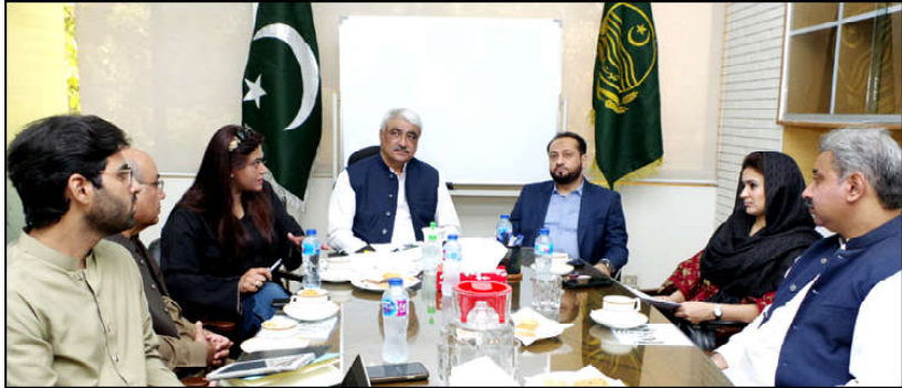
LAHORE: Provincial Ministers Khawaja Salman Rafique and Khawaja Imran Nazeer preside over the meeting of Nutrition Board at PMU.