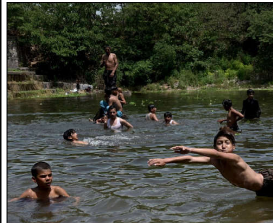
ISLAMABAD: Youngsters enjoy bathing in the pond to get some relief from hot weather in the Federal Capital.

government should take all possible measures to ensure the safety and security of Pakistani students and citizens residing in the Kyrgyz Republic," Foreign Office Spokesperson said in a press statement. The Government of Pakistan takes the matter of the safety and security of its nationals around the world very seriously and would take all necessary measures to ensure their well-being," it was asserted. The Kyrgyz authorities have expressed regret over the incidents of