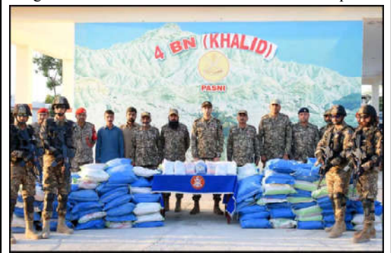
HUB: Pakistan Coast Guard Officials are showing huge apprehended drugs worth millions of rupees, during raid on local area of Pansi and Uthal, during press conference held at PCG Headquarters.

LAHORE (INP): Former interior minister and Advisor to Prime Minister on Political Affairs Rana Sanaulah said on Saturday that Khyber Pakhtunkhwa (KP) Chief Minister Ali Amin Gandapur's bellicose posture was no more than rhetoric and that the provincial government would do what the federal government asked him to do. Talking to the media here, Sanaulah, also a PML-N stalwart, said that the government had no objection to parleys between the PTI and the establishment. "Right from the very start, the PTI has issues with the establishment," he said, adding, "The party wants the latter to stand by it; to intervene in the country's politics." When the PTI was in power, the adviser went on to say, it wanted to crush the opposition. "But when the establishment did not support it, its leaders started calling army generals Mir Jaafar and Mir Sadiq.