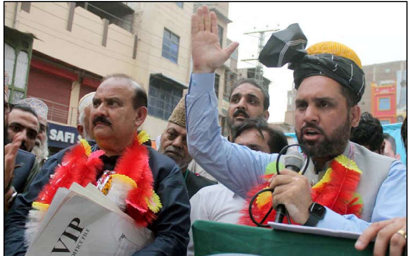
PESHAWAR: Provincial Minister for Higher Education, Meena Khan Afridi addresses to traders of Qissa Khuwani Bazaar during oath taking ceremony held in Peshawar.

exports. With the robust support from Special Investment Facilitation Council (SIFC), Ministry of IT and Pakistan Software Export Board are actively working to boost IT exports, she said. In comparison to previous month of March 2024, ICT services export remittances have increased by US$ 4 million (1.31% growth) in April 2024. ICTI sector exports of US$ 2.593 billion are the highest among all Services (40.25% of total export of services) with 'Other Business Services' trailing at US$ 1.308 billion.