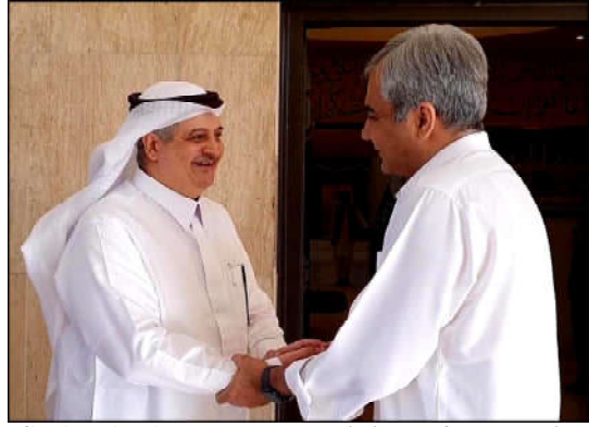
ISLAMABAD: Federal Minister for Interior Mohsin Naqvi met with Ambassador of Saudi Arabia H.E Nawaf Bin Saad Ahmed Al-Maliki