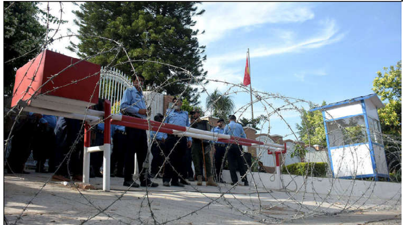
ISLAMABAD: Police officials stand alert at the gate of Kayrgys Embassy during the protest of Islami Jamaat-e-Talaba against the incidents of violence against foreign nationals students including Pakistanis in Bishkek last night.