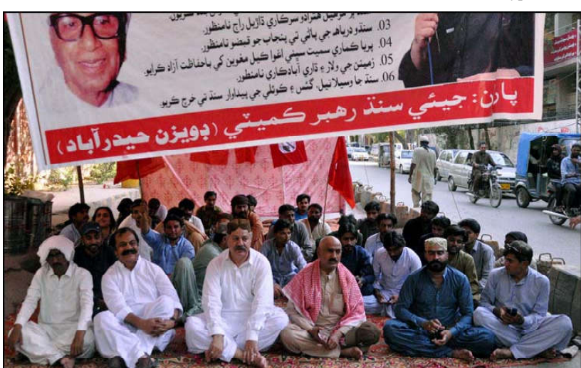
HYDERABAD: Leaders and activists of Jeay Sindh Rahbar Committee are holding protest demonstration for acceptance of their demands, at Hyderabad press club.