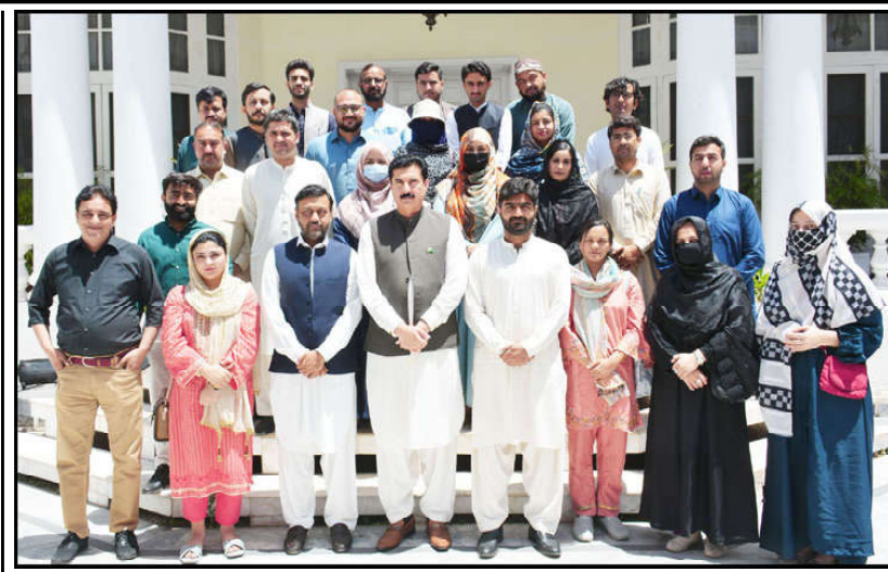
Khyber Pakhtunkhwa Governor Faisal Karim Kundi in a group photo with the representative delegation of media persons belonging to different districts at Governor House, Peshawar.