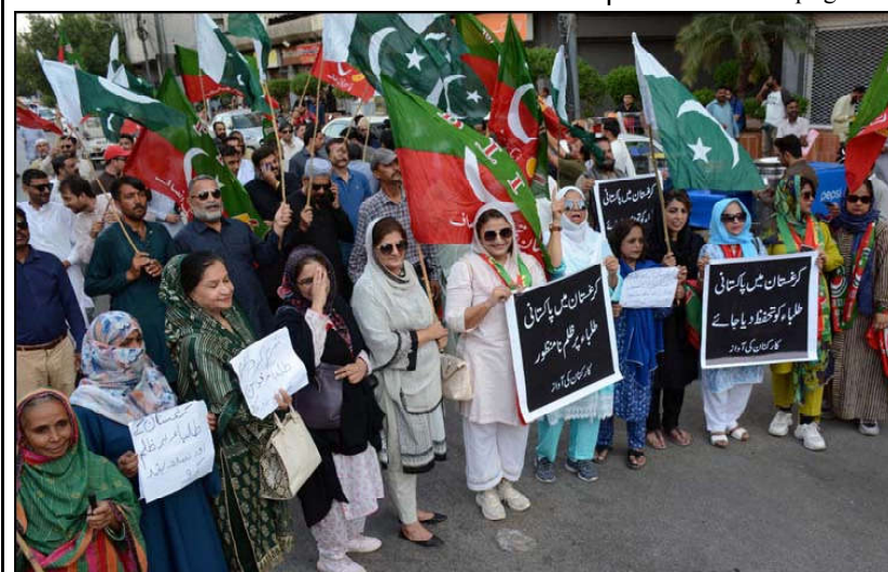
KARACHI: Leaders and activists of Tehreek-e-Insaf (PTI) are holding protest demonstration for demanding to ensure the return of Pakistani students who were trapped in Kyrgyzstan, at Karachi press club.