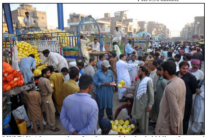
MULTAN: A large number of traders participating in bidding of seasonal fruit Melons at the Fruit market.

added. "We assert with pride that we are among the preeminent national cigarette manufacturing entities, employing a workforce exceeding 400 individuals within the country, and serving as Pakistan's foremost tobacco exporter during the fiscal year 2022-23. These factors significantly bolster our contributions to the national exchequer, in direct contradiction to the assertions made by Ipsos," says KTC.