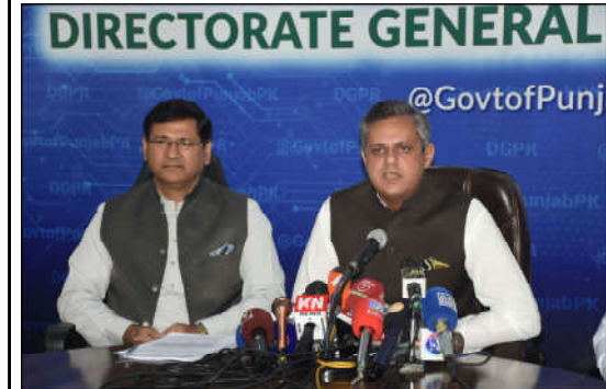
LAHORE: Provincial Transport Minister Bilal Akbar Khan holding a press conference in the DGPR office of the provincial capital.

KARACHI (APP): Sindh Home Minister, Ziaul Hassan Lanjar, has directed the police to prepare a comprehensive security plan for Eid al-Adha 2024, ensuring the safety of life and property of citizens. The plan should include measures to ensure the implementation of the code of conduct for animal sacrifice, security arrangements, and surveillance. The minister directed that all registered welfare and social organisations, religious seminars, and other stakeholders be bound by the code of conduct issued by the Sindh government and that the plan include measures for the collection and transportation of animal hides. Ziaul Hassan Lanjar said that under the Eid al-Adha Security Plan, the Central Police Office's Central Command and Control Center will issue timely orders for implementation at every level, ensuring that suspicious activities are monitored and potential threats are neutralized. Additionally, the plan should include measures for the effective use of zone-wise control rooms and police stations' wireless control rooms. The minister also directed that a list of all the masjid, imambargahs, eidgahs, and open places for Eid prayers be prepared and categorised, and that police personnel, including commandos, be deployed accordingly. The plan should also include detailed responsibilities for SSPs, SPs, SDPOs, and SHOs.