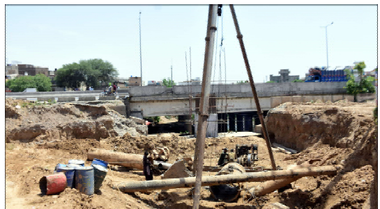
ISLAMABAD: Construction work on a project on Karnal Sher Khan Road is in progress in the Federal Capital, a 5-kilometre road is being constructed from Katarian Bridge on L.J.P Road to Srinagar Highway near the intersection of G-9 and G-10.