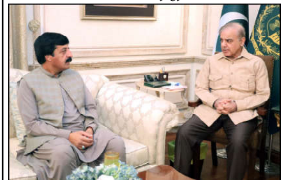
LAHORE: Governor Punjab Sardar Saleem Haider Khan meeting with Prime Minister Muhammad Shahbaz Sharif.