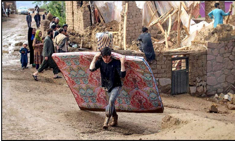
Afghan residents clean debris and salvage their belongings after flash floods in Gho province's Firozkoh.