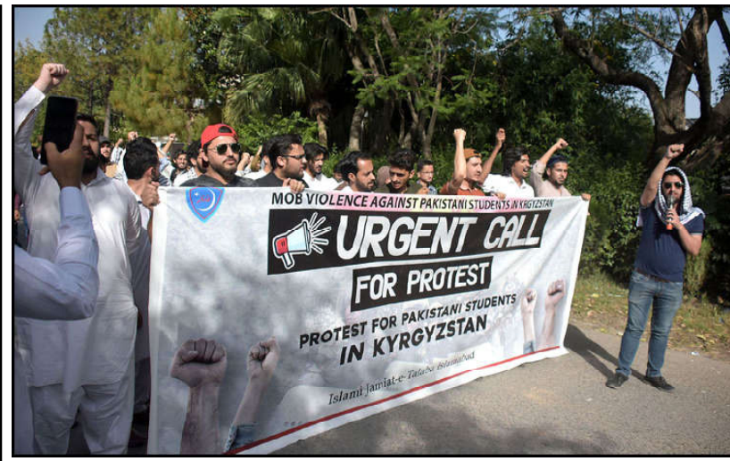
ISLAMABAD: Activists of Islami Jamiat-e-Talaba hold a protest front of Kayrgys Embassy against the incidents of violence against foreign nationals students including Pakistanis in Bishkek last night.

He noted that Xinjiang region is enjoying the best time in its history as all the local ethnic population is moving ahead with sustainable development and prosperity contributing their role in the national rejuvenation. He said that there are more than 24,000 mosques located in China and the Muslim community is practicing Islam as the fundamental beliefs of their religion. The Muslims in China are enjoying the religious freedom that rejects the malicious propaganda campaigns of Western think tanks. DCM noted that the proactive policies to ensure employment and job security adopted by the local government.