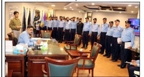
ISLAMABAD (INP): The Speaker of National Assembly Sardar Ayaz Sadiq has imposed a ban on the entry of YouTubers and unauthorized people into Parliament House.

elevate their morale by prioritizing resolutions based on their well-being.