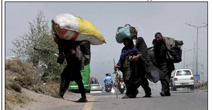
ISLAMABAD: Gypsy family on the way carrying their luggage near expressway in the Federal Capital.

awe-inspiring beauty and often hailed as a paradise for tourists, Gilgit-Baltistan has long captivated the hearts of travelers. However, despite its allure, several scenic spots have remained relatively unexplored due to inadequate infrastructure. The SIFC's endeavor to upgrade tourist facilities is poised to unveil these hidden gems, promising tourists unparalleled amenities and improved accessibility. This strategic move is expected to catalyze growth within the local tourism industry, stimulating economic development and creating new opportunities.