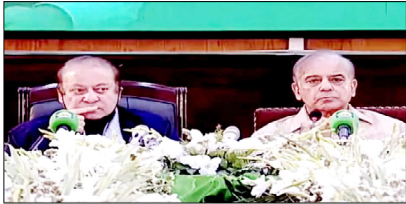
LAHORE: Quaid PML (N) Muhammad Nawaz Sharif and PML-N acting President and Prime Minister Muhammad Shahbaz Sharif attending meeting of Central Working Committee