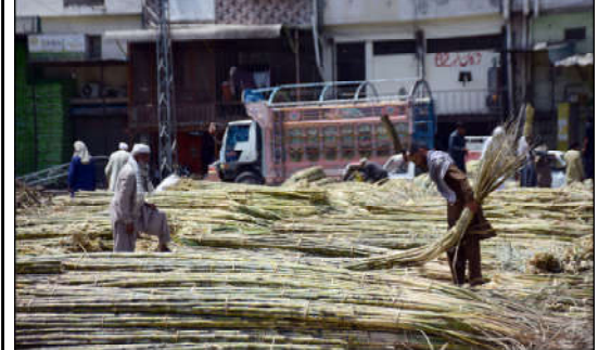
ISLAMABAD: Workers unloading sugarcane at Fruit and Vegetable Market, Sector I-II in the Federal Capital.

BAHAWALPUR (APP): Lemon has gone out of reach for the poor after its price jumped from Rs 800 to Rs 1,000 per kilogram in Bahawalpur. APP learned on Saturday that lemon, which was being sold out at Rs 200 to 250 per kilogram last month in April 2024, has now gone out of reach of poor people. Its price has jumped to Rs 800 to 1,000 per kilogram in the local market of Bahawalpur. "Due to very hot weather, demand for lemon has increased as people used to make Shikanjeen (lemonade juice)."