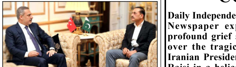
RAWALPINDI: Chief of Army Staff (COAS), General Syed Asim Munir exchanging views with Hakan Fidan, Turkish Foreign Minister during meeting held in Rawalpindi.

Pakistan's firm commitment to further expansion of bilateral cooperation, in all areas of mutual interest, including trade, investment, technology and defence. Regional and global developments, particularly the worsening humanitarian situation in Gaza were also discussed in the meeting. Prime Minister Shehbaz appreciated President Recep Tayyip Erdogan's staunch advocacy for a permanent ceasefire in Gaza and lasting peace in the Middle East. He stressed the urgency and importance of the realization of the two-state solution as the key to attainment of durable peace in the Middle East. The prime minister also reiterated his invitation to President Erdogan to undertake an early official visit to Pakistan for co-chairing with him the 7th meeting of High Level Strategic Cooperation Council.