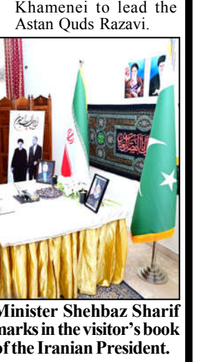
ISLAMABAD: Prime Minister Shehbaz Sharif recording condolence remarks in the visitor's book of the embassy in honor of the Iranian President.