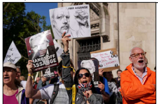
People attend a protest outside the High Court on the day of an extradition hearing of WikiLeaks founder Julian Assange, in London, Britain.

Putin-Mokhber call. State news agency RIA quoted Sergei Shoigu, secretary of Russia's Security Council, as saying Moscow could assist Iran in its investigation of the crash. Since the state of the war in Ukraine, Russia has moved to strengthen its political, trade and military ties with Iran in a deepening relationship that the United States and Israel view with concern. In January, Russia's Foreign Ministry said a new interstate treaty reflecting the "unprecedented upswing" in Russian-Iran ties was in the final stages of being agreed, and Putin and Raisi were expected to sign it soon. Putin held five hours of talks with Raisi in the Kremlin in December and had spoken to him by phone in March and April, according to the Kremlin website.