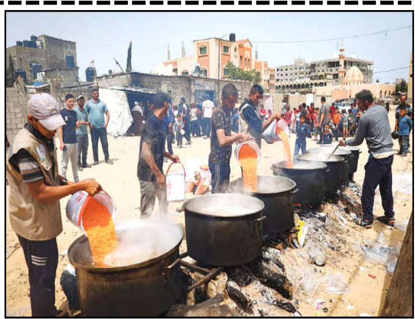
Volunteers prepare food for displaced Palestinians in Rafah, in the southern Gaza Strip.

Since then, "we have again about half of the population of Gaza being on the road forced to flee" for safety once more, though "we keep saying there is absolutely nowhere to go." UNRWA chief Philippe Lazzarini told reporters in Amman. Warning of famine in the besieged territory, UN's humanitarian chief Martin Griffiths said on Sunday the stranglehold on aid reaching Gaza threatens an "apocalyptic" outcome.