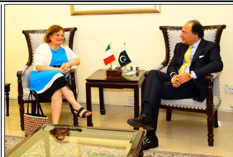
Italian Ambassador Marilina Armellini met with Finance Minister Muhammad Aurangzeb in Islamabad.

transformed economies around the world and led nations to prosperity. "Our success lies in the positive impact on economic growth and sustainability, and the society," he remarked. Rana Tanveer Hussain said that all possible resources were being utilized to increase exports of agriculture and industrial sectors. Increased industrial production leads to more foreign exchange income of a country. The development of a country is hinged on industrial development, he said and vowed to develop this vital sector by taking measures to attract foreign investments and increase export capacity.