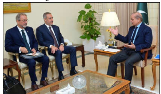
ISLAMABAD: Foreign Minister of Türkiye Hakan Fidan calls on Prime Minister Muhammad Shehbaz Sharif.