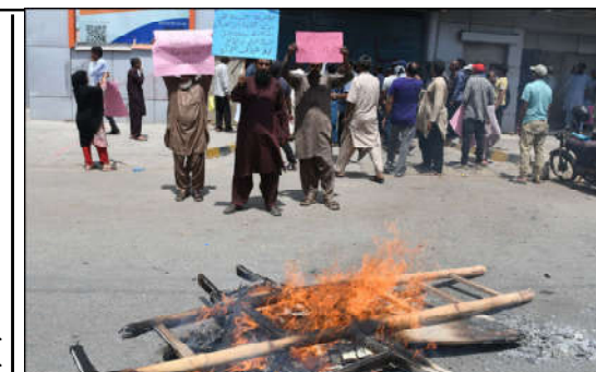
KARACHI: Residents of Jehangir Road, Jamshed Road, Martin Quarter are protesting outside the office of K Electric at Tipu Sultan.

The CM extended his condolences to the bereaved families and the Iranian people over the precious loss of lives in the crash and prayed for their comfort and patience in this difficult time.