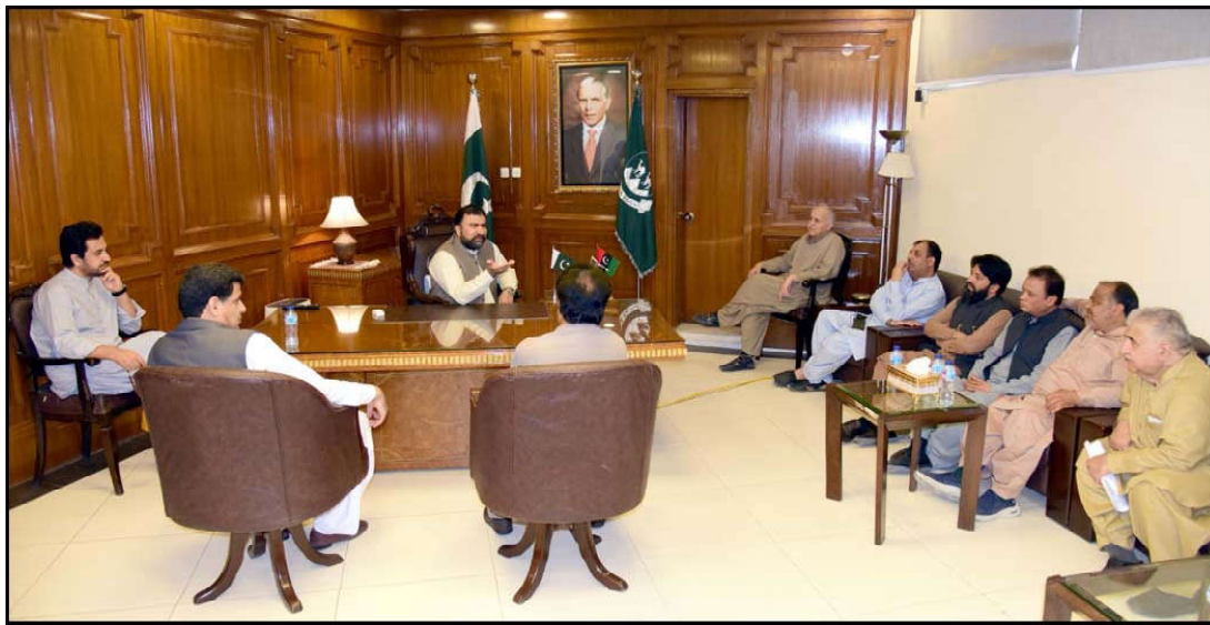
QUETTA: Balochistan Chief Minister Mir Sarfaraz Ahmed Bugti talking with a delegation of Quetta Press Club and Balochistan Union of Journalists.

He said political parties used to form before elections to achieve specific targets. "We talk about people's problems, political parties have adopted the route to win power," he said.