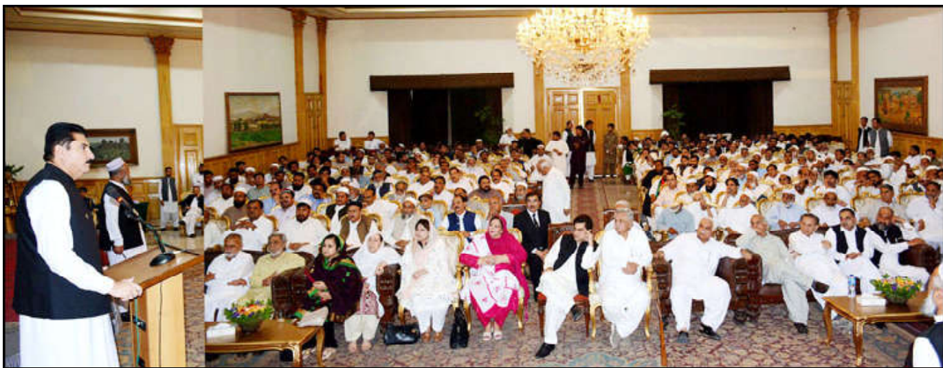
Governor Khyber Pakhtunkhwa Faisal Karim Kundi addresses to Peshawar Division representatives delegation at Governor's House, Peshawar.