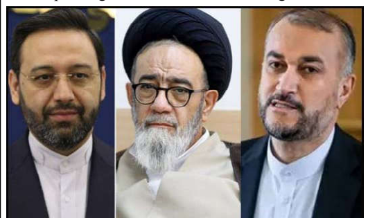
Governor Balochistan calls Iranian ambassador; expresses grief over death of President Raisi, others

TEHRAN (INP): Iranian President Ebrahim Raisi and the country's Foreign Minister Hossein Amirabdollahian have died in a helicopter crash, the country's Mehr news agency said on Monday. A senior Iranian official, requesting anonymity following the sensitivity of the development, told a foreign news agency: "President Raisi, the foreign minister and all the passengers in the helicopter were killed in the crash."