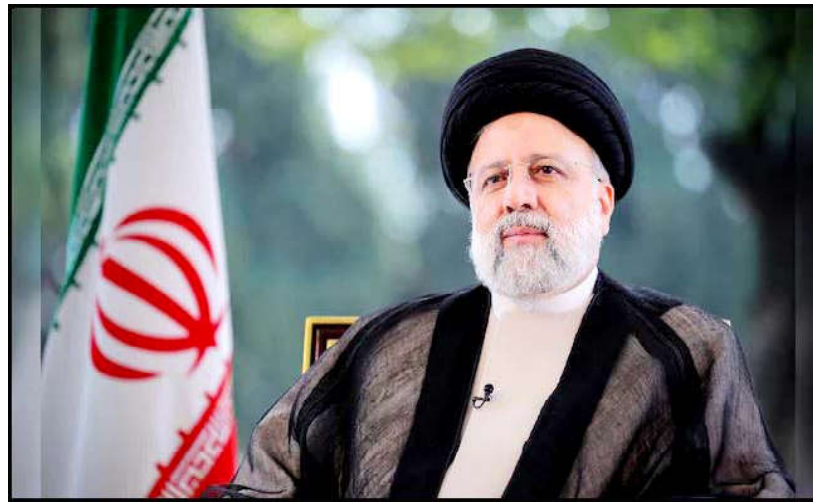
Announces a day of mourning PM visits Iranian Embassy to condole deaths of President Raisi & FM in tragic incident

Who was Ebrahim Raisi? From Qom to Tehran Iranian President Ebrahim Raisi, who represented conservative forces in the country, had died after a helicopter carrying