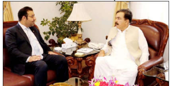
QUETTA: Honorary Consul General Germany Murad Baloch meeting with Governor Balochistan Sheikh Jaffar Khan Mandokhail.

During the proceedings, the advocate general Punjab informed the court that a government committee had consulted with Punjab Chief Minister on the matter of judges' appointment, assuring that it had been prioritized for the upcoming cabinet session.