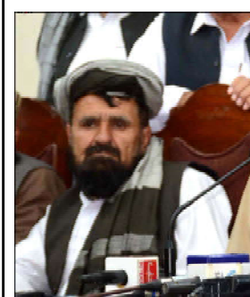
QUETTA: Former Provincial Minister Sardar Yahya Khan addressing a press conference about resignation from JUI

Heavy rains had prompted the closure of the highway at these junctures, causing significant inconvenience to commuters.