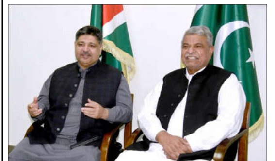
LAHORE: Former Federal Minister Rana Nazir Ahmad and Shoaib Siddiqui addressing press conference at the Istehkam-e- Pakistan Party office.

He said that all possible measures should be continued for the welfare of the force.