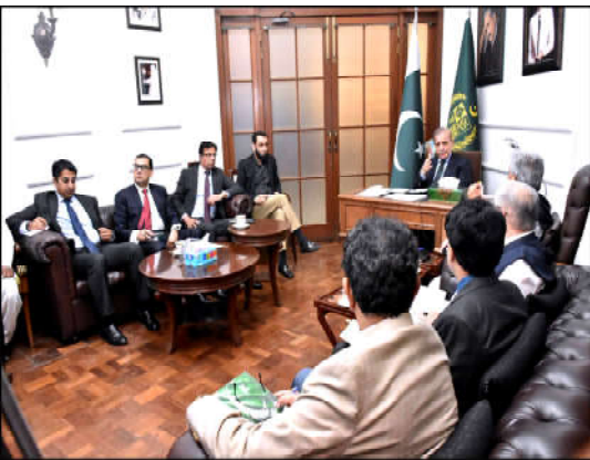
LAHORE: Prime Minister Muhammad Shehbaz Sharif chairs a meeting regarding wheat procurement.