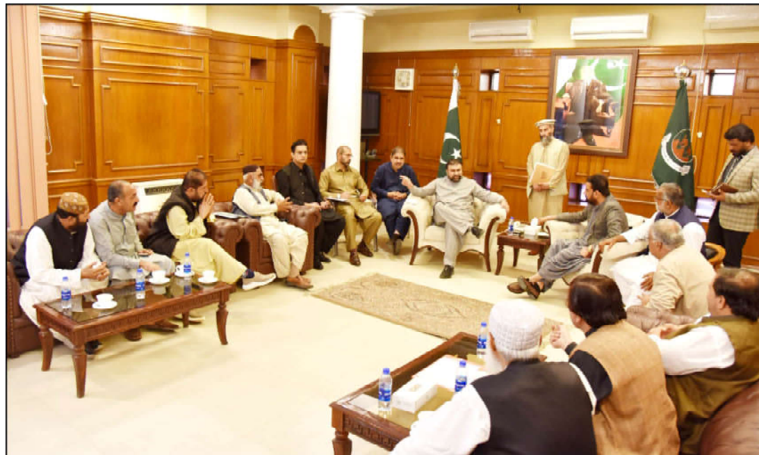
QUETTA: A representative delegation of transporters meeting with Chief Minister Balochistan Mir Sarfraz Ahmed Bugti

is of opinion that the people who contact and talk has no mandate for it. In this situation we don't need PTI and instead we will launch movement against government separately. PTI should forge unity in its ranks first and then contact us.