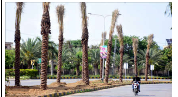
ISLAMABAD: CDA planting date trees on the green belt alongside a road in Sector 1-8 in the Federal Capital.