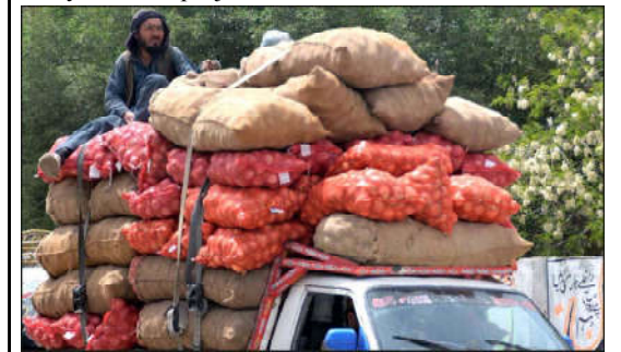
QUETTA: A labour sitting on vegetable stuff while going toward destination.