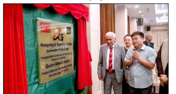
GWADAR: Federal Minister for Maritime Affairs, Qaiser Ahmed Sheikh inaugurates the Hengggeng & Agricultural Industrial Unit at North Free Zone.

They called on UNSC to take urgent steps for immediate ceasefire in Gaza and to facilitate increased and unimpeded delivery of humanitarian aid for the people of Gaza.