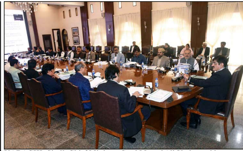
KARACHI: Sindh Chief Minister, Syed Murad Ali Shah presides over a cabinet meeting, held at CM House in Karachi.

The CM also inaugurated Sahulat Markaz at the Primary & Secondary Healthcare Department. She formally restarted the registration process of TB and Hepatitis patients. She also inspected the Drug Testing Lab being established to check the quality of medicines. She visited chromatography, drug sample receiving area and hepatitis reference/public health lab. She was given briefing about the medicine home delivery programme.