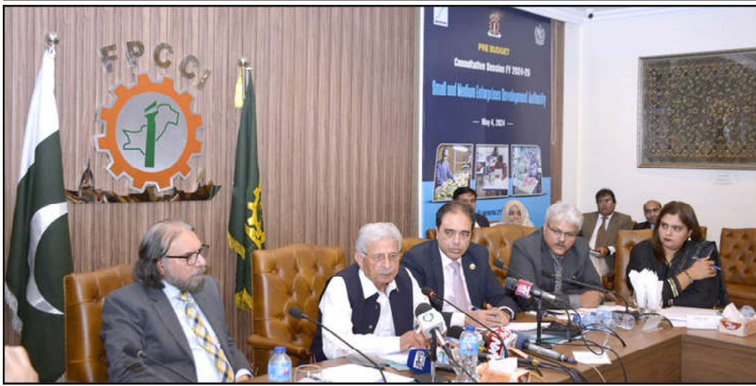
LAHORE: Federal Minister for Industries and Production, Rana Tanveer Hussain addressing meeting at the event of SMEDA.