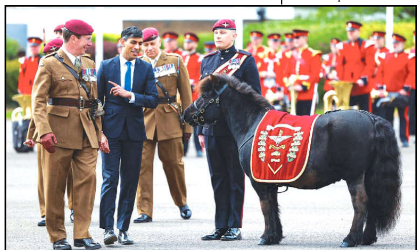
Britain's Prime Minister Rishi Sunak looks at a Shetland pony during a visit to a military base in North Yorkshire.

Donations keep Zay Yar Tun's team and its two trucks running, and they make two deliveries to the camp each week.