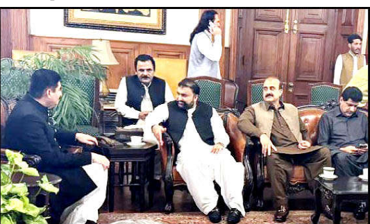
PESHAWAR: Chief Minister Balochistan Mir Sarfraz Ahmed Bugti greets newly appointed Governor Khyber Pakhtoonkhwa Faisal Karim Kundi