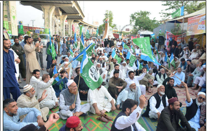
RAWALPINDI: JI workers stage a protest demonstration to show solidarity with Farmers in the City.

said a press release. Professor Ahsan Iqbal highlighted that a major challenge facing the animal husbandry sector is aligning education curricula with the demands of the modern era and bridging the gap between academia and industry to achieve requisite skills of economic development and social prosperity. He emphasized the pivotal role of the veterinary sciences sector in national development goals, advocating for the adaptation of veterinary education curricula to meet the standards of the fourth industrial revolution.