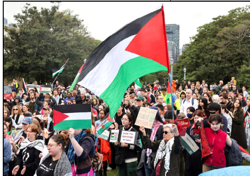
Members of the Palestine Action Group gather ahead of a rally, amid the ongoing conflict between Israel and the Palestinian Islamist group Hamas, in Sydney, Australia.