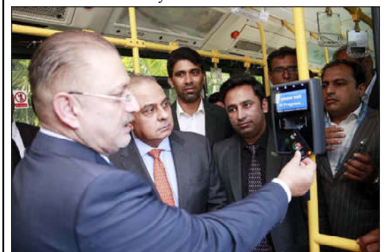
KARACHI: Sindh Minister for Excise and Taxation, Transport, and Mass Transit, Sharjeel Inam Memon being briefed by officials about Automated Fare Collection Smart Card System during launching ceremony of Automated Fare Collection Smart Card System organized by Sindh Transport Department, held at local hotel.

On this occasion, KP Minister for food Shah Toru highlighted the benefits of the project, stating that it will not only address waterlogging issues in Mardan but also meet modern demands. He further emphasized that the project will significantly reduce the risks of flooding and contribute to the beautification and cleanliness of urban areas, ultimately leading to positive health impacts for citizens.