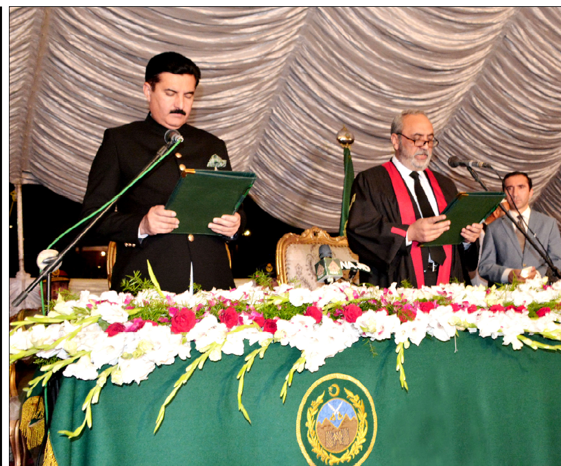
PESHAWAR: Chief Justice Peshawar High Court, Mr. Justice Ishtiaq Ibrahim administering oath to newly appointed Governor Khyber Pakhtoonkhwa Faisal Karim Kundi during oath taking ceremony held at Governor House

Similarly, the World Bank pointed out "A significant revenue gain of 0.4 percent of GDP (PKR 505.26 billion) could be achieved by applying the current rate on premium cigarettes (Rs. 16.50 per cigarette) to standard cigarettes as well."