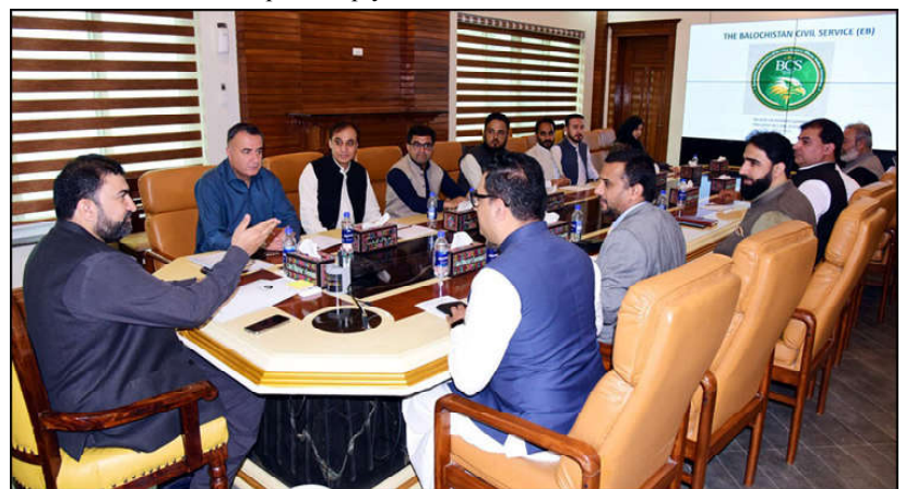
QUETTA: A representative delegation of Balochistan Civil Service Officers Association meeting with Chief Minister Balochistan Mir Sarfaraz Ahmed Bugti