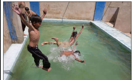
HYDERABAD: Youngsters jumping and bathing in the swimming pole to get relief from hot weather in the city.