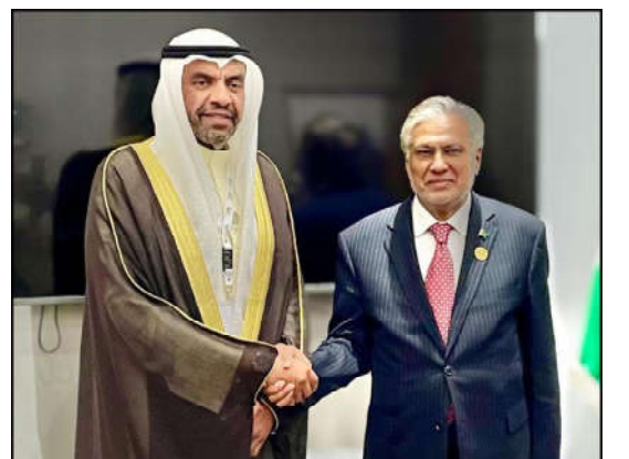
DEPUTY PRIME MINISTER AND FOREIGN MINISTER MUHAMMAD ISHAQ DAR MET WITH FOREIGN MINISTER OF THE STATE OF KUWAIT, SALEM ABDULLAH AL-JABER AL-SABAH ON THE SIDELINES OF THE 15TH ISLAMIC SUMMIT IN BANJUL, THE GAMBIA.

The meeting discussed different matters including tariff rationalization and employment creation, which was reflecting the committee's commitment to addressing challenges faced by the border communities.