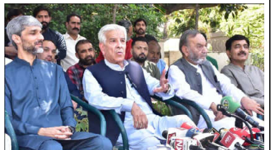
SIALKOT: Federal Minister for Defense, Khawaja Muhammad Asif is addressing to media persons.

"Now there is no constitutional obstacle for Nawaz Sharif to become the party president. Nawaz Sharif has been requested to take charge as the party president," he said.