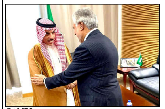
GAMBIA: Deputy Prime Minister and Foreign Minister Senator Mohammad Ishaq Dar meeting with the Saudi Foreign Minister Prince Faisal bin Farhan Al Saud on sidelines of 15th OIC Islamic Summit Conference, in Banjul

They also noted the important role of the Organization of Islamic Cooperation (OIC) on issues concerning the Muslim Ummah including the situations in Palestine and Kashmir.