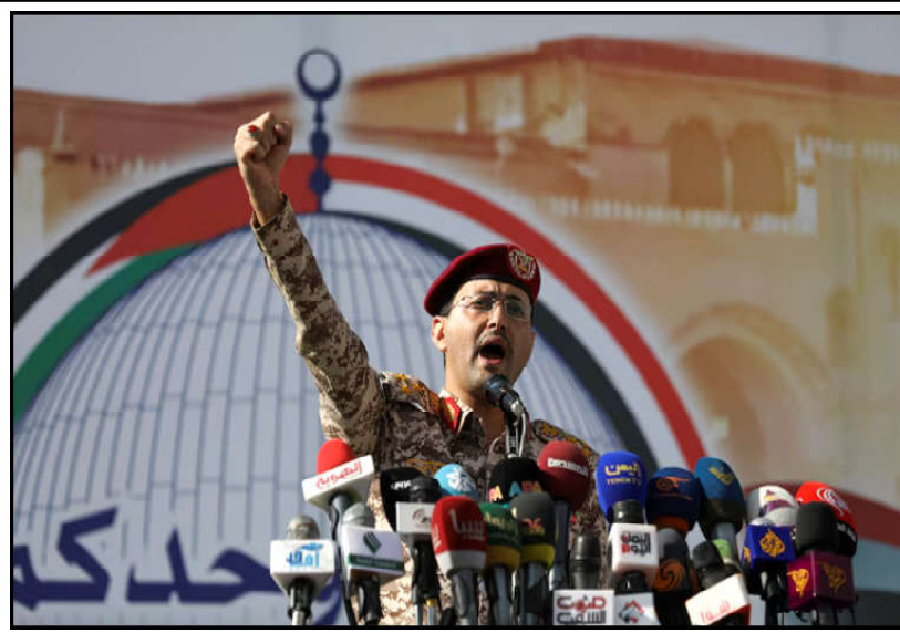
Houthi military spokesman, Yahya Sarea, chants slogans as he delivers a statement during a pro-Palestinian rally in Sanaa, Yemen.

The European Union, the United States, China and many other nations have been racing to draw up regulations and oversight for AI, while global bodies such as the United Nations have been grappling with how to supervise it.