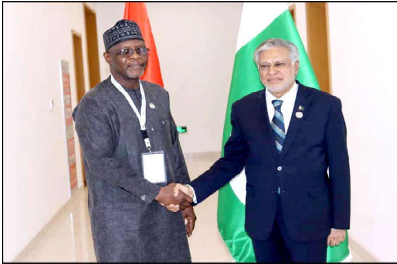
GAMBIA: Deputy Prime Minister and Foreign Minister Senator Mohammad Ishaq Dar meets with his Nigerian counterpart Bakary Yaou Sangare on the sidelines of the 15th Islamic Summit in Banjul.

He said that we are with the vision of Chief Minister for prevention of corruption and irregularities.