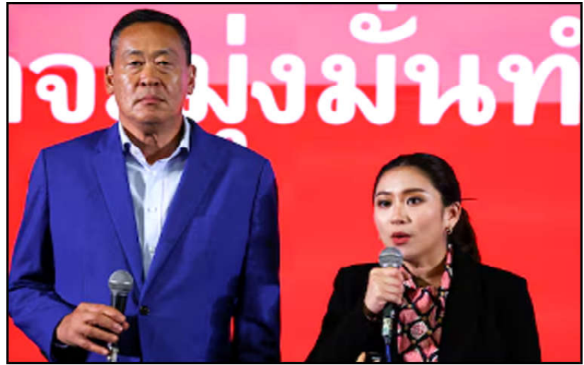
Srettha Thavinsin, a local property tycoon and Pheu Thai Party's prime ministerial candidate and Paetongtarn Shinawatra, daughter of former Prime Minister Thaksin Shinawatra and Pheu Thai's prime ministerial candidate, speak to the media, after the polling stations closed, on the day of the general elections in Bangkok, Thailand.

influence its officials cease immediately." Karim Khan's office declined to answer questions as to where the threats of retaliation may have originated from. It also declined to comment when asked whether it was referring to its investigation into Israel and the Gaza crisis. The ICC opened a probe in 2021 into Israel, as well as Hamas and other Palestinian groups. Khan has said this investigation now "extends to the escalation of hostilities and violence since the (Hamas) attacks that took place on Oct 7". The New York Times has quoted Israeli officials as saying that Prime Minister Benjamin Netanyahu could be among those charged by the court.