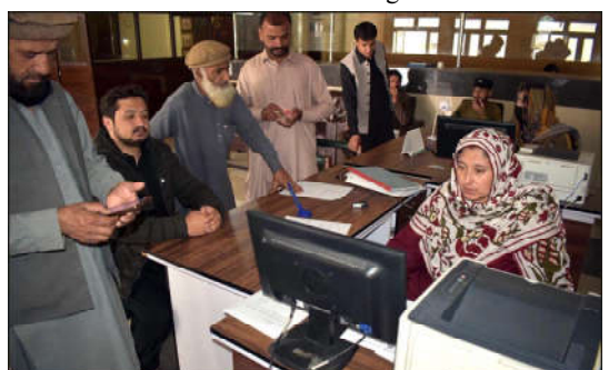
GILGIT: Police Khidmat Markaz staffer issuing online driving license to the customers in Ten District of GB.

He said that by securing the cultural heritage of Sindh, they are providing a favorable environment to the tourists due to which large number of foreign tourists are visiting the historical.