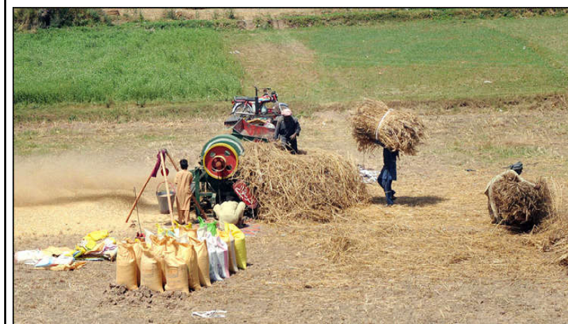
MULTAN: Farmers are busy wheat threshing at their field.

there to explore ventures for investment. Federation President Atif Ikram said that Pakistan is a country rich in natural resources, there are vast opportunities for investment in many sectors including tourism, construction, hydro, textile, pink salt, solar power projects, mines and minerals, gemstones, agriculture.