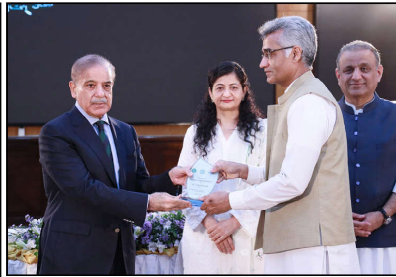
LAHORE: Prime Minister Muhammad Shehbaz Sharif distributing Awards among the high performing officers of the Federal Board of Revenue.

He made these remarks while talking to California's Lt. Governor Eleni Kounalakis during meeting in Los Angeles, California. The Ambassador said Pakistan and the United States have a longstanding cooperation in agriculture sector. Universities from the two countries are intertwined. Masood Khan said the two sides can also collaborate in IT and energy sectors. He said Pakistan is already connected with the Silicon Valley and many