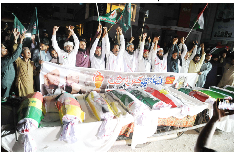
HYDERABAD: Workers of Pakistan Sunni Tehreek hold mock coffins of 57 Islamic Countries and United Nation, during a protest rally and demonstration in front of McDonald's, Restaurant demanding Boycott the Israeli products and close the Mc Donald's and KFC, while police provide the security.