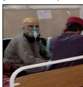
QUETTA: Provincial Health Minister Sardarzada Mir Faisal Khan Jamali and Secretary Health Abdullah Khan visiting different departments of Civil Hospital

The minister also inspected the construction work on Southern Loop 3 and Southern Loop 4 of the Lahore Ring Road, where he was briefed by National Highway Authority (NHA) officials. He reiterated his commitment to ensuring transparency and timely completion of construction projects of national importance, emphasizing the significance of these projects for the country's economic growth and development.