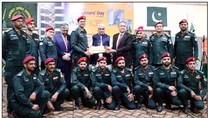
LAHORE: Provincial Minister for Health & Emergency Services Khawaja Salman Rafique in a group photo with best firefighters on the eve of World Firefighter Day.

The meeting was also informed that the traffic police proposed to the government to fund the traffic engineering bureau from its traffic fine revenue to meet the expenses of traffic signals, road lane marking and traffic signs.