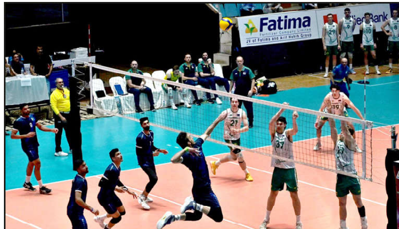
ISLAMABAD: Players of Pakistan and Australia Volleyball teams in action during 2nd match of Sarsabz Volleyball Series-2024 at Liaquat Gymnasium, Sports Complex.