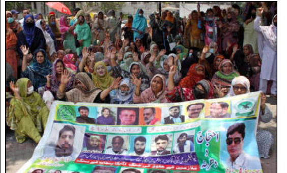
LAHORE: Members of Punjab Teachers Union (PTU) are holding protest demonstration for rise of salaries and pensions, outside Punjab Assembly in Lahore.