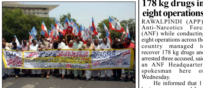
LAHORE: Members of Wapda Paigham Union are holding protest demonstration for acceptance of their demands, at Mall road in Lahore.

and under-training assistant commissioners, here on Wednesday. The inaugural camp, located at The Mall road, was made possible through a collaboration with Pearl Continental Hotel. At this site, volunteers distributed a range of beverages, including Lemon Mint, Rooftop Atza, Leach, Water, and other cooling drinks, to individuals passing by. Simultaneously, they engaged with the public, offering education on heat wave prevention strategies. A second relief camp was established the Hall Road, in collaboration with the Hall Road Traders Union, where similar efforts were undertaken to provide relief to the community.