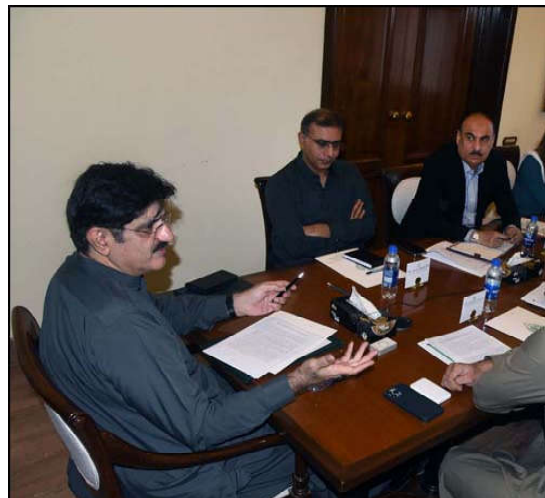
KARACHI: Sindh Chief Minister, Syed Murad Ali Shah presiding over a meeting of the Agriculture Department, held at CM House in Karachi.