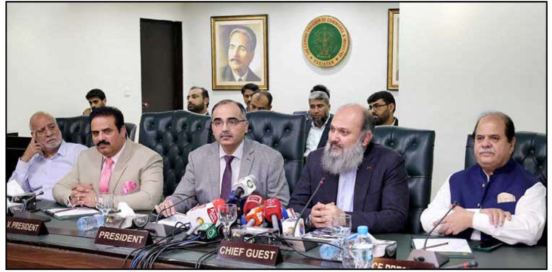
LAHORE: Federal Minister for Commerce Jam Kamal Khan addressing during his visit to Lahore Chamber of Commerce and Industry.