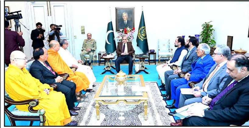
ISLAMABAD: A delegation of Buddhist Monks led by Minister of Budhassasana and Religious Affairs of Sri Lanka Vidura Wickramanayaka calls on Prime Minister Muhammad Shehbaz Sharif.