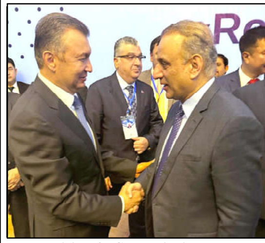
Federal Minister for Communications, Investment Board and Privatization, Abdul Aleem Khan met with Prime Minister Tajikistan, Kokhir Rasulzoda in Dushanbe.

The Minister prayed for the departed souls and grant of patience to the bereaved families.