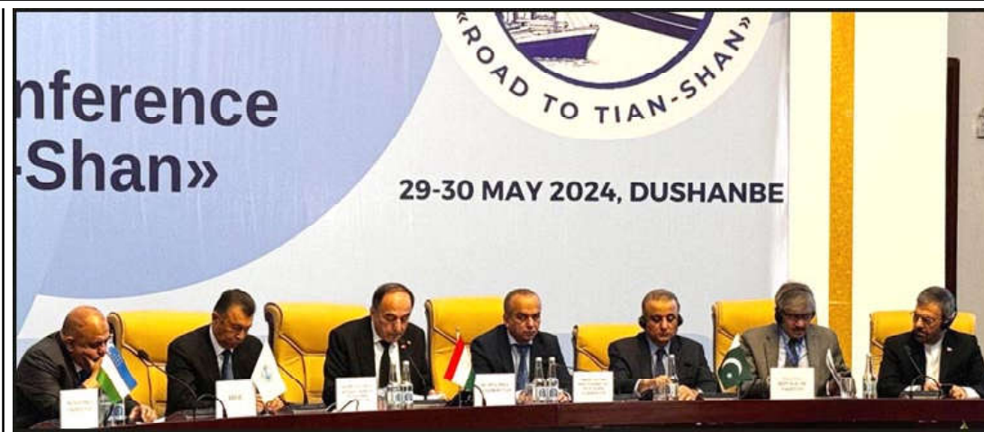
Federal Minister for Communications, Investment Board and Privatization, Abdul Aleem Khan addressing an International Conference in Dushanbe.

On the fiscal front, during July - March FY24, the revenue growth outpaced the growth in expenditures. Within revenues, both tax and non-tax collection grew significantly by 29.3 per cent and 90.7 per cent, respectively.