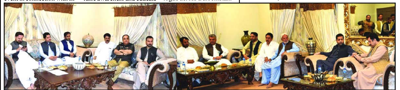
KALAT: Home Minister Mir Ziaullah Lango presiding over a meeting regarding development projects and law and order situation

The survey included 0.25 million mobile broadband tests, 45,000 calls and SMS tests, and 0.13 million Ookla speed tests using advanced QoS monitoring tools, ensuring compliance with NGMS licenses and the Cellular Mobile Network QoS Regulations 2021.