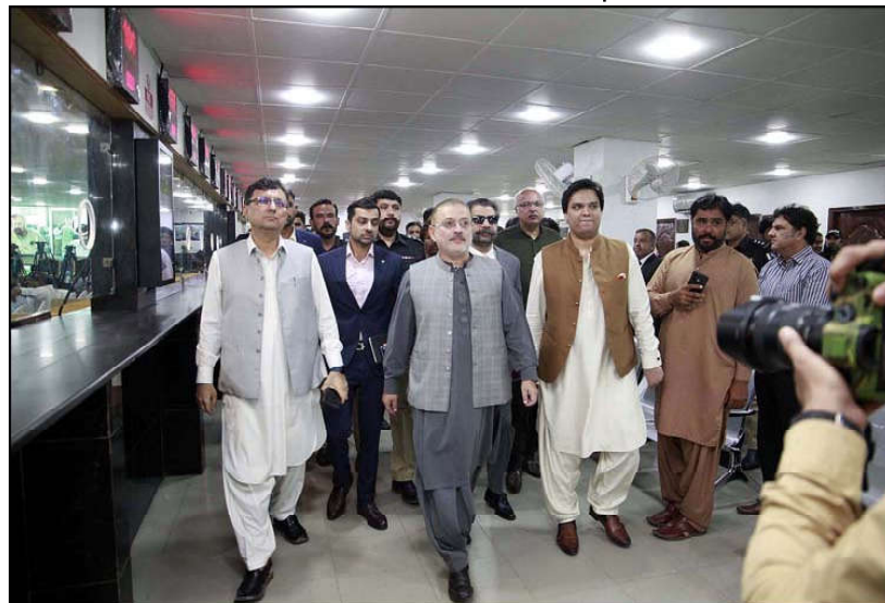
KARACHI: Sindh Minister for Information, Transport and Mass Transit, Excise Taxation and Narcotics Control, Sharjeel Inam Memon being briefed by officials during inauguration ceremony of the New Biometric Vehicle Registration System Counters, at Civic Centre building in Karachi.

BUREWALA (APP): A person was killed while six others including a woman sustained injuries over brawl between two groups on land dispute in limits of Saddar police. According to details, there was a two kanal land dispute between Lagrial community in Chak No 457/EB on which one group consisted of over 20 armed persons including Malik Asghar Lagrial, Ehsan Lagrial, Muzamil, Farooq and others attacked on opposite group. They opened firing and allegedly killed Muhammad Shahzad Langrial and injured Manzoor Ahmad.