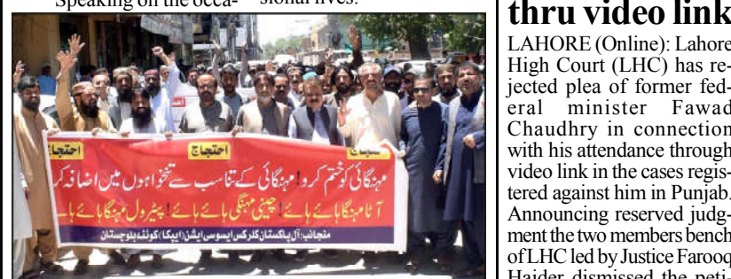
QUETTA: APCA Balochistan activists hold protest rally in favor of their demands.

The Chairperson BISP said that presence of women in very essential. She said that the women work with extra zeal and honesty in their professional lives.