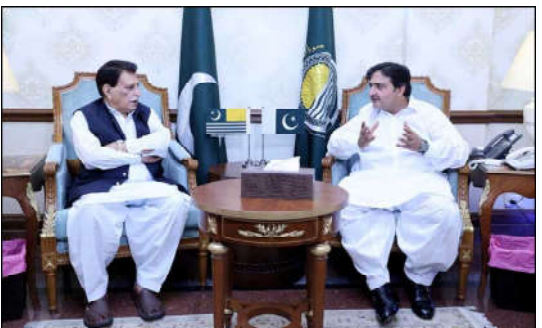
LAHORE: Former Prime Minister Azad Kashmir Raja Farooq Haider meeting with Speaker Punjab Assembly Malik Muhammad Ahmed Khan.

ISLAMABAD (APP): Ministry of Federal Education and Professional Training has drawn the urgent attention of Chief Secretary Khyber Pakhtunkhwa (KP) Peshawar regarding the destruction of schools by terrorists in newly merged districts and demanded prompt action against the menace of terrorism. In a letter written to the Chief Secretary KP, the Federal Secretary Ministry of Federal Education and Professional Training has expressed grave concern over the recent incidents of destruction of schools in the newly merged districts of Khyber Pakhtunkhwa. "It is particularly disheartening to note that these heinous acts of terrorism are disproportionately targeting institutions dedicated to girls' education," the letter said. The federal government is deeply alarmed by these developments, which not only endanger the lives of our children but also threaten the progress.