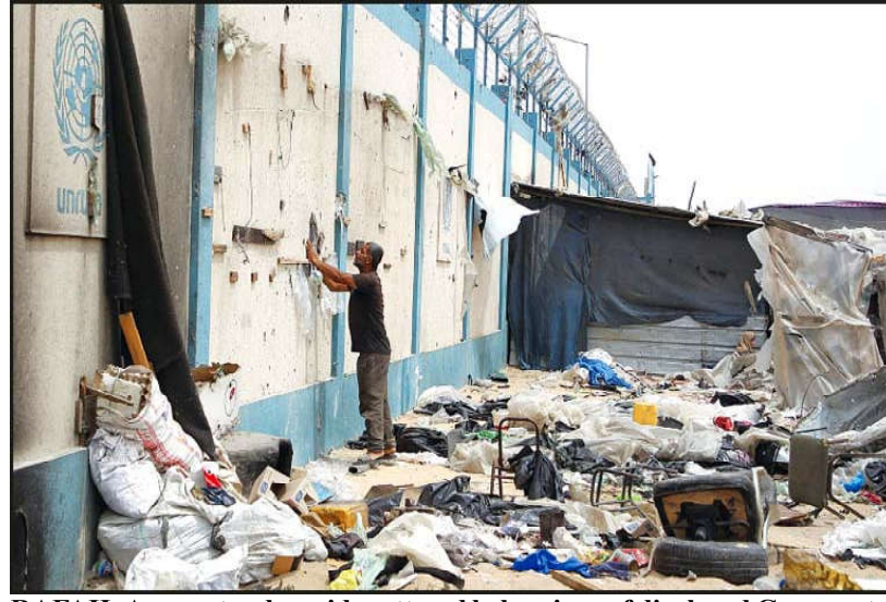
RAFAH: A man stands amidst scattered belongings of displaced Gazans at a tent camp destroyed by an Israeli strike in the southern Gaza Strip.

The Israeli military said its forces continued to operate in the Rafah area, without commenting on reported advances into the city centre. Witnesses in central Rafah said the Israeli military appeared to have brought in remote-operated armoured vehicles and there was no immediate sign of personnel in or around them.