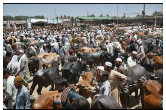
PESHAWAR: A large number of people purchasing sacrificial animals from Cattle Market at Ring Road.

Talking to PTV news, he said that the effective policies of Pakistan Muslim League-N led government were resulting in improvement in the