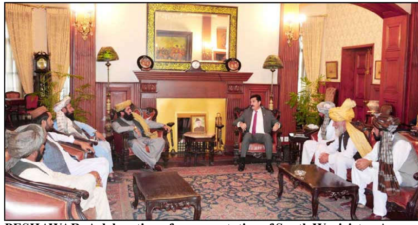
PESHAWAR: A delegation of representative of South Waziristan Angoor Ada meeting with Khyber Pakhtunkhwa Governor Faisal Karim Kundi.