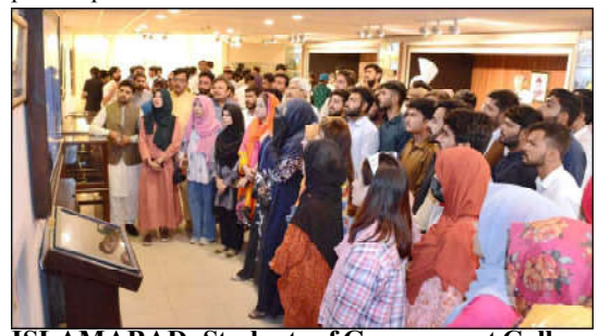
ISLAMABAD: Students of Government College University, Faisalabad visiting Senate Museum at Parliament House.

The AG presented report of police station Dhir