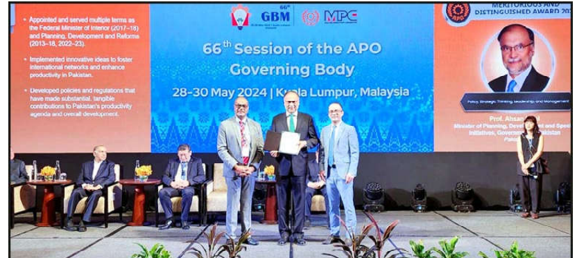
KUALA LUMPUR: Planning Minister Prof. Ahsan Iqbal receiving the APO Meritorious and Distinguished Award 2024 by the Asian Productivity Organisation (APO) in Malaysia.

She noted that approximately 2 million women worldwide suffer from this debilitating condition, which often leads to social isolation. In Pakistan, about 4,000 to 5,000 women are affected by fistula, primarily due to social inequalities, outdated customs, poverty, lack of education and awareness, unavailability of family planning facilities, shortage of trained healthcare workers, and absence of basic facilities at the regional level.