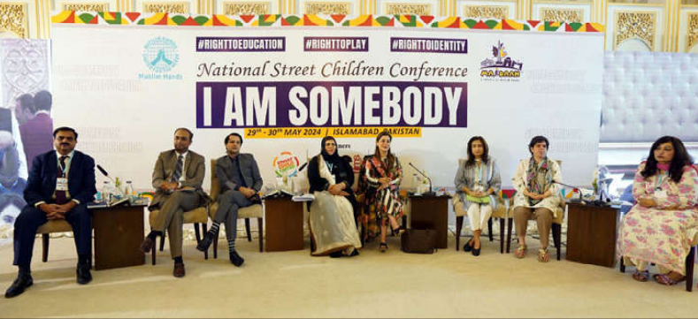
ISLAMABAD: A view of the Panel taking part in the first session of the conference titled "National Street Children Conference - I am Somebody" under the auspices of Muslim Hands and Maidaan at a local hotel.

He said that Gandhara civilization also led to the early linkages between Pa-