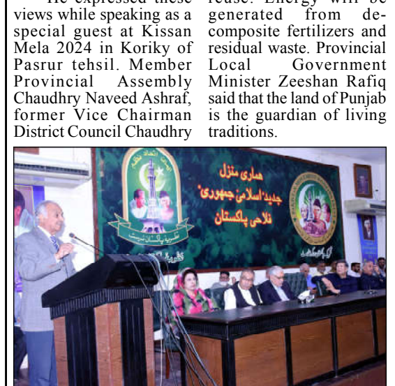
LAHORE: General (ret'd) Abdul Qayyum addressing the Takbeer Day ceremony at Provincial Capital.

The police have started investigation after inspecting the crime scene.