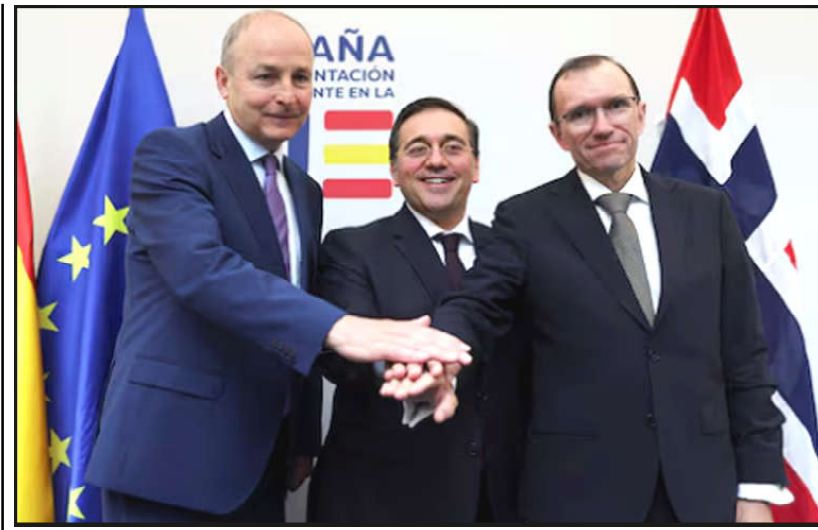
Spanish Foreign Minister Jose Manuel Albares, Norway's Foreign Minister Espen Barth Eide and Ireland's Foreign Minister Micheal Martin gesture after a press conference in Brussels, Belgium.

Tuesday's move will mean 145 of the United Nations' 193 member states now recognise Palestinian statehood. On October 7, Hamas fighters stormed into southern Israel in an assault that killed more than 1,170 people, mostly civilians, according to an AFP tally based on Israeli official figures. The Palestinian fighters also took 252 hostages, 121 of whom remain in Gaza. The Israeli army says 37 of them are dead. Israel's relentless retaliatory offensive, which has been globally and widely condemned, has killed more than 36,000 people in Gaza, also mostly civilians, according to the territory's health ministry. Spain, Ireland and Norway will also jointly issue a "firm" response to Israel's angry reaction to their decision to recognise a Palestinian state, Spain's top diplomat said.