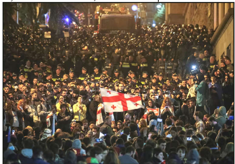
People take part in a protest against a draft bill on "foreign agents" in Tbilisi, Georgia.

popularity. Support for MK is around 8%-14% nationally, according to opinion polls. Although 82-year-old Zuma is legally barred from standing for parliament due to a jail sentence, MK's emergence has disrupted the political landscape, testifying to his enduring influence particularly in his home province KwaZulu-Natal. An anti-apartheid veteran and Zulu traditionalist, Zuma has a strong following especially in rural areas due to his populist style and modest upbringing.