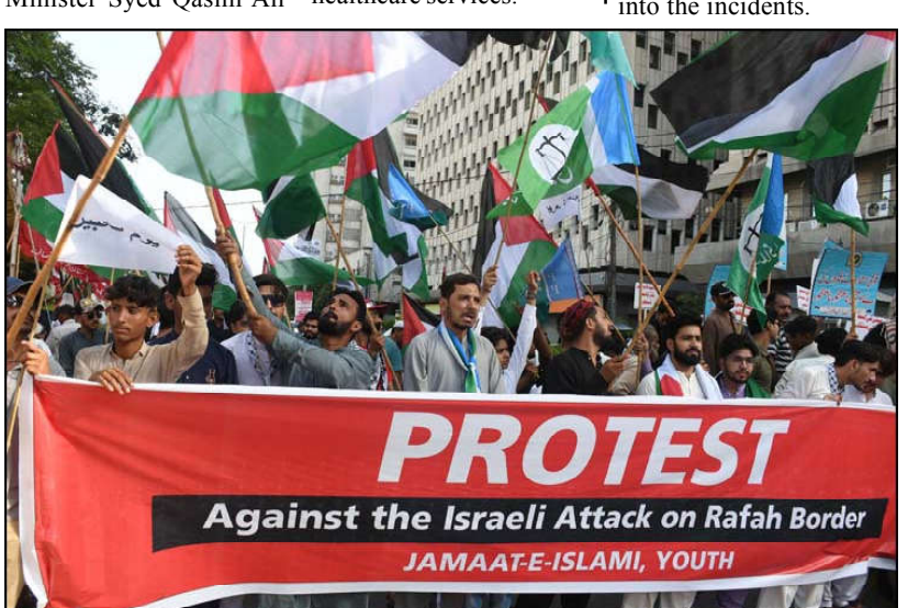
KARACHI: Supporters of the Pakistani religious group "Jamaat-e-Islami" protest the continued bombing of Gaza Israeli air strikes on tents housing displaced people in Rafah, Gaza, in Karachi.

Since Pakistan has a meager share in global revenue earning from tourism, the experts believe that if the government fully employs the latest digital techniques and social media to highlight these hidden destinations, it can earn billions of dollars annually.