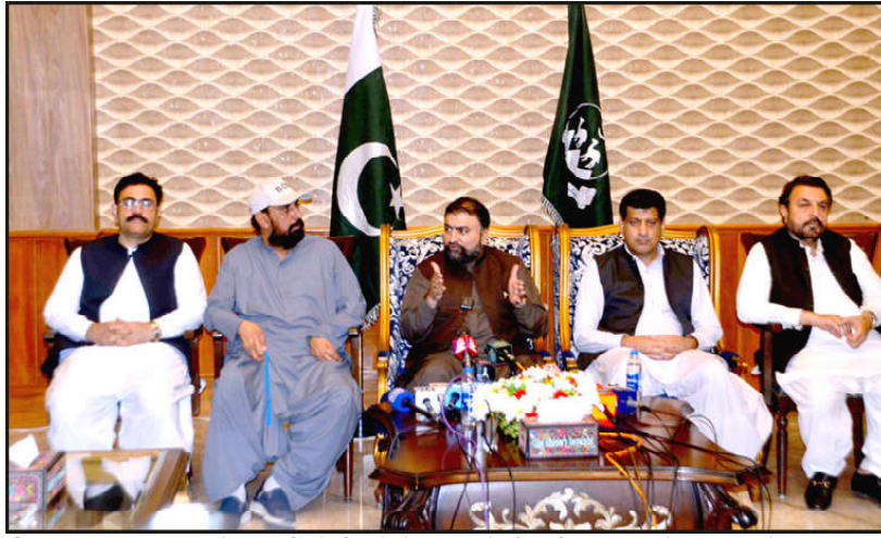
QUETTA: Balochistan Chief Minister Mir Sarfraz Bugti addressing a press conference at CM Secretariat regarding the decision taken of posts in education department and other issues.