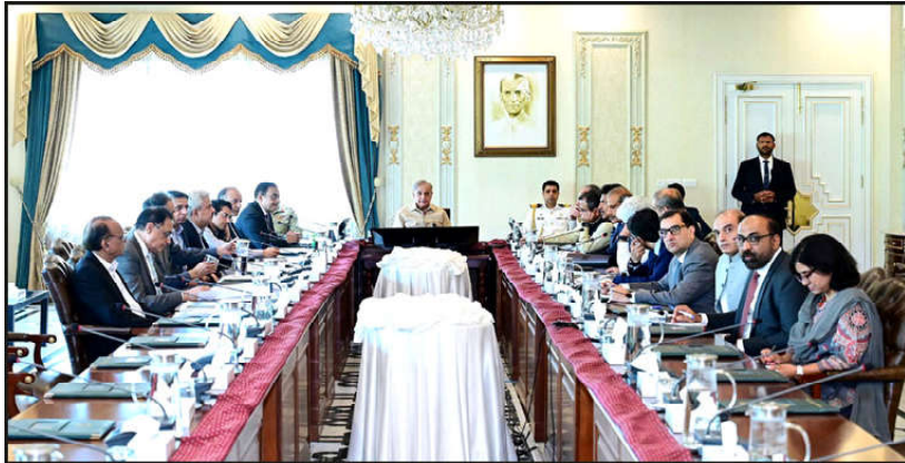
ISLAMABAD: Prime Minister Muhammad Shehbaz Sharif chairs a review meeting on Electricity Supply Load Management and Anti-Power Theft Campaign.

Gulf created between State & youth thru wrong narrative: