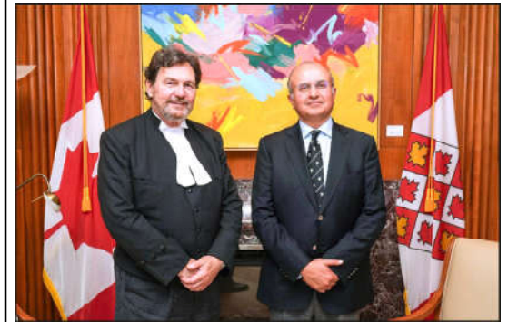
OTTAWA: Syed Mansoor Ali Shah, Senior Judge SC of Pakistan meeting with Chief Justice of Canada Honorable Richard Wagner.

It was told that areas with more power theft and line losses and low recovery rate were being subjected to load shedding and that the upgradation of the south-north power transmission line would help improve the system.