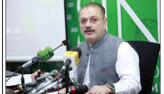
KARACHI: Sindh Senior Minister and Provincial Minister for Information, Transport, Excise, Taxation, and Narcotics Control Sharjeel Inam Memon addresses the Press Conference regarding celebration of Youm-e-Takbeer.

DERA ISMAIL KHAN (APP): A rally was held on Tuesday to observe Youm-e-Takbeer anniversary of the nuclear tests conducted on May 28, 1998. Deputy Commissioner Mansoor Arshad led the rally in which government officials, civil society members, political party representatives, and social leaders participated, waving national flags and chanting slogans of "Pakistan Zindabad" and "Youm-e-Takbeer Zindabad". The rally commenced from the Deputy Commissioner's Office with participants and culminated after reaching Yadgar Chowk.