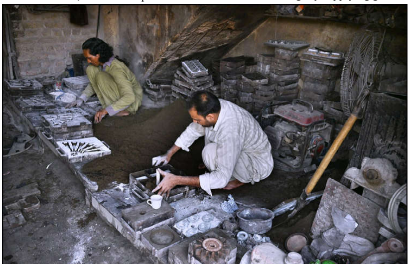
HYDERABAD: Workers making different parts from iron die at his work place at goods Naka area.

thunderstorms, and strong winds from the evening of May 28 to June 1. The regions likely to be affected include Chitral, Dir, Swat, Abbottabad, Manshehra, Haripur, Kohistan, Shangla, Buner, Malakand, Waziristan, Kohat, Lakki Marwat, Bajaur, Mohmand, Karak, Khyber, Peshawar, Mardan, and Kurram. Heavy rainfall during this period may trigger landslides in the upper regions of Khyber Pakhtunkhwa, specifically in Chitral, Dir, Swat, Kohistan, Shangla, Buner, Manshehra, and Abbottabad. Strong winds and thunderstorms could damage structures.