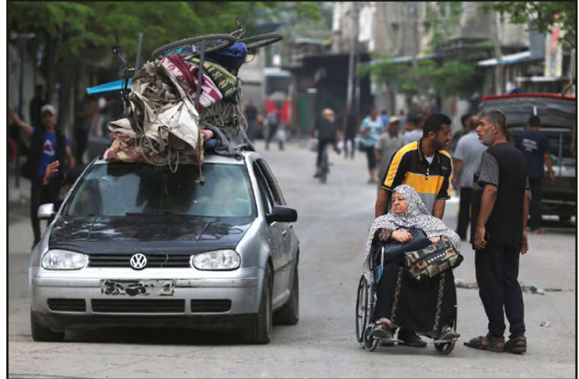
Palestinians travel in vehicles and on foot along with their belongings as they flee Rafah due to an Israeli military operation, in Rafah, in the southern Gaza Strip.

United Nations says is a near-famine. FILE - Palestinians displaced by the Israeli bombardment of the Gaza Strip set up a tent camp in Rafah on Dec. 6, 2023. The tent camps stretch for more than 16 kilometers (10 miles) along Gaza's coast, filling the beach and sprawling into empty lots, fields and town streets. (AP Photo/Hatem Ali, file) Palestinians displaced by the Israeli bombardment of the Gaza Strip set up a tent camp in Rafah on Dec. 6, 2023. (AP Photo/Hatem Ali, file) The situation has been worsened by a dramatic plunge in the amount of food, fuel and other supplies reaching the U.N. and other aid groups to distribute to the population. Palestinians have largely been on their own to resettle their families and find the basics for survival.