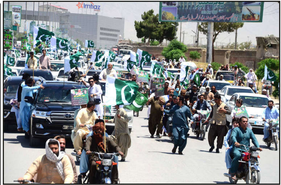
QUETTA: A rally passing through Koyla Patahk organized to observe Youm-e-Takbeer.

Prime Minister Shehbaz also directed the departments concerned to control the fire by ensuring the safety of human lives.