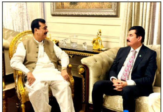
Governor Khyber Pakhtunkhwa Faisal Karim Kundi calls on Acting President Syed Yousuf Raza Gillani in Islamabad.

ISLAMABAD (APP): Federal Minister for Investment Board, Privatization and Communications, Abdul Aleem Khan, during his visit to Tajikistan held detail meetings with Transport Minister Azim Ibrahim and Minister for Economic Development and Trade Zavgizoda Zavqi Amin to increase bilateral trade between the two countries. Aleem Khan agreed to the proposals for starting a pilot project at the ports of Gwadar and Karachi and increasing the "Organic Export", said a press release issued here on Tuesday. The federal minister while expressing the determination to expand existing relation between two coun-