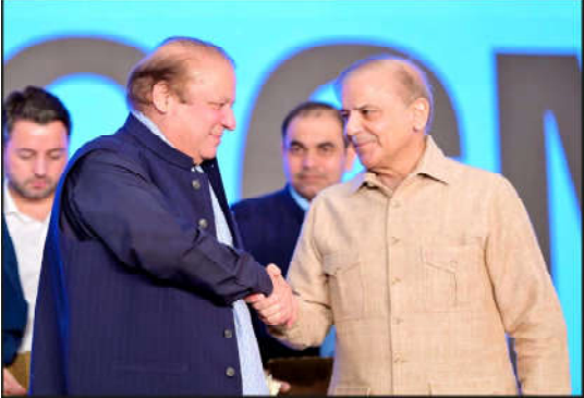
LAHORE: Prime Minister Muhammad Shehbaz Sharif congratulates former Prime Minister Muhammad Nawaz Sharif on being elected unopposed as President of PML-N in Lahore.

Ex-PM vehemently criticises decision by former chief justice Saqib Nisar, declaring it has been discarded as 'trash'; Nawaz's love, services to nation made him party President again: PM Shehbaz