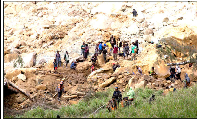
People clear an area at the site of a landslide in Yambali village, Enga Province, Papua New Guinea.

Georgia and South Carolina until at least Monday afternoon. "It was a tough night for our people," the Kentucky governor said on social media platform X on Monday. He later said in a press briefing that "devastating storms" had hit almost the entire state. Officials said 100 state highways and roads were damaged by the storms. At least seven people perished — including two children aged two and five from a single family and nearly 100 were injured on Saturday night when a powerful tornado struck communities in north Texas near the Oklahoma border, Governor Greg Abbott said at a Sunday news conference.