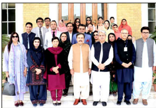
QUETTA: Governor Balochistan Sheikh Jaffar Khan Mandokhail in a group photo with participants of 13th National Workshop Balochistan

The Chief Minister also pointed out the potential for development in sectors like information technology, minerals, livestock, and education.