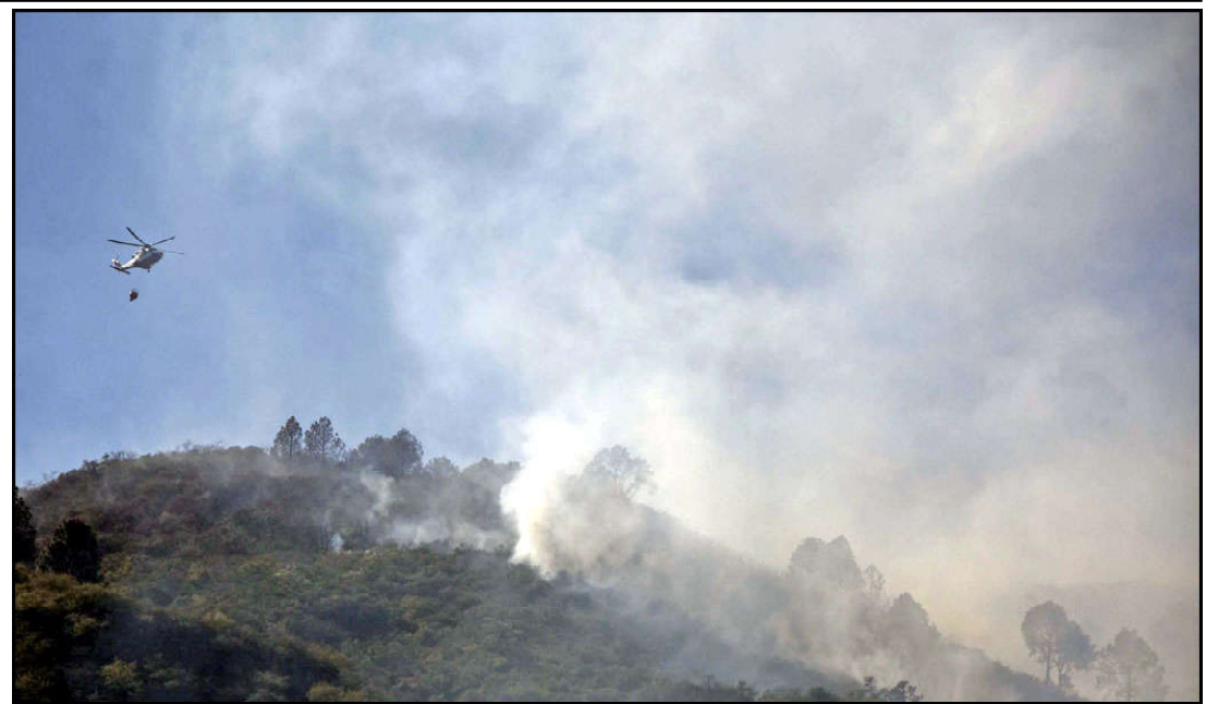
ISLAMABAD: People hanging on the passenger van risking their lives at Satra Meel area on the outskirts of Islamabad, need the attention of the concerned authorities.

cigarettes. Despite efforts to increase taxes, low cigarette prices persist, contributing to sustained high consumption levels. By adopting these reforms, Pakistan can make cigarette taxation more effective and align it more closely with international best practices. He further added that the cigarette prices in Pakistan are still cheaper than in many parts of the world. By utilizing price comparison as a reference point, policy-makers can better understand market dynamics and assess the potential of tax hikes on consumer behavior and government revenue.