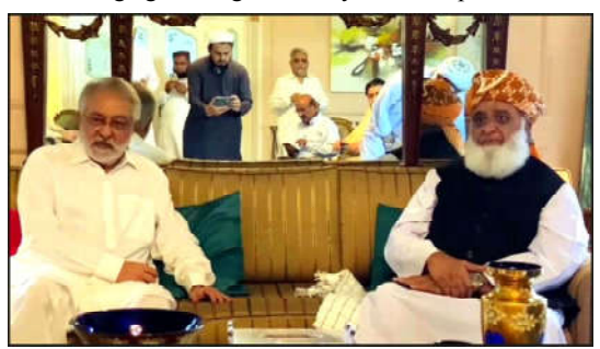
KARACHI: Grand Democratic Alliance (GDA) Chief, Pir Sibghatullah Shah Rashidi exchanging views with Maulana Fazal-ur-Rehman, Chief of Jamiat Ulema-e-Islam (JUI-F) during meeting held in Karachi.