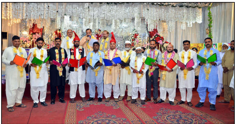
FAISALABAD: The oath ceremony of newly elected officials of Anjuman Tajran Rajbah Road, held in the city.

Tarbela 4 th and 5 th Extension and Chief Engineer (Operation & Maintenance) Tarbela 4 th Extension were also present on the occasion. Tarbela 5 th Extension Hydropower Project is a component of the green, clean and least-cost energy generation plan of WAPDA. World Bank and Asian Infrastructure Investment Bank are providing financial assistance for the construction of the Project to the tune of US$ 390 million and US$ 300 million respectively. The generation capacity of the Project stands at 1530 MW with three generating units of 510 MW each. The Project will provide 1.347 billion units of hydel electricity to the National Grid annually. Once the 5 th Extension is completed, the installed capacity at Tarbela Dam will increase from 4888 MW to 6418 MW.