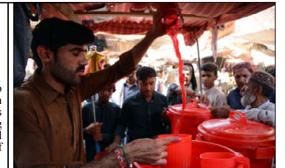
SUKKUR: Vendor runs his juice business as people quench their thirst as demand of juices increased in city during scorching hot weather of summer season, in Sukkur.

LAHORE (APP): Punjab Food Minister Bilal Yasin has said the government is on a mission of providing quality and affordable food items to the people of Punjab. After the clear reduction in the prices of flour, roti and naan, on the instructions of Punjab Chief Minister, the minister on Tuesday announced a significant reduction in bakery products. According to the details, after meetings and negotiations with the representatives of the bakery association and various brands, a reduction of Rs. 30 has been made on the large bread, while the large bread available at less than Rs. 200 is being reduced by Rs. 20. The Food minister said that a discount of Rs. 10 has been given on small bread and Rs. 5 on all kinds of buns. Bilal Yasin said that a decrease of Rs 10 for 200 grams of rusk is announced while the prices of all types of bakery products were reduced significantly. He said that the price reduction of bakery products will be implemented immediately and the price reduction will be applied to all brands and local bakery products across the province.