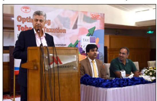
ISLAMABAD: Former Federal Minister for Information and Broadcasting Murtaza Solangi, addressing at Report Launch ceremony on "Optimizing Tobacco Taxation in Pakistan" organized by SPARC.

under the auspices of the United Nations. They said that the Modi government was using election dramas to divert attention of the international community from the prevailing dire situation in the territory. They added that all basic rights of the Kashmiris had been usurped and Indian state terrorism was at its peak in Kashmir. The speakers maintained that the Kashmiris were not fighting for elections but for their birthright, the right of self-determination and that they would continue their struggle till accomplishment of the goal. They urged the international community to shun its double standards, take notice of India's expansionist designs and pressurize it to let the Kashmiris decide their political future in line with the relevant Security Council.