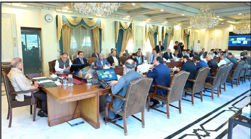
ISLAMABAD: Prime Minister Muhammad Shehbaz Sharif chairs a review meeting on Pakistan-China cooperation.