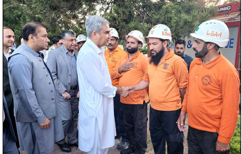
ISLAMABAD: Federal Minister for Interior Mohsin Naqvi shaking hands with the personnel of Emergency Services at CDA Headquarters.