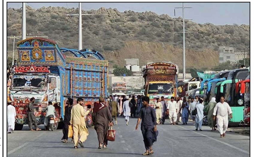
HUB: Members of All Balochistan Transporters Association blocked the Quetta-Karachi National Highway against the border trade of Iranian diesel in Balochistan and the extortion of Pakistan Coast Guard Customs, at Bhawani in Hub on Tuesday.