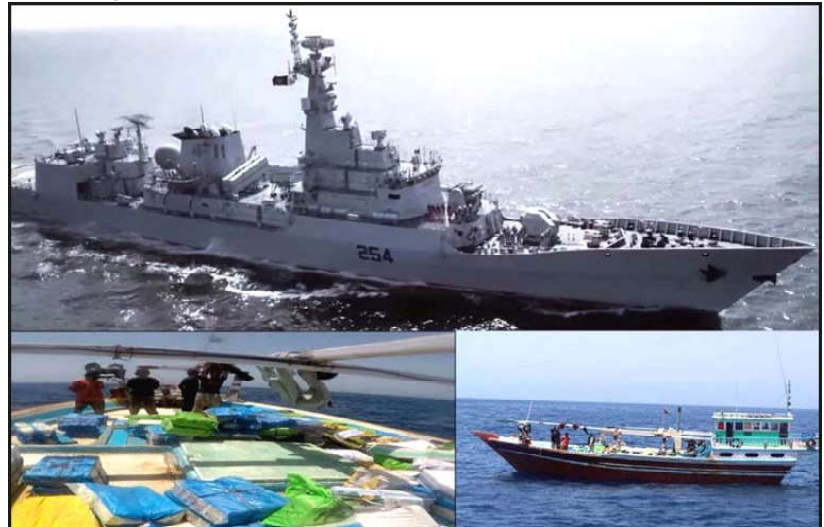
KARACHI: Pakistan Navy Ship ASLAT seizes narcotics in the North Arabian Sea during Regional Maritime Security Patrol (RMSP).

A large number of people including Pakistan People Party (PPP)'s workers and citizens participated in the rally and people raised slogans in favour of Pakistan Army and the country.