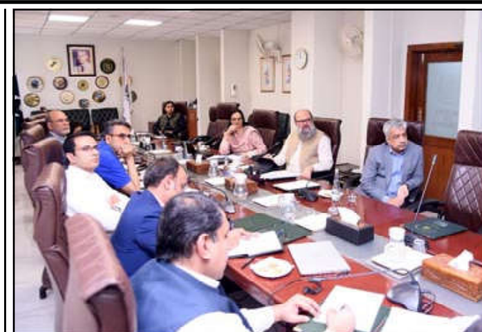
ISLAMABAD: The Federal Minister for Commerce, Jam Kamal Khan, presiding over the 9th National e-Commerce Council (NeCC) meeting, underscoring the importance digital trade and eCommerce for Pakistan's economic future.