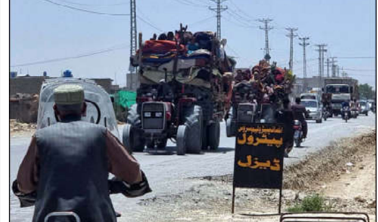
QUETTA: Nomadic families are moving to colder areas after the heat wave has increased in Sindh, at Western Bypass in Quetta.

ISLAMABAD (INP): Temperatures in some districts of Sindh and Southern Punjab reached to as high as 50 Celsius (122 Fahrenheit) on Sunday. Maximum temperatures in Dadu, Qambar Shahdadkot and Jacobabad districts of Sindh and Rohjan and Rajanpur in southern Punjab soared to 50 degree Celsius. While maximum temperature recorded 49 Celsius in Sindh's Nawabshah, Sukkur, Shikarpur, Ghotki and Kashmore districts and Punjab's Rahim Yar Khan and Liaquatpur. Moreover, mercury reached to 45 Celsius in Faisalabad and 44 Celsius in Lahore. Most of the districts in Sindh experiencing extremely hot weather while coastal districts of the province remain hot and humid.