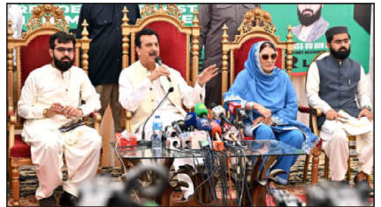
LAHORE: Acting President Syed Yousuf Raza Gilani addressing to media after inauguration of the Zahaer ud Din RO plant at Military Accounts Cooperative Housing Society.

He expressed these views while talking to media after laying the foundation stone of a reverse osmosis (RO) plant here on Sunday. He highlighted that as a member of the United Nations, Pakistan was committed to the Sustainable Development Goal (SDG) 6, which aimed to ensure "availability and sustainable management of water and sanitation for all" by 2030. He expressed his appreciation for those working to provide clean drinking water, noting that their efforts were also in service to the state.