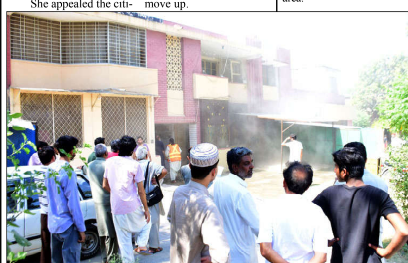
ISLAMABAD: Fire fighters trying to extinguish a fire erupted at C Block, G-7/2 in the Federal Capital.