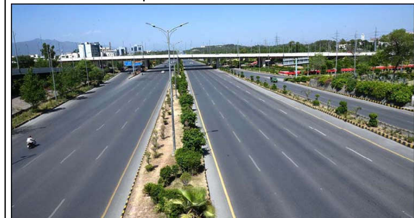
ISLAMABAD: A deserted view of Sri Nagar Highway due to extreme heat wave in Federal Capital.

ment Program (SDP), along with Tuaha Adil, Research Economist at the Policy Research Institute of Market Economy (PRIME), collectively emphasized the economic and environmentally friendly advantages of electric vehicles (EVs). They pointed out the immense pressure on foreign exchange reserves due to the transportation sector's oil consumption, highlighting the potential savings and environmental benefits of adopting e-scooters. E-scooters are changing how we navigate cities, empowering women, saving money, and promoting eco-friendliness. With more adopting this electric trend, the capital's transportation future looks brighter and cleaner.