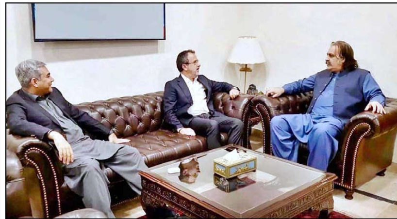
ISLAMABAD: Interior Minister Mohsin Naqvi and Federal Minister for Energy Sardar Awaiz Ahmad Khan Laghari in a meeting with Chief Minister Khyber Pakhtunkhwa Ali Amin Gandapur.

stan into the world's top ten economies by its 100th anniversary. He said record funds have been allocated for higher education, with plans to establish universities in every district and institutions for technical education. Laptops are being distributed on merit, with options for students to purchase on easy installments if they do not qualify on merit. The initiative aims to equip the youth with digital technology for employment, he said. While addressing the issue of intolerance and unrest in Pakistan, a country founded in the name of Islam, he stressed that Islam signifies peace and brotherhood. The organization and harmony in the universe exemplify these principles. By adopting these principles of organization and mutual cooperation, society can achieve peace and progress, he added.