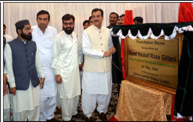
LAHORE: Acting President, Syed Yousaf Raza Gillani inaugurating the Water Filtration Plant, in Lahore.