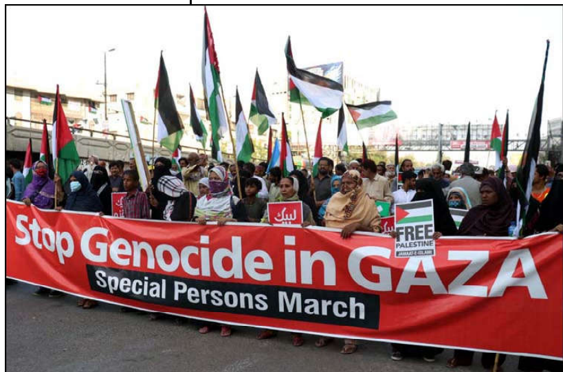
KARACHI: Supporters of Jamat-e-Islami (JI) are holding Special Persons March against Israeli aggression and atrocities on the Gaza Strip and solidarity with the Palestinians, at Rashid Minhas road in Karachi.

RAWALPINDI (APP): Anti-Narcotics Force (ANF) while conducting nine operations across the country managed to recover 324 kg drugs and arrested 15 suspects, said an ANF Headquarters spokesman. He informed that 27 kg ice was recovered from a parcel sent to Japan at a courier office in Karachi while an accused was arrested. 900 grams ice was recovered from a passenger going to Bahrain at Islamabad Airport. In two separate operations in Balochistan.