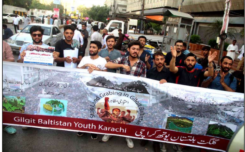
KARACHI: A protest is being held outside the Karachi Press Club by Gilgit-Baltistan Youth for their demands.

LAHORE (INP): Pakistan Cricket Board (PCB) has decided to not appoint anyone as a vice-captain of the national team for the upcoming T20 World Cup 2024. The statement came at the time when sources reported that Pakistan's star speedster Shaheen Afridi had declined the Pakistan Cricket Board's (PCB) offer to become the national team's vice-captain. According to PCB's official statement, "It was unanimously decided not to appoint anyone. As no such offer was made to anyone." The board further said that the national team is fully united, committed and keenly looking forward to the upcoming matches in the UK and the ICC Men's T20 World Cup 2024. Yesterday, sources revealed that the selection committee had offered Shaheen Afridi to become the team's vice-captain, which he refused to accept. It is pertinent to mention here that Shaheen Shah Afridi took over the captaincy of the T20I team after Babar Azam resigned from his role as all-format captain following the national team's dismal performance in the ODI World Cup in India last year.