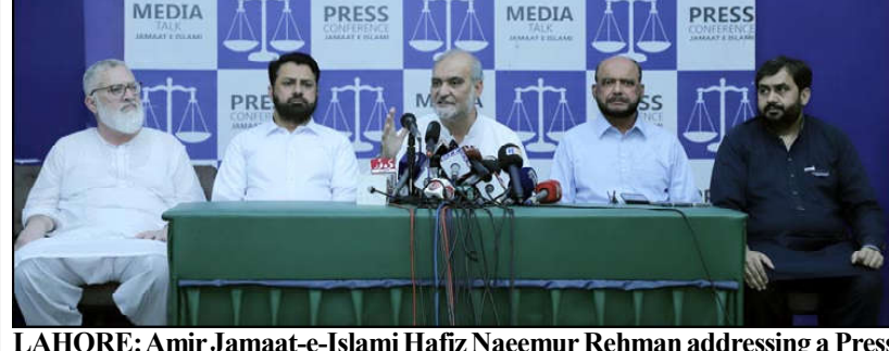
LAHORE: Amir Jamaat-e-Islami Hafiz Naeemur Rehman addressing a Press conference.

ISLAMABAD (APP): Federal Minister for Information, Broadcasting and Culture Attullah Tarar on Sunday expressed deep grief and sorrow over the death of Talat Hussain, a great actor of television, film, theatre and radio. In a message, the Federal Minister expressed his heartfelt condolence and sympathy to the family of the deceased. He said he was deeply grieved to hear the news of the death of Talat Hussain who was a unique artist who brought life to every character with his voice and acting.