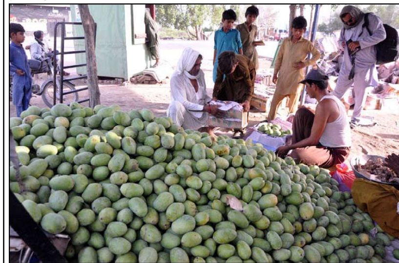
HYDERABAD: Laborers are busy in packing unripe mangoes to earn their livelihood for support their families, at Vegetable Market in Hyderabad.

electricity was strangulating the masses and the economy therefore it should be reconsidered, he stressed. The business leader said that consumers should not be made to pay the price of the power bureaucracy's incompetence and corruption, which was unacceptable. He informed the IMF was assured to keep the circular debt below Rs2.31 trillion, which reached 2.7 trillion in November last year and may now reach around 3 trillion. The increase in circular debt includes insufficient collection of bills, rampant theft, line losses, high production costs, capacity payments, and other issues that need to be addressed on priority.