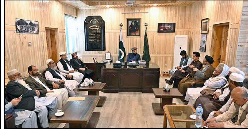
SKARDU: Chief Minister Gilgit-Baltistan Haji Gulbar Khan presiding over the meeting of Religious Scholars during his visit.

LAHORE (APP): At least twenty persons were killed and 1369 injured in 1273 road accidents in all 37 districts of Punjab during the last 24 hours. Out of these, 623 people with serious injuries were shifted to different hospitals, while 746 victims with minor injuries were treated at the incident site by Rescue Medical Teams thus reducing the burden of Hospitals. Furthermore, the analysis showed those 741 drivers, 69 underage drivers, 155 pedestrians, and 441 passengers were among the victims of road traffic crashes.