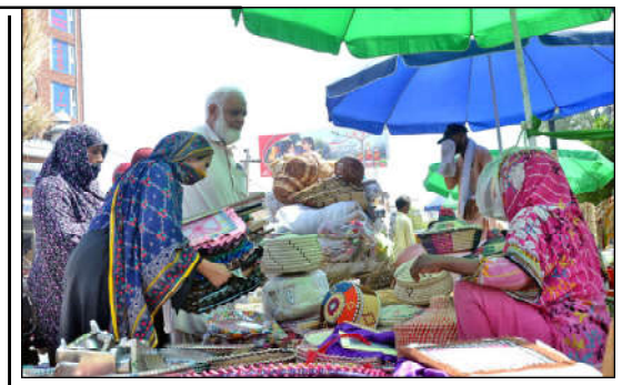
MULTAN: Women purchasing handmade fans from a roadside vendor due to a power outage during hot weather in the city.