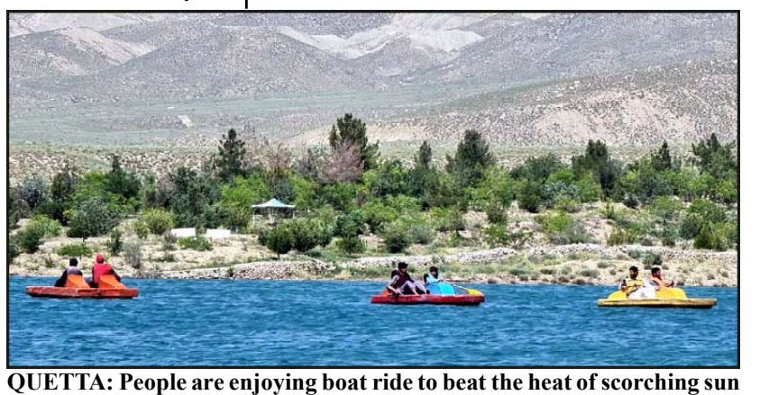
QUETTA: People are enjoying boat ride to beat the heat of scorching sun during a hot day of summer season, at Hannah Lake in Quetta.