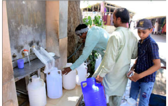
ISLAMABAD: People taking drinking water at a filtration plant installed at Sector II-9 in the Federal Capital.