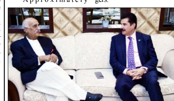
Khyber Pakhtunkhwa Governor Faisal Karim Kundi calls on MNA Syed Khurshid Ahmed Shah in Islamabad.

58,446 passengers were caught travelling without tickets, and the collected fines were deposited in the department's official bank account, they added. They emphasized that crackdowns on ticketless travel are a daily occurrence, and violators are charged for the full journey plus a penalty. Those unable to pay are handed over to the railway police. Over the past year, they said the Pakistan Railway Police arrested 3,923 individuals for various rule and law violations, registering 3,625 cases across the eight railway divisions. They said the case distribution includes 658 in Peshawar, 577 in Rawalpindi, 1,044 in Lahore, 326 in Mughalpur workshops, 393 in Multan, 208 in Sukkur, 346 in Karachi, and 73 in Quetta. The sources said that help desks have been established at all major railway stations to support passengers.