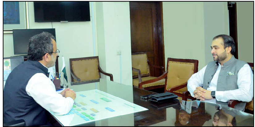
LAHORE: Punjab Minister for Agriculture and Livestock Syed Ashiq Hussain Kirmani meeting with Federal Minister for Water and Power Sardar Awaiz Leghari.

given time to voluntarily reduce prices till Monday, May 27. Bilal Yasin asked the bakery owners to voluntarily reduce the prices of their products and biscuit brands. On Monday, May 27, the final reduction of prices in bakery items will be determined in a meeting with the administration. The food minister said that the administration will ensure the availability of bakery products at low prices across Punjab. He added that the prices of 60 products made from wheat should be reduced systematically.