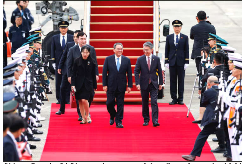
Chinese Premier Li Qiang arrives to attend the trilateral summit with his South Korean and Japanese counterparts in Seoul, South Korea.

Africa, which accused Israel of genocide. But the case was a stark sign of Israel's global isolation, particularly since it began its offensive against Rafah this month against the pleas of its closest ally, the United States. Israeli bombings have left a total of 35,903 Palestinians dead in Gaza and 80,420 injured. The Israeli military said it had carried out "operational activity in specific areas of Rafah" on Friday, including killing Hamas fighters, dismantling part of Hamas's tunnel system, and locating "stash of weapons". Further north in the coastal territory, where the Israeli military says it is trying to prevent Hamas from re-establishing its hold, Palestinian medical workers reported Israeli airstrikes that killed 17 people.