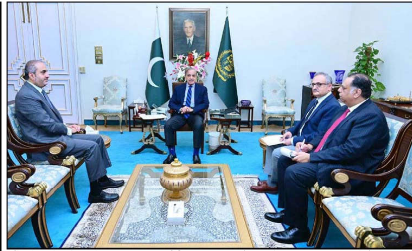
ISLAMABAD: Ambassador of Qatar to Pakistan Amb. Mubarak Ali Essa Al-Khater calls on Prime Minister Muhammad Shehbaz Sharif.

enhancing economic productivity and fostering investor confidence. The experts discussed the future of Pakistan's bureaucracy, focusing on making it more efficient and affordable. Hamza Haroon emphasized reducing bureaucratic roles in city governance, aligning incentives with economic performance, and fostering competition within civil services. Namra Awais highlighted the colonial roots of the current system and advocated for downsizing and modernizing the bureaucracy to better suit Pakistan's complex society. She pointed out inefficiencies in the hiring and skills of Grade 1-16 officers and the lack of job descriptions for Grade 17-22 officers. Rana Muhammad addressed pension system leakages and stressed the need for aligning job responsibilities with perks.