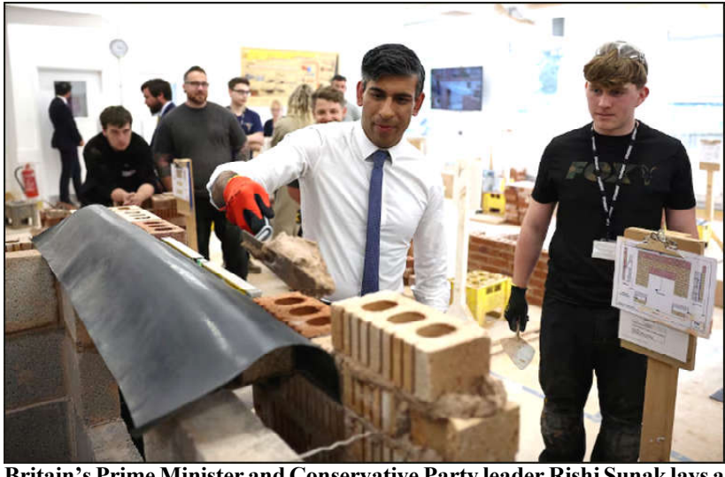
Britain's Prime Minister and Conservative Party leader Rishi Sunak lays a brick during a bricklaying workshop at Cannock College, in Cannock, Staffordshire, Britain.

net minister Benny Gantz said Israel would continue its "just and necessary" war against the Hamas group to return its hostages and ensure its security. Hamas fighters killed some 1,200 people in Israel in the Oct. 7 attack and abducted around 250 more, according to Israeli tallies. Gaza health authorities say more than 35,000 Palestinians have been killed in the Israeli retaliatory offensive which has laid waste to much of the enclave. Israel has rejected South Africa's accusation that it is committing genocide against Palestinians in the Gaza war, arguing that it is acting to defend itself and fighting Hamas. "Israel doesn't care about the world, it acts as if it was above the law because the U.S. administration is shielding it against punishment," said Shaban Abdel-Raouf, a Palestinian displaced four times by the Israeli offensive. "The world isn't yet prepared to stop our slaughter at Israeli hands," said Abdel-Raouf, who was reached by phone.