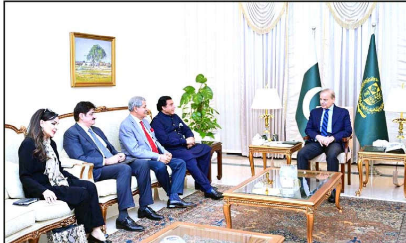
ISLAMABAD: A delegation of Pakistan Peoples Party calls on Prime Minister Muhammad Shehbaz Sharif.

The COAS said that Pakistan has historic, cultural and brotherly ties with Iran and the Armed Forces of Pakistan and Iran have always stood together. General Bagheri thanked the COAS for sharing grief and vowed to continue the cooperation between the two militaries.