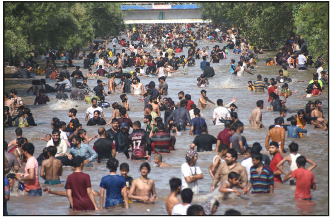
LAHORE: Citizens taking bath in the canal along with their families to protect themselves from the heat wave caused by the increasing load shedding in the provincial capital.