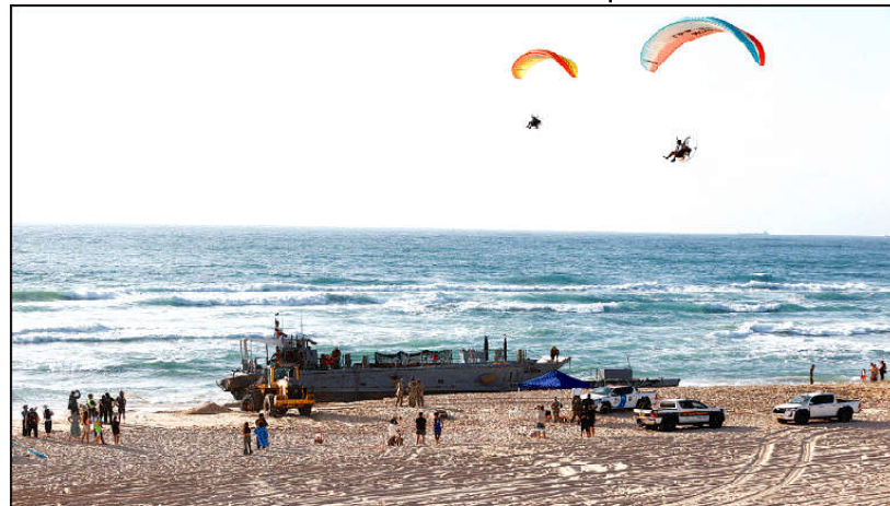
ASHDOD: Paragliders pass above US troops working around vessels used for delivering aid to Palestinians via a new US-built pier in Gaza.

Monitoring Desk TAMPA: Heavy seas battered the US maritime humanitarian mission to Gaza on Saturday, US Central Command (Centcom) said, with four vessels serving a floating aid delivery pier breaking free from their moorings. No injuries were reported and the aid pier remained fully functional, Centcom said in a statement, adding that no US personnel would enter Gaza. Two of the affected vessels were now anchored on the beach near the pier and the other two were beached on the coast of Israel near Ashkelon, Centcom said, adding that efforts to recover the vessels were under way with assistance from the Israeli navy.