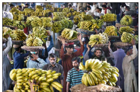
LAHORE: Labourers carrying baskets of bananas on their head during auctions as shopkeepers participating in bidding of fruit (Banana) at Fruit Market in the Provincial Capital.

Sunday. Amid a complex and ever-changing international landscape and energy market dynamics, both China and the Gulf Cooperation Council nations face significant challenges in ensuring energy security and achieving energy transition, said Dong Xiang, deputy director-general of the National Energy Administration's international cooperation department. Headquartered in Riyadh, Saudi Arabia, the GCC is a political and economic union of six Arab states — Bahrain, Kuwait, Oman, Qatar, Saudi Arabia and the United Arab Emirates — that border the Persian Gulf.