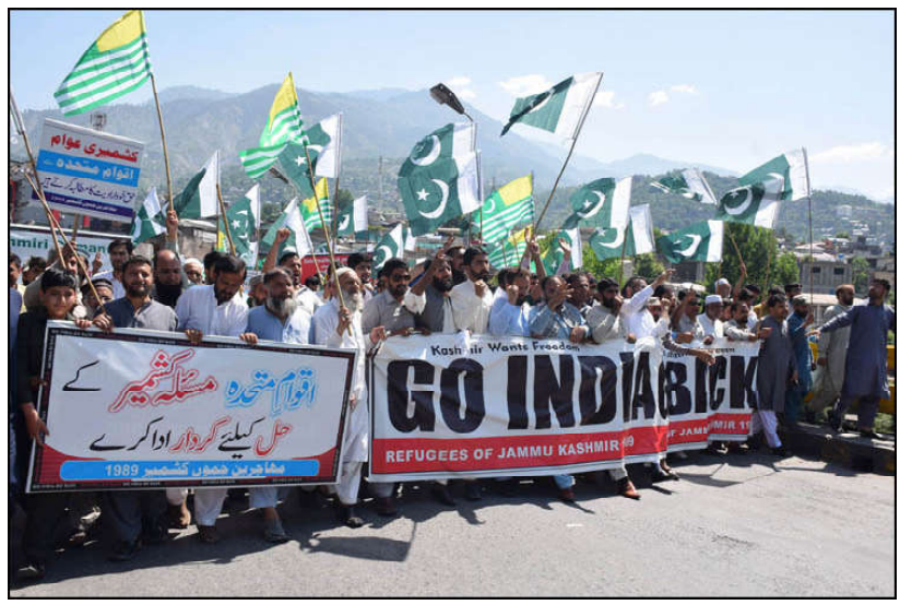
MUZAFFARABAD: Refugees protesting against Indian atrocities in Occupied Kashmir for the sake of independence by raising the flags of Pakistan and Kashmir at Azadi Chowk.

puted based on Form 45. He categorically stated that JI would never recognize a government formed through fraudulent elections, advocating for the restoration of the people's true mandate as reflected in Form 45. There is no need for the fresh election, he said. Regarding government attempts to control social media, Rehman issued a stern warning, condemning measures such as the Punjab Defamation Act aimed at stifling freedom of expression. He asserted that the JI's movement seeks to liberate people from oppressive systems, emphasizing the need for all individuals, including politicians, judges, generals, and bureaucrats.