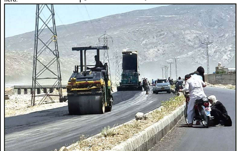
QUETTA: Heavy machineries busy in construction work of road carpeting under the supervision of Provincial Government, at Nawan Kali Bypass road in Quetta.