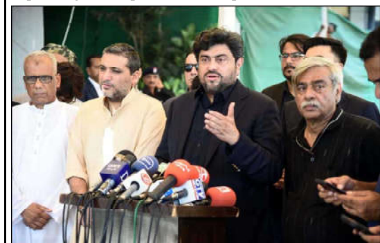
KARACHI: Sindh Governor Kamran Khan Tessori talking to media persons at the residence of late renowned artist Talat Hussain after condoling the death with his son Ashar Hussain.

KARACHI (APP): The Sindh Home Minister Zia ul Hassan Lanjar has announced the launch of "Safe City" project aimed at making Karachi one of the safest cities in the country. The project worth over Rs 3 billion will be completed in two phases with the first phase expected to be completed within 12 months. The minister stated that the project would not only reduce the crime rate but also help eliminate criminal elements. He said that the second phase of the project would focus on expanding the scope of the