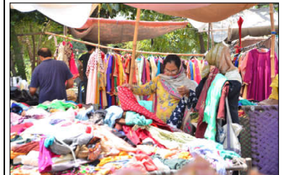
FAISALABAD: Citizen shopping at Sunday market at People's Colony.

business and trade delegation and will stay in Addis Ababa from May 26 th to May 31 st , 2024 for business engagements including participation in the 6 th International Manufacturing Trade Fair, Ethio-Pakistan Business Forum, B2B and B2G meetings, industrial parks visits, and cultural nights. The composition of the 2 nd Business and Trade Delegation to Ethiopia is from across-sector that included agriculture and agro-processing, manufacturing, mining, tourism, ICT, fertilizer, chemicals, construction, pharmaceutical, surgical and other. The objectives of this delegation are to introduce extraordinary business, trade and investment opportunities and incentives in diverse economic sectors of Ethiopia to the delegation and establish a solid connection between the business community of the two countries for further solidifying the Ethio-Pakistan relations.