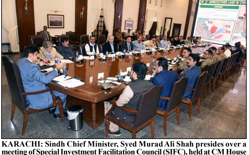
meeting of Special Investment Facilitation Council (SIFC), held at CM House