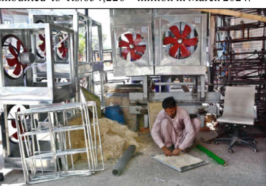
LAHORE: A worker busy in preparing for air room-coolers at his roadside workplace.

On a month-on-month basis, the exports however decreased by 8.56 percent when compared to the exports of Rs. 715,458 million in March 2024.