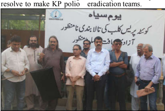
KARACHI: Karachi Union of Journalists and Federal Union of Journalists hold a protest against closure of Quetta press club in the Provincial Capital.

organization appreciated consistent support of Chief Secretary to keep the provincial administration and Law enforcing agencies fully engaged to ensure foolproof eradication teams.