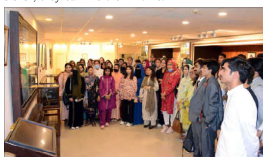
Students of Political Science Department from Islamic International University, Islamabad visiting senate museum at Parliament House, Islamabad

public purposes. The court remarked if single bench decision on one