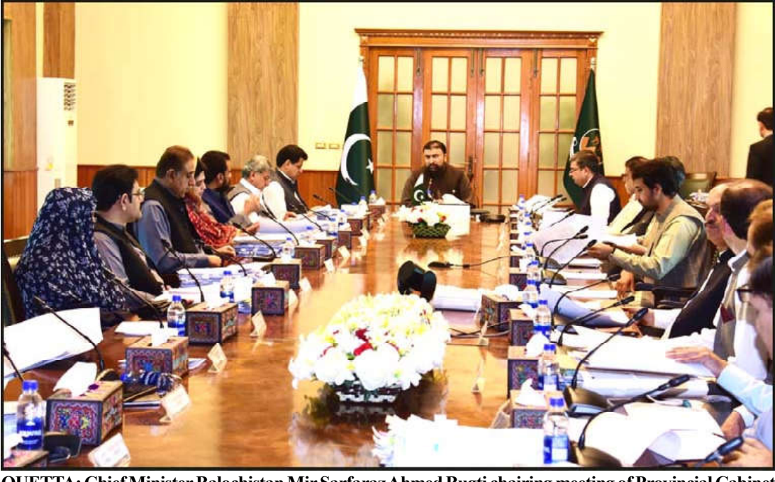
QUETTA: Chief Minister Balochistan Mir Sarfaraz Ahmed Bugti chairing meeting of Provincial Cabinet