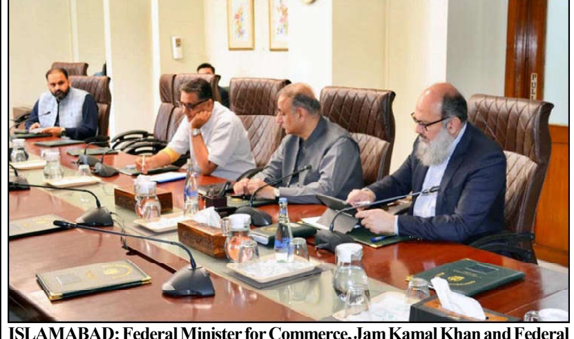
ISLAMABAD: Federal Minister for Commerce, Jam Kamal Khan and Federal Minister for Communication, Abdul Aleem Khan, jointly chairing a cabinet committee dedicated to promoting Pakistani enterprises in global markets.

The NUST research report on the tobacco sector revealed that Pakistan is losing 310 billion rupees annually due to tax evasion in the