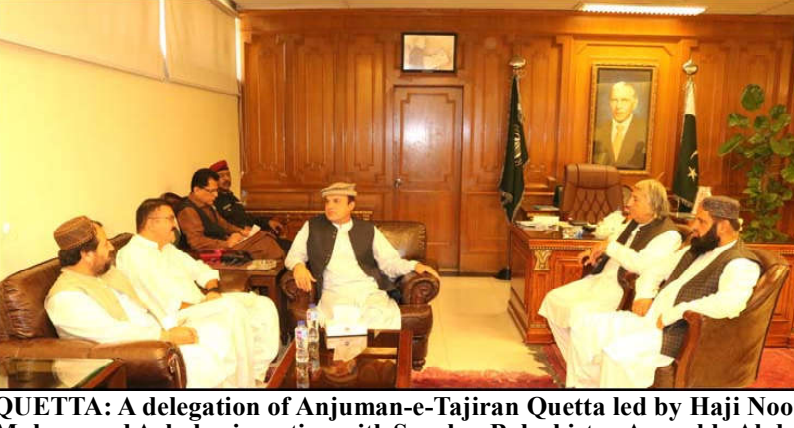
QUETTA: A delegation of Anjuman-e-Tajiran Quetta led by Haji Noor Muhammad Achakzai meeting with Speaker Balochistan Assembly Abdul Khaliq Achakzai.

He also informed the delegation that he had assigned the minister of state Ali Pervez Malik to oversee this task on a dayto-day basis to ensure its timelv completion. Minister