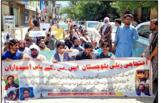
QUETTA: Passed candidates of S-B-K Central Committee are holding protest demonstration for appointment letters, at Quetta press club.

The Patron-in-Chief sserted that red tapism, bribery and extortion affect the ease of doing business. He further stated that issues of ineffective representation of Business Community, deficient business policies and poor implementation, limited with Quetta Chamber of institutional support.