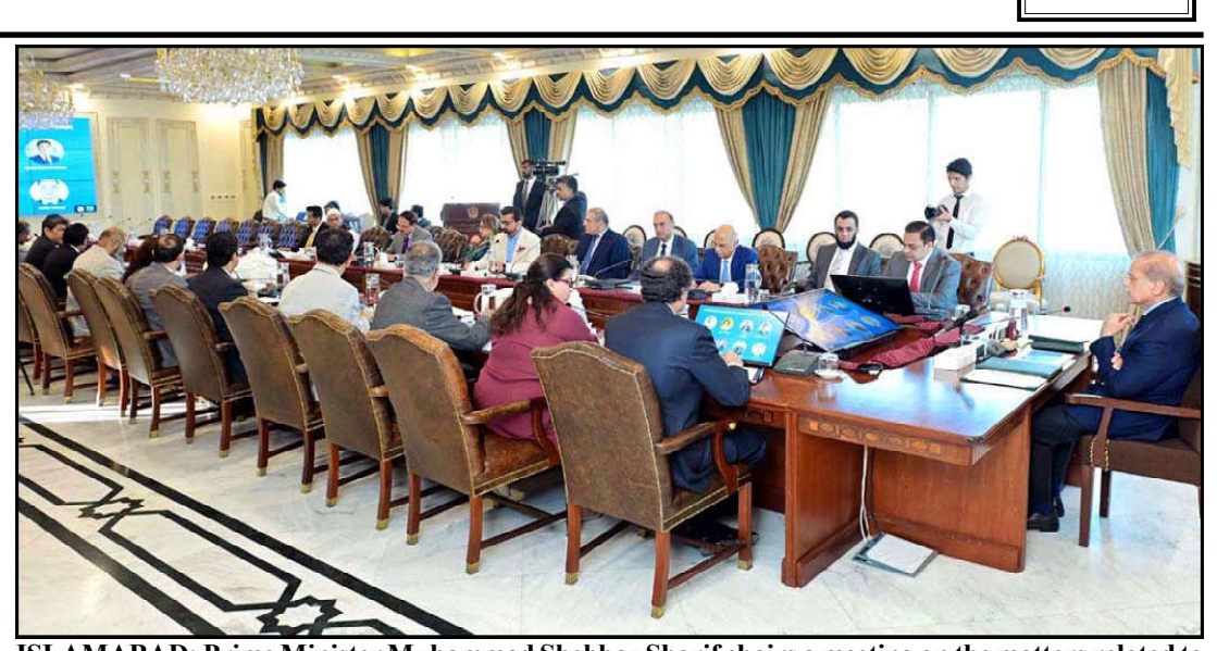
ISLAMABAD: Prime Minister Muhammad Shehbaz Sharif chairs a meeting on the matters related to Ministry of Information Technology and Telecommunications and National Information Technology

In view of increasing temperature and meteorologi-