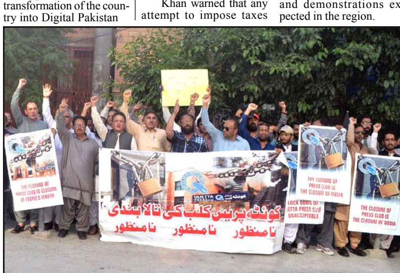
QUETTA: Members of Balochistan Union of Journalists (BUJ) are holding protest demonstration against the locking of press club by the district administration and police, at Quetta press club.

The Mayor's statement comes amid growing resentment among the people of Malakand Division over the proposed taxes. The region has faced government must do more economic hardship for years, and the proposed nomic woes. The people of taxes are seen as an addi-Swat and Malakand Division tional burden on the already Khan's bold stance against the government's policies has been welcomed by the people of Swat and Malakand Division, who see it as a beacon of hope. The issue is likely to gain momentum in the coming days, with more protests and demonstrations ex-