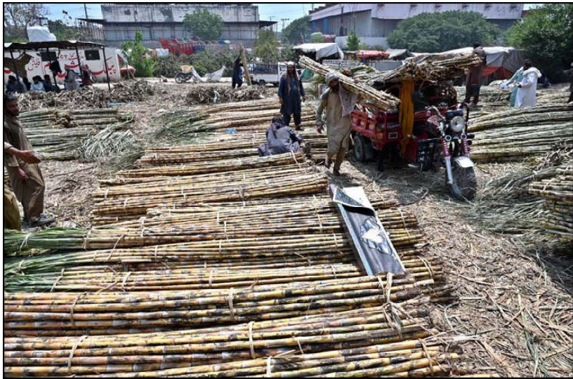
ISLAMABAD: A labourer busy in loading sugarcane on vehicle at Vegetable and Fruit Market.