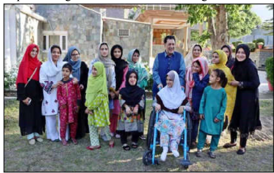
GILGIT: Governor Gilgit-Baltistan Syed Mehdi Shah meeting with the Special Persons of Gilgit-Baltistan at Governor House.

Saudi Arabia for facilitating this program. He also mentioned that private groups, in collaboration with the Ministry of Religious Affairs, are committed to addressing any complaints from pilgrims in Makkah promptly. The "Road to Makkah" initiative has ensured the efficient delivery of goods for millions of pilgrims, he added. Ashrafi urged Pakistani pilgrims to adhere to Saudi regulations and stressed that performing Hajj without proper permission on a visit visa is not permissible. He noted that countries like Saudi Arabia and Kuwait, with the support of Prime Minister Muhammad Shehbaz Sharif and Chief of Army Staff Hafiz Asim Munir, are investing in Pakistan.