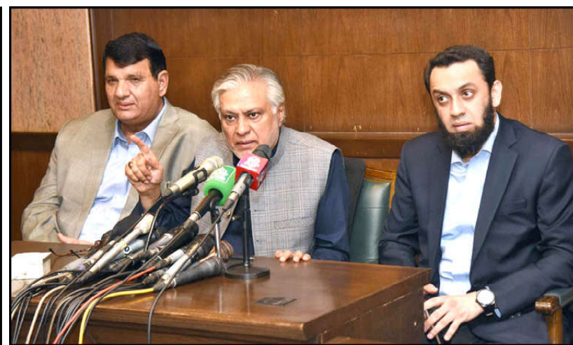
LAHORE: Deputy Prime Minister & Foreign Minister Senator Muhammad Ishaq Dar, Federal Minister for Information and Broadcasting Attaullah Tarar and Federal Minister for Kashmir Affairs & Gilgit-Baltistan Amir Maqam addressing a press conference.

The Levies Force would be equipped with modern arms, ammunition and vehicles on an emergency basis, he expressed these views while addressing the Levies Darbar held in Sanjawi.