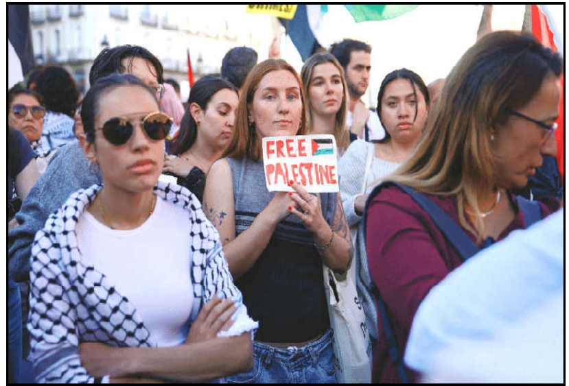
MADRID: A woman holds a placard as people attend a protest in solidarity with Palestinians in Gaza.