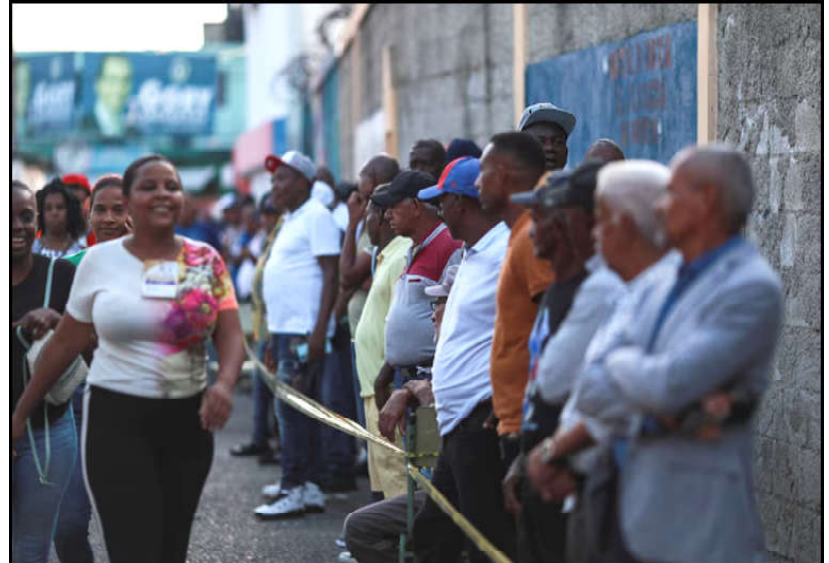
People wait outside a school used as a polling station, to cast their votes, on the day of the presidential election in Santo Domingo, Dominican Republic.