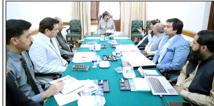
LAHORE: Chancellor/Punjab Governor, Sardar Saleem Haider Khan presided over an important meeting about Attock Campus of Pir Meher Ali Shah Aird Agriculture University Rawalpindi at Governor House Lahore.

students," the CM said. "However, these incidents caused mental stress and suffering for the students and their families," Ali Amin Gandapur said. The safe return of these students to their homes is very important, CM KP added. He said, "For the safe return of these students, a telephonic conversation has been held with the Pakistani ambassador in Kyrgyzstan." "The KP Government will provide all necessary support and facilities for this purpose," Ali Amin Gandapur said. "The KP government is ready to bear all the expenses for the return of these students," the CM further added. "The safe repatriation of these students is a shared responsibility that requires your continued and focused efforts," Ali Amin Gandapur told the Kyrgyzstan Ambassador.