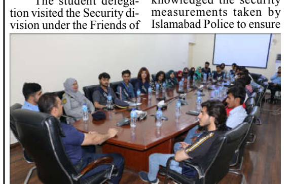
Police Program. The SSP Security fully briefed the delegation about the procedures and advantages of the Security division.

Later, the delegation also visited the CCTV control room, police mess, stable, and diplomatic enclave. Moreover, delegation was fully informed about their procedure and usefulness, patrolling of police in High Security Zone and the performance and utility of the police that are playing an important role in the security of the High Security Zone, security of VVIP/VIP foreign dignitaries, national VIPs, important buildings situated in High Security Zone and protection of life and property of citizens. The delegation acknowledged the security measurements taken by Islamabad Police to ensure