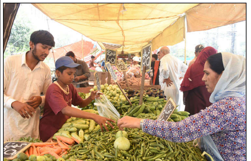
LAHORE: Consumers buying vegetables and fruits at Shadman Sunday market in the provincial capital.