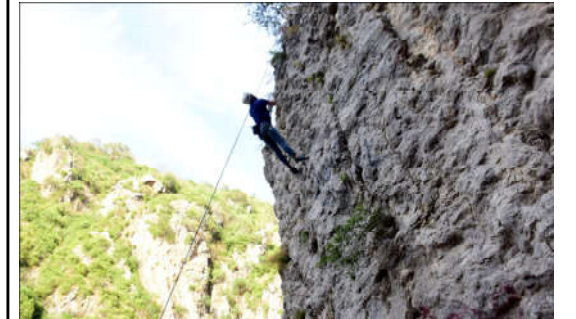
ISLAMABAD: A young man climbing a mountain in the area of Shahdara in the Federal Capital.