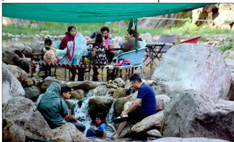
ISLAMABAD: Families enjoying on holiday at Shahdara picnic point in the Federal Capital.