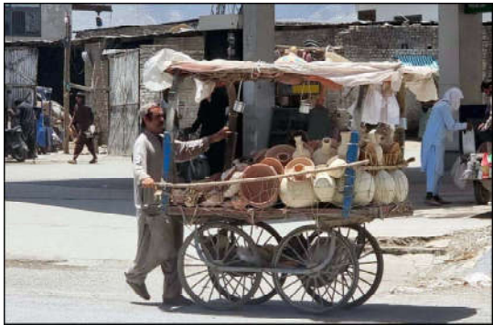
QUETTA: Vendor sells handmade clay pots to earn his livelihood for support his family, on his pushcart at roadside located on Double road in Quetta.

General Secretary Irfan reiterated the union's dedication to serving workers and committed to utilizing all available resources for the institution's development.