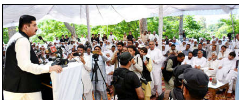
PESHAWAR: Khyber Pakhtunkhwa Governor Faisal Karim Kundi addressing public gathering at Dargai during his visit to Malakand.