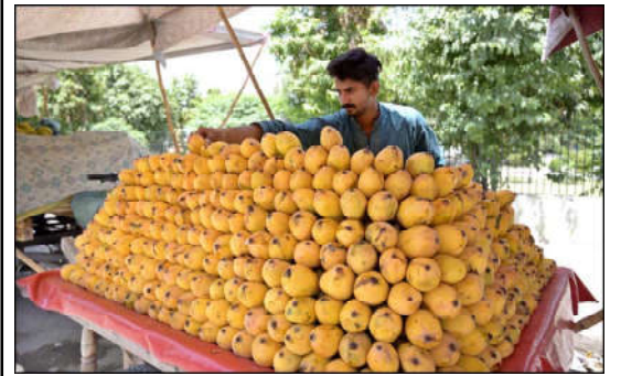
SARGODHA: A vendor arranging and displaying mangoes on his cart to attract the customers.

The spokesperson also clarified that some elements are linking a letter written by the federal government to prevent smuggling of various items with the transportation of wheat, which is based on a complete misunderstanding. He said that in the light of the instructions of the federal government and the Punjab home department, letters were written for the appointment of vigilant and honest staff at all check posts to stop smuggling of various items. However, delivery, purchase and sale of wheat and inter-provincial and inter-district transport are fully permitted. The staff posted at the check posts will keep a record of wheat delivery as per their