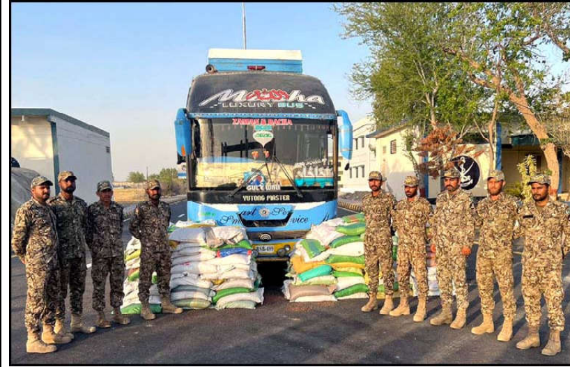
HUB: Pakistani Coast Guard Officials are exposing huge quantity of recovered Chew Tobacco and betel nuts (Supari/Chaliya) seized during checking of passenger buses on Uthal Coast Guard Check Post, to media persons.

KARACHI (INP): Former federal minister Mushahid Hussain Sayed has said that the political instability will not bring economic stabilization in country. Talking to media here Mushahid Hussain, a former senator, said that the absence of political stability will hinder the investment from abroad. He urged for a consensus in all political forces for the sake of political stability in the country.