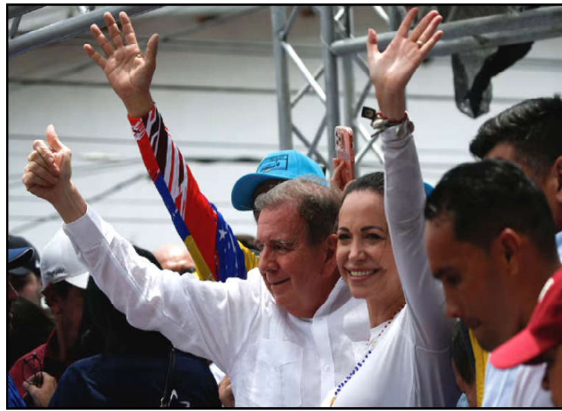
Venezuelan opposition leader Maria Corina Machado and opposition presidential candidate Edmundo Gonzalez wave during a rally in La Victoria, Aragua State, Venezuela.

ment under which Saudi Arabia would recognise Israel in exchange for a stronger security relationship with Washington, which is already its most important security partner. The Saudis are also bargaining hard for help developing a civilian nuclear programme. Last September, before Hamas's October 7 attack on Israel that sparked the conflict in Gaza, Prince Mohammed said in an interview with the US network Fox News that "every day we get closer" to a deal to normalise ties. But those efforts have been severely damaged by the more than seven months of fighting in Gaza and the rising civilian toll there.