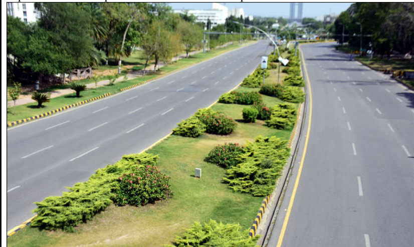
ISLAMABAD: A view of deserted roads of Federal Capital due to intense heat.

ISLAMABAD (APP): Foreign and domestic tourists are thronging to Kaghan-Naran after the reopening of the road to enjoy their trips at recreational spots of the scenic valley. Talking to APP, a Pakistan Tourism Development Corporation (PTDC) official said the Kaghan Development Authority (KDA) has reopened the Kaghan Highway for all kinds of commuters.