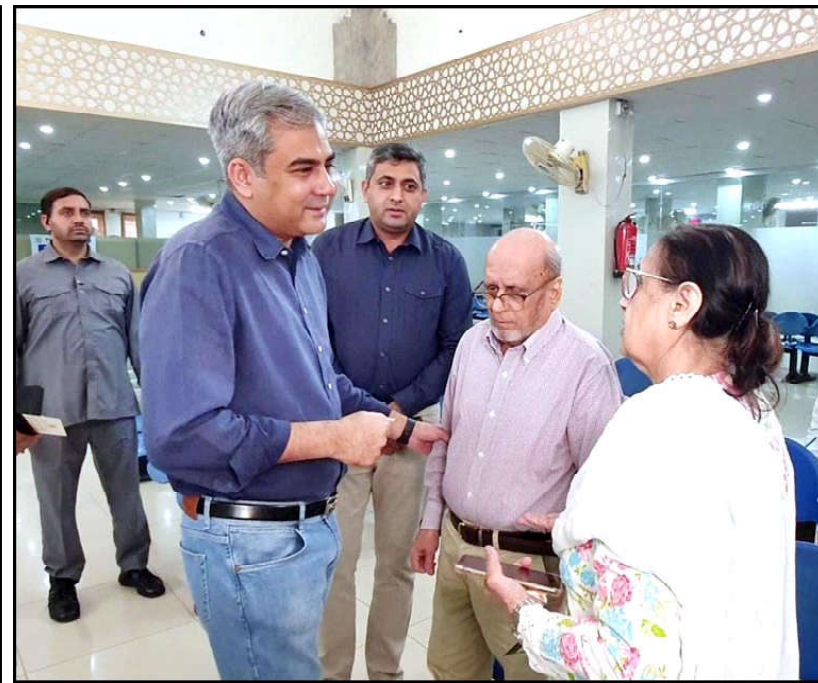
LAHORE: Interior Minister Mohsin Naqvi visiting NADRA Center, Garden Town.

Pakistan's active role at the United Nations, including its presidency of the UN Economic and Social Council (ECOSOC), as non-permanent member of the Security Council and as chairman of the Grouping of G-77 and China. As the second-time President of the ECOSOC in 2021, he said Pakistan played a leading role in advocating the concepts of vaccine equality, and the creation of new money for the developing countries enabling them to fight off the impact of Covid-19, an effort that led to restructuring of debt and suspension of interest payments by G-20, thus providing a substantial relief to the developing world, including Pakistan. "Likewise, the establishment of the instrument of Special Drawing Rights (SDRs) of $650 billion by the IMF led to the provision of additional resources to the developing countries in navigating the economic challenges," the Pakistani envoy said.