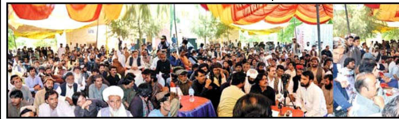
SANJAVI: Provincial Food Minister Haji Noor Muhammad Khan Dummar and Deputy Commissioner Liaquat Ali Kakar addressing a Khuli Kutchery

"We believe that social justice, political stability and supremacy of law is imperative for progress and prosperity of the country", he added. Replying to a question, he said that the incumbent government is also committed to encourage the neighboring countries to exploit favorable and business-friendly atmosphere in Pakistan. He said that Pakistan has capacity to attract all the foreign investments in different sectors to boost the economy and gradually the country will emerge as an economic power in the world. To another question, he said Pakistan is in dire need of political and economic stability at this point of time, adding, all the political parties must have to develop a mutual consensus on national interests.