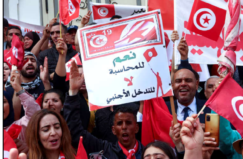
Supporters of Tunisian President Kais Saied carry flags and signs during a demonstration to show their support for him and to reject what they say is "foreign interference", in Tunis, Tunisia.

Many, including Germany, Sweden, Canada and Japan, had since resumed funding, while others have continued to hold out. "After analysing the action plan in detail" submitted by UNRWA "to improve the functioning of the organisation", Austria has decided to "release the funds," its foreign ministry said in a statement. A total of 3.4 million euros ($3.7 million) in funds have been budgeted for 2024, and the first payment is expected to be made in the summer, the statement said.