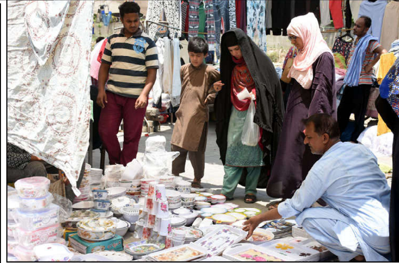
LAHORE: Consumers buying household items at Shadman Sunday market in the provincial capital.