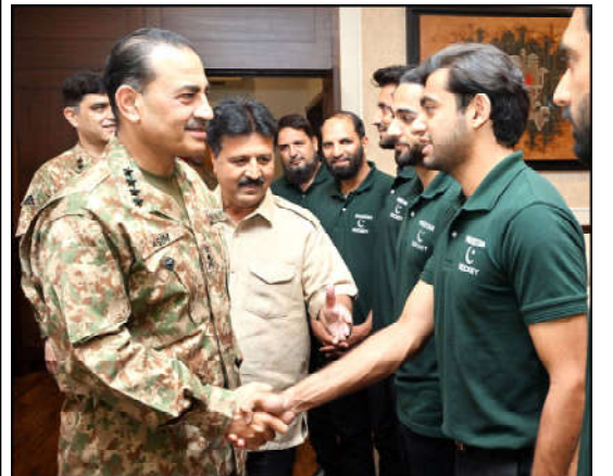
RAWALPINDI: Chief of Army Staff (COAS) General Syed Asim Munir, shake hand with the player of Pakistan Hockey team at General Headquarters in Rawalpindi.