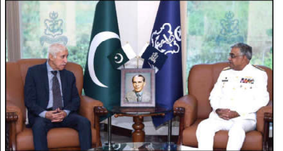
Headquarters, Islamabad and called on Chief of Naval Staff Admiral Naveed Ashraf. During the meeting, professional matters of mutual interest and Pakistan Navy's role in regional maritime security and Indian Ocean region came under discussion, said a press release.

ISLAMABAD (APP): Federal Minister for Maritime Affairs Qaiser Ahmed Sheikh on Friday visited Naval