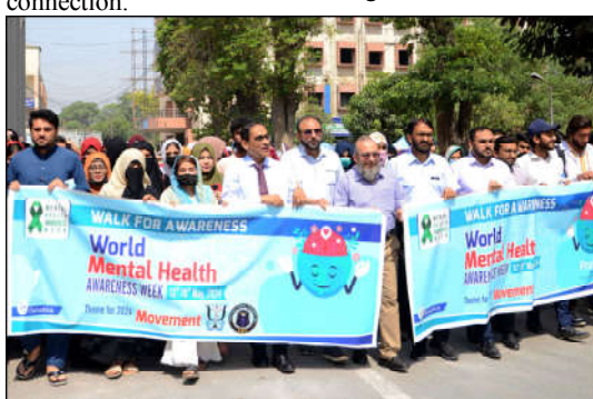
FAISALABAD: Participants hold a banner during awareness walk on the eve of World Mental Health Day at Allied Hospital in the city.

According to Kalam elders, over 100 traffic incidents have occurred on the incomplete road, resulting in loss of life and injuries. Despite assurances from the Prime Minister, Chief Minister, and other relevant departments, the project remains unfinished, and the approved funds have not been utilized. The elders appealed to both the provincial and federal governments to take immediate action and announce the road tender within a week. If the deadline is not met, they warned of escalating protests, including closing hotels and roads and prohibiting government officials from entering Kalam.