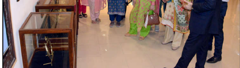
Students and Faculty members of Lahore College for Women University visiting Senate Museum at Parliament House, Islamabad.