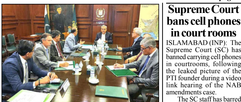
ISLAMABAD: Federal Minister for Interior Mohsin Naqvi chairing a meeting at NADRA headquarters.