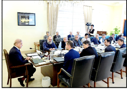
ISLAMABAD: A delegation of international beverage manufacturing companies met Prime Minister Shehbaz Sharif