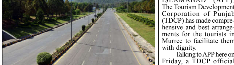
ISLAMABAD: A view of deserted 7th Avenue due to hot weather in the Federal Capital.