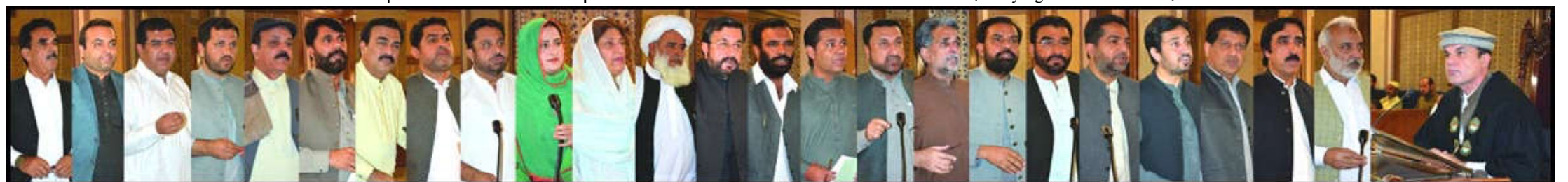
QUETTA: Provincial Ministers and MPs expressing their views on the resolutions presented in Balochistan Assembly

ISLAMABAD (APP): The Supreme Court of Pakistan on Friday served show-cause notice to Senator Faisal Vawda and Muttahida Qaumi Movement (MQM)'s leader Mustafa Kamal and summoned them in person on the next hearing in a suo-moto case about remarks against judiciary. The court directed the politicians to clarify that why a contempt of court proceedings shouldn't be initiated against them on controversial remarks about judiciary. A three-member bench, headed by Chief Justice Qazi Faez Isa and comprising Justice Naeem Afghani and Justice Irfan Saadat Khan, heard the suo-moto case on a press conference of Senator Faisal Vawda and remarks by Mustafa Kamal. During the hearing, the chief justice sought the details of the press conference of Faisal Vawda and also inquired from the additional attorney general whether the content of media talks did come under contempt.