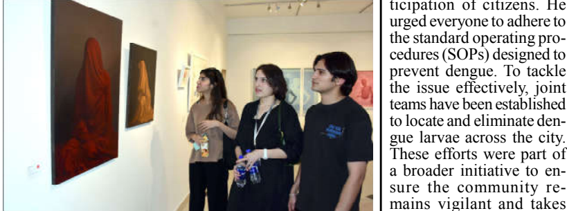
ISLAMABAD: Visitors take keen interest in a painting during paintings exhibition of different artists Gellry-6 in the Federal Capital.

Over the course of the program, more than 18,056 medical examinations and 1,633 surgeries were successfully conducted. Furthermore, 3,116 pairs of corrective glasses were distributed, along with prescribed medications, ensuring comprehensive care for all patients.