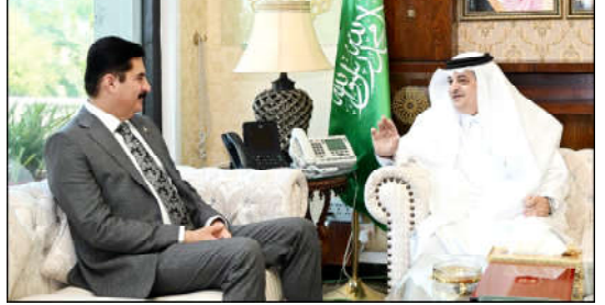
During the meeting, investment opportunities in different sectors in Khyber Pakhtunkhwa came under discussion. The Saudi ambassador congratulated Faisal Karim Kundi on assuming the office of Khyber Pakhtunkhwa Governor and expressed best wishes to him. Khyber Pakhtunkhwa Governor said that relations between the two brotherly countries were deep-rooted and people of both countries were connected in a strong bonds of religious, culture and historical values.

Faisal Karim Kundi said Saudi Arabia's investment in different sectors in Pakistan would significantly help bring economic stability in the latter, saying KP is blessed with an abundance of natural resources and there is a lot of opportunities for investors of the friendly countries to make investment in Pakistan including KP.