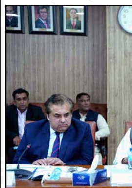
ISLAMABAD: Federal Minister for Privatisation, Board of Investment and Communications Abdul Aleem Khan presiding over a meeting of "Ease of Doing Business".

Cargo volume of 135,189 tonnes comprising 118,226 tonnes imports cargo and 16,963 tonnes export cargo.