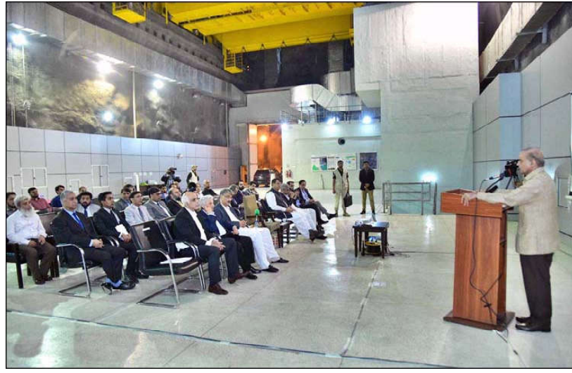
MUZAFFARABAD: Prime Minister Muhammad Shehbaz Sharif addresses at Neelum-Jhelum Hydro Power Project.

He also directed the Water and Power Development Authority (WAPDA) and NJHP Company to complete the repair work of the tunnel at the earliest and resume generation. The prime minister appreciated the WAPDA chairman and his team for their efforts to repair the fault in the tunnel and resumption of generation last year.