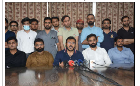
LAHORE: Activists of Young Doctors Association holding a press conference for their demands in the Provincial Capital.