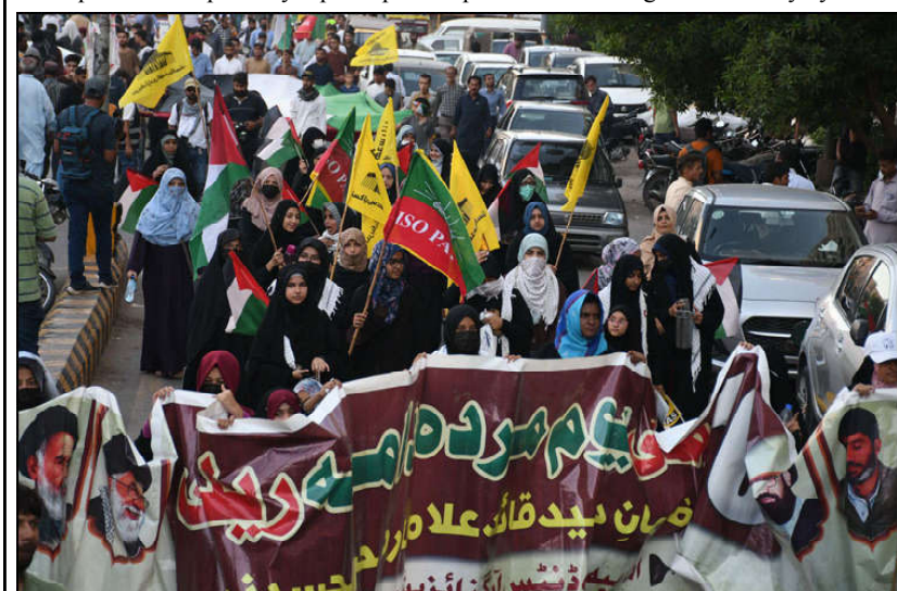
KARACHI: Pakistani Shiite Muslim protesters shout anti-Israeli slogans, marking the 76th anniversary of Nakba of what the Palestinians call the "Nakba" or "catastrophe," referring to their uprooting in the war over Israel's 1948 creation, during a protest in Karachi.