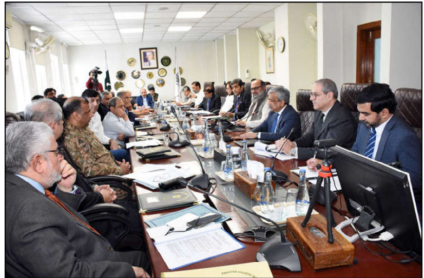
ISLAMABAD: Federal Minister for Commerce Jam Kamal Khan chairing a high level meeting to address pressing issues in Pakistan's export and business sectors.