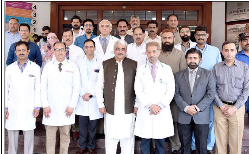
LAHORE: Punjab Health Minister Khawaja Salman Rafique in a group photo with Vice Chancellor and Faculty Members after inauguration of the Store Management System (SMS) at Mayo Hospital.

RAWALPINDI (APP): Anti-Narcotics Force (ANF) while conducting five operations across the country managed to recover 32 kg drugs and arrested four accused, said an ANF Headquarters here on Thursday. He informed that 320 grams Ice was recovered from a parcel booked for Italy at a courier office in Rawalpindi. Twelve kilogram hashish was recovered from an accused rounded up in Hayatabad Peshawar while 9.6 kg hashish was recovered from a drug smuggler netted near Lakeview Park Islamabad.