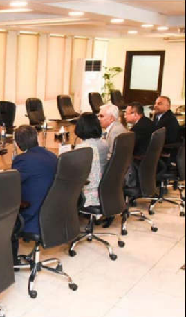
ISLAMABAD: MD SIDB directs revival of skilled imparting centres.

The price of 10 grams of 24 karat gold also increased by Rs 1,371 to Rs 210,562 from Rs 209,191 whereas the prices of 10 gram 22 karat gold went up to Rs 193,016 from Rs 191,758, the All Sindh Sarafa Jewellers Association reported.