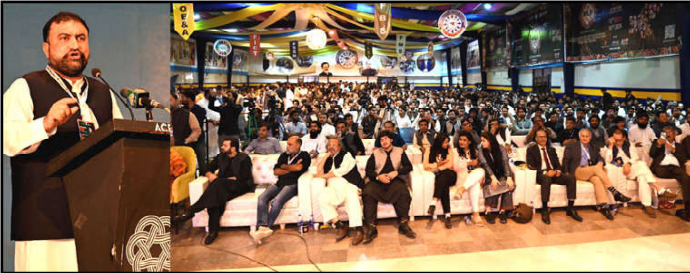
QUETTA: Balochistan Chief Minister Mir Sarfraz Bugti addressing participants of concluding ceremony of Pakistan Literary Festival at BUITEMS

Ph: 2841470/2841473 REG: No. BC-116 B/ID-445 Vol XXV No. 266, Zeeqad 08, 1445 AH Friday May 17, 2024 Pages 08, Price Rs.15