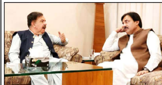
QUETTA: Deputy Chairman Senate Saydal Khan Nassar meeting with Governor Balochistan Sheikh Jaffar Khan Mandokhail

The Governor said that the Programme of Prime Minister about imparting skills to the new generation is excellent.