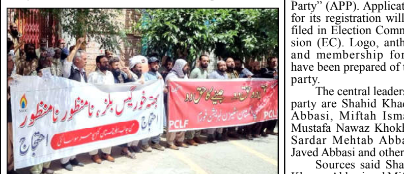
QUETTA: Members of Pakistan Citizen Liberation Forum are holding protest demonstration against price hike of essential commodities and inflation, at Quetta press club.

Sources said Shahid Khaqan Abbasi and Miftah Ismail along with other members will announce name of new party and its future strategy today in