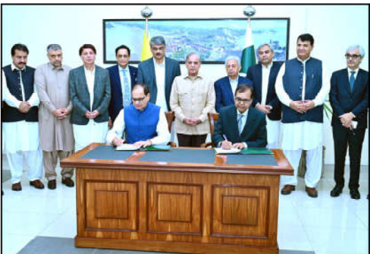
MUZAFFARABAD: Prime Minister Muhammad Shehbaz Sharif witnesses the signing of a Memorandum of Understanding between the Government of Pakistan and the Government of Azad Jammu and Kashmir with regard to 960 MW Dudhial Hydropower Project.

The Chief Minister assured the members of delegation to provide suitable opportunities to the youngsters for provision of other veterinary services by formulating effective policies in the province.