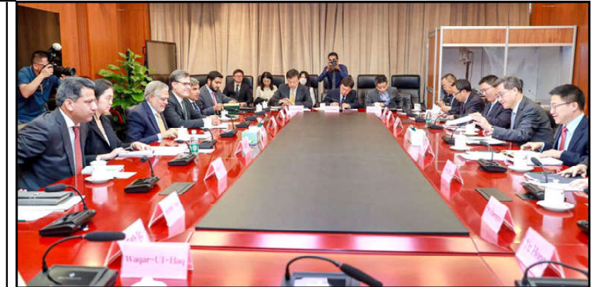
BEIJING: Deputy Prime Minister and Foreign Minister Senator Mohammad Ishaq Dar meets with the Minister of Finance of the People's Republic of China Lan Fo'an.

incidents in 2023, while 358 citizens lost their lives and 700 sustained wounds. The report highlighted the worsening law and order situation in the country specially in KP, where 858 terror attacks were reported that claimed lives of 402 security personnel and 178 civilians. As many as 148 security personnel were martyred and 198 were injured in 626 terror attacks in Balochistan during the past year.