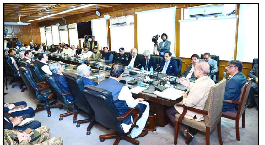
MUZAFFARABAD: Prime Minister Muhammad Shehbaz Sharif addresses the meeting of the Cabinet of Azad Jammu and Kashmir.