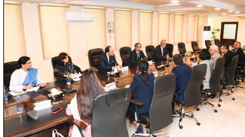
ISLAMABAD: The federal Minister for Finance & Revenue Senator Muhammad Aurangzeb was called on by Alternate Executive Directors (AED) of Asian Development Bank (ADB) at Finance Division.

Pakistan's efforts for financial and economic stability and business friendly policies. Ishaq Dar particularly noted the stellar performance of Pakistan Stock Exchange and renewed confidence of international investors in Pakistan's economy. The Foreign Minister appreciated EXIM Bank's robust support for important development projects in Pakistan.