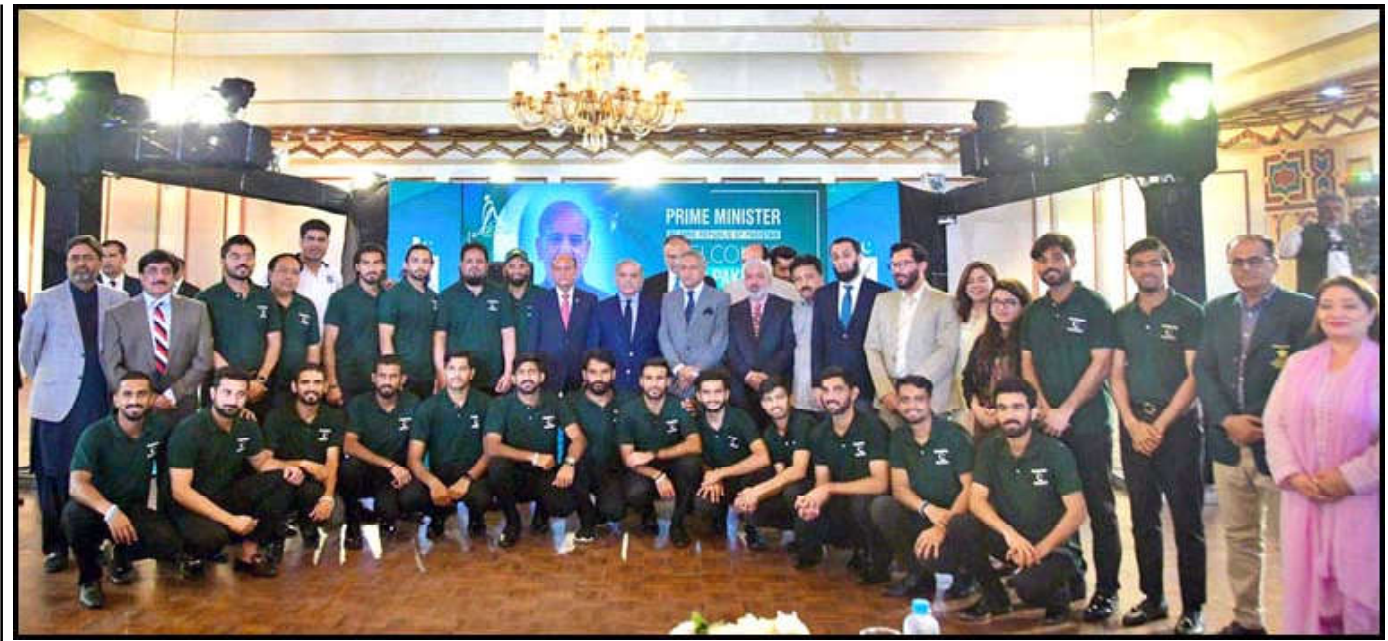
ISLAMABAD: Prime Minister Muhammad Shehbaz Sharif in a group photo with Pakistan Hockey Team.