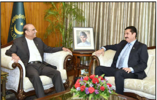
ISLAMABAD: Governor Khyber Pakhtunkhwa Faisal Karim Kundi called on President Asif Ali Zardari at Aiwan-e-Sadr.