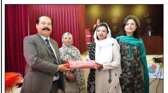
ISLAMABAD: NDMA handed over school safety kit to Islamabad Model School for Girls on account of School Safety Day.

In recent years, China has been actively promoting the integration of digital technologies across various industries.