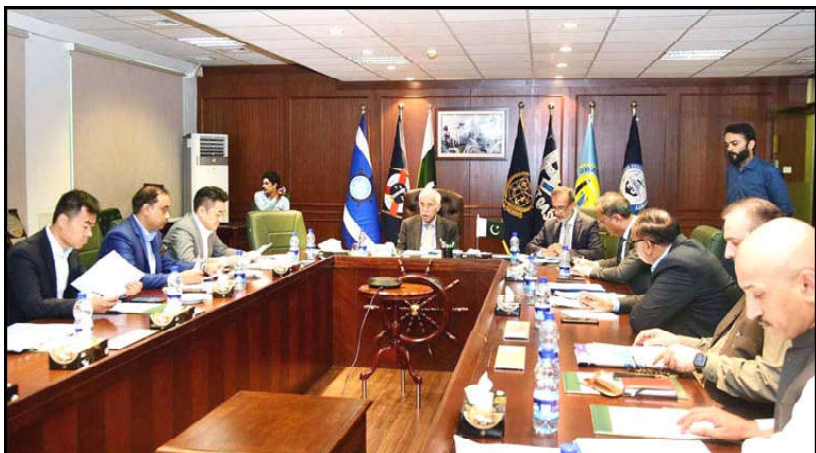
ISLAMABAD: Federal Minister For Maritime Affairs Qaiser Ahmed Sheikh chairs a meeting regarding exemption from Import/Export Policy order and foreign currency issues for Gwadar Zone.

nese businessmen could enjoy preferential market access to major economies such as the European Union, Gulf, China itself and other countries which have free trade agreements with Pakistan, he added. He said that there are competitive and lucrative incentives especially in special economic zones, export processing zones, Gwadar free zone, and special technology zones. These are the four areas where the Chinese businessmen could set up business with special fiscal and economic incentives, he maintained. The deputy prime minister highlighted that the process of privatising certain state-owned enterprises could also be looked into from the business point of view.