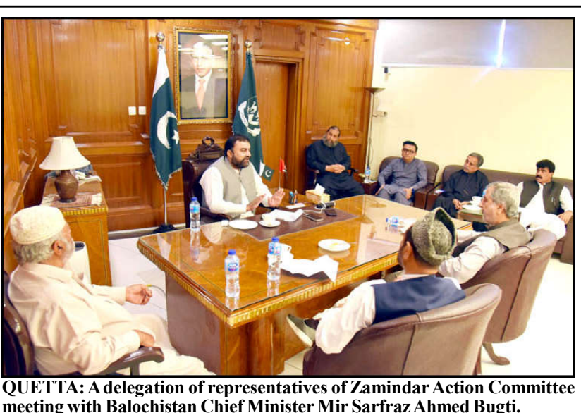
meeting with Balochistan Chief Minister Mir Sarfraz Ahmed Bugti.