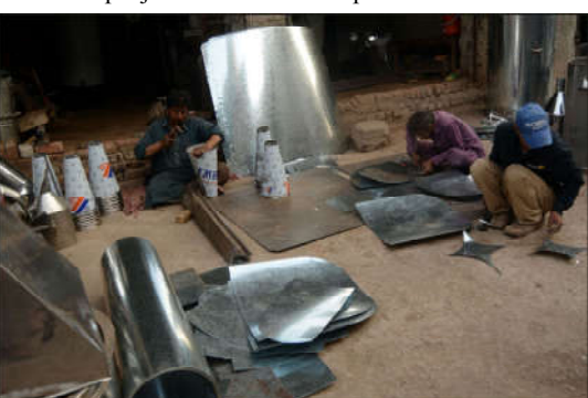
LAHORE: Workers busy in preparing iron containers for the storage of wheat to the customers at their workplace.

Federal Minister for 3,200-meter-long tunnel will be constructed as part of the project. The minister expressed hope that the project's timely completion will help alleviate the electricity load-shedding crisis in the district and surrounding areas. The minister also praised the project as a wonderful gift from former Prime Minister Nawaz Sharif to the people of Hunza district. He assured that the federal government would provide all possible assistance for the project's completion.