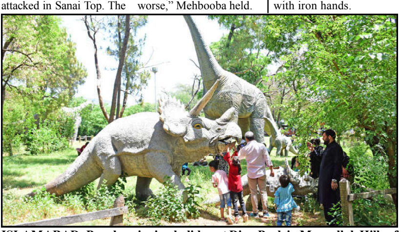
ISLAMABAD: People enjoying holiday at Dino Park in Margallah Hills of the Federal Capital.

DIG Operations said that the Islamabad Police is taking all possible steps to eradicate the crime from the city and those involved in property crimes and illegal activities will be dealt with iron hands.