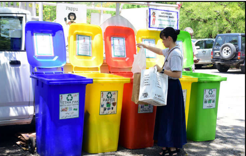
ISLAMABAD: A foreigner women putting garbage of different kinds at a smart waste management setup at Hiking Trail in the Federal Capital. According to estimates the number of plastic products and waste will triple by 2060, while the recycling rate will only see a slight increase.

"Our goal is to promote climate action. Pakistan is the best opportunity for us to work together to protect nature, whereas further meetings are under-