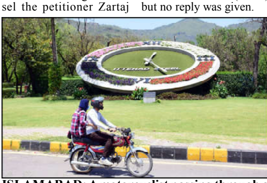
ISLAMABAD: A motorcyclist passing through a "Floral Clock" at Margallah Road in the Federal

According to counsel application was given to interior secretary on March 13 for removal of name from Provisional National and Identification List (PNIL) but no reply was given.