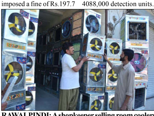
RAWALPINDI: A shopkeeper selling room coolers in Kashmiri Bazaar, ahead of intense hot weather

2034 consumers were found involved electricity theft and they were handed down with a fine of Rs.195.9 million for 4088,000 detection units.