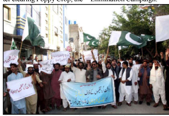
QUETTA: Members of Awami Tahafuz Movement are holding rally in favor of Pakistan Armed Forces, at Quetta press club.

the forces reached Gulistan Karez, it was ambushed by armed tribesmen with, Light Machine Guns (LMGs) and Rocket Launchers (RLs). The convoy came under heavy fire from adjacent heights due to which 6 Security Forces personnel got injured who were shifted to CMH Hospital Quetta for a treatment. It is important to emphasize that poppy cultivation, as per the CNS Act 1997, is a criminal offense. Despite facing challenging weather conditions, the forces demonstrated exceptional courage and determination, ventured into farflung areas to execute the operations like the Poppy Elimination Campaign