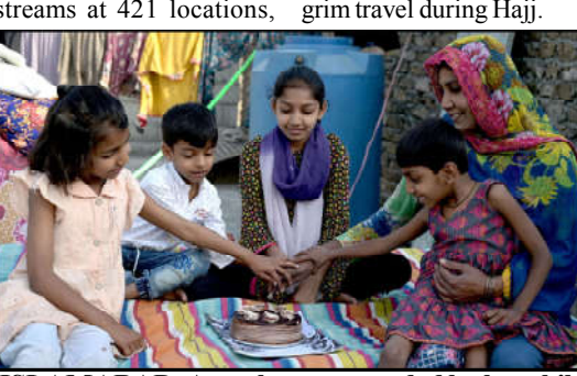
ISLAMABAD: A mother surrounded by her children, cutting a cake together to celebrate Mother's Day, a heartwarming tribute to the love and bond

The tour included key routes like the Riyadh-Taif highway, linking the capital with Taif, and the Taif Al-Sail road, crucial for pilgrim travel during Haii