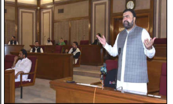
QUETTA: Balochistan Chief Minister Mir Sarfraz Bugti talking during Balochistan Assembly session.