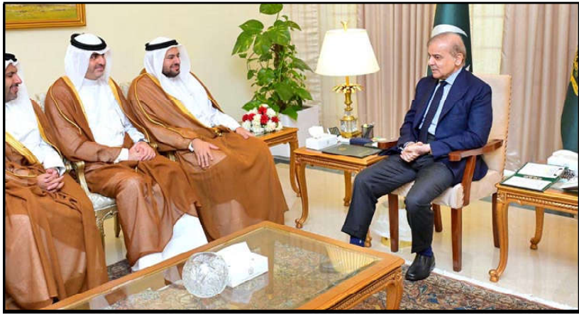
ISLAMABAD: Minister of State for Foreign Affairs of the State of Qatar H.E. Dr. Mohammed bin Abdulaziz Al-Khulafai calls on Prime Minister Muhammad Shehbaz Sharif.

He said that May 9 would undoubtedly remain a black day in the history of Pakistan when deliberately indoctrinated and insidiously guided miscreants attacked the symbols of the state and national unity, disgracefully desecrating the Shuhada (martyrs) monuments.