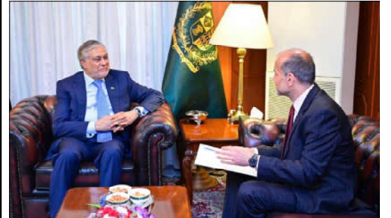
Ambassador of Switzerland, Georg Steiner called on the Deputy Prime Minister and Foreign Minister Senator Mohammad Ishaq Dar at Ministry of Foreign Affairs Islamabad

agement signed between the two countries last year, the deputy prime minister hoped that it would foster greater cooperation between the two sides, enabling them to utilize technology and expertise to address natural calamities in the future. Regional dynamics and multilateral issues were also discussed in the meeting. Ishaq Dar also appreciated Switzerland's role in the multilateral arena as well as the country's contributions to humanitarian and peace-building efforts. Pakistan and Switzerland have close relations marked by regular interactions. The Swiss Foreign Minister visited Pakistan last July and Bilateral Political Consultations were held in January this year.