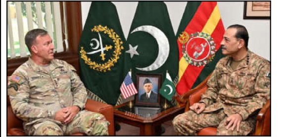
RAWALPINDI: Commander of the USCENCOM General Michael Erik Kurilla called on Chief of Army Staff General Syed Asim Munir at the General Headquarters.