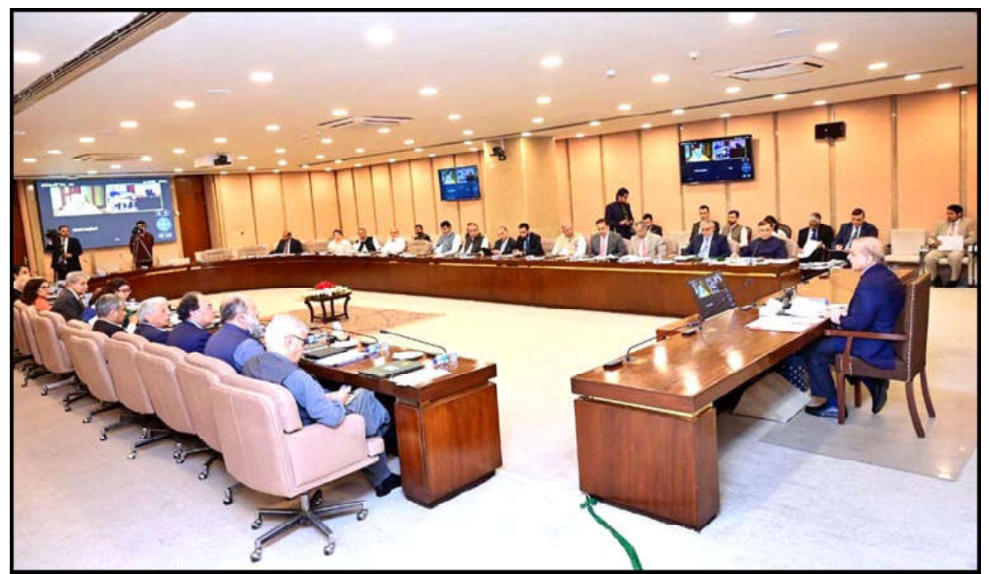
ISLAMABAD: Prime Minister Muhammad Shehbaz Sharif chairs a special meeting of the Federal Cabinet.

Besides, she said the OIC Contact Group on Jammu and Kashmir was the only OIC contact group that met on the sidelines of the Islamic Summit, reflecting OIC's strong solidarity with the people of Jammu and Kashmir and their right to self-determination.