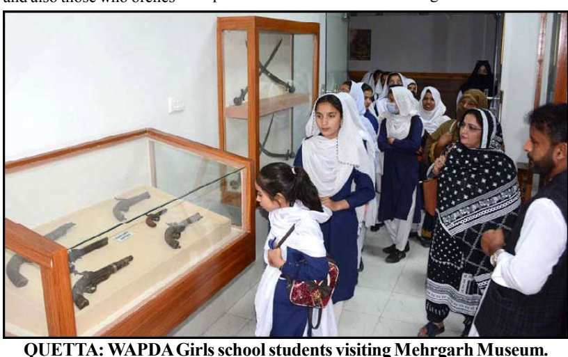
QUETTA: WAPDA Girls school students visiting Mehrgarh Museum.

It has a great opportunity for Pakistani businesses to provide their services in China to companies because our cost is very low. Recently, Huawei has shifted its global support unit to Pakistan which employs almost 3000 Pakistani engineers.