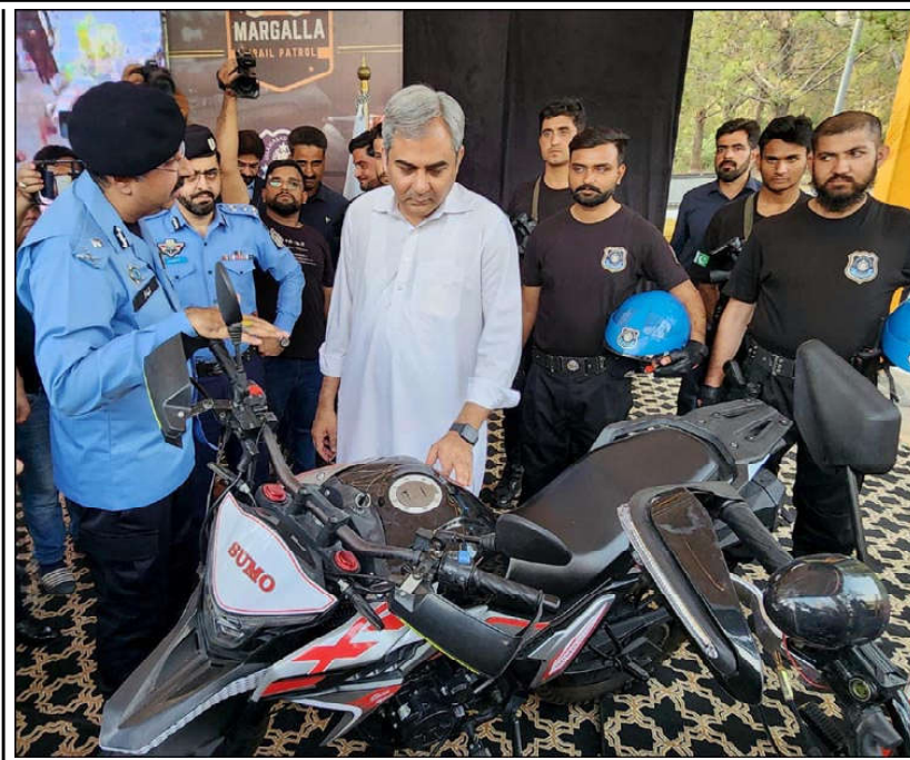
Federal Minister for Interior Mohsin Naqvi inaugurating ICTP Margalla Patrol Unit in Islamabad