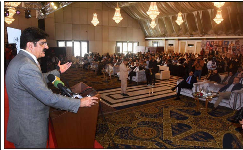
KARACHI: Sindh Chief Minister Syed Murad Ali Shah addressing the Peace Conference organized by Information Department Sindh.

According to the data, 1,200 motorbikes, 75 auto-rickshaws, 135 motorcars, 20 vans, seven passenger buses, 35 truck and 102 other types of vehicles and slow-moving carts were involved in the road accidents.