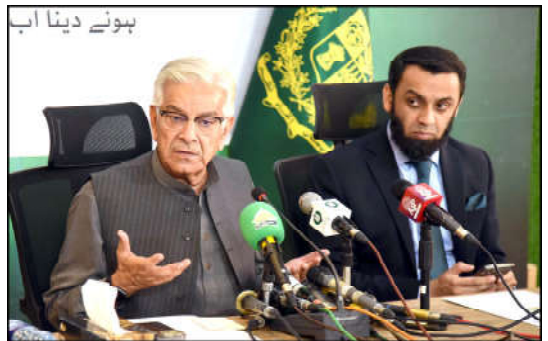
ISLAMABAD: Federal Minister for Defence Khawaja Asif addressing a press conference along with Federal Minister for Information and Broadcasting Attaulah Tarar, in the Federal Capital.

A ship of the Pakistan Navy responded in time to an emergency call from a fire-stricken boat at sea.