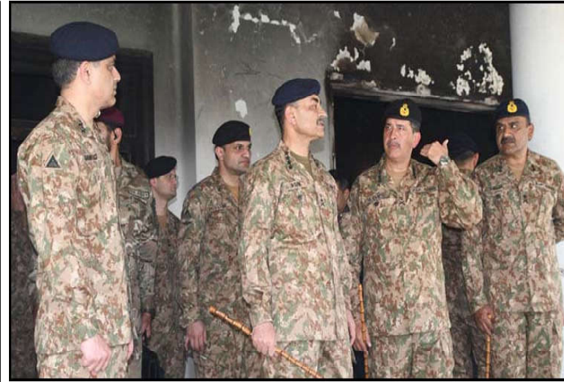
Chief of Army Staff General Syed Asim Munir during his visit to Jinnah House, Lahore Garrison.

"I have been four times part of the process as the defence minister which was never influenced by any entity as it was the then PML-N government's vision to appoint the most decorated soldier as the Army Chief," he said.