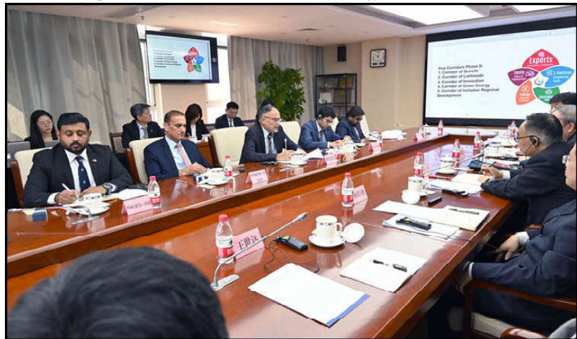
BEIJING: Federal Minister for Planning, Development and Special Initiative Prof. Ahsan Iqbal addressing during NDRC Seminar "Road and Belt".