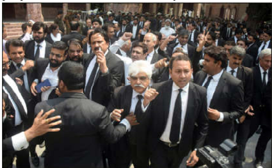
LAHORE: Lawyers protesting in favour of their demands at Lahore High Court.

extremely distressing that memorials of martyrs were desecrated while public and private properties were damaged. Hamza Shehbaz said the elements, which wanted to pollute country’s politics with lies, propaganda and hatred, would never succeed in their nefarious designs. He said that May 9 would be remembered as a black day in the country’s history.