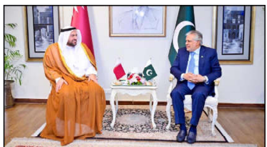
Deputy Prime Minister and Foreign Minister Senator Muhammad Ishaq Dar holds meeting with Minister of the state of Qatar, Dr. Mohammad bin Abdulaziz Al-Khulafati at Ministry of Foreign Affairs.

Independent Report QUETTA: The Government of Balochistan has strongly condemned the incident of killing of seven labourers in Surbandar area of Gwadar district on Thursday morning. The Government of Balochistan has sought report of the incident from concerned high ups. The Provincial Minister for Home and Tribal Affairs, Mir Ziaullah Langove and Spokesman, Government of Balochistan termed the incident as an open terrorism. The Provincial Minister said that the incident of killing of innocent labourers is a cowardly act and we would deal with the terrorists strictly. He said that the incident is being reviewed from all aspects. The terrorists involved in the incident would be taken to task, adding he pledged. The spokesman of provincial government told about the incident and said that it was occurred in Surbandar area of Gwadar. He said that the administrative officers have reached the spot of incident. He said that the government is in contact with the district administration. The bereaved families of the martyr labourers are also being contacted, he added.