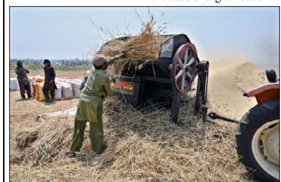
ISLAMABAD: Farmers busy in threshing wheat crop in their field at Gorla.

the minister at her office. Matters regarding digitalisation, connectivity, spectrum auction and 5G rollout were discussed in the meeting. She said that issues relating to Telecommunication will be resolved on an urgent basis. Quality digital services can be provided by using the latest technology, adding that the better use of technology is pivotal for the uplift of the country. She noted that a strong digital ecosystem is the base of digitalisation.