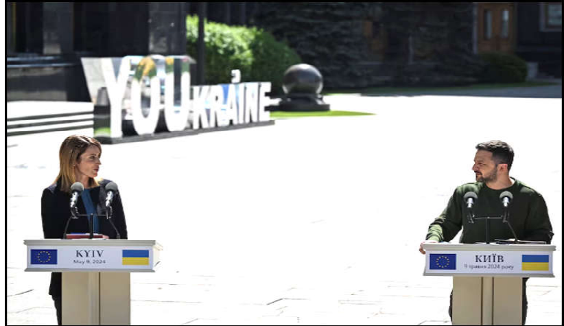
Ukraine's President Volodymyr Zelenskyy and European Parliament President Roberta Metsola attend a joint press conference, amid Russia's attack on Ukraine, in Kyiv, Ukraine.