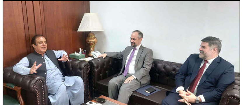
ISLAMABAD: Leader of the Opposition in the Senate, Senator Shibli Faraz in a meeting with Deputy Political Counselor of US Embassy Christopher J. Brown at Parliament House

ISLAMABAD (APP): The Chairman of the Capital Development Authority (CDA), Muhammad Ali Randhawa Thursday issued directive to ensure that all auction payments were collected within the specified due date. Chairman Randhawa cautioned that individuals failing to comply with these orders will face immediate cancellation of their allotments. Under the direction of Minister for Interior Syed Mohsin Raza Naqvi, Chairman Randhawa presided over a pivotal meeting aimed at addressing critical operational matters. During the meeting, Chairman CDA emphasized the timely deposit of lease extensions to maintain property leases. Non-compliance in this regard will result in the cancellation of certain leases, said a news release. The authority responsible for managing open spaces has been tasked with resolving issues with the Islamabad Electric Supply Company (IESCO) and pursuing long-pending payments from them. The Chairman acknowledged the dedication of all Board members and stressed the critical importance of their affirmative compliance.