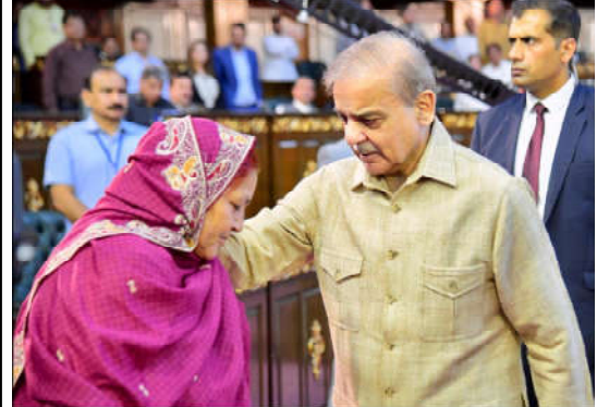
ISLAMABAD: Prime Minister Muhammad Shehbaz Sharif interacting with the families of Martyrs at an event commemorating the unfortunate riots of 9 May 2023.