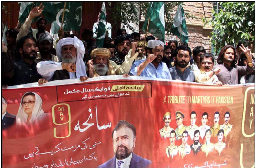
QUETTA: Activists of Peoples Party (PPP) are holding protest demonstration against May 9 riots, at Quetta press club.