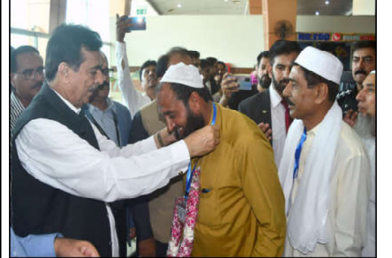
MULTAN: Chairman Senate Syed Yusuf Raza Gilani seen off the intended pilgrims during the first Haj flight operations from Multan International Airport.

MULTAN (APP): Chairman Senate Syed Yusuf Raza Gilani Thursday saw off the intended pilgrims travelling by first Haj flight of Air Sial at Multan International Airport. He garlanded the pilgrims and asked them to maintain discipline in the Holy land as ambassador of the country. As many as 150 pilgrims flew by PF 762 for Madina at 1350 hrs today from the MIAP. Addressing the ceremony Chairman Senate Syed Yusuf Raza Gilani said that he was very delighted to see the blessed pilgrims off as only those who are permitted from the Holy Land. He informed it was a welcome gesture by Air Sial to operate Haj flights from Multan recalling that he extended help for construction of Sialkot airport as former prime minister. Chairman Senate asked them to pray for the martyrs of Palestine and oppressed of Gaza and added they should also pray for all those Shuhada including Law enforcer and civilians who lost their lives for the country. He reminded that PPP had curbed the terrorism from the country in its 2008-13 tenure and regretted that it was rearing its head once again.