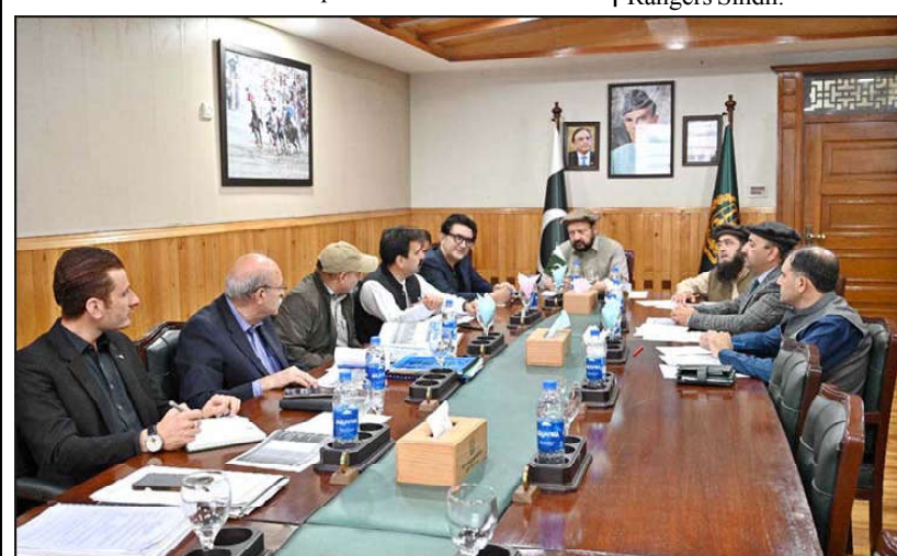
GILGIT: Chief Minister Gilgit-Baltistan Haji Gulbar Khan presiding over meeting regarding the constriction of Daral Tangeer Express Way at CM Secretariat.

He conveyed this sentiment during a meeting with the families of the fallen Rangers officials and personnel in Karachi, according to a news release on Thursday. In a solemn tribute, the DG Rangers Sindh honored the profound sacrifices made by the martyrs and extended solidarity to their bereaved families. The meeting provided an opportunity for the DG Rangers Sindh.