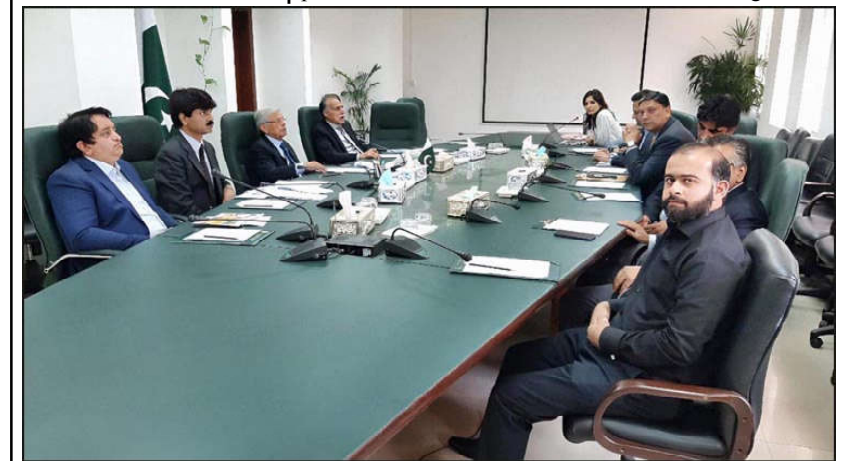
The delegation from M/s Fruit Juice Council called on the Federal Minister for Industries and Production Rana Tanveer Hussain at Islamabad.

standby arrangement, the State Bank of Pakistan (SBP) confirmed. The SBP said it received Special Drawing Rights (SDR) 828 million — equivalent to $1.1 billion in value — "following the successful completion of the second review by the Executive Board of IMF under Stand-By Arrangement (SBA)". The central bank said that the disbursement will be reflected in SBP reserves for the week ending on May 3, 2024. A day earlier, IMF's Executive Board completed the second review under the Stand-By Arrangement (SBA) for Pakistan, allowing for bringing total disbursements under the arrangement to about $3 billion. "The completion of the second and final review reflects the authorities' strong policy efforts under the SBA, which have supported the stabilization of the economy and the return of modest growth."