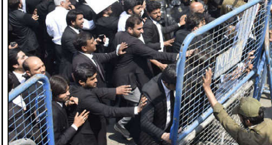
LAHORE: After clashes between lawyers and police in Lahore GPO Chowk, lawyers are throwing iron barriers to enter the High Court.

Later they went to I T Marquee and interacted with students. He also appointed a group of Sindh government for betterment and welfare of students.