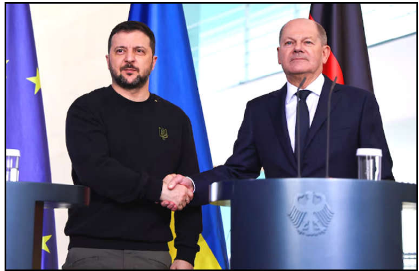
German Chancellor Olaf Scholz and Ukraine's President Volodymyr Zelenskyy shake hands at a press conference in Berlin, Germany.