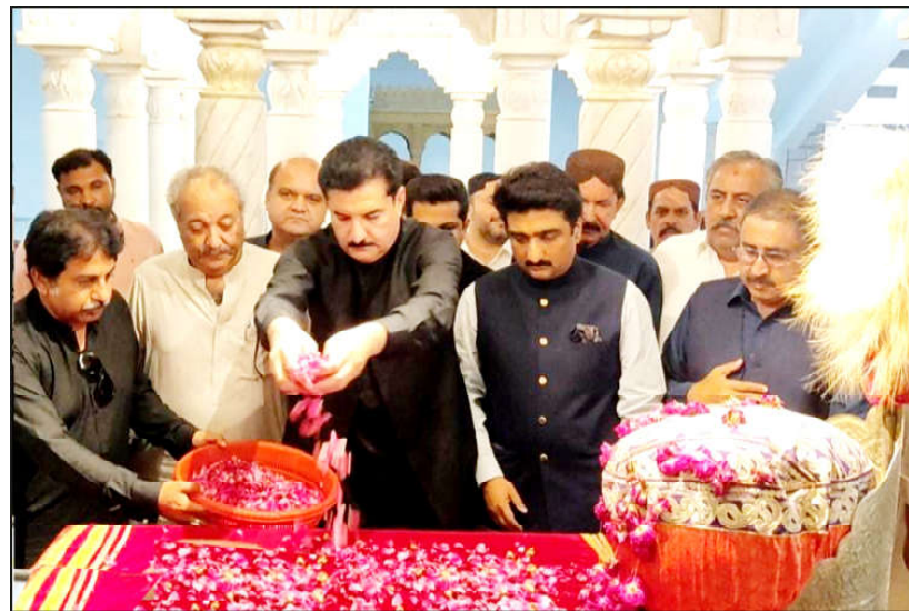
Khyber Pakhtunkhwa Governor Faisal Karim Kundi showering flowers at the grave of Shaheed Zulfiqar Ali Bhutto during at Garhi Khuda Bakhsh, Larkana.

in the province under a project worth Rs 29 billion. Out of which 300,000 metric tons of wheat would be purchased from local farmers. As part of procurement process, 40,000 metric tons of wheat would be purchased from local farmers in Dera Ismail Khan as a stock of about 10500 metric tons was already available in the district. Addressing the ceremony, the chief minister said "the payment of purchased wheat would be made within 24 hours." He said the government was committed to the welfare of farmers and priority was being given to provision of facilities to them. "Farmers are hardworking people so their welfare and provision of facilities to them was among our priorities," he said. He emphasized that transparency and quality assurance as core principles of the procurement process and in this regard, he added, effective measures had been made. "Not buying wheat from Pakistan Agricultural Storage & Services Corporation Limited (PASSCO) resulted in a benefit of Rs 12 billion which would be utilized in the construction and maintenance of warehouses," he said.