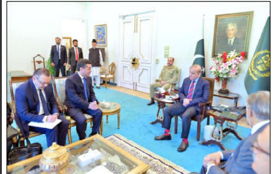
ISLAMABAD: Foreign Minister of Uzbekistan H.E. Bakhtiyor Saidov called on Prime Minister Muhammad Shehbaz Sharif.