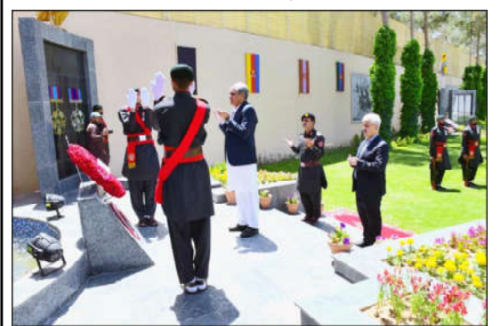
QUETTA: Interior Minister Mohsin Naqvi offering fatha at the Martyrs Monument during his visit to Frontier Corps Balochistan (North) Headquarters.

He commended the professional capabilities and courage of the officers and young men of FC North, stating, "We are proud of their dedication to duty."