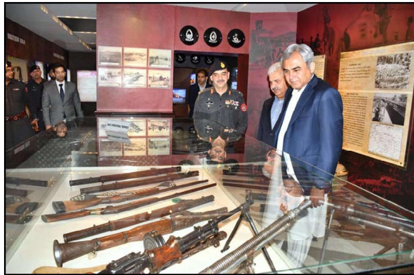
QUETTA: Interior Minister Mohsin Naqvi during his visit to Frontier Corps Balochistan (North) Headquarters.

He thanked China for its support to make CPEC a flagship project of BRI, adding the project had helped Pakistan modernize its energy and logistics infrastructure.