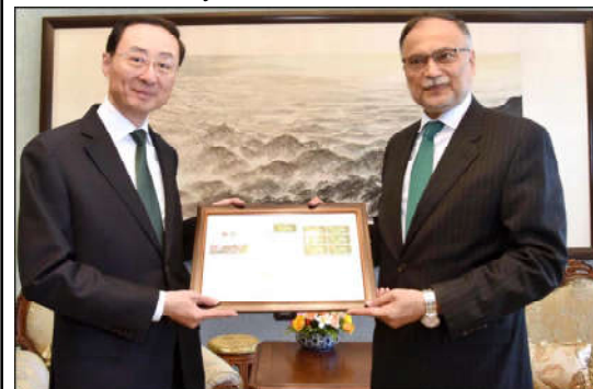
BEIJING: Federal Minister for Planning, Development and Special Initiative Prof. Ahsan Iqbal presenting commemorative coin and postage stamp which launched to celebrate the "Decade of CPEC" to Vice Foreign Minister of China H.E. Sun Weidong at Ministry of Foreign Affairs.