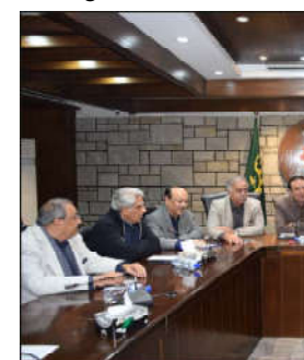
President FPCCI Atif Ikram said that Pakistan

properties were vandalized and surrounded by fire, and the country's prestige was damaged at the forces are our pride due to which national defense is in country's hands. Therefore, the Pakistan Army is