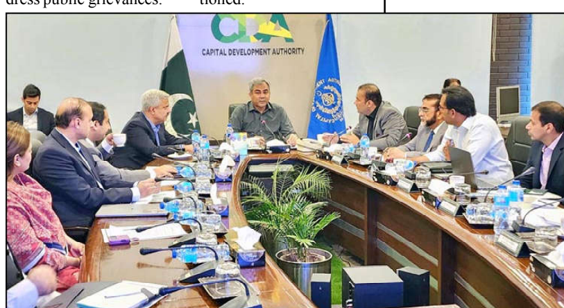
ISLAMABAD: Interior Minister Moshin Naqvi chairing a meeting at CDA Headquarters.

ISLAMABAD (Online): PPP parliamentary leader in the Senate Sherry Rehman Wednesday stressed for introducing fruitful policies of institutions which would not only encourage efficiency but also facilitate the employees. Talking to a private news channel, she said that said Pakistan People's Party always believed in the politics of public welfare and prosperity of Pakistan. The resolution of public problems are top priority of President Zardari and stressed the need for working round the clock on public welfare projects, she added. She said that PPP's mission is to solve and address public grievances. Replying to a question about privatization, she said that PPP believe that if the federal government does not want to operate Steel Mills and PIA anymore, the Sindh government would be willing to acquire it, adding, we are confident we can revive it by running it under the same public-private partnership. Bilawal Bhatto Zardari Pakistan People's Party (PPP) Chairman has constituted a three members committee to engage government over privatization issues as PPP had the best record of protecting the worker's rights and taking initiatives for their welfare, she mentioned.