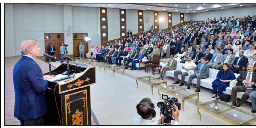
ISLAMABAD: Prime Minister Muhammad Shehbaz Sharif addresses the National Conference on Education Emergency.