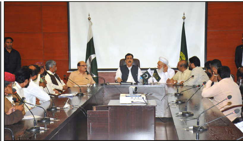
MULTAN: Chairman Senate Syed Yusuf Raza Gilani in a meeting with the different delegations at Circuit House.

the local growers. Talking about wheat procurement situation in Sindh, CM said that the Sindh food dept had 400,000 tons of wheat in its godowns, and only 900,000 tons were required to meet the provincial requirement, therefore, a procurement target was set at 900,000. He added that so far 600,000 tons of wheat has been procured and the remaining 300,000 tons would be procured from the areas where complaints of judicious distribution of bardana were received. CM said that after receiving the complaints of unfair distribution of bardana for wheat procurement he has already ordered an inquiry into the complaints. "Minister Irrigation & Food Jam Khan Shoro is conducting an inquiry and so far, I have suspended four District Food Controllers (DFCs)," he added. This he said while speaking at the consultative meeting of elected representatives and party workers of Shaheed Benazirabad Division at a banquet hall. Talking about holding consultative meetings with party workers at the grassroots level, Murad Shah said that it was essential for the inclusive development of the province.