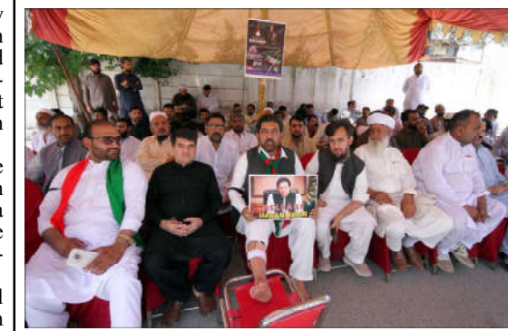
PESHAWAR: Activists of Tehreek-e-Insaf (PTI) are holding protest demonstration for release of PTI Founder Imran Khan, at a camp near Peshawar press club.