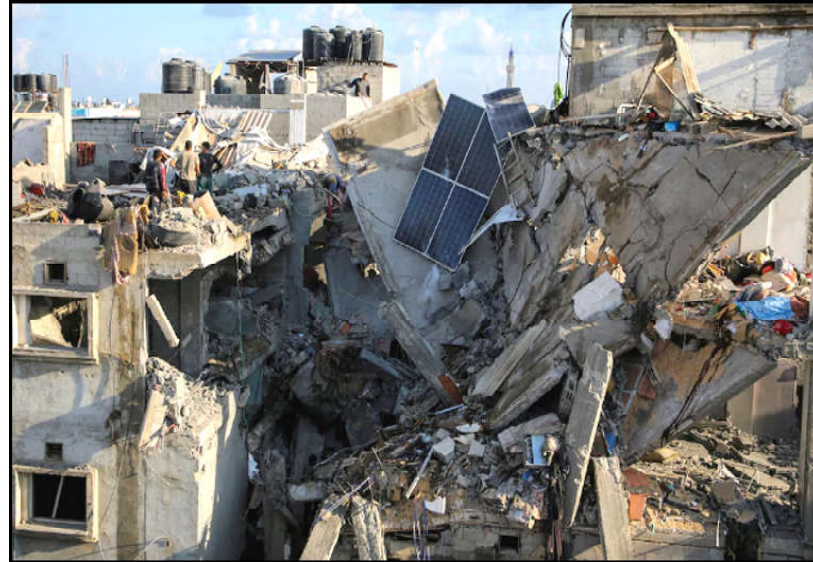
Palestinians inspect the site of an Israeli strike on a house in Rafah, in the southern Gaza Strip.

rogance" on the part of the United States and its allies. Russia's chief (of more than 24 years) promised 'victory' and said all Russians were now "answerable to our thousand-year history and our ancestors." He departed from the ceremony to the music "Hail" from Mikhail Glinka's opera "A Life for the Tsar". The words "Hail, hail, my Rus! Hail you are my Russian land" rang out in the Kremlin. The original words are "Hail, hail, our Russian tsar!". "The authority of our president is higher than ever, higher than the American president, higher even than the Russian tsar. So much depends on our president" said Gennady Zyuganov (a leader of the Communist Party).