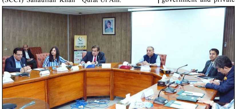
ISLAMABAD: Federal Minister for Privatisation, Board of Investment and Communications Abdul Aleem Khan presiding over a meeting of "Ease of Doing Business".