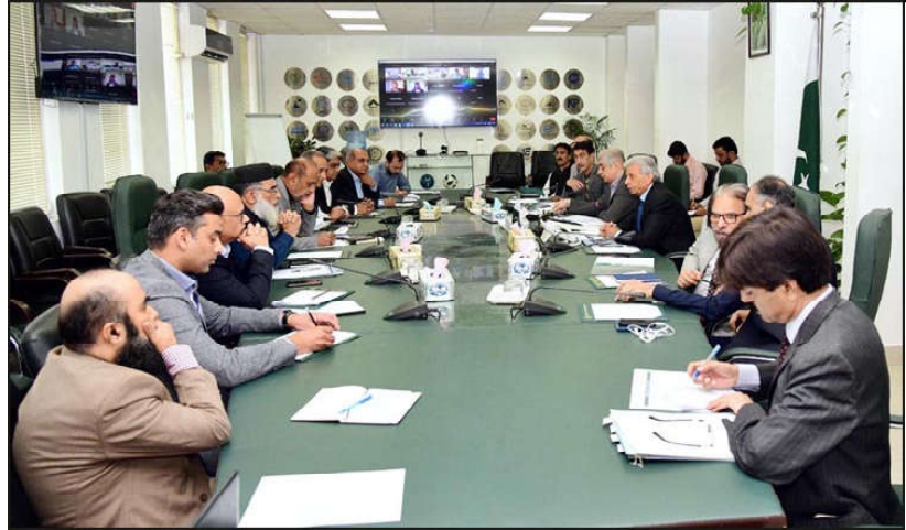
ISLAMABAD: Federal Minister for Industries and Production, Rana Tanveer Hussain chairing a meeting of Fertilizer Review Committee.