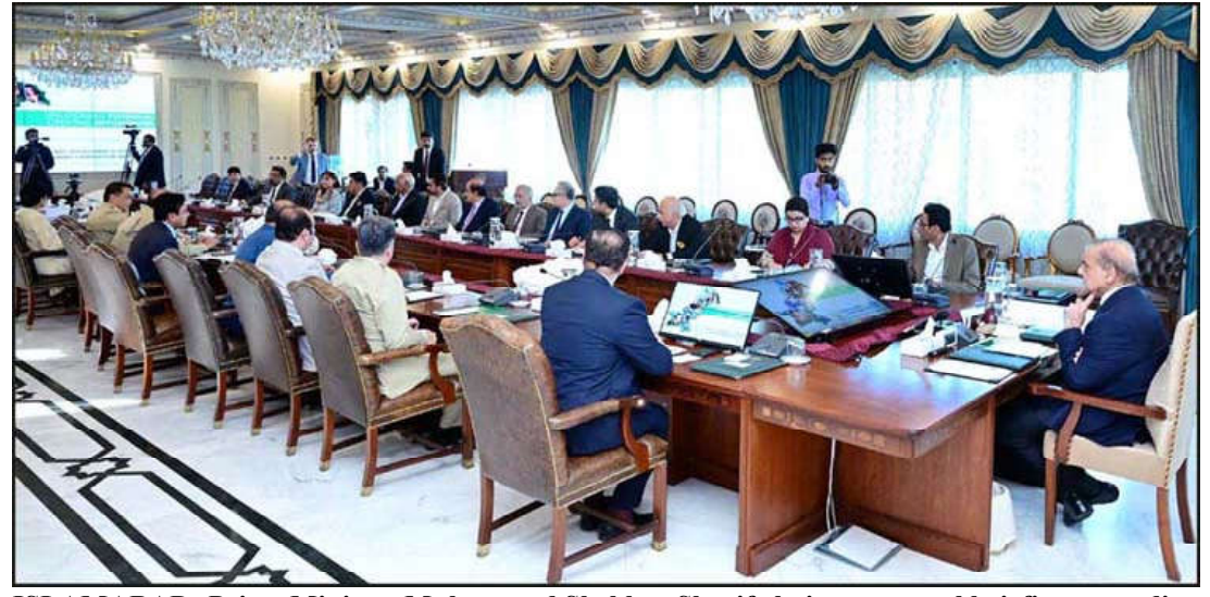
ISLAMABAD: Prime Minister Muhammad Shehbaz Sharif chairs a sectoral briefing regarding NAVTTC and Ministry of Overseas Pakistanis and Human Resource Development.

elevate the quality of Pakistan's technical manpower and human resource development. He called for establishing an integrated system of regulating the manpower equipped with the best and world-class professional technical skills. Besides, in coordination with NADRA.