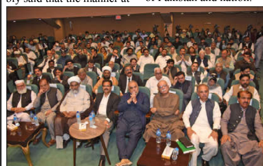
ISLAMABAD: Participants attending a seminar titled "Tahafuz e Ain e Pakistan kesy aur kiun" under the auspices of Tehreek Tahafuz Pakistan in the Federal Capital.

He said that those took part in the nefarious conspiracy on May 9 by attacking the national installations and monuments were actually the enemies of Pakistan and nation.