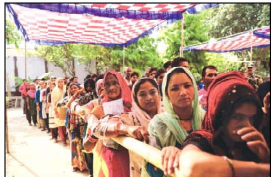
SAMBHAL: People queue to vote at a polling station during the third phase of the general election.

troops at the disputed Second Thomas Shoal, and notify Beijing about missions in advance. Reuters has not heard the reported phone conversation and could not verify the contents of the published transcript. The Manila Times said the conversation had taken place in January and the transcript was provided by a "ranking Chinese official", which it did not name. The shoal has been a flashpoint for a series of heated confrontations between China's coast guard and Philippine vessels in the past year.