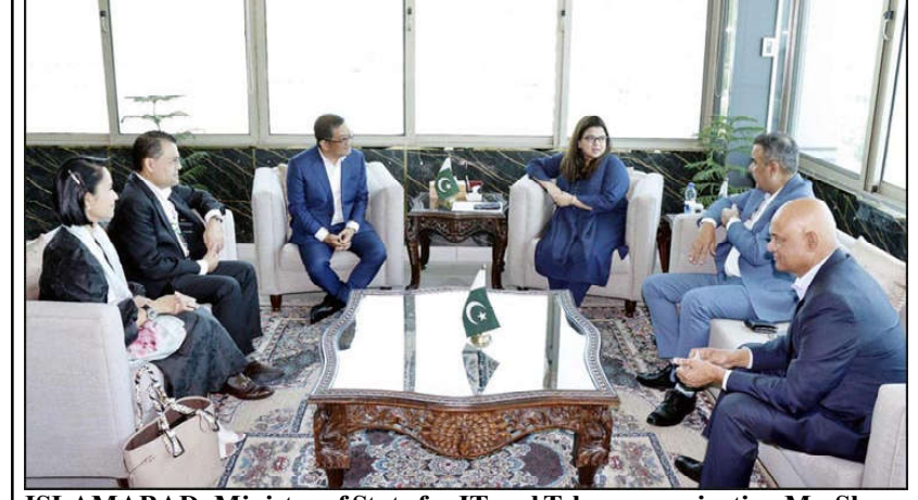
ISLAMABAD: Minister of State for IT and Telecommunication Ms. Shaza Fatima Khawaja in a meeting with EDOTCO Group delegation.

ISLAMABAD (APP): The Securities and Exchange Commission of Pakistan (SECP) Wednesday organized a workshop for Council Energy and Economic Journalists (CEEJ), focusing on oversight of trading activities at the Pakistan Stock Exchange. The SECP team explained that the stock exchange played an important role in capital formation, financial inclusion and diversification of investments, said a press release issued here. The participants were briefed on the trading, clearing, settlement and custodial functions.