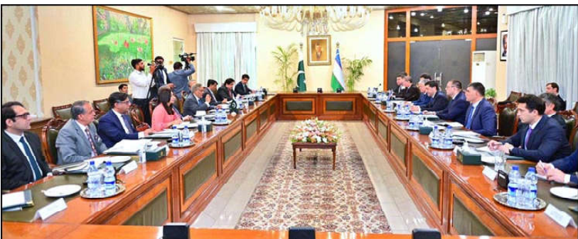
ISLAMABAD: Deputy Prime Minister and Foreign Minister Senator Mohammad Ishaq Dar and Foreign Minister of the Republic of Uzbekistan Bakhtiyor Saidov held delegation level talks at Ministry of Foreign Affairs.