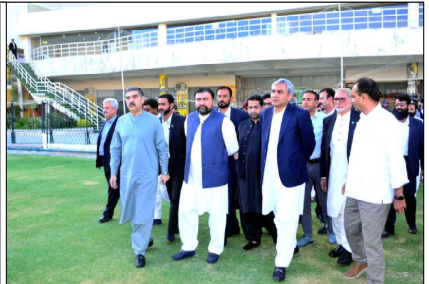
QUETTA: Balochistan Chief Minister Mir Sarfraz Ahmed Bugti along with Federal Minister for Interior, Chairman of PCB Mohsin Naqvi and Ex-Interim PM Anwaar-ul Haq Kakar inspecting at Bugti Cricket Stadium