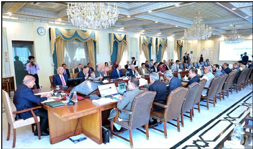
ISLAMABAD: Prime Minister Muhammad Shehbaz Sharif chairs a meeting of the Federal Cabinet.