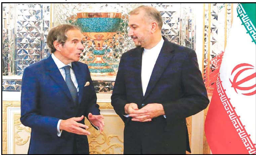
Iranian Foreign Minister Hossein Amir Abdollahian meets UN atomic watchdog chief Rafael Grossi.

Israeli Prime Minister Benjamin Netanyahu has vowed to send ground troops into Rafah regardless of any truce, defying international concerns. Cairo's foreign ministry warned in a statement of "grave humanitarian risks" for more than one million Gazans sheltering there and urged Israel to "exercise the utmost restraint". US President Joe Biden and Netanyahu spoke and Biden restated "his clear position" against an invasion of Rafah, the White House said. It also said the Israeli premier "agreed to ensure the Kerem Shalom crossing is open for humanitarian assistance for those in need".