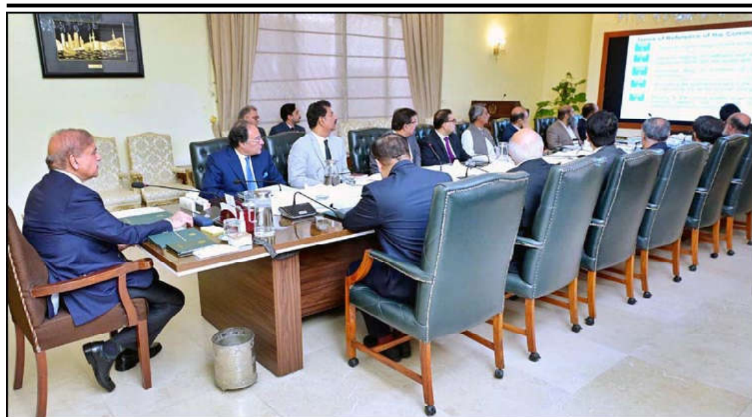
ISLAMABAD: Prime Minister Muhammad Shehbaz Sharif chairs a meeting regarding FBR's Track and Trace System.