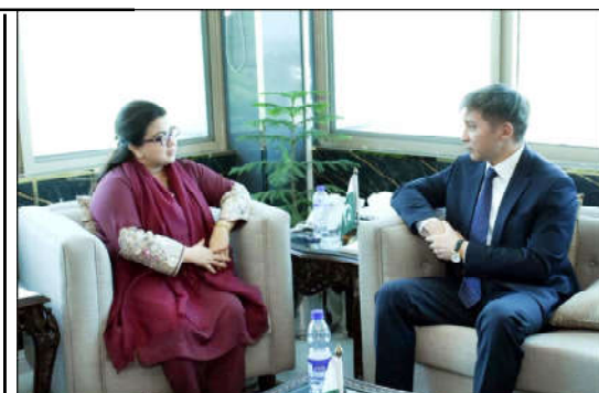
ISLAMABAD: Ambassador of Kazakhstan to Pakistan H.E. Yerzhan Kistafin called on Minister of State for IT and Telecommunication Ms. Shaza Fatima Khawaja.

ISLAMABAD (APP): The per tola price of 24 karat gold decreased by Rs 500 and was sold at Rs. 240,000 on Tuesday compared to its sale at Rs. 240,500 on last trading day. The price of 10 grams of 24 karat gold also decreased by Rs 429 to Rs 205,761 from Rs 206,190 whereas the prices of 10 gram 22 karat gold went down to Rs 188,615 from Rs 189,007, the All Sindh Sarafa Jewellers Association reported. The price of per tola and ten gram silver remained constant at Rs 2,620 and Rs 2,254.80 respectively.