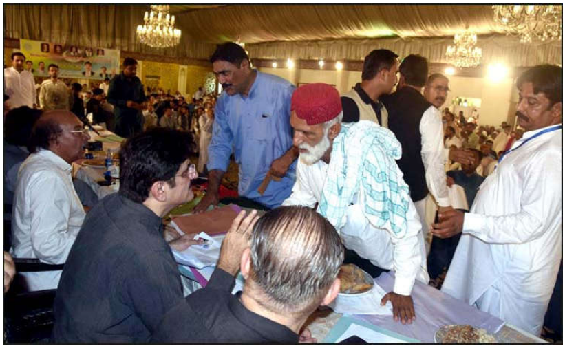
LARKANA: Sindh Chief Minister, Syed Murad Ali Shah interacts with party workers during a meeting of PPP Larkana Division held at local hall in Larkana.

across the province that will be better equipped, have better trained staff and curricula better catered for the demand of the labour market, thus paving the way for economic prosperity and sustainable development. The EU's support will particularly focus on improving skills in key sectors such as agribusiness, water, and energy. The new support programme is not just part of the broader Team Europe Initiative involving the EU, France, Germany and Italy to build back better through green jobs creation, but also contributes to the EU's Global Gateway Initiative in which the EU is trying to leverage public and private sector investments by investing in skills of young people in Pakistan.