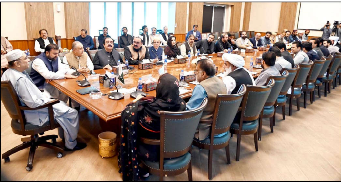
QUETTA: PPP's MPAs, office bearers and workers meeting with President Asif Ali Zardari. Chief Minister Balochistan Mir Sarfraz Ahmed Bugti is also present