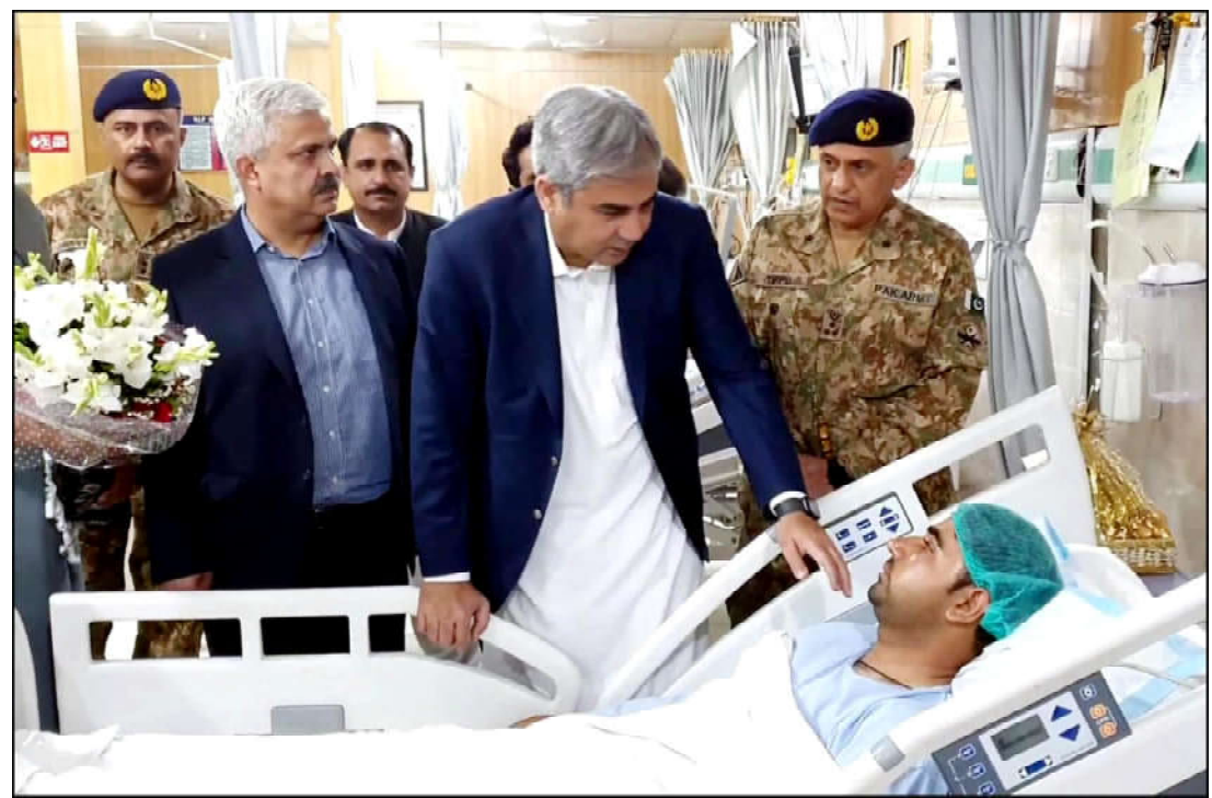
Federal Minister for Interior Mohsin Naqvi enquiring about the health of officials injured during the clash with the terrorists in Quetta

During the visit, the Federal Minister inquired about the health of six personnel injured in exchange of fire in Killa Abdullah the other day. He appreciated the spirit and morale of the injured personnel. He also prayed for the early recovery of the injured persons. Mohsin Naqvi said that the injured persons fought with bravery against the miscreants. He praised the medical treatment being extended to the injured.