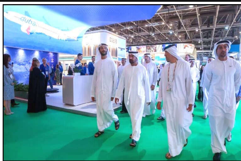
Sheikh Ahmed bin Saeed Al Maktoum, president of the Dubai Civil Aviation Authority and CEO of flag carrier Emirates, kicks off the mega travel and tourism exhibition event, Arabian Travel Market (ATM) 2024, in Dubai.