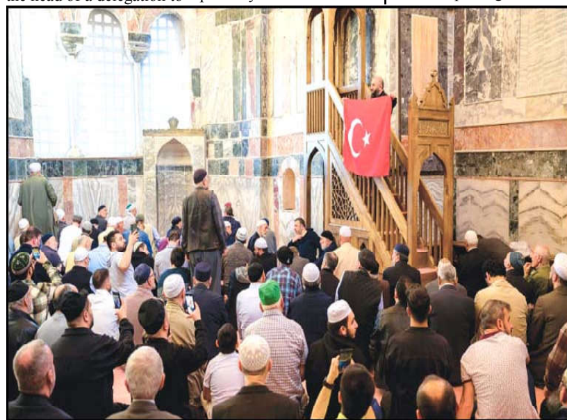
ISTANBUL: A man waves a Turkish national flag in front of worshippers inside the mosque.