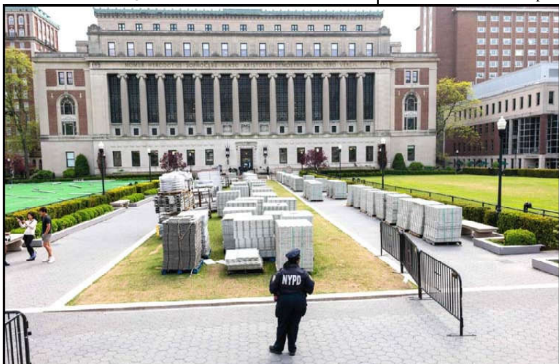
A police officer stands guard at a nearly empty Columbia University campus after police cleared out a Gaza protest encampment in New York City.

On Monday, the commission warned parties against the misuse of AI tools to create deep fakes and told them not to publish and circulate such videos. It also said parties had been directed to remove such content within three hours of it being brought to their notice. Modi, the face of the Hindu-nationalist BJP, seeking a rare third consecutive term, had focused his campaign largely on his government's performance on economic growth and welfare benefits.