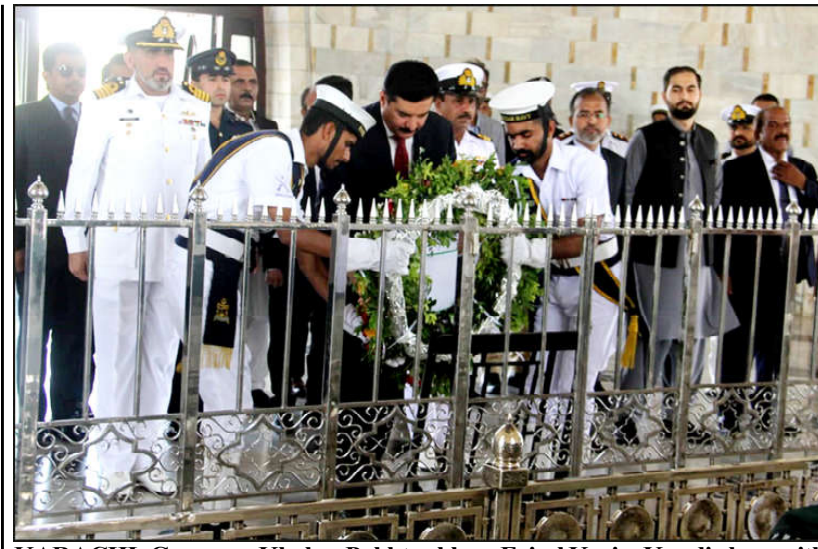
KARACHI: Governor Khyber Pakhtunkhwa Faisal Karim Kundi along with others paying homage to Quaid-e-Azam Muhammad Ali Jinnah during his visit to Jinnah Mausoleum.

The people of the Kashmir District demanded that the work on the ongoing Girl College may be accelerated.