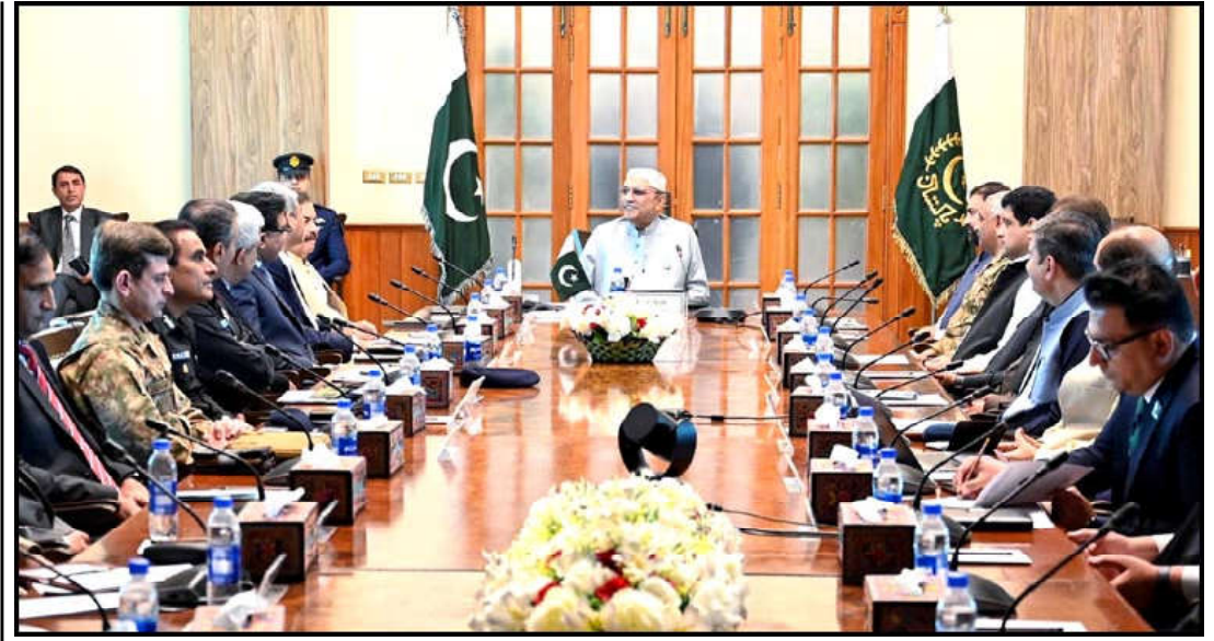
President Asif Ali Zardari being briefed about the law and order situation and the ongoing development projects in Balochistan, Quetta.