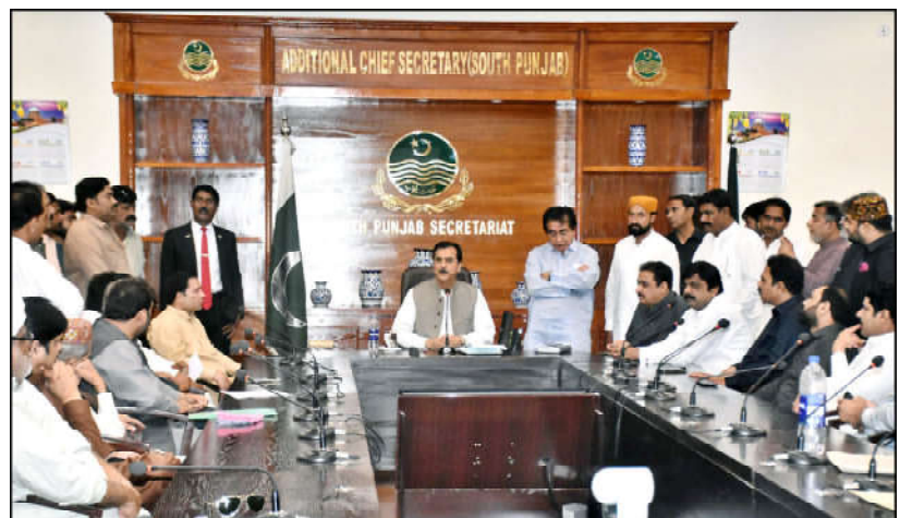
MULTAN: Chairman Senate Syed Yusuf Raza Gilani in a meeting with the members from different Housing Association at Circuit House.