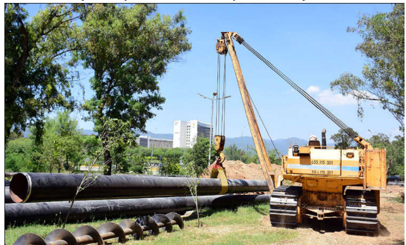
ISLAMABAD: Labourers are busy installing new gas pipeline with the help of heavy machinery at Zero point area during development work.