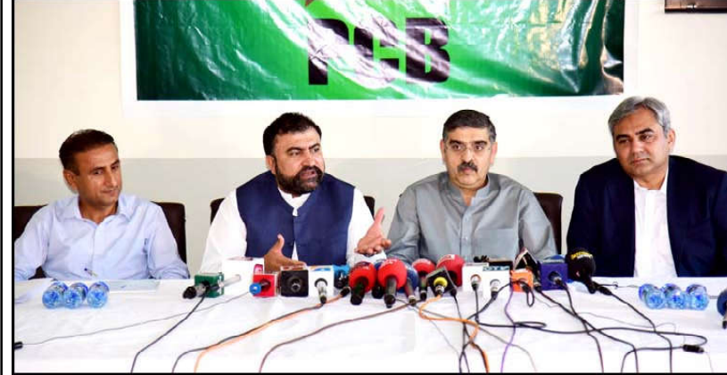
QUETTA: Chief Minister Balochistan Mir Sarfraz Ahmed Bugti, Interior Minister & Chairman PCB Mohsin Naqvi and Senator Anwaarul Haq Kakar addressing a Press conference