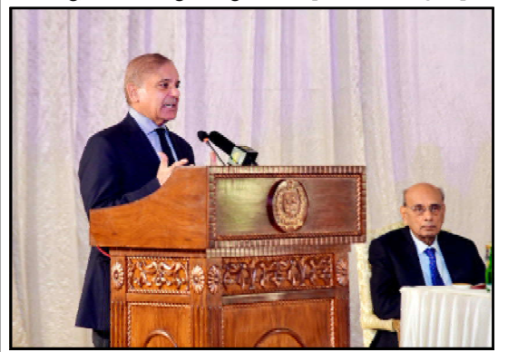
Prime Minister Muhammad Shehbaz Sharif addresses a banquet organized in honor of the delegation of businessmen and investors led by the Saudi Deputy Investment Minister Ibrahim Al-Mubarak, in Islamabad

Among those who received the President were included: Governor Balochistan, Sheikh Jaffer Khan Mandokhail, Chief Minister, Mir Sarfraz Ahmed Bugti, provincial ministers, members of provincial assembly and leaders of Pakistan Peoples Party (PPP) including its president and Senator, Mir Changez Jamali, former Chief Minister Nawab Sanaullah Zehri besides other provincial high ups.