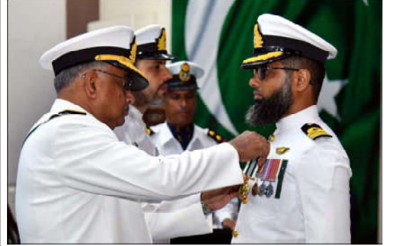
KARACHI: Chief of the Naval Staff, Admiral Naveed Ashraf awarding medal to an officer during Pakistan Navy Investiture Ceremony held in Karachi.