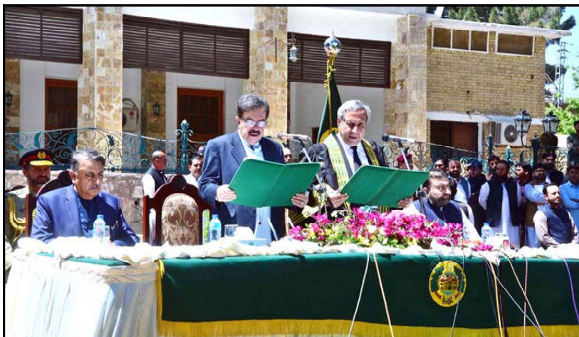
QUETTA: Chief justice Balochistan High Court Justice Hashim Kakar administers oath to newly appointed Governor Balochistan Shaikh Jaffer Mandokhail at Governor House.