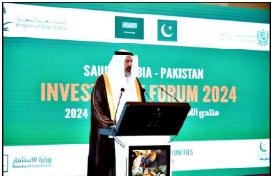
ISLAMABAD: Saudi Assistant Minister of Investment, H.E. Ibrahim Al-Mubarak delivers a speech at the Saudi Arabia-Pakistan Investment Forum 2024.