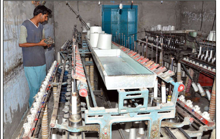
FAISALABAD: A worker is busy in his work at a local Polyester factory in the city.

work. The authorities concerned strictly directed by PM to complete the procurement of wheat from farmers, he said, adding, the wheat procurement target was also increased from 1.4 million tonnes to 1.8 million tonnes. An strict inquiry committee was constituted to probe a wheat import scandal which will submit its report to Prime Minister Shehbaz Sharif, he said, adding, after getting details we will take further decisions. Replying a question, he said that the inflation falling towards the lowest level which was a sign of improvement.