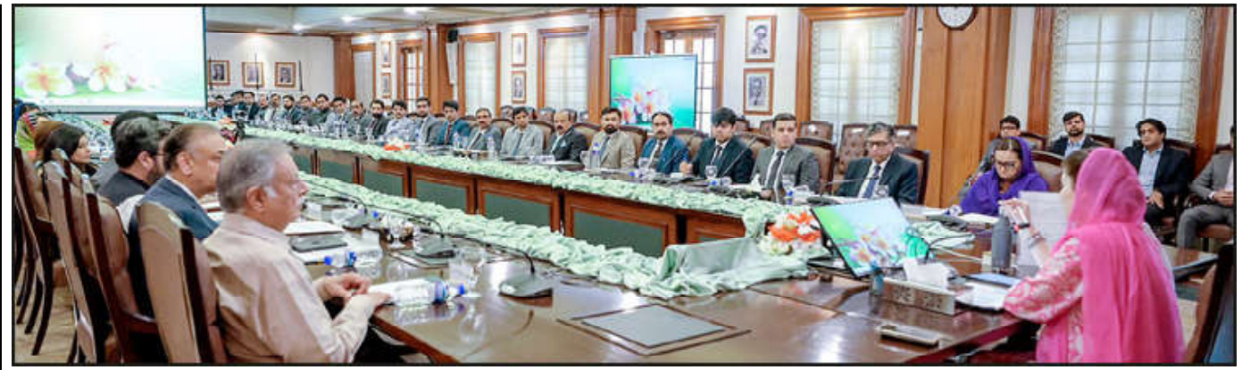
LAHORE: Punjab Chief Minister Maryam Nawaz Sharif addressing the newly appointed Assistant Commissioners.