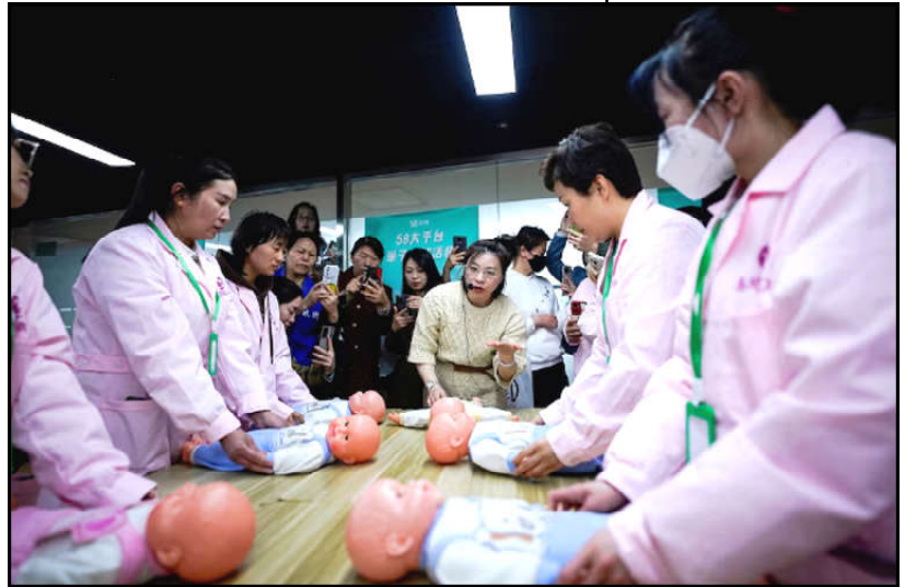
Women train with plastic baby dolls as they take part in a nursing skills class for confinement carers, at Yipeitong training centre in Shanghai, China.