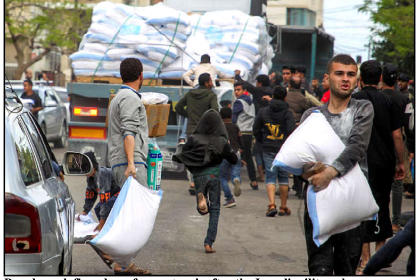
People grab flour bags from a truck after the Israeli military began evacuating Palestinian civilians ahead of a threatened assault on Rafah in the southern Gaza Strip.

against the Russian Federation", it said. Russia and the US are by far the world's biggest nuclear powers, holding more than 10,600 of the world's 12,100 nuclear warheads. China has the third-largest nuclear arsenal, followed by France and Britain. Russia has about 1,558 non-strategic nuclear warheads, according to the Federation of American Scientists, though there is uncertainty about exact figures for such weapons due to a lack of transparency. No power has used nuclear weapons in war since the United States unleashed the first atomic bomb attacks on the Japanese cities of Hiroshima and Nagasaki in 1945.