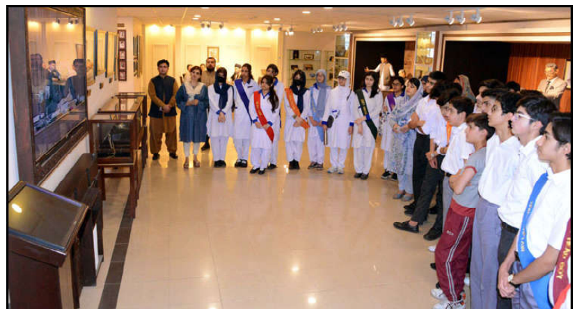
Students of Beacon House School, I-9 Campus, Islamabad visiting Senate Museum at Parliament House, Islamabad.