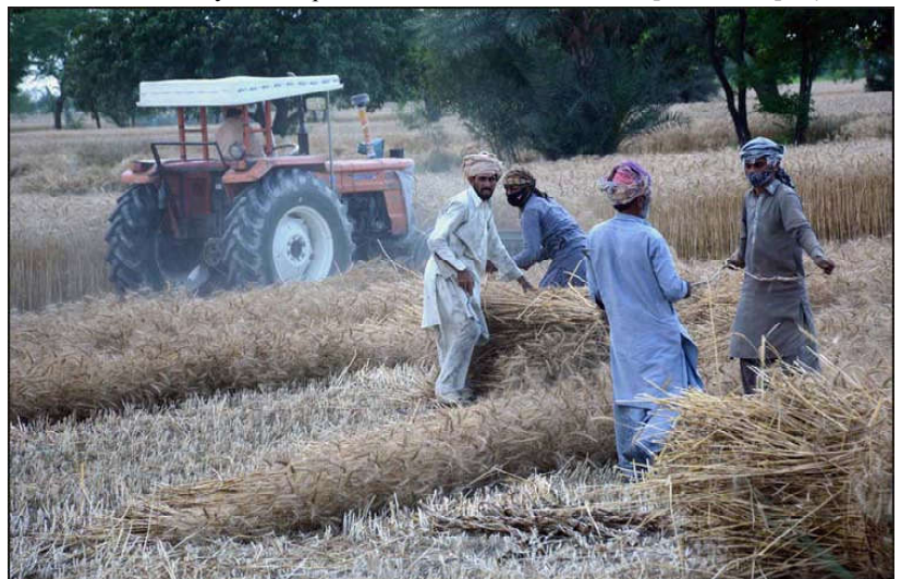
FAISALABAD: Farmers busy in cutting wheat crop in their field.