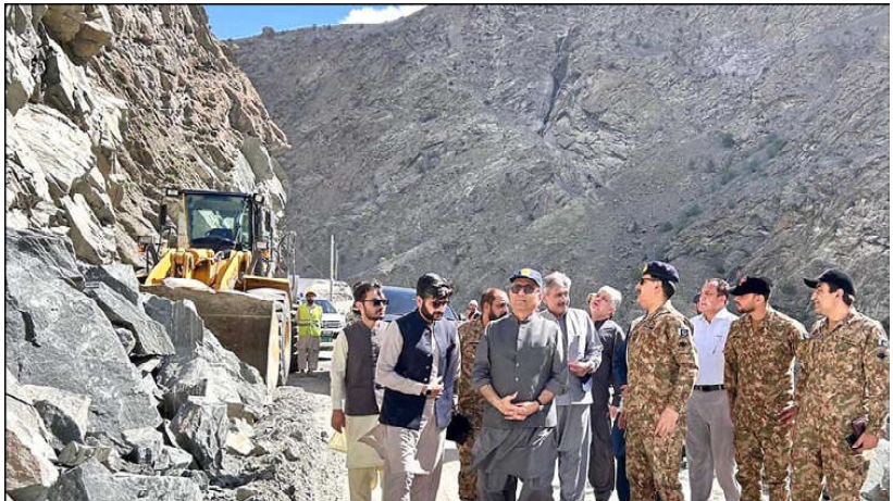
SKARDU: Federal Minister for Communications, Privatization & Board of Investment, Abdul Aleem Khan inspecting land slide in Skardu.