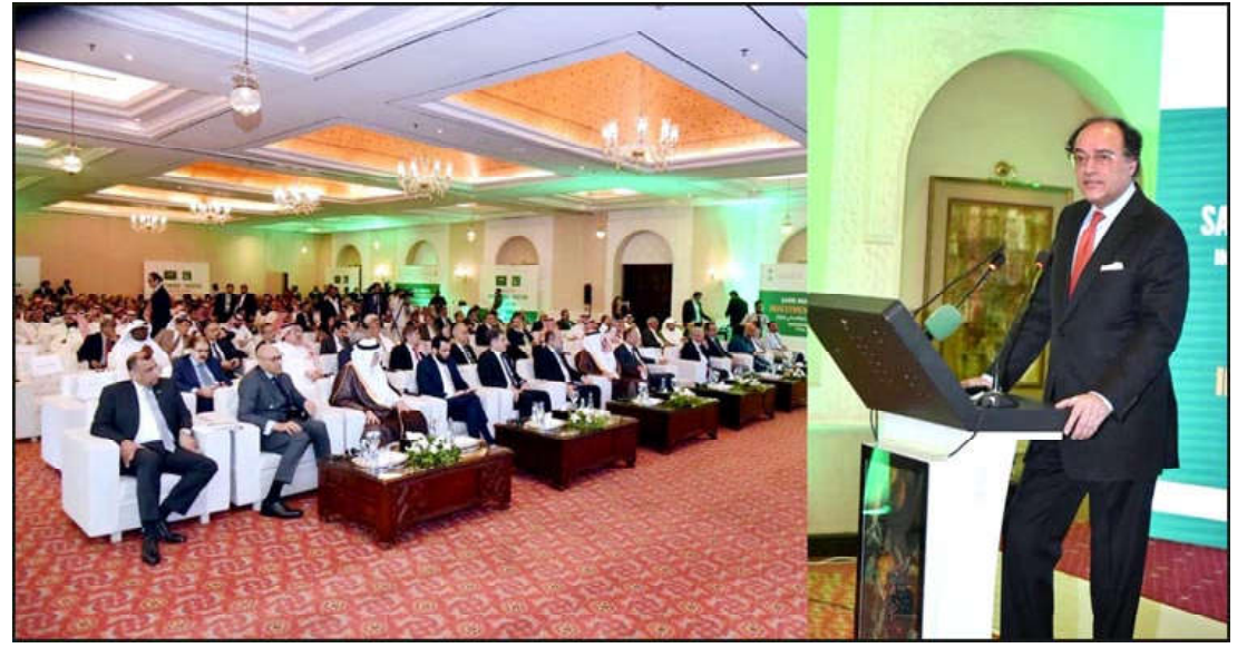
ISLAMABAD: Muhammad Aurangzeb, Federal Minister for Finance addressing the Saudi Arabia-Pakistan Investment Forum 2024.

The IMF has said accelerating reforms was more important than the size of a new program, which would be guided by a package of reforms and balance of payments needs.