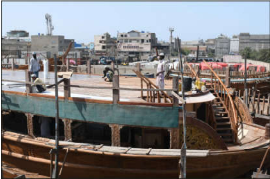
KARACHI: Labourers busy in preparing tourist boats on Fish Harbor.