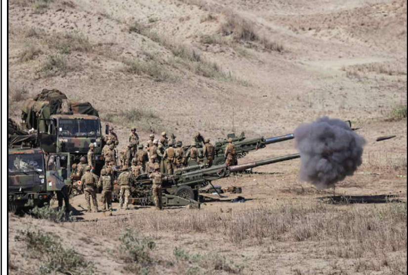
U.S. soldiers fire 155mm and 105mm Howitzers during a live fire exercise in the annual joint military exercises between U.S. and Philippine troops called "Balikatan" or shoulder-to-shoulder, at Laoag, Ilocos Norte, Philippines.

Monitoring Desk MANILA: Philippines President Ferdinand Marcos Jr said on Monday the country will not use water cannons or any offensive weapons in the South China Sea. The last thing the Philippines wants to do is to raise tensions in the strategic waterway, Marcos told reporters.