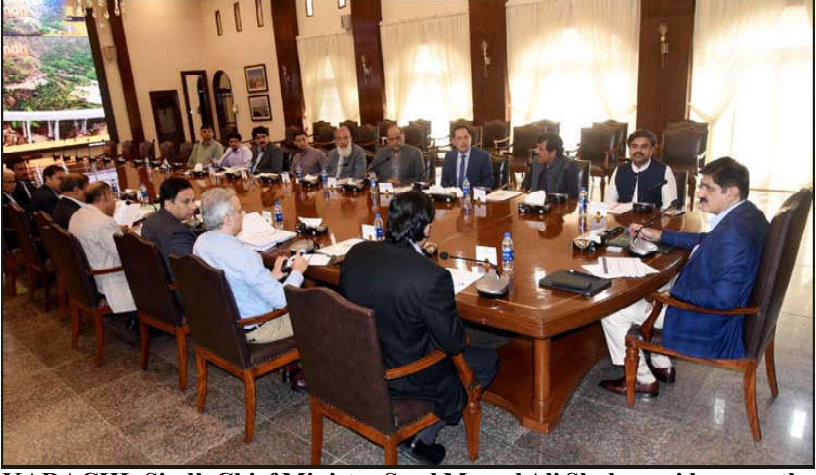
KARACHI: Sindh Chief Minister Syed Murad Ali Shah presides over the joint meeting of National Highway Authority and Sindh Works and Services Departments.