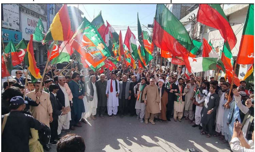
QUETTA: Activists of different Political Parties are holding protest rally for acceptance of their demands, at Mannan Chowk.