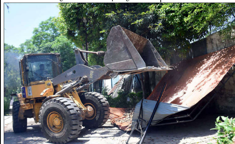
ISLAMABAD: CDA staffers removing different structures in Sector G-8 during anti-encroachments drive in Federal Capital.

ISLAMABAD (Online): Hearing of bail plea of PTI founder has been adjourned without any proceedings in 190 million pounds reference in Islamabad High Court (IHC). The hearing was to take place on Monday. The cause list of two members bench of Chief Justice (CJ) IHC Aamer Farooq and justice Tariq Mehmood Jahangiri was cancelled Monday. The hearing of bail plea of PTI founder was adjourned without proceedings due to cancellation of cause list.