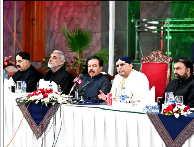
QUETTA: President Asif Ali Zardari addressing the banquet hosted by the Chief Minister of Balochistan Mir Sarfraz Ahmed Bugti. Governor Balochistan Sheikh Jaffer Khan Mandokhail is also present

INP adds: The Supreme Court's decision to suspend the Peshawar High Court (PHC) verdict on the Sunni Ittehad Council (SIC) reserved seats has rekindled the embattled Pakistan Tehreek-e-Insaf (PTI) hopes to return to power.