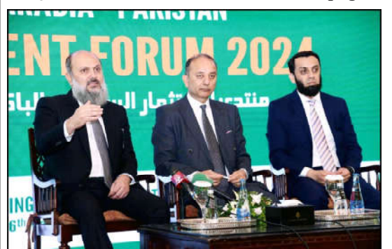
ISLAMABAD: Federal Minister for Commerce, Jam Kamal Khan, Information & Broadcasting Minister Attaullah Tarar and Minister for Petroleum Musadiq Masood Malik addressing the media regarding the Saudi Arabia-Pakistan Investment Forum 2024.