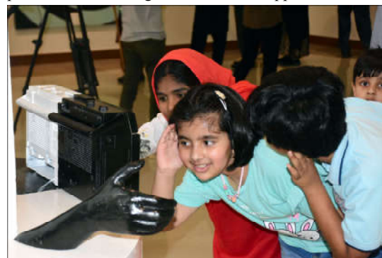
ISLAMABAD: Children listening Radio during an Art Exhibition titled "Mureed-e-Murshad" by Muhammad Sajjad Akram at Pakistan National Council of the Arts in the Federal Capital.