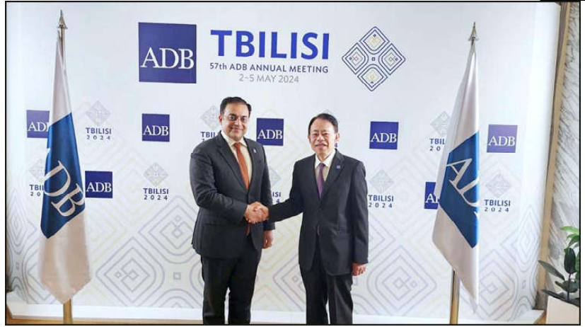
GEORGIA: Federal Minister for Economic Affairs Ahad Khan Cheema meets with President of Asian Development Bank (ADB) on the sidelines of the 57th Annual Meeting of the Board of Governors in Tbilisi.