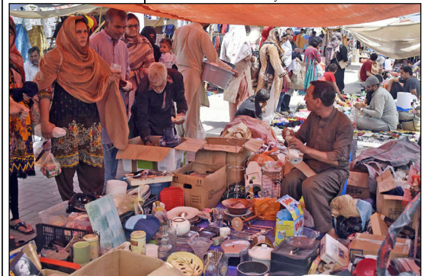
LAHORE: People are buying secondhand items in Sunday weekly bazaar at Shadman area, in the Provincial Capital.