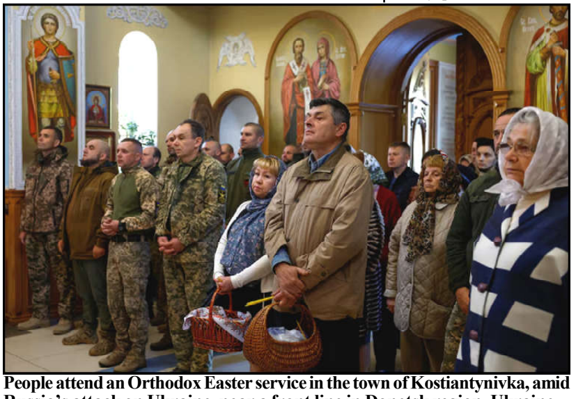
People attend an Orthodox Easter service in the town of Kostiantynivka, amid Russia's attack on Ukraine, near a front line in Donetsk region, Ukraine.

Monitoring Desk DUBLIN: Students at Trinity College Dublin and Lausanne University in Switzerland have staged occupations to protest against Israel's war in Gaza, joining a wave of demonstrations sweeping US campuses.