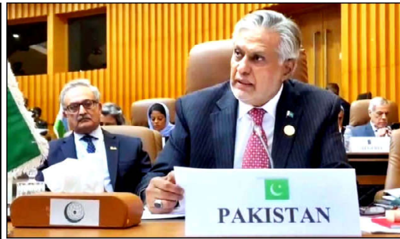
BANJUL: Deputy Prime Minister and Finance Minister Senator Muhammad Ishaq Dar addressing 15th OIC Islamic Summit Conference.

The Secretary Health Abdullah Khan appreciated performance of the MNCH Programme and said that there is key role of community midwives in the far flung areas of the province. As a result, mothers are getting better healthcare facilities, he added.