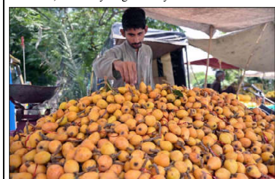
SARGODHA: A vendor displaying loquat on his cart to attract the customers.

In export through US dollar, government pays a rebate and the same practice should be adopted in export through PKR, they reiterated.