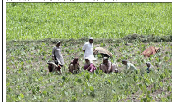
MULTAN: Farmer family busy in their routine work in the field.

In light of the lack of trader participation, the FBR has decided to take action against non-registrants under the scheme.