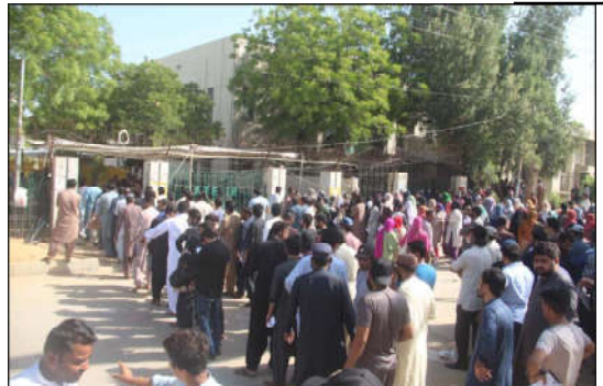
KARACHI: A large number of candidates lining up for the entry test for Sindh Services Commission jobs in NED University, in the Provincial Capital.