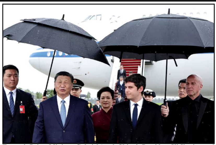
France's Prime Minister Gabriel Attal, China's President Xi Jinping and his wife Peng Liyuan walk under umbrellas upon their arrival for an official two-day state visit, at Orly airport, south of Paris.