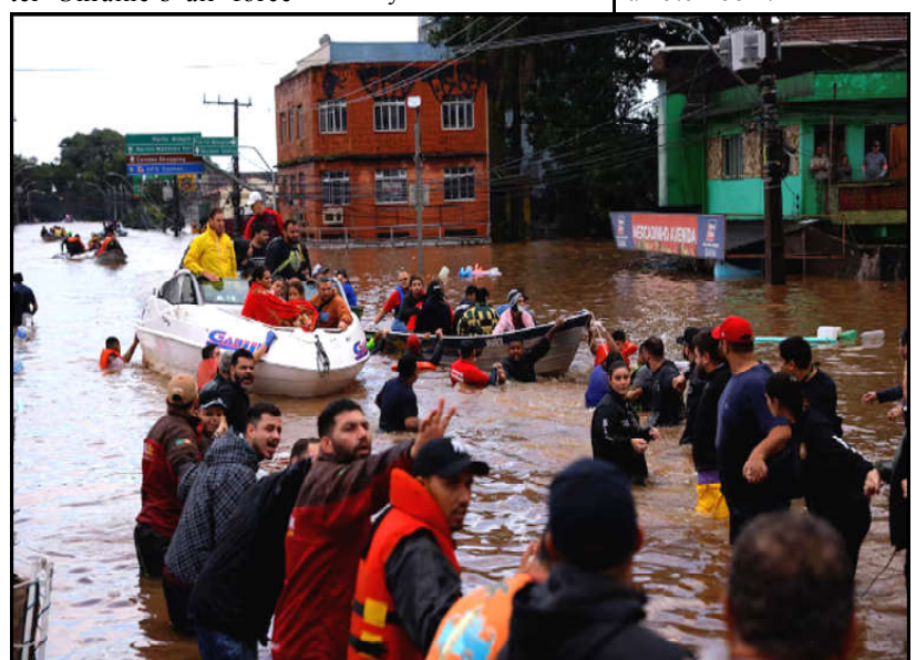
People are rescued by residents after the floods in Canoas, at the Rio Grande do Sul state, Brazil.