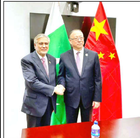
BANJUL: Deputy Prime Minister and Foreign Minister Senator Muhammad Ishaq Dar met with Vice Chairman of the Standing Committee of the National People's Congress of China Zheng Jianbang, on the sidelines of the 15th OIC Islamic Summit Conference.