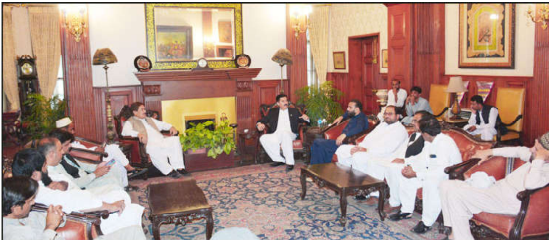
PESHAWAR: Delegation from different walks of life meeting with Khyber Pakhtunkhwa Governor Faisal Karim Kundi.