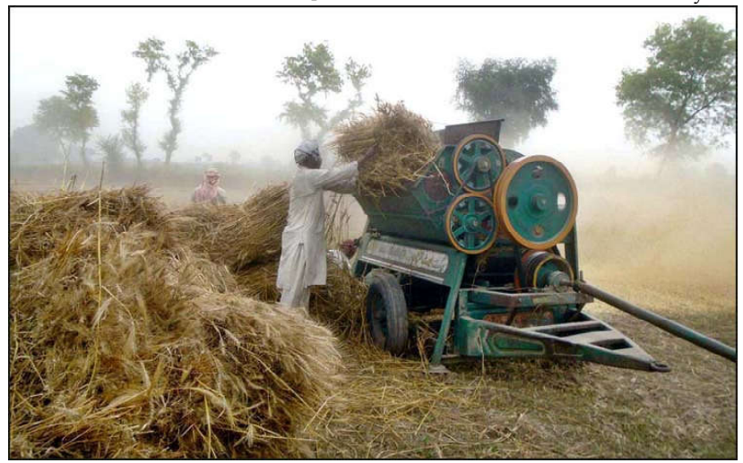
CHINIOT: Farmers busy in threshing wheat crop in their field at Jhang Road.