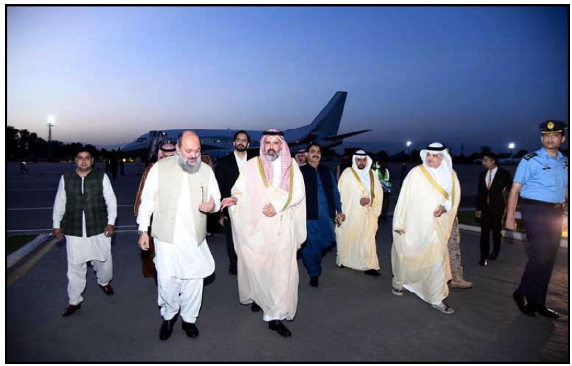
Federal Minister Jam Kamal Khan receiving a high-level Saudi business delegation upon its arrival.