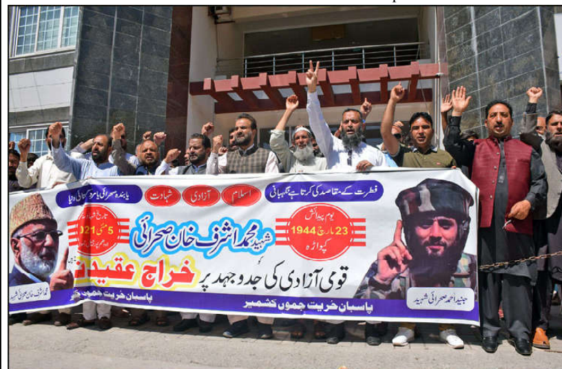
MUZAFFRABAD: Activists of Pasban-e-Hurriyat chanting slogans during protest against Indian Army at Azadi Chowk in the city.

LAHORE (APP): Punjab Information Minister Azma Bukhari has said that people of Khyber-Pakhtunkhwa (KP) are waiting for change for the last 10 years. In a statement issued here on Sunday, she said that condition of Khyber-Pakhtunkhwa schools and hospitals was very poor. Azma said instead of focusing on welfare of people, the KP government was afraid of performance of Punjab Chief Minister Maryam Nawaz, who was working very hard for betterment of people of the province.