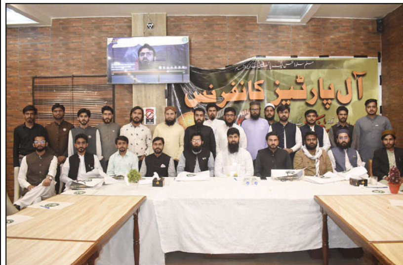
LAHORE: Students Organization showing solidarity with Palestine during a All-Pakistan Parties Conference held in Provincial Capital.