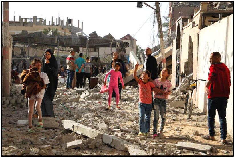
Palestinian children look up as they walk at the site of an Israeli strike on a house, amid the ongoing conflict between Israel and Hamas, in Rafah, in the southern Gaza Strip.

through May. Russia said at the time the drills marked an 'irrevocable return' of the alliance to Cold War schemes.