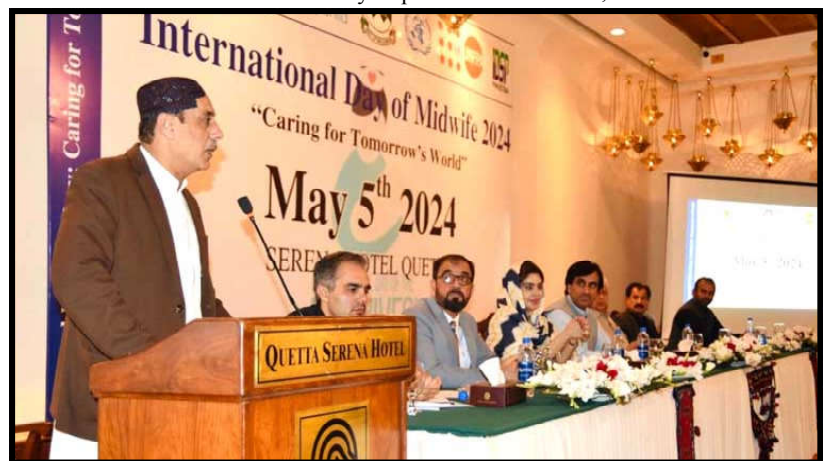
QUETTA: Provincial Health Minister Sardarzada Mir Faisal Khan Jamali addressing a ceremony held in connection with International Midwife Day

Balochistan must also urgently enact laws protecting journalists' safety and establish a safety commission to ensure that perpetrators of such attacks are held to account, it maintained.