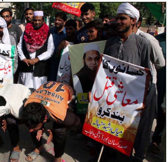
LAHORE: Members of Kissan Board are holding protest demonstration for acceptance of their demands, at Lahore press club.