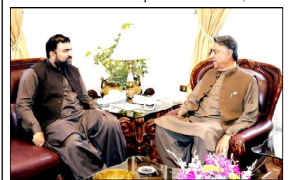
a need to take more steps for strengthening the federation and provinces further.