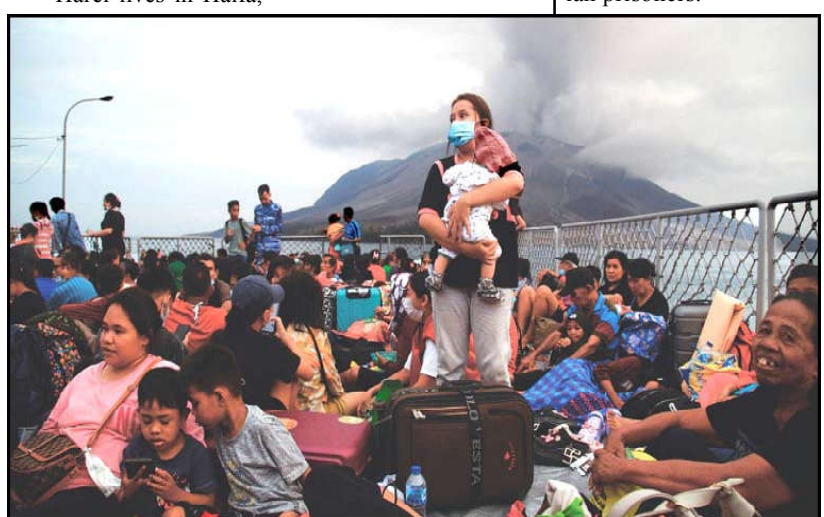
A woman carrying her child stands on the deck of a warship as people are being evacuated following the eruptions of Mount Ruang volcano in Indonesia's North Sulawesi province.

While civilians usually can escape riot control gases during protests, soldiers stuck in trenches without gas masks must either flee under enemy fire or risk suffocating. The State Department said it was delivering to Congress its determination that Russia's use of chloropicrin against Ukrainian troops violated the CWC. Moscow's use of the gas "comes from the same playbook as its operations to poison" the late opposition leader Alexei Navalny in 2020 and Sergei Skripal and his daughter Yulia in 2018 with the Novichok nerve agent.