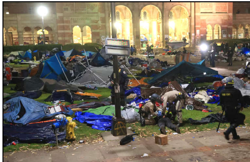
Law enforcement officers detain a demonstrator, as they clear out the protest encampment in support of Palestinians at the University of California Los Angeles (UCLA) in Los Angeles, California.

Police put the number of protesters in the French capital at about 18,000, though the hardest hit CGT union put the figure at around 50,000.