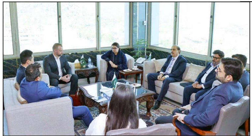
ISLAMABAD: Google team calls on Minister of State for IT and Telecommunication, Shaza Fatima Khawaja.