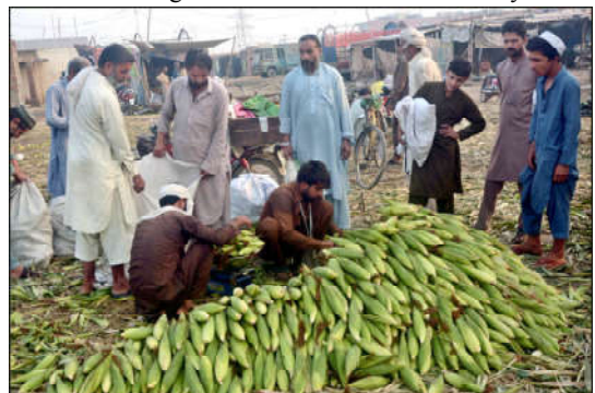
LAHORE: Workers sorting out corn cobs at Vegetable Market.