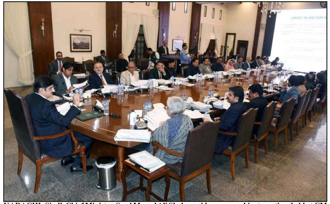
KARACHI: Sindh Chief Minister, Syed Murad Ali Shah presides over a cabinet meeting, held at CM House in Karachi.

investigation report to the Apex Committee which revealed that a Madarsa teacher was found involved in the KPO attack dated February 17, 2023. The teacher was a terrorist and had attacked the KPO along with his accomplices. During the KPO clearance operation carried out by the agencies, the terrorists were killed and through their fingerprints and other investigations, it was revealed that one of them was a teacher in Madarsa. It was pointed out that illegal foreigners were