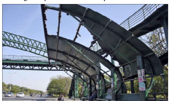
ISLAMABAD: A view of damage bus stop alongside Islamabad Highway near Kachnar Park in the Federal Capital, as needs to attention for concern authority.