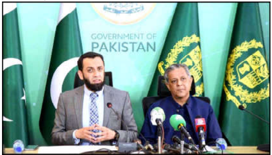
ISLAMABAD: Federal Minister for Law and Justice Senator Azam Nazeer Tarar and Federal Minister for Information and Broadcasting Attaulah Tarar held an important press conference.

On the directives of the Saudi Crown Prince, the Saudi ministers formulated a comprehensive programme for cooperation with Pakistan, he added.