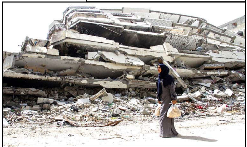
A Palestinian woman walks past the ruins of a house destroyed during Israel's military offensive in Gaza City.

Biden's support for Israel in its war against Hamas has emerged as a significant political liability for the president, particularly among young Democrats.