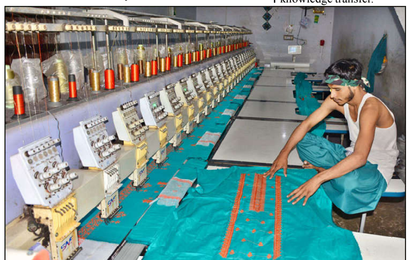
HYDERABAD: Worker busy in preparing the design on the fabric with help by machine at local textile factory.