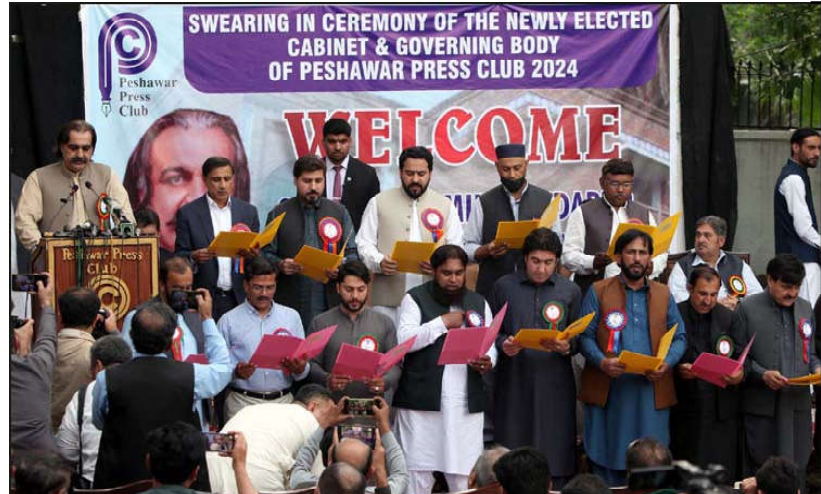
PESHAWAR: Khyber Pakhtunkhwa Chief Minister, Ali Amin Gandapur administers oath of newly elected Cabinet and Governing Body of Peshawar Press Club (PPC) during oath taking ceremony held at PPC in Peshawar.