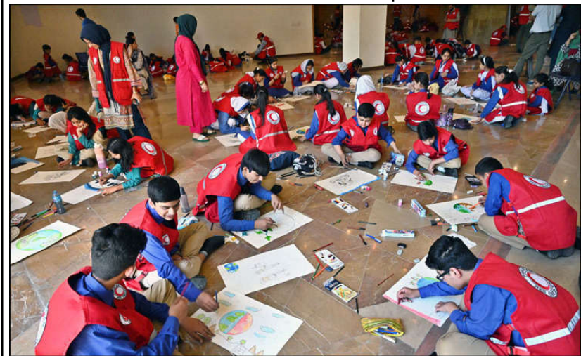
ISLAMABAD: Students participating in Arts & Painting Competition under the theme "Keeping Humanity Alive" in connection with World Red Cross and Red Crescent Week Celebration at Citizen's Club, F-9 Park.