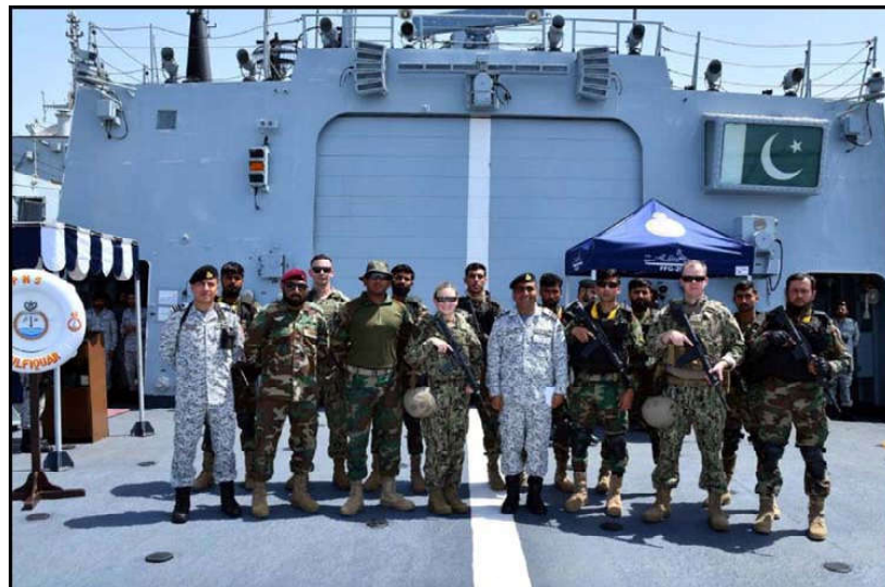
KARACHI: Pakistan Navy and US Navy Officers and Troops in a group photo on board PN Ship during Exercise Inspired Union 2024.

He also exhorted the students to work hard to excel in studies. He also urged the teachers to motivate students towards acquiring different skills.