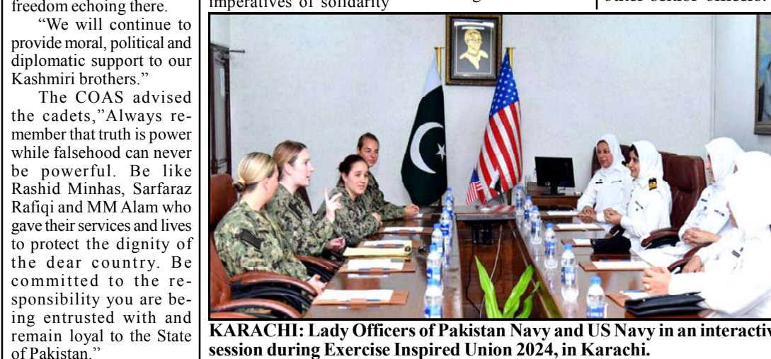
KARACHI: Lady Officers of Pakistan Navy and US Navy in an interactive session during Exercise Inspired Union 2024, in Karachi.