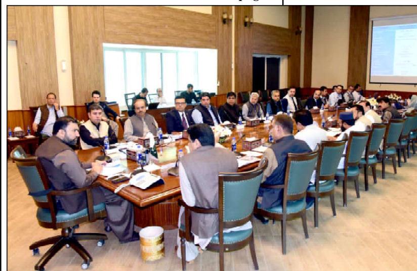
QUETTA: Chief Minister Balochistan Mir Sarfraz Ahmed Bugti presiding over a meeting to review South Balochistan Development Package