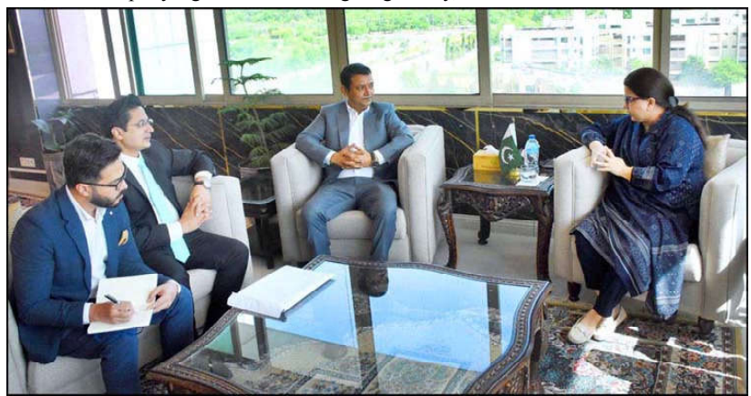
ISLAMABAD: Delegation of Abacus Consulting calls on Minister of State for IT and Telecommunication, Shaza Fatima Khawaja.

During the press conference here at a local hotel, Ashrafi emphasized the importance of booking Hajj journeys only through authorized organizers, cautioning against fraudulent activities perpetrated by unauthorized groups through social media platforms. He urged intending