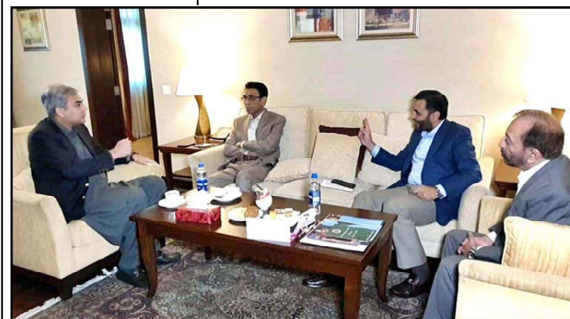
KARACHI: A delegation of Muttahida Qaumi Movement Pakistan (MQM-P) meets with Federal Minister for Interior Mohsin Naqvi.

CPI inflation Rural, increased to 14.5% on year-on-year basis in April 2024 as compared to an increase of 19.0% in the previous month and 40.7% in April 2023. On month-on-month basis, it decreased to 0.9% in April 2024 as compared to an increase of 2.1% in the previous month and an increase of 3.0% in April 2023. The Sensitive Price Indicator (SPI) inflation on YoY increased to 21.6% in April 2024 as compared to an increase of 25.9% a month earlier and 42.1% in April 2023. On MoM basis, it decreased by 0.7% in April 2024 as compared to an increase of 2.1% a month earlier and an increase of 2.7% in April 2023. The Wholesale Price Index (WPI) inflation on YoY basis increased to 13.9% in April 2024 as compared to an increase of 14.8% a month earlier and an increase of 33.4% in April 2023. On MoM basis, it decreased by 0.7% in April 2024 as compared to an increase of 1.3% in the previous month and an increase of 0.1% in corresponding month of last year i.e. April 2023. The urban core inflation, measured by non-food non-energy, increased to 13.1% on (YoY) basis in April 2024 as compared to an increase of 12.8% in the previous month and 19.5% in April 2023. On (MoM) basis, it increased by 2.1% in April 2024 as compared to an increase of 0.1% in previous month, and an increase of 1.8% in corresponding month of last year i.e. April, 2023.