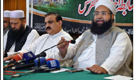
ISLAMABAD: Chairman Ulema Council Hafiz Muhammad Tahir Mehmood Ashrafi addresses press conference.

He underscored that such actions are not only contrary to Islamic teachings and Shariah but also reflect poorly on Pakistan in the international community.