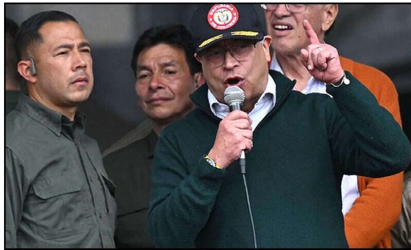
Colombia's President Gustavo Petro delivers a speech during a rally in Bogota.

Any such deal would be the first since a one-week truce in November saw 80 Israeli hostages exchanged for 240 Palestinian prisoners.