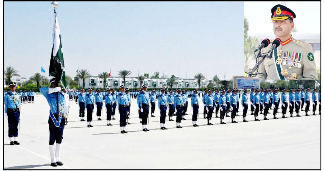
RISALPUR: Chief of Army Staff General Syed Asim Munir addressing graduation Ceremony of 149th General Duty (Pilot), 95th Engineering, 105th Air Defence, 25th A&SD, Eighth Log and 131st Combat Support Courses at the PAF Academy Risalpur.