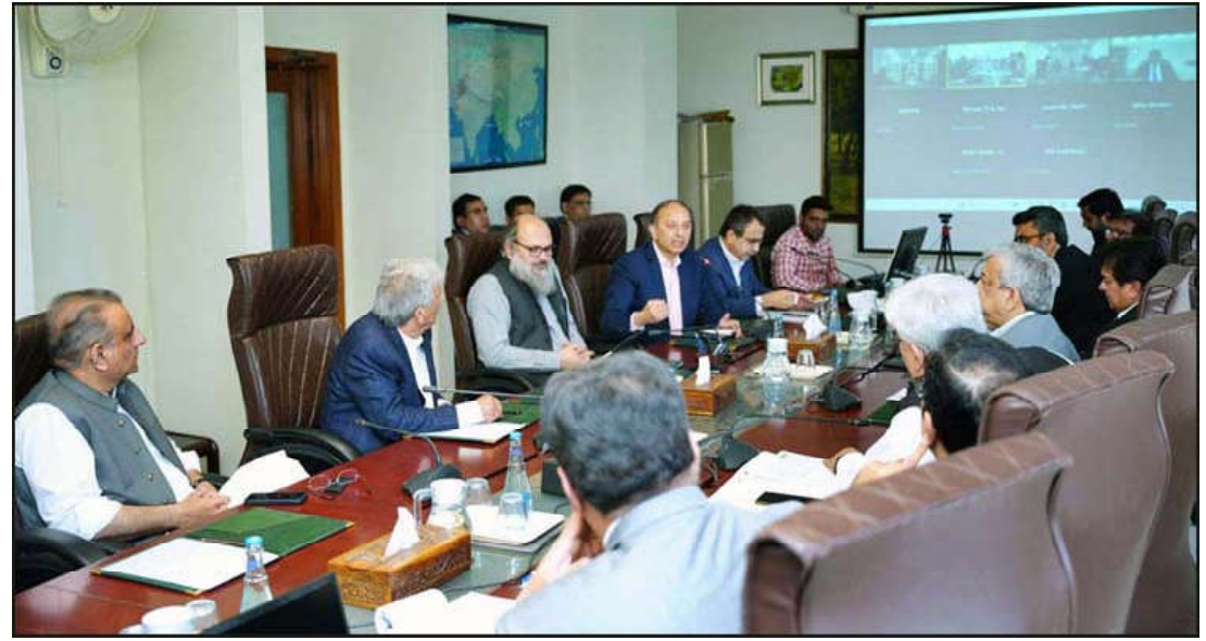
ISLAMABAD: Federal Minister for Petroleum, Musadik Masood Malik, along with Federal Minister for Commerce, Jam Kamal Khan, Federal Minister for Energy, Sardar Awais Ahmed Khan Laghari, Federal Minister for Industry and Food Security, Rana Tanveer Hussain and Federal Minister for Privatisation and Board of Investment (BOI), Abdul Aleem Khan, convened a crucial Steering Committee meeting to assess preparations for the upcoming visit of Saudi Business Delegates.