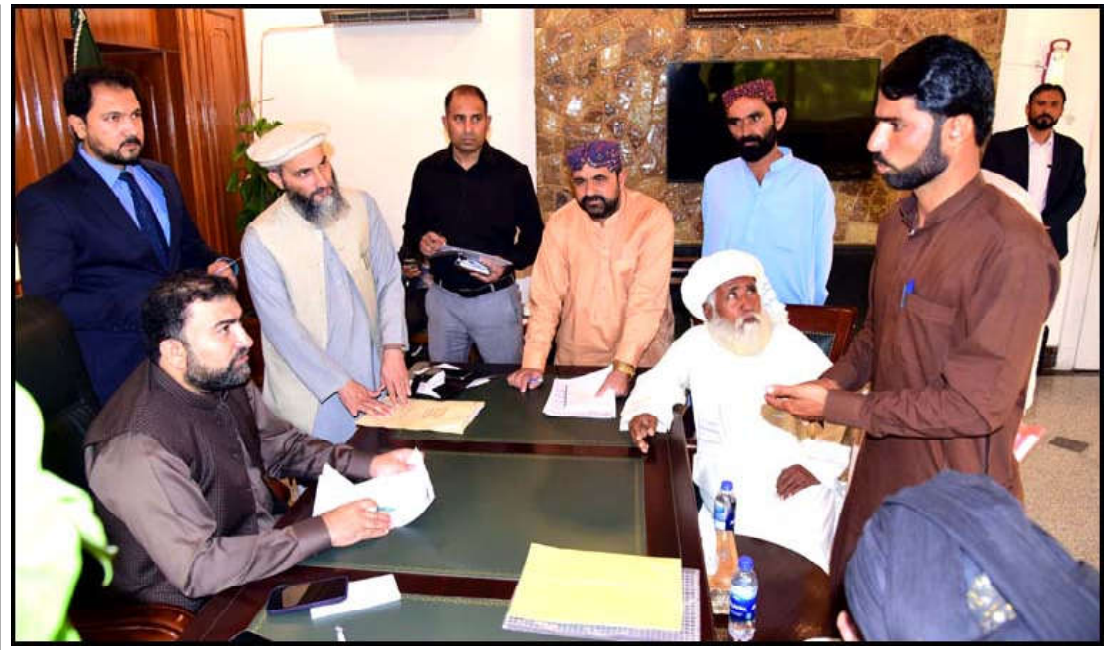
QUETTA: Balochistan Chief Minister Mir Sarfaraz Ahmed Bugti listening problems of people

ahead of them. They need to continue to focus on their cricket so that they are available, if required." The 18-member Pakistan squad (in alphabetical order): Babar Azam (Captain), Abrar Ahmed, Azam Khan, Fakhar Zaman, Haris Rauf, Hasan Ali, Iftikhar Ahmed, Imad Wasim, Abbas Afridi, Mohammad Amir, Mohammad Rizwan (wk), Irfan Khan, Naseem Shah, Saim Ayub, Salman Agha, Shadab Khan, Shaheen Shah Afridi, and Usman Khan Pakistan team is scheduled to depart for Dublin on May 7 following a three-day training camp in Lahore from 4-6 May.