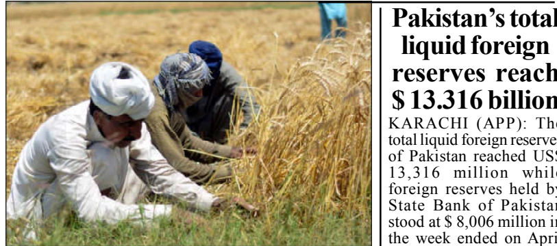
GUJRANWALA: Farmers are busy in their works at a Wheat Field to earn their livelihood for support their families, in Gujranwala.

ISLAMABAD (APP): Minister for National Food Security, Industries and Production Rana Tanveer Hussain Thursday expressed the firm commitment of the government for providing all-possible resources to local farmers in order to boost per-care yield of all major and minor crops. During his visit to National Agriculture Research Center (NARC), the minister said that agriculture is the backbone of the national economy, adding that the welfare of farmers and agricultural development were on the top priority of the current government. The improving crop yield without quality seed supply is difficult, he said adding that the research field holds importance in every aspect of life. He said that agriculture sector will be equipped with research and modern technology and government will provide farmers with all-possible resources. Ensuring healthy, non-toxic fertilizers for the agricultural revolution through modern technology is a priority, he said adding that the federal and provincial governments, along with all institutions including research centers, must play their role in development of agriculture sector. Utilizing modern technology to make the country self-sufficient in food was the need of the hour.