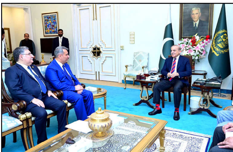
ISLAMABAD: Ambassador of the Republic of Azerbaijan, Khazar Farhadov calls on Prime Minister Muhammad Shehbaz Sharif.