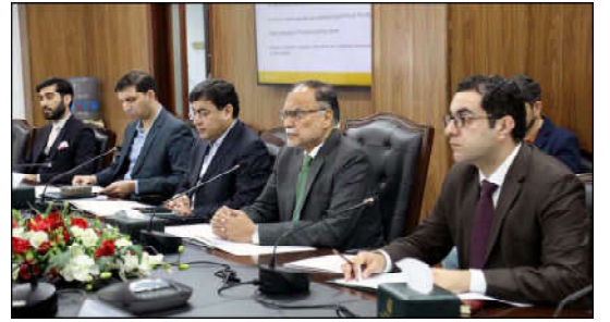
ISLAMABAD: Federal Minister for Planning, Development & Special Initiatives, Ahsan Iqbal in a meeting with key stakeholders to review Federal Public-Private Partnership Policy.

The meeting underscored the government's dedication to updating the PPP policy to reflect contemporary economic needs and demands, it said adding "The collective insights from this consultation are set to guide policy going forward, with an aim at enhancing the effectiveness in future PPP projects."