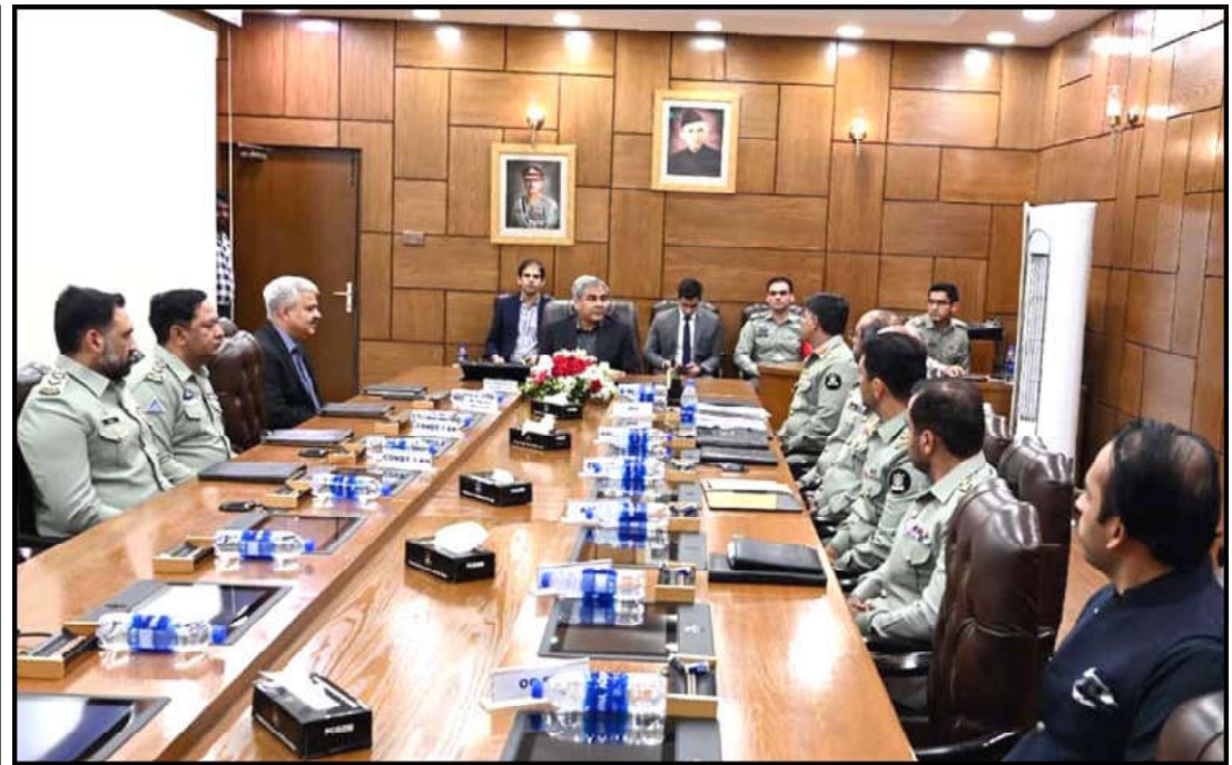
KARACHI: Federal Minister for Interior, Mohsin Naqvi chairing a meeting at Pakistan Coast Guards Headquarters in Karachi.

"Let's pledge to create a conducive environment for workers in Pakistan where they are valued and respected," he added.