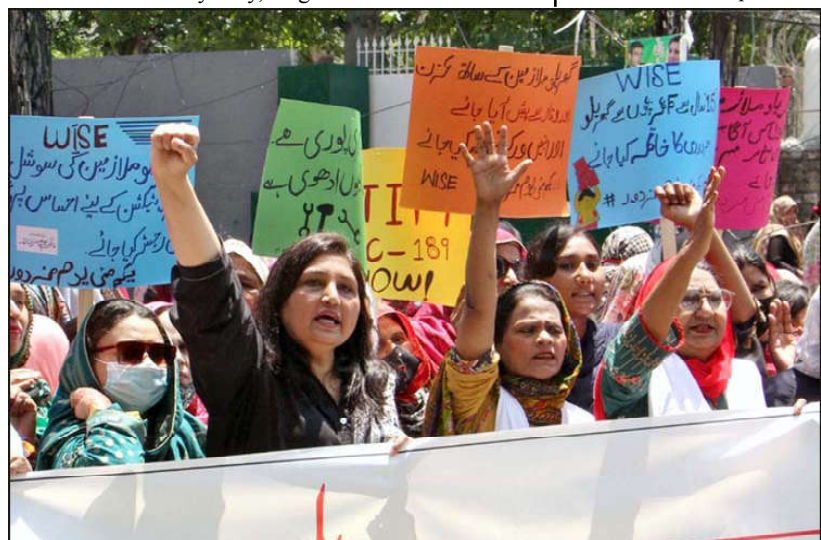
LAHORE: Women from different labour organization participating in rally outside Press Club on the occasion of International Labour Day, as International Labour Day is celebrated on May 1 every year. It's a day to honor and appreciate the contributions of workers all around the world. This day recognizes the hard work and dedication of people who work in various fields to make our lives better.

KARACHI (APP): Sindh Chief Minister Syed Murad Ali Shah on Wednesday said the provincial government was working hard for the economic stability of the labourers and also ensuring the provision of education and health facilities to their children. Greeting the workers in his message on the occasion of 1 st May Day, the Chief Minister said that the workers are the wheels of the country's economy. Shah said that our workers have played an important role in the development and prosperity of the country. The CM said that the provincial government was planning to launch a program for the uplift of the industrial as well as agricultural labourers.