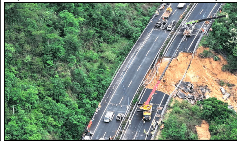
Part of an expressway collapsed in south China's Guangdong Province on after heavy rains.

Monitoring Desk LONDON: Sophie, Britain's Duchess of Edinburgh, has visited Ukraine, meeting with President Volodymyr Zelenskyy and his wife in the first trip to the country by a British royal since the conflict with Russia began, Buckingham Palace said. Sophie, 59, the wife of King Charles' youngest brother Prince Edward, made the surprise visit on behalf of Britain's Foreign Office to show solidarity with those impacted by the war and as part of her work to champion survivors of conflict-related sexual violence, the palace said in a statement. "It's true that women and girls pay the highest price in terms of human cost when it comes to the way that they are affected."