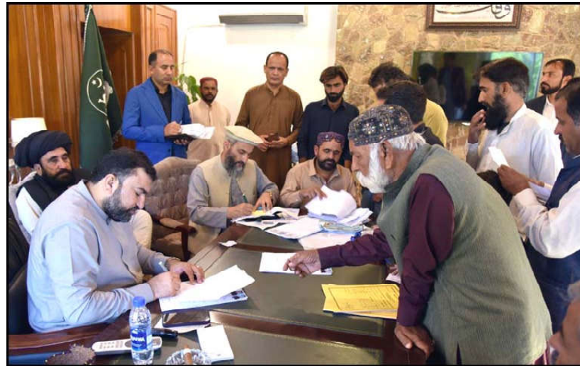
QUETTA: Chief Minister Balochistan Mir Sarfaraz Ahmed Bugti issuing directives on applications of people