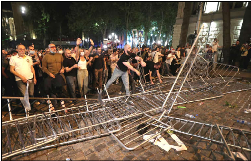
Demonstrators remove barriers near the parliament building during a rally to protest against a bill on "foreign agents" in Tbilisi, Georgia.

UAE official did not address whether talks had taken place but said bans on certain dual-use products "deemed essential in mitigating the conflict in Ukraine" had been issued and that preliminary data indicated there had been no export or re-export of such products so far this year. The official did not share the preliminary data. A U.S. State Department spokesperson said a U.S. delegation had visited the UAE as part of an ongoing dialogue about transshipment trends, especially of dual-use goods that support the Russian defence industrial base. Among Western concerns is that companies in the UAE are involved in the export of computer chips, electronics, machinery and other sanctioned products to Russia that could be used to aid Moscow's military effort against Ukraine.