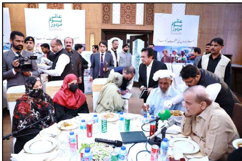
LAHORE: Prime Minister Muhammad Shehbaz Sharif interacting with families of labourers at a luncheon he hosted in their honour on the occasion of Labour Day.