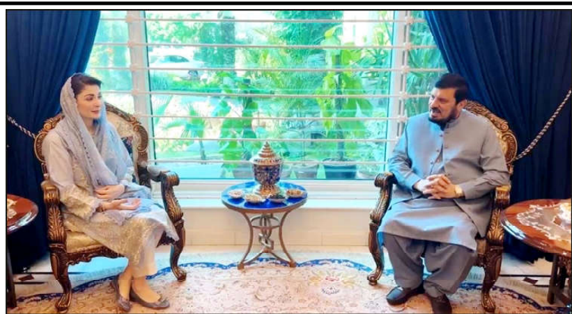
LAHORE: Governor Khyber Pakhtunkhwa Haji Ghulam Ali meeting with Chief Minister Punjab Maryam Nawaz Sharif at Jaati Umra.