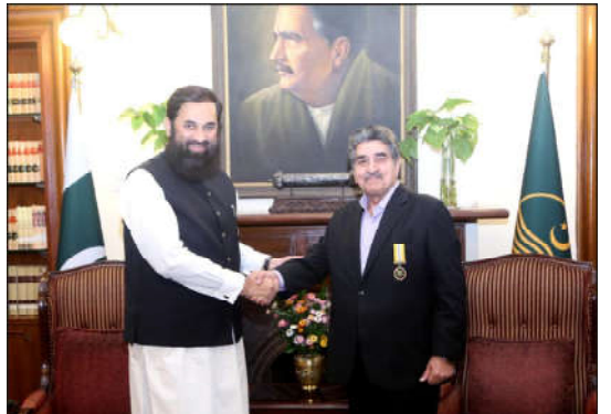
LAHORE: Governor Punjab Muhammad Balighur Rehman conferred tamga e Imtiaz on senior journalist, well-known anchor, Iftikhar Ahmed on behalf of the President of Pakistan in recognition of his outstanding contribution in the field of media at Governor House.