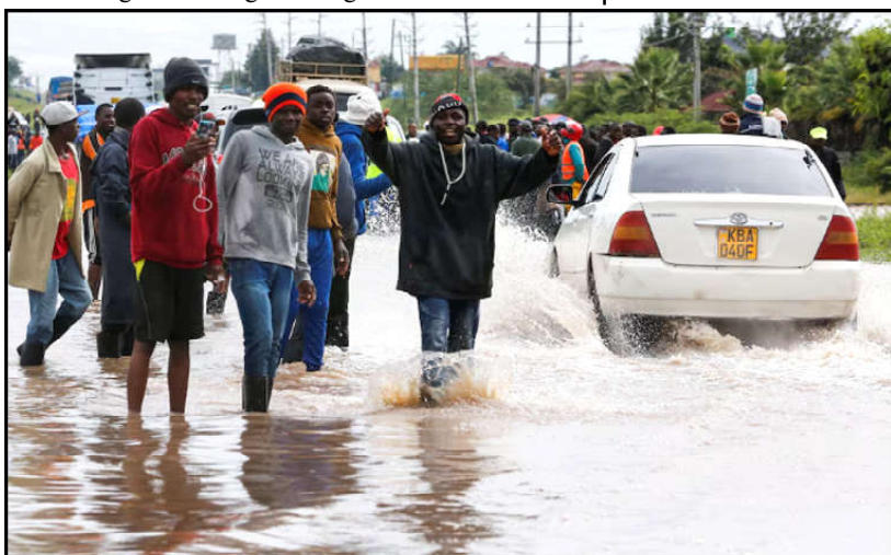
Volunteers direct traffic to clear the Athi River-Namanga highway that was affected after a seasonal river burst its banks following heavy rainfall in Kitengela municipality of Kajjido County, near Nairobi, Kenya.