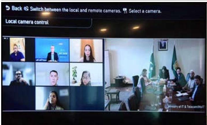
Minister for State for IT and Telecommunication Ms. Shaza Fatima Khawaja in a virtual meeting with members of Asia Internet Coalition (AIC) in Islamabad.