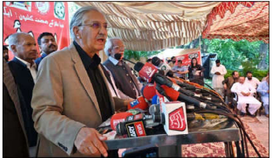
ISLAMABAD: Former Chairman Senate Syed Nayyar Hussain Bukhari addressing during function to mark the International Labour Day at National Press Club.

The Modi government cannot weaken the Kashmiris' spirit of freedom by resorting to massacres, arrests, and unjustified restrictions, he added.