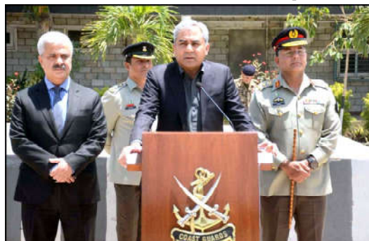
KARACHI: Interior Minister Syed Mohsin Naqvi addressing during visit Pakistan Coast Guards Headquarters.

The Interior Minister was briefed on the professional affairs of Pakistan Coast Guards, in which the efforts to fulfill the responsibilities of Coast Guards and prevent all kinds of smuggling, especially anti-narcotics activities.