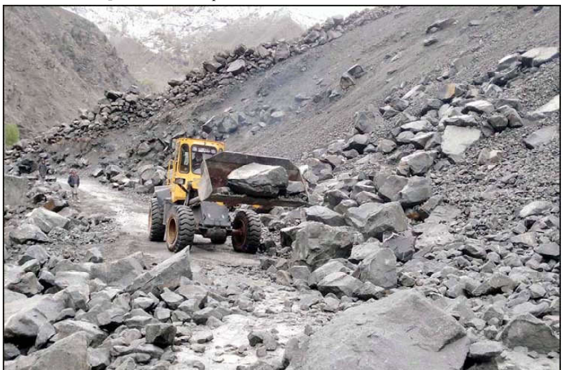
GILGIT: Workers of Gilgit-Baltistan Disaster Management Authority and GBPWD busy in clearing blocked road of Astore after heavy rain and land sliding in the area.

LAHORE (APP): In a decisive move, Punjab Senior Minister Maryam Aurangzeb has ordered a crackdown on illegal pyrolysis plants across the province, targeting areas like Sheikhpura and Mureedke. These plants, notorious for releasing toxic fumes by melting tires, have been swiftly shut down following the directive. In an order, numerous pyrolysis plants, including prominent ones like Aftab, Muza Nangal, and Suhdang, faced dismantlement and disconnection of electricity connections in a joint operation conducted by the Environmental Protection Department, Municipal Corporation, and district administration. Expressing grave concern over the health hazards posed by burning tires, Senior Minister Aurangzeb emphasized the urgency of cleansing Punjab's atmosphere of toxins, particularly for the safety of children. The emissions from these activities contribute to life-threatening diseases such as respiratory issues and cancer, warranting zero tolerance towards those jeopardizing human lives. She informed that the harmful smoke from burning tires contains carbon monoxide, a lethal gas, posing significant risks to public health.