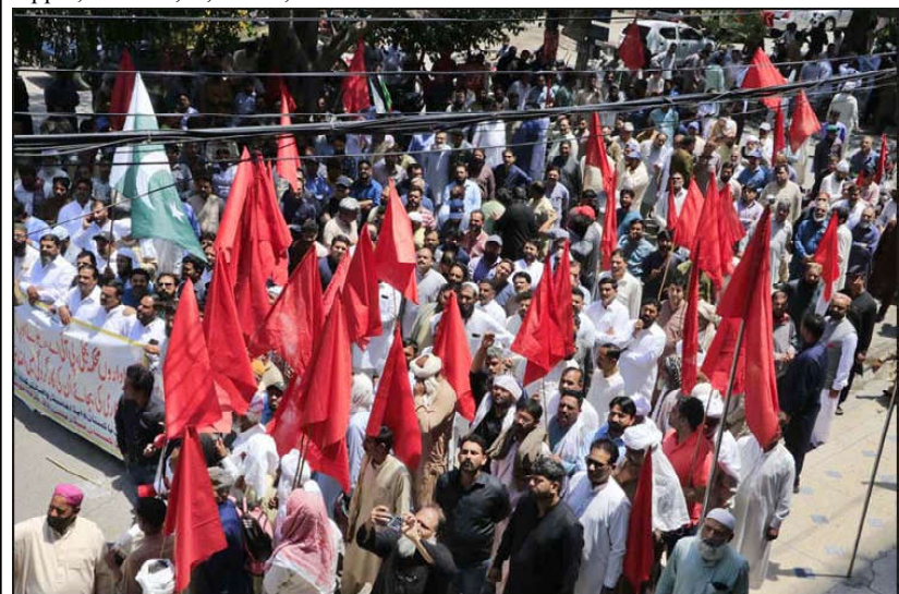
LAHORE: All Pakistan Federation of Trade Unions holding rally passing through Kasib Road on the occasion of International Labour Day, as International Labour Day is celebrated on May 1 every year. It's a day to honor and appreciate the contributions of workers all around the world. This day recognizes the hard work and dedication of people who work in various fields to make our lives better.