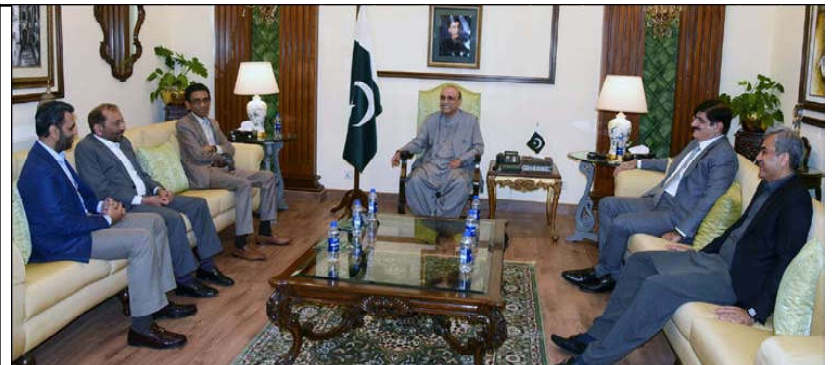
KARACHI: President Asif Ali Zardari in meeting with a delegation of Muttahida Qaumi Movement (MQM-P) led by Khalid Maqbool Siddiqui, held at CM House.

KARACHI (APP): Muttahida Qaumi Movement Pakistan (MQM-P) delegation led by Federal Minister Dr. Khalid Maqbool Siddiqui called on President Asif Ali Zardari here at CM House on Wednesday. MQM leadership congratulated Asif Ali Zardari on assuming the office of the President of Pakistan for the second time. Dr Farooq Sattar and Mustafa Kamal were part of the MQM Pakistan's delegation along with party convener Dr Khalid Maqbool Siddiqui. Sindh Chief Minister Syed Murad Ali Shah and Minister for Interior Mohsin Naqvi were also present on the occasion. President Asif Ali Zardari said that all the stakeholders would be taken on-board while carrying out affairs of the government. MQM delegation assured the President of their all possible cooperation.