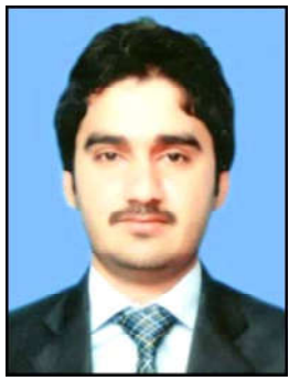
By Samiullah Umrani

Pakistan's policy approach may have begun to pay dividends. After Sharif met the Crown Prince, Riyadh committed to accelerating the initial round of a $5 billion investment package that had been previously discussed but was not materialized, in part because of the political unrest in Pakistan. In addition, the Crown Prince has agreed to travel to Pakistan on invitation of the Premier Shahbaz. Several significant initiatives will probably be launched during that visit. This may include the long-discussed Saudi involvement in the Reko Diq mining project and the commencement of construction on a $10-billion oil refinery at Gwadar Port. Sharif may have requested the Saudis for a new oil subsidy during his recent visit. A fresh subsidy would serve as a hedge against any future increases in the international oil market price that would jeopardize Pakistan's economic goals. In a tweet on X, the PM said "had many useful meetings, constructive discussions and productive engagements during my visit to Riyadh for WEF, and heading home now with plenty of ideas and plenty of work to do as we tackle the challenges of today and tomorrow." At the outset, PM Shahbaz Sharif's visit to the Kingdom is expected to restore confidence in Pakistan-Saudi Arabia relations further.