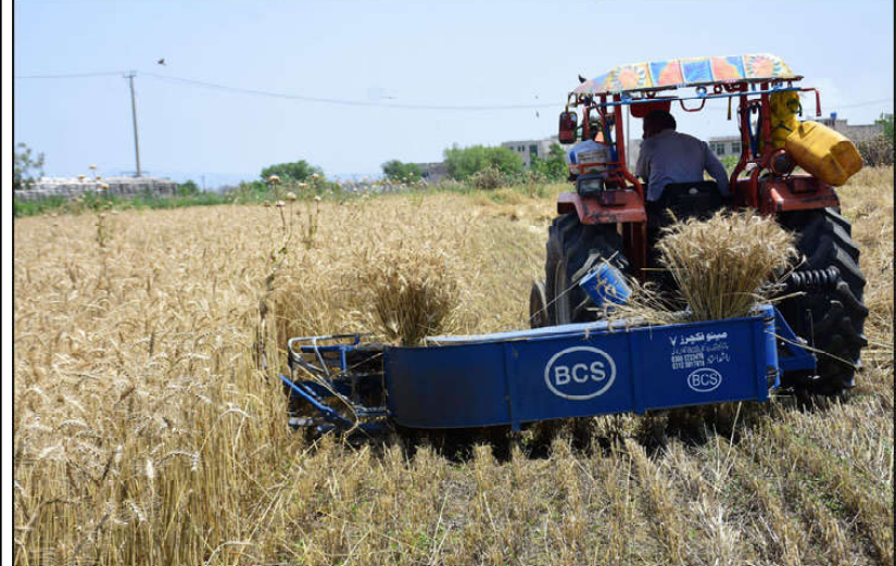
ISLAMABAD: Farmers driving machines to harvest wheat in a field in the Federal Capital.