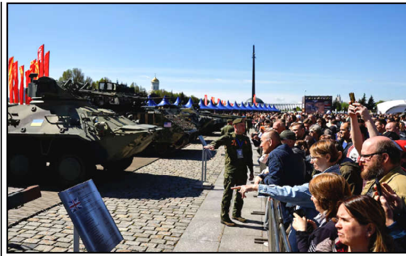
Visitors stand behind barriers while looking at military hardware at an exhibition, which displays armoured vehicles and equipment captured by the Russian army from Ukrainian forces in the course of Russia-Ukraine conflict, at Victory Park open-air museum on Poklonnaya Gora in Moscow, Russia.

have ravaged the territory since the start of the war on October 7, when Hamas launched a deadly and unprecedented attack on Israel. But Netanyahu has pledged to destroy Hamas, and he said the Israeli army stopping the war "before achieving all of its goals is out of the question." "We will enter Rafah and we will eliminate the Hamas battalions there with or without a deal," he told families of hostages still being held in Gaza, his office said. Guterres implored Israel and the Palestinian Islamist movement Hamas to reach a truce "now," and reiterated his call for Israel to allow more humanitarian aid into Gaza, including through the UN agency for Palestinian refugees, or UNRWA.