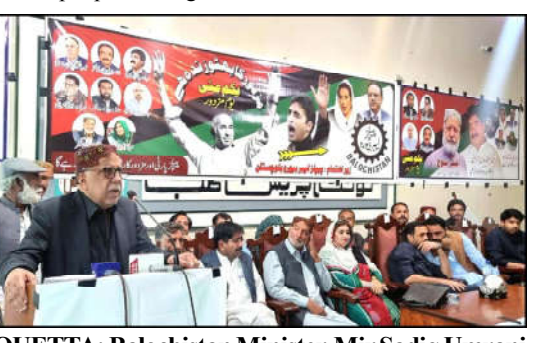
QUETTA: Balochistan Minister, Mir Sadiq Umrani addresses participants during ceremony organized by Peoples Labour Bureau Balochistan on the occasion of International Labour Day

"Pakistan condemns terrorism in all its forms and manifestations, including despicable attacks on places of worship", it added.