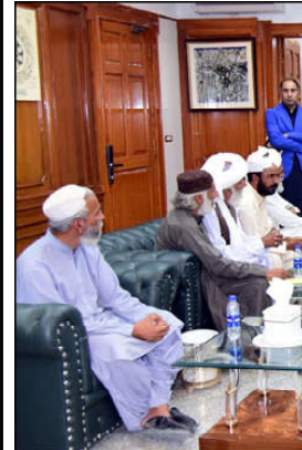
QUETTA: A delegation of tribal elites meeting with Chief Minister Balochistan Mir Sarfraz Ahmed Bugti