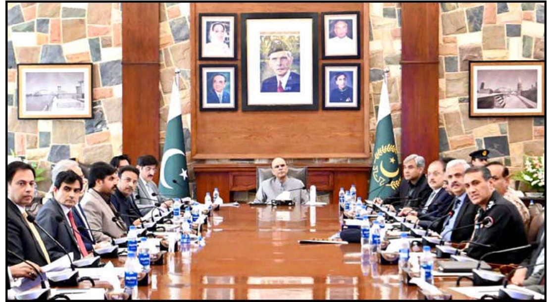
KARACHI: President Asif Ali Zardari being briefed about the overall security, law and order situation of the Sindh province at the Chief Minister House.