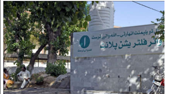
ISLAMABAD: A view of out of order water filtration plant at a Katchi Abadi sector G-7 in the Federal Capital, as needs to attention for concern authority.

Expressing heartfelt wishes for the well-being and prosperity of every laborer within the country,