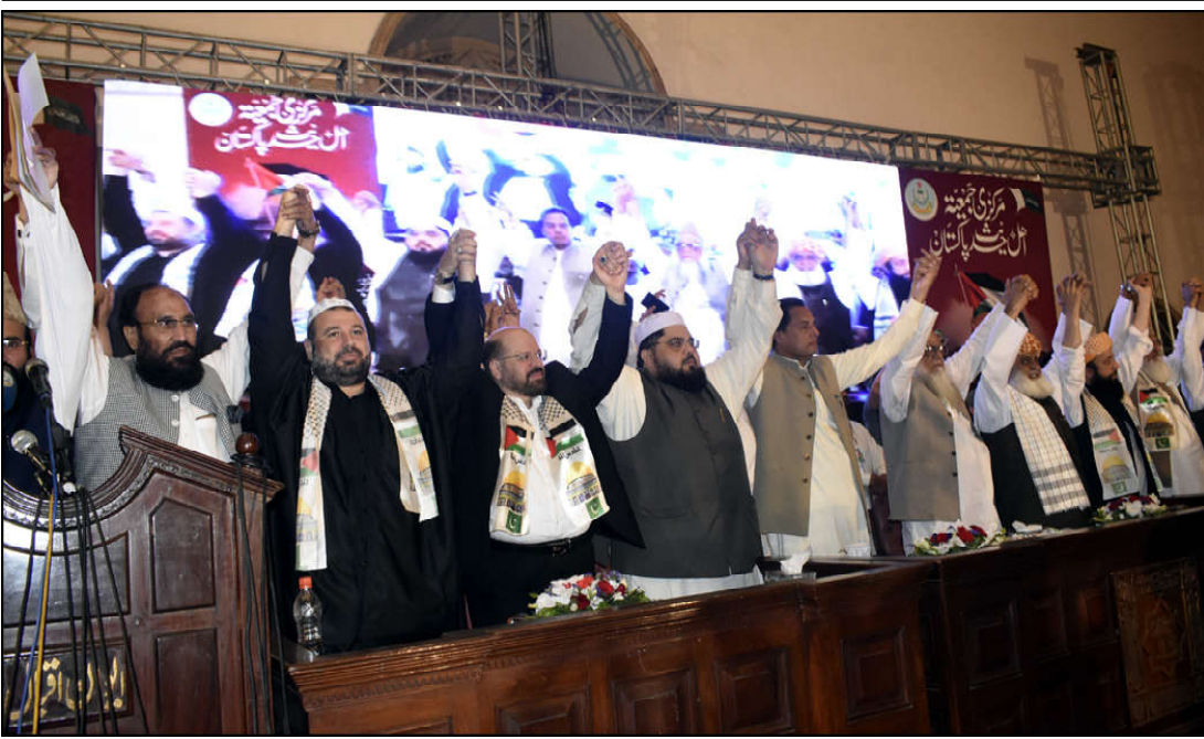
LAHORE: Political leaders joined hands to express solidarity with the Palestinians on the occasion of the National Palestine Conference organized by the Central Jamiat Ahl Hadith Pakistan at Aiwan-e-Iqbal of the provincial capital.