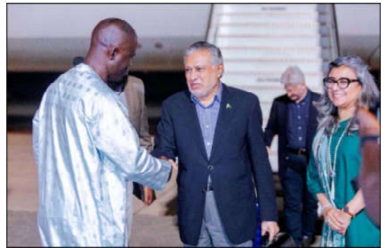
BANJUL: - Deputy Prime Minister and Foreign Minister Mohammad Ishaq Dar arrives in Banjul, the Gambia for the 15th OIC Islamic Summit. He received by the Gambian Minister of Petroleum and Energy Nani Juwara.