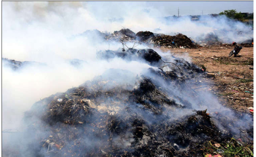
ISLAMABAD: Smoke billows near Sabzi Mandi, endangering people's health. Lack of Waste management creates environmental pollution in the Federal Capital.

The panel unanimously agreed on the significance of education as a fundamental right for every child. They emphasized that access to education not only empowers individuals but also plays a vital role in shaping a prosperous society. Addressing the underlying socio-economic factors contributing to child labor was another focal point of the discussion, the panelists stressed the need for holistic approaches that tackle poverty, inequality,