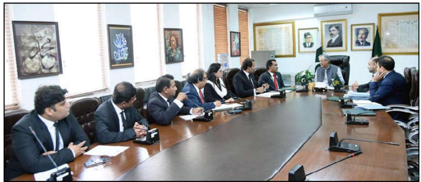
ISLAMABAD: A delegation from the Implementation Minority Rights Forum (IMRF) and the Christian Lawyers Association Pakistan (CLA) had a meeting with Federal Minister for Law and Justice Senator Azam Nazeer Tarar.

At these facilities, trained professionals also provide psycho-social support to help them recover from trauma and raise awareness on protection from violence and abuse. Later, the delegation visited a flood-damaged public school which UNICEF has since rehabilitated. Besides teaching and learning materials, UNICEF has also provided safe drinking water and sanitation facilities.