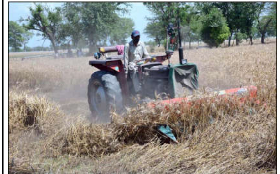
FAISALABAD: Farmer busy in cutting wheat crop with the help of tractor in his field.