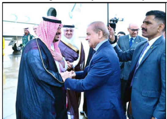
RIYADH: Prime Minister Muhammad Shehbaz Sharif departs for Pakistan after participating in a special meeting of the World Economic Forum.