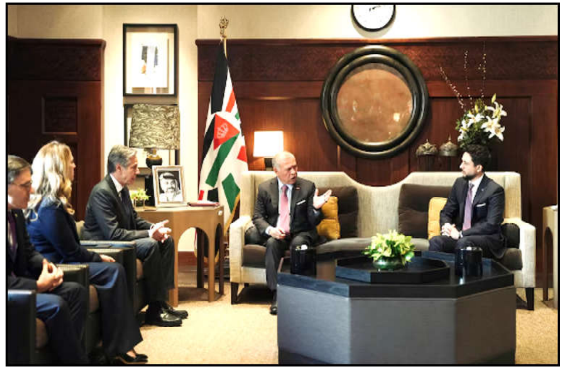
U.S. Secretary of State Antony Blinken meets with Jordan's King Abdullah II and Jordan's Crown Prince Hussein in Amman, Jordan, in this handout image released by Royal Hashemite Court (RHC).

trary: we are working day and night for a two-state solution," the ministry said. "We are the largest donor of humanitarian aid to the Palestinians. We are working to ensure that aid reaches the people in Gaza." But it added that Israel has the right to defend itself and said more than 100 hostages are still being held by Hamas, "which is abusing the people of Gaza as shields." The court noted that Germany had granted only four export licenses to Israel for weapons of war since the start of the conflict, two for training ammunition and one for test purposes, as well as one consignment of "3,000 portable anti-tank weapons."