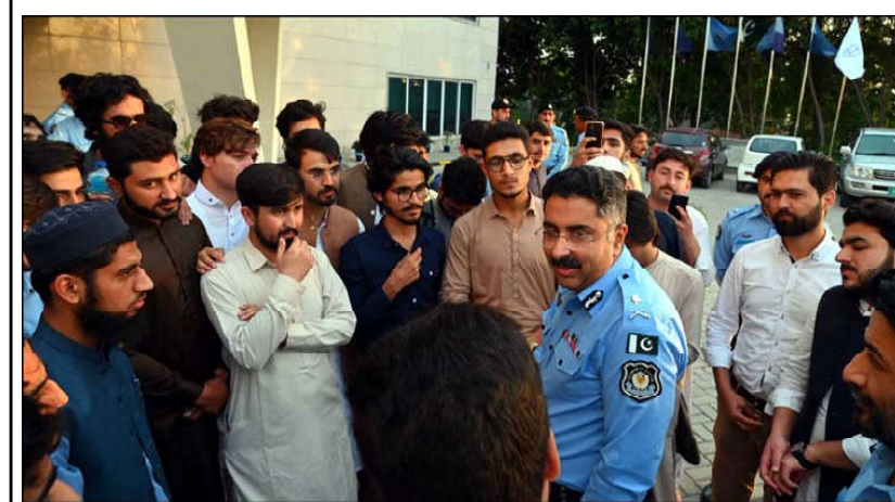
ISLAMABAD: A group of people, including students and police officers, gathered for an awareness lecture.

At the conclusion of the event, IGP Islamabad and the students mingled, and the student delegation reaffirmed their full coop-