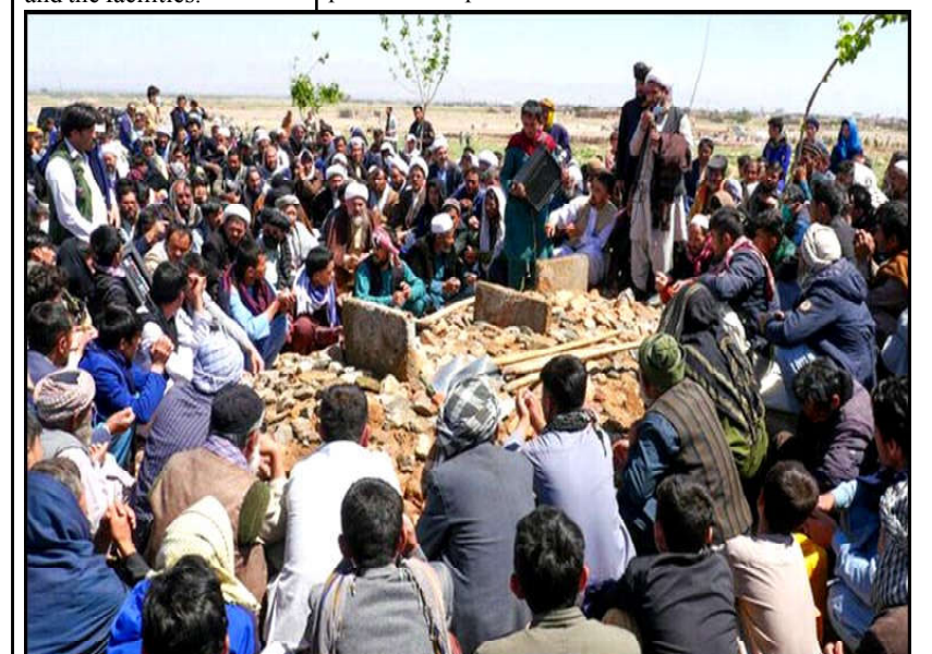
Afghans mourn at a burial ceremony of the slain Shia Muslims after gunmen attacked a mosque in Guzara district of Herat province.