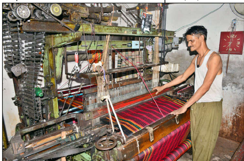
HYDERABAD: A worker preparing cloth on power loom in a local factory as International Labour Day is celebrated on May 1 every year. It's a day to honour and appreciate the contributions of workers all around the world. This day recognizes the hard work and dedication of people who work in various fields to make our lives better.