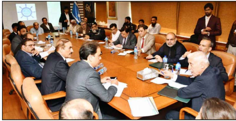
KARACHI: Federal Minister for Maritime Affairs, Qaiser Ahmed Sheikh chairing meeting regarding shipping companies regulations with business communities and other officials at PNSC.