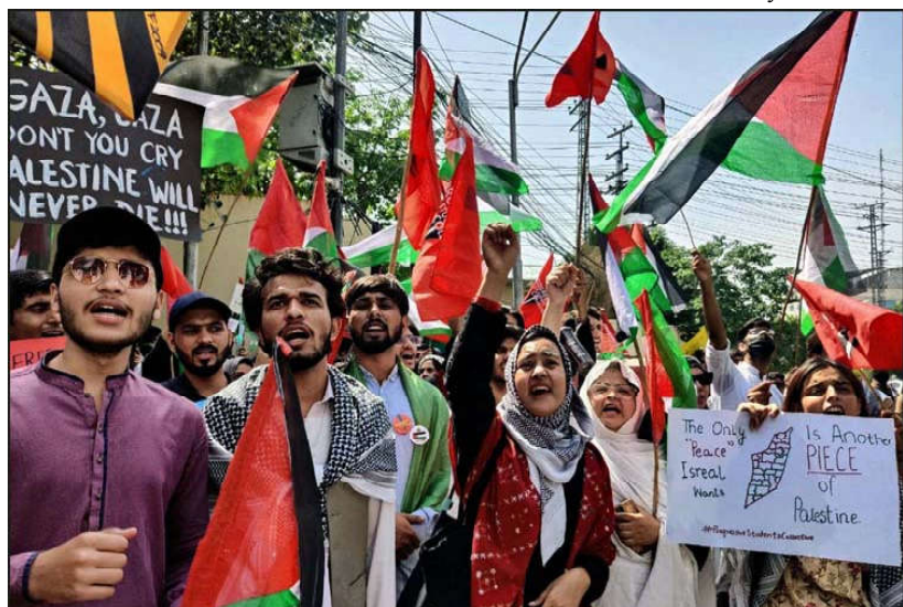
LAHORE: Members of Progressive Students Federation are holding protest demonstration against Israeli aggression and atrocities on the Gaza Strip and solidarity with the Palestinians, nearby American Consulate in Lahore.