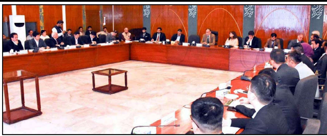
ISLAMABAD: Federal Minister for Planning, Development & Special Initiatives, Ahsan Iqbal chairs a meeting with Chinese enterprises working in Pakistan to discuss their challenges and recommendations for CPEC Phase II projects.