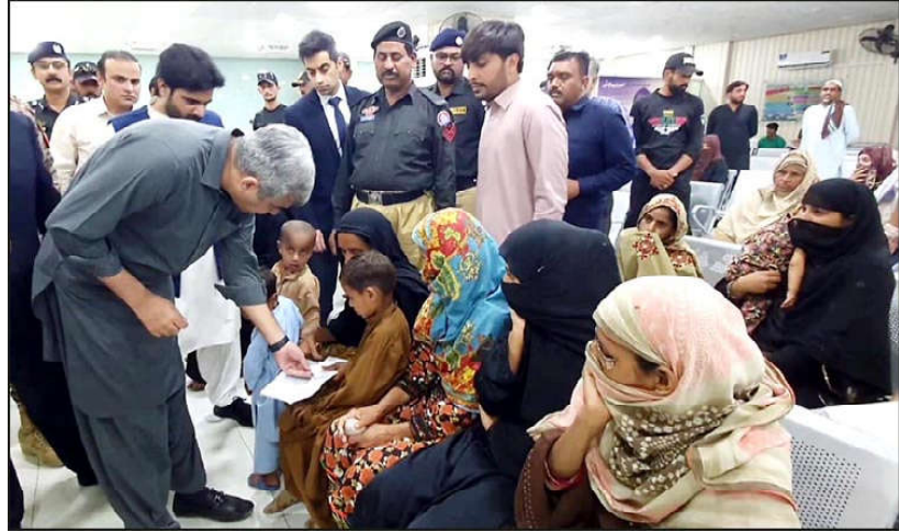
SUKKUR: Federal Minister for Interior Mohsin Naqvi listening to the issues of women during his visit to Sukkur's NADRA Center.

The CM ordered the chief secretary to devise a pool of competent professionals from various fields, adding that the program for the provision of free medicines at the doorstep will start in May. The cabinet approved empowering deputy commissioners to enforce Section 144 in Punjab.