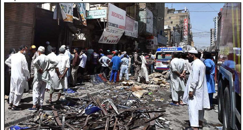
KARACHI: People gather around the shop which was subjected to a cylinder explosion claimed the life of one individual and left six others wounded in Karachi's New Chhali area.

The NourishMaa Campaign aims to "improve the knowledge and capacity of Health Care Providers (HCPs) and Key Opinion Leaders (KOL) to advance maternal Nutrition interventions in Pakistan". He furthered that the program is planned to be inaugurated in provinces by minister health next month. NourishMaa campaign uses a three pronged approach to sensitize health care practitioners/ female health workers on maternal nutrition through policy influence.