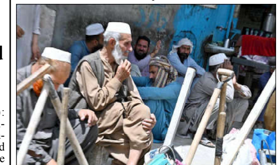
ISLAMABAD: Labourers sitting along with tools waiting for their daily job as International Labour Day is celebrated on May 1 every year. It's a day to honour and appreciate the contributions of workers all around the world.