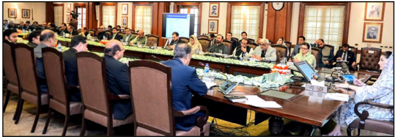
LAHORE: Punjab Chief Minister Maryam Nawaz Sharif presides over the 6th Punjab Cabinet meeting.

10,204,647 are receiving education in government, private, Madrasah, Sindh Education Foundation, and other institutions, while 4.1 million are out-of-school. Breaking down the numbers, he stated that 4.5 million children attended government schools, 3.9 million attended private schools, and 840,000 children attended Sindh Education Foundation. Additionally, 500,000 children attended Madrasahs, and 500,000 attended federal/Pak Army/ Navy schools. The Chief Minister has stated that in 2019, UNICEF Sindh conducted a sample study to determine the reasons behind children not attending school in the province.