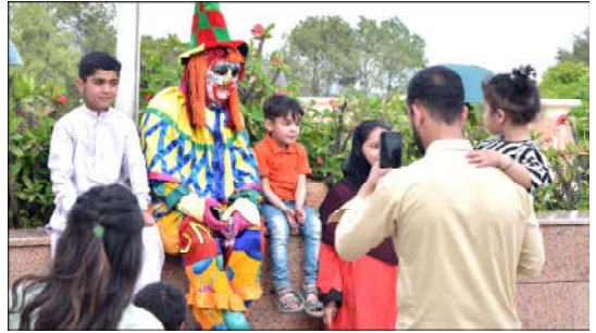
ISLAMABAD: A man taking a photo of his children with a clown during their visit to Pakistan Monument.