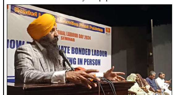
LAHORE: Punjab Minister for Minorities Affairs Ramesh Singh Arora addressing a ceremony organized in connection with International Labour Day.

He reiterated the government's commitment to safeguarding the rights of workers and providing maximum relief to the labour class amid the prevailing challenging circumstances. The Speaker concluded by affirming that the protection of workers' rights and alleviating their current difficulties remain among the government's top priorities.