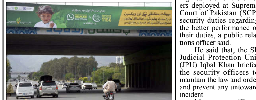
ISLAMABAD: A view of a board fixed on Zero Point Bridge in connection with polio vaccination campaign 2024, in the Federal Capital.

To further support the well-being of workers, a Memorandum of Understanding (MoU) was signed between the Labour Welfare Department and Hashoo Foundation to combat child labour. Another positive development was the Nirma-e-Millat Foundation's announcement of scholarships for 50 children of deserving workers with the help of Labour Department. Women were also the focus at the event, with Mustafa Eye Trust distributing 100 sewing machines to working women, providing them an opportunity for financial independence.