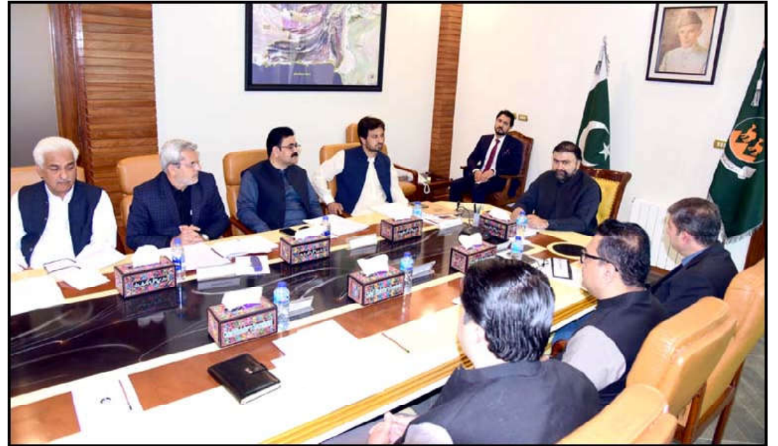
QUETTA: Chief Minister Balochistan Mir Sarfaraz Ahmed Bugti presiding over a view meeting of Livestock & Dairy Development Department