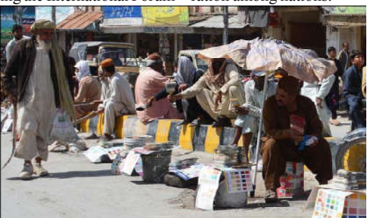
QUETTA: Daily wages labors sitting with their work tool along road side while waiting for customers to earn money for their family on eve of International Labor Day.