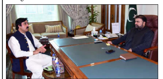
QUETTA: Provincial Food Minister Haji Noor Muhammad Dumar meeting with Chief Minister Balochistan Mir Sarfaraz Ahmed Bugti

ISLAMABAD (INP): Pakistan Tehreek-e-Insaf lambasted the fake inept Punjab government for economic murder of farmers by destroying their livelihoods through its wrong, flawed and anti-people policies and strongly condemned the harassment and use of force against the farmers. PTI Spokesperson, in a strongly-worded reaction over the farmers' protest against the mandate theft government's delay in procuring wheat and harassment of farmers, vehemently denounced the detention of Punjab Kisan Board head and harassment of the farmer leaders through illegal raids at their houses. He noted that the farmers were coerced to sell wheat in the open market at a much lower than the officially fixed rate owing to the inept and incompetent imposed government's faulty and anti-poor policies with regard to the procurement of wheat.