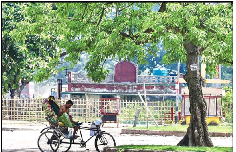
A Cycle-Rickshaw puller takes a break under the shade of a tree to shelter from the heat in Dhaka.