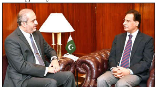
ISLAMABAD: Ambassador of Qatar Ali Mubarak Ali Essa Al-Khater called on Speaker National Assembly Sardar Ayaz Sadiq at Parliament House.