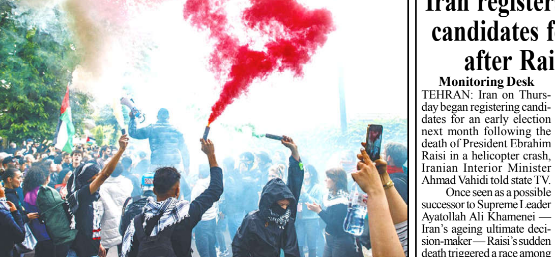
Wood told the 15-member Monitoring Desk council. An airstrike on Sun-UNITED NATIONS: Israel must do more to proday set off a blaze in a tent camp in Rafah in southern tect Palestinian civilians in Gaza and should "remove Gaza, killing at least 45 people. Israel — a US ally — said it had targeted all barriers to the flow of 26 extra days aid at scale through all crossings and routes" into of extreme

Haiti's political process following Prime Minister Ariel Henry's resignation in March after he left Haiti to seek support for the Kenvan security mission and was unable to re-enter the country