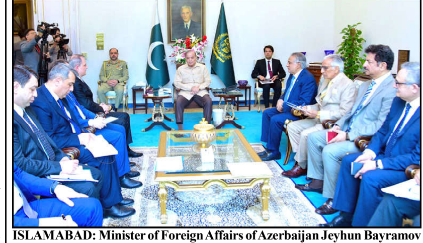
calls on Prime Minister Muhammad Shehbaz Sharif.

Islamabad later this year Ishaq Dar thanked would give further impetus Azerbaijan for its constant to economic cooperation