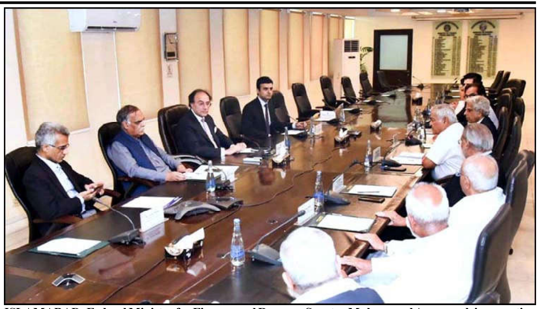
ISLAMABAD: Federal Minister for Finance and Revenue Senator Muhammad Aurangzeb in a meeting with the representatives from Pakistan Association of Large Steel Producers (PALSP), Pakistan Steel Melters Association (PSMA), Pakistan Steel Re-Rolling Mills Association (PSRMA) and Pakistan Steel Pipelines Association (PSPA).