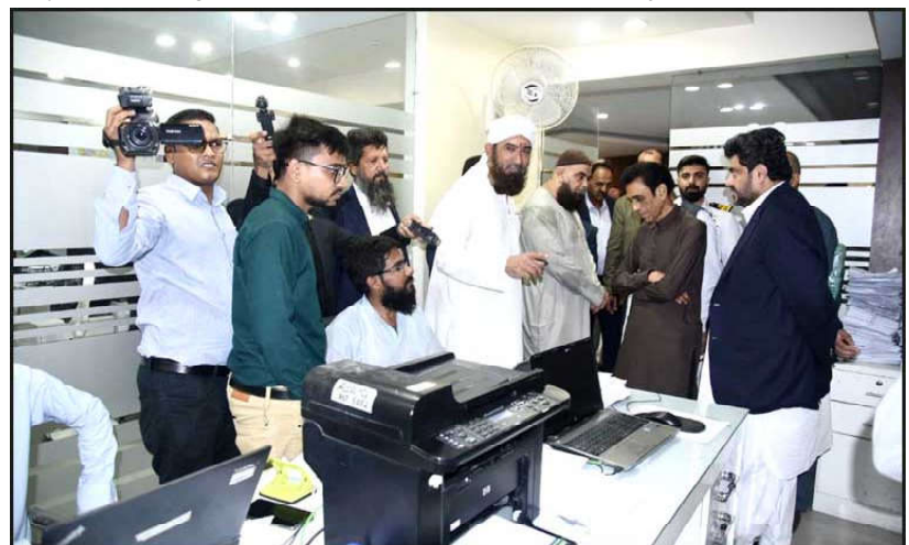
KARACHI: Governor Sindh Kamran Khan Tessori being briefed during his visit to Sallani Welfare Trust. Federal Minister Dr. Khaliq Maqbool is also present.