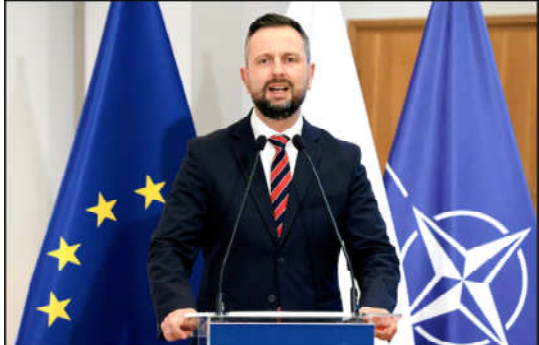
Polish Minister of Defence Wladyslaw Kosiniak-Kamysz presents details of "East Shield", a 10 billion zloty ($2.55 billion) program to beef up defenses along its eastern border with Belarus and Russia, in Warsaw, Poland.

Rafah residents said Israeli tanks had pushed into Tel Al-Sultan in the west and Yibna and near Shaboura in the centre before retreating towards a buffer zone on the border with Egypt, rather than staying put as they have in other offensives. "We received distress calls from residents in Tel Al-Sultan where drones targeted displaced citizens as they moved from areas where they were staying toward the safe areas," the deputy director of ambulance and emergency services in Rafah, Haitham al Hams, said. Palestinian health officials said 19 civilians had been killed in Israeli air strikes and shelling across Gaza. Israel accuses Hamas militants of hiding among civilians, which the militants deny.