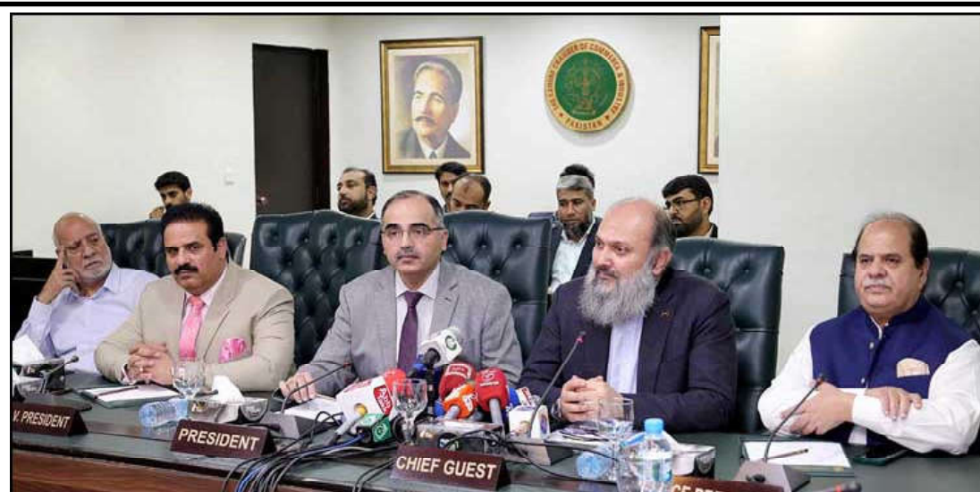
LAHORE: Federal Minister for Commerce Jam Kamal Khan addressing during his visit to Lahore Chamber of Commerce and Industry.