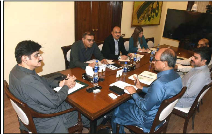
KARACHI: Sindh Chief Minister, Syed Murad Ali Shah presides over a meeting of the Local Government Department, held at CM House in Karachi.

They also commended Pakistan's efforts to preserve and promote its Buddhist heritage sites and cultural artifacts.