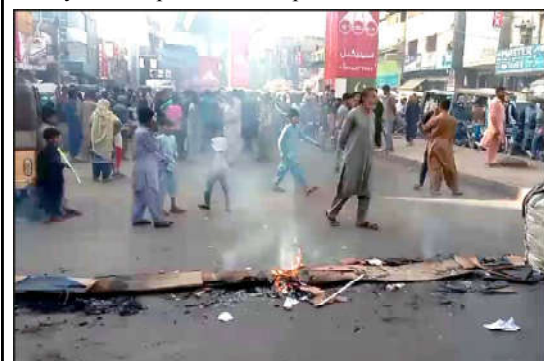
KARACHI: Residents of Gulbahar blocked road and burn tyres and bushes as they are holding protest demonstration prolong electricity load shedding during the extreme hot weather of summer season, in Karachi.

Dharijo also highlighted that 600 personnel are currently undergoing training in Sukrand for the new anti-terrorist force (ATF), which will be equipped to handle emergency situations. Moreover, Hatri police station is being developed as a model police station to set a standard for improving police station culture.