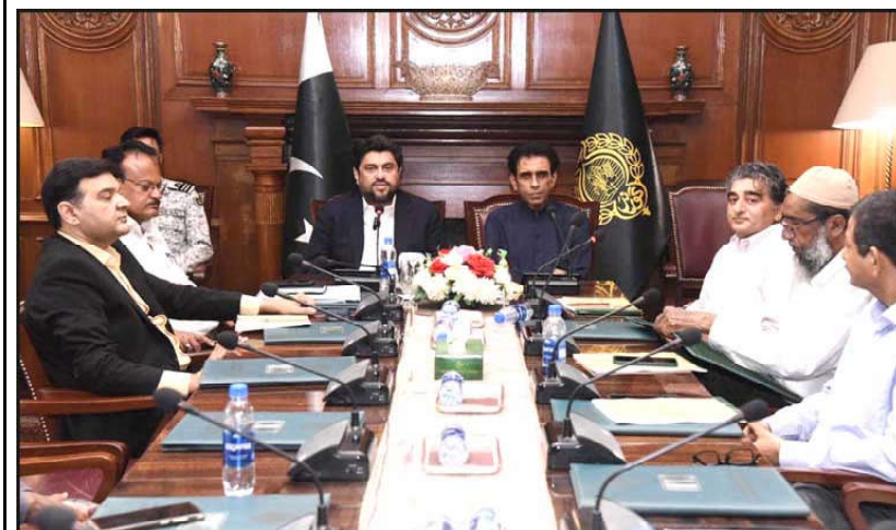
KARACHI: Governor Sindh Kamran Khan Tessori presiding over a meeting of PSDP. Federal Minister Dr. Khalid Maqbool is also present.

"We ensure fair and transparent disbursements, and deserving women receive their due stipend without any hassle."