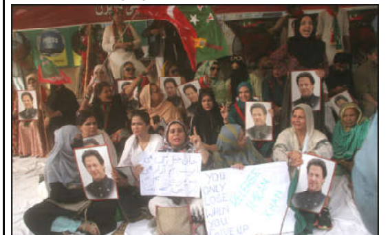
KARACHI: Pakistan Tehreek-e-Insaf activists hold a protest demonstration for the release of Imran Khan outside the Karachi Press Club.

He noted that strengthening the economy through mango-related programs is a key objective. The DC highlighted various events planned for the festival, including a technical agricultural seminar, the Sindh agricultural seminar, the traditional Sindh game Malakhara, and a cultural musical night organized by the Department of Culture.