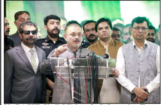
KARACHI: Sindh Minister for Information, Transport and Mass Transit, Excise Taxation and Narcotics Control, Sharjeel Inam Memon talks with media persons during the inauguration ceremony of the New Biometric Vehicle Registration System Counters, at Civic Centre building in Karachi.

No one reminds Saqib Nisar – the former chief justice – in good terms and he remained active facilitator of PTI, he said.