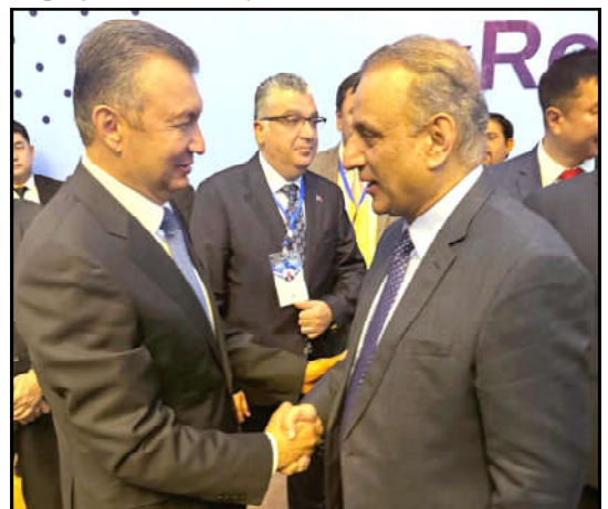
Federal Minister for Communications, Investment Board and Privatization, Abdul Aleem Khan met with Prime Minister Tajikistan, Kokhir Rasulzoda in Dushanbe.

Governor was briefed that efforts were afoot to ensure timely completion of these schemes so that people could be benefitted.