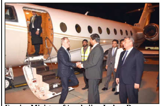
Foreign Minister of Azerbaijan Jeyhun Bayramov arrives in Islamabad. He was received at the Islamabad International Airport by Additional Foreign Secretary (Afghanistan and West Asia) Ahmed Naseem Warraich.

On the fiscal front, during July-March FY24, the revenue growth outpaced the growth in expenditures. Within revenues, both tax and non-tax collection grew significantly by 29.3 per cent and 90.7 per cent, respectively.