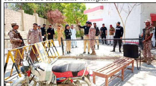
LARKANA: View of site while security officials are cordon off the site for inspection and rescue operation after hand grenades attack outside the ASP Office in Larkana.