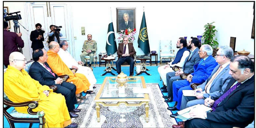
ISLAMABAD: A delegation of Buddhist Monks led by Minister of Buddhadasana and Religious Affairs of Sri Lanka Vidura Wickramanayaka calls on Prime Minister Muhammad Shehbaz Sharif.

This satellite project is a hallmark of technological cooperation between the People's Republic of China and Pakistan and is expected to revolutionise communication in Pakistan.