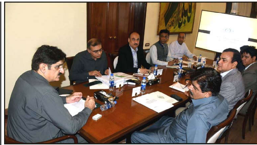
KARACHI: Sindh Chief Minister, Syed Murad Ali Shah presides over a meeting of the Education Department, held at CM House in Karachi.