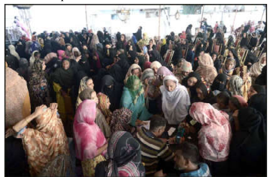
KARACHI: A large numbers of poverty-ridden women beneficiaries of Benazir Bhutto Income Support Program (BISP) gather for their turn to get cash, at Lyari Moosa Lane Bhatti Hall in Karachi.

He said that Shaheed Zulfikar Ali Bhutto made this country an atomic power, and serving this city is Chairman Bilawal Bhutto Zardari's vision.