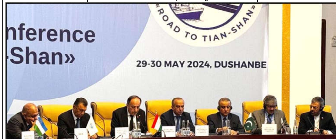
Federal Minister for Communications, Investment Board and Privatization, Abdul Aleem Khan addressing an International Conference in Dushanbe.

Final approval to reduction in price of petroleum products will be accorded by Prime Minister Shehbaz Sharif.