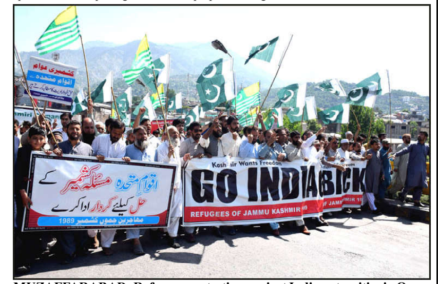
MUZAFFARABAD: Refugees protesting against Indian atrocities in Occupied Kashmir for the sake of independence by raising the flags of Pakistan and Kashmir at Azadi Chowk.

ment underscores the urgent need for resolution, as the utility company grapples with mounting financial pressure amidst ter and Sewerage Board alone accounts for Rs. 5 maintenance demands.