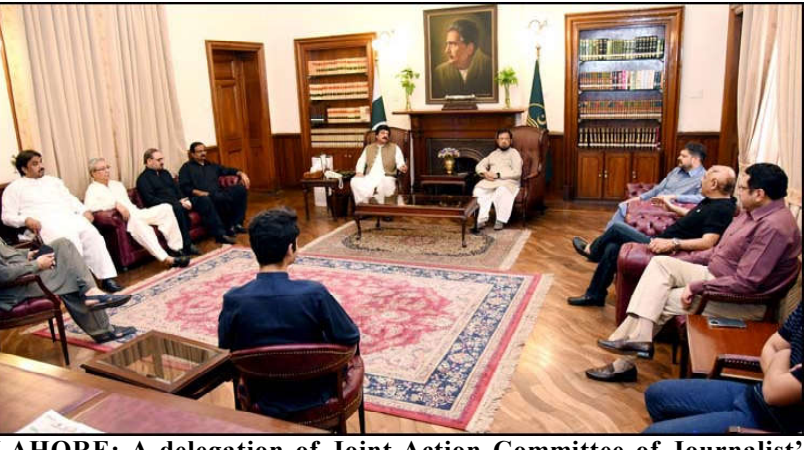
LAHORE: A delegation of Joint Action Committee of Journalist Organizations called on Punjab Governor, Sardar Saleem Haider Khan at Governor House.