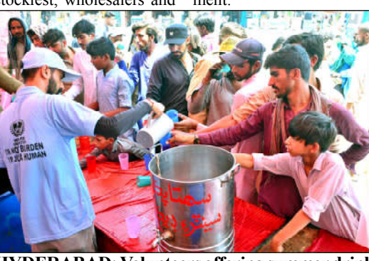
HYDERABAD: Volunteers offering summer drink to people at heat stroke camp organized by Pukar welfare organization due to scorching hot weather at Qasimabad.

Muhammad Aurangzeb, Pakistan has initiated negotiations with the IMF for a new multibillion dollar loan agree-