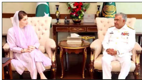
LAHORE: Chief of the Naval Staff Admiral Naveed Ashraf meeting with Punjab Chief Minister Maryam Nawaz.

India has no right to make unilateral decisions on the status of disputed territory against the will of parties in the dispute - Kashmiris and Pakistan, she added.