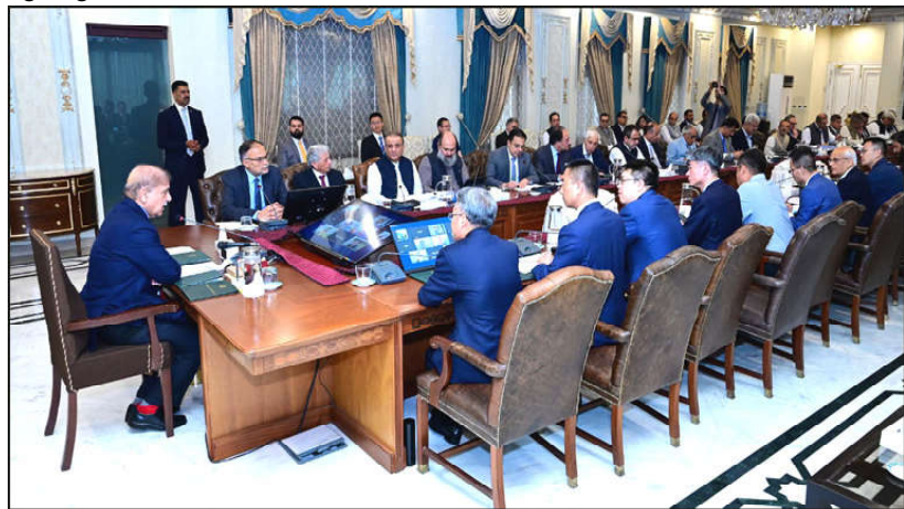
ISLAMABAD: A delegation of representatives from Chinese companies in Pakistan meeting with Prime Minister Shehbaz Sharif.