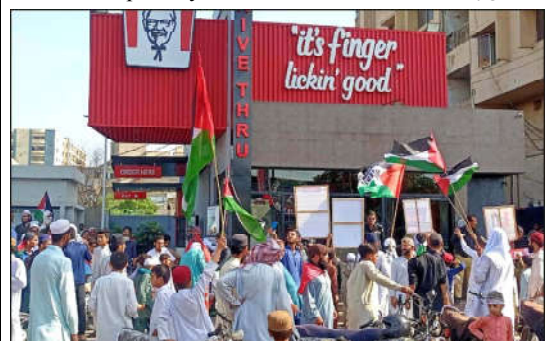
KARACHI: Members of Religious Organization are holding protest demonstration against Israeli aggression and atrocities on the Gaza Strip and solidarity with the Palestinians, outside Kentucky Fried Chicken (KFC) restaurant branch located on Shahrah-e-Faisal in Karachi.