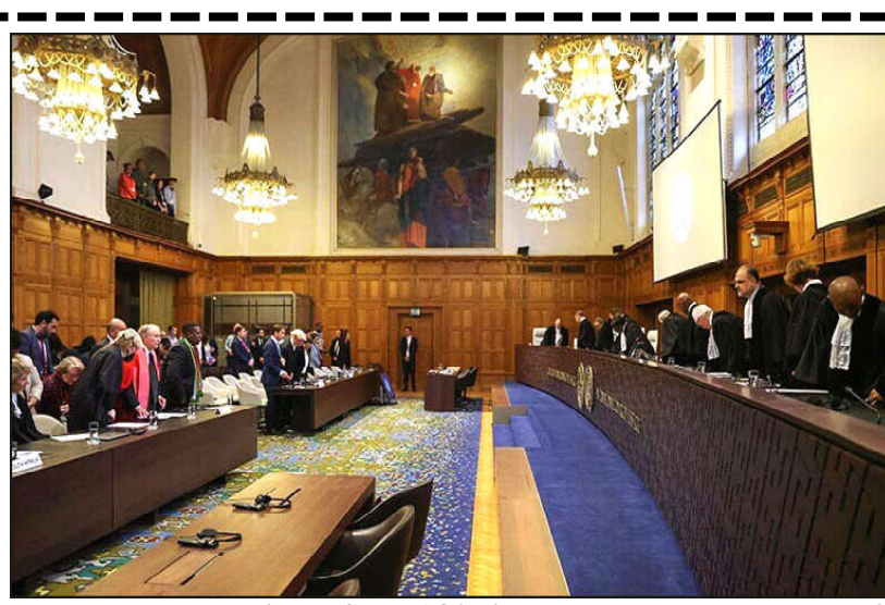
Delegates attend a ruling on South Africa's request to order a halt to Israel's Rafah offensive in Gaza as part of a larger case accusing Israel of genocide at the International Court of Justice in The Hague.

BANGKOK: Vietnam's rubber-stamp parliament voted in public security minister To Lam as the country's new president on Wednesday, after a major anti-corruption campaign forced his predecessor to resign. Thousands of people—including several senior government and business leaders—have been caught up in the Southeast Asian country's "blazing furnace" crackdown on graft, led by Communist Party General Secretary Nguyen Phu Trong. Analysts have said that Lam, who is deputy head of the steering committee on anti-corruption, has weaponised its investigations to take down his political rivals. In his first remarks as president, Lam said he was "determined to fight corruption and negative phenomena".