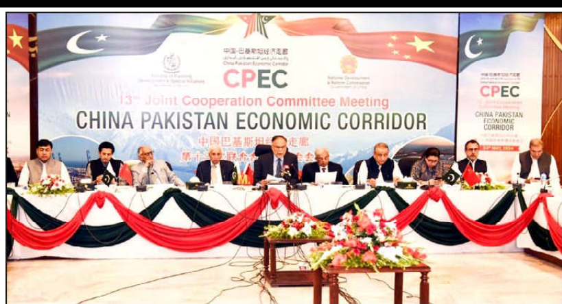
Federal Minister for Planning Development and Special Initiatives, Prof. Ahsan Iqbal co-chairing the 13th JCC meeting with China on CPEC in Islamabad.

KARACHI (INP): A 10-year-old child died in hit-and-run accident at Lyari Expressway Karachi on Friday, police said. According to details, an over speeding vehicle ran over a 10-year child near Teen Hatti Bridge killing him on the spot. The driver responsible for accident sped the scene. The body was shifted to hospital for post-mortem and police after registering a case against unidentified driver started search for him.