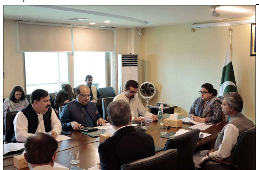
ISLAMABAD: Minister of State for IT and Telecommunication Ms. Shaza Fatima Khawaja chairing 49th Universal Service Fund (USF) Policy Committee meeting.

The Endowment of Economic Security Chair at IPRI is for a period of three years, and it will be known as 'IPRI-OGDCL Chair'.