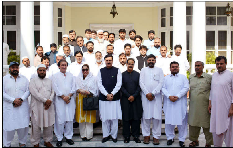
PESHAWAR: Khyber Pakhtunkhwa Governor, Faisal Karim Kundi in a group photo with delegation of elected representative Local Government led by ANP Leader Samar Bilour.

ATTOCK (APP): Deputy Commissioner Attock Rao Atif Raza Friday said that people should ensure the implementation of the code of conduct issued by the Punjab government to eradicate the dengue mosquito so that this epidemic can be effectively controlled. He expressed these views while presiding over a meeting in connection with the anti-dengue campaign at DC Office Attock.