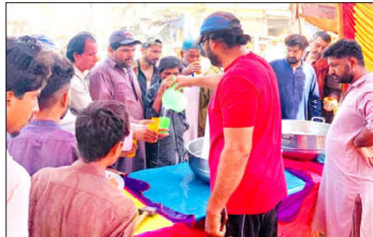
LARKANA: People are drinking juice to beat the heat of scorching sun during the hot weather of summer season at a camp of heat stroke arranged by Municipal Corporation, in Larkana.