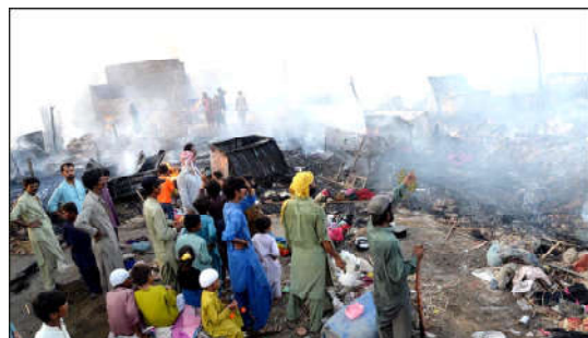
HYDERABAD: A view of smoke rise from burning huts after fire caught some 70 makeshifts turn into ashes in the incident near Alamdar Chowk, Qasimabad.

HYDERABAD (APP): The Divisional Commissioner Hyderabad Ahsan Ali Qureshi, along with Mayor Hyderabad, Kashif Shoro and Deputy Commissioner Zain-ul-Abideen Memon, on Friday visited the heatstroke camps set up at Nasim Nagar Chowk and Taluka Hospital Qasimabad. The Commissioner said that the district administration and local authorities were working together to provide protection to the people from heatstroke and many heatstroke camps had been set up in the city, where people were being provided with cold water and other facilities. Mayor Kashif Shoro stressed that the provision of relief to the people during the heat wave was the top priority, and the district administration and social organizations were playing a vital role in this regard. The Deputy Commissioner Hyderabad Zain-ul-Abideen Memon informed that 33 cases of heatstroke were reported in Hyderabad so far, and medical facilities were being provided to the affected people. He urged the people to follow the guidelines of the Provincial Disaster Management Authority (PDMA) regarding heat wave and take necessary precautions to protect themselves and their families from heatstroke.