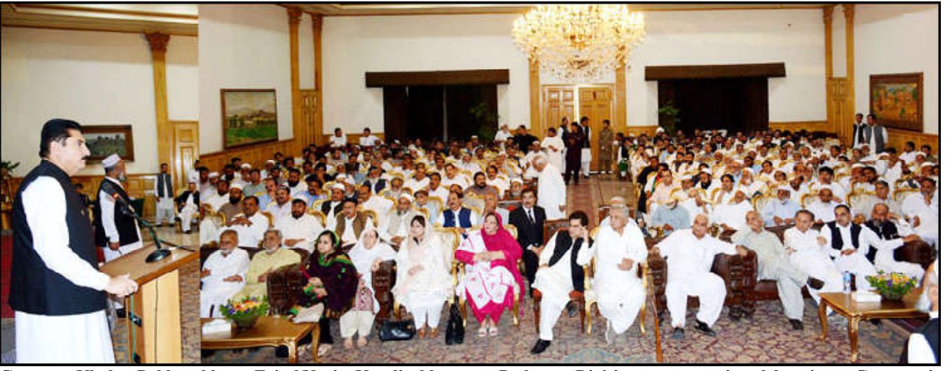
Governor Khyber Pakhtunkhawa Faisal Karim Kundi addresses to Peshawar Division representatives delegation at Governor's House, Peshawar.