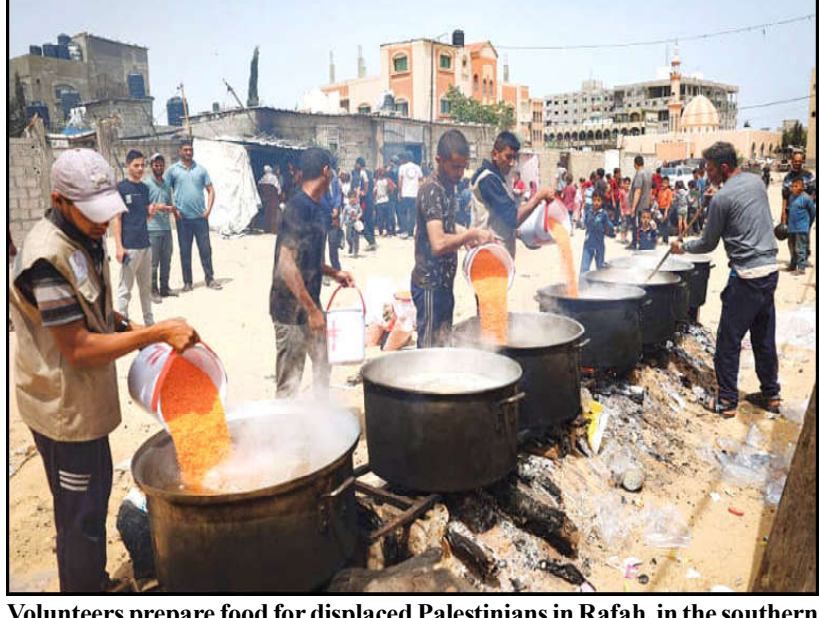
Volunteers prepare food for displaced Palestinians in Rafah, in the southern

Xiamen. Taipei's Guard Adminis-tra-tion said it had sent personnel to "patrol all hours of the day and night" around Taiwan's three major outlying islands: Kinmen, Matsu and Penghu. "In order to ensure the security of the sea area and border safety during the inau-