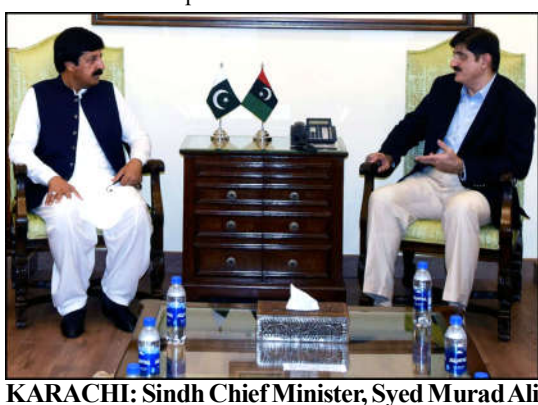
Shah exchanges views with Governor Punjab, Sardar Saleem Hyder during meeting held at CM

Both sides reaffirmed their strong and abiding support to each other on the core issues of national in-