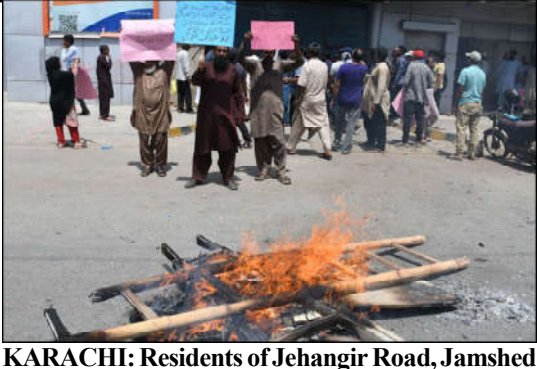
Road, Martin Quarter are protesting outside the office of K Electric at Tipu Sultan.