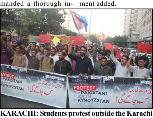
Press Club against the attacks on Pakistani students in Bishkek, the capital of Kyrgyzstan, in the

The PMA stands with the people of Pakistan, especially the medical community, and reiterates its commitment to the well-being and protection of all Pakistanis, both at home and abroad, the state-