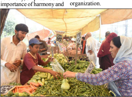
LAHORE: Consumers buying vegetables and fruits at Shadman Sunday market in the provincial capital.

He reaffirmed the management's commitment to resolving workers' chief guest at the highlighting that employees ceremony, emphasized the are the backbone of the