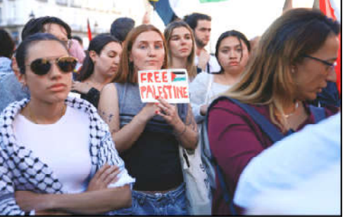
MADRID: A woman holds a placard as people attend a protest in solidarity with Palestinians in Gaza.

But those efforts have been severely damaged by the more than seven months of fighting in Gaza and the rising civilian toll there.