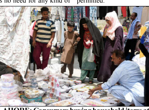
LAHORE: Consumers buying household items at Shadman Sunday market in the provincial capital.

The spokesperson also clarified that some transportation of wheat elements are linking a letter written by the federal government to prevent smuggling of various items with the transportation of wheat, which is based on a complete misunderstanding. He said that in the light of the instructions of the federal government and the Punjab home department, letters were written for the appointment of vigilant and honest staff at all check posts to stop smuggling of various items. However, delivery, purchase and sale of wheat and interprovincial and inter-district transport are fully permitted