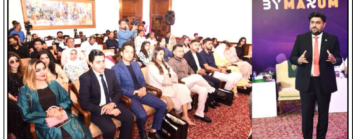
KARACHI: Governor Sindh Kamran Khan Tessori addressing a ceremony organized by social media influencers at Governor House.

In training sessions highlighted the health hazards posed by industrially produced trans fats in ghee, emphasizing the importance of stringent food safety mea-