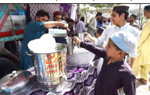
KARACHI: Vilionters distributing water to the Passengers during a hot day in the city near the Numaish Chowrangi.

DC also instructed establish heatwave wards in the hospitals besides arranging cold water points at prominent places of city.