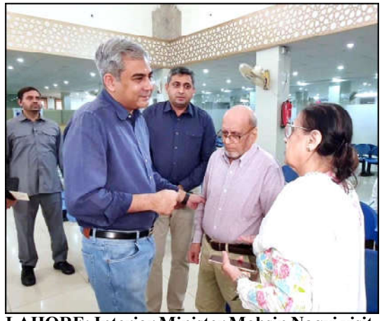
LAHORE: Interior Minister Mohsin Naqvi visiting NADRA Center, Garden Town.