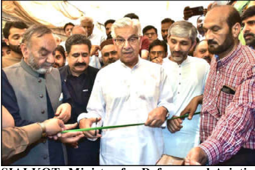
SIALKOT: Minister for Defense and Aviation Khawaja Muhammad Asif cutting ribbon to inaugurate "Chief Minister Punjab Special Initiative Clinic on Wheel".

He said the Kyrgyz government and universities would arrange online unrest and violence in were returning to Pakistan.