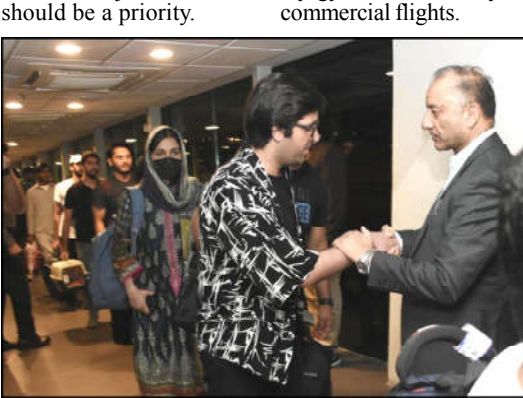
Federal Minister & Senator Dr Mudadik Malik received Pakistani students upon their return form Kyrgyzstan in Islamabad.

A number of students have already returned from return of injured students Kyrgyzstan on Sunday via commercial flights.