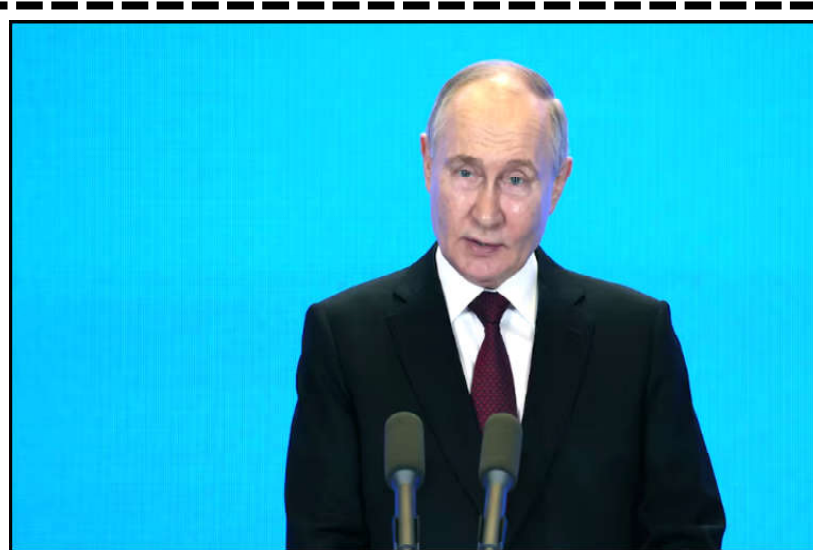
Russian President Vladimir Putin delivers a speech during the 8th Russian-Chinese EXPO and the 4th Russian-Chinese Forum on Interregional Cooperation in Harbin, China.

Vovchansk, located just 5 kilometers (3 miles) from the Russian border, has been a hot spot in the fighting in recent days. Ukrainian authorities have evacuated some 8,000 civilians from the town. The Russian army's usual tactic is to reduce towns and villages to ruins with aerial strikes before its units move in. By starting a new offensive in the north of Kharkiv region on May 10, Russian troops "expanded the zone of active hostilities by almost 70 kilometers," in an effort to force Ukraine spread its forces and use the reserve troops, Ukraine's military chief Oleksandr Syrskyi said Friday.