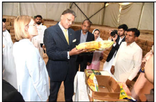
KARACHI: A delegation of business group of Germany inspecting ration bags under Taqatwar Pakistan at Governor House

"Thus," it said, "between July and October, the Sri Lanka rupee depreciated by 3.2 per cent against the U.S. dollar, while the Indian rupee depreciated by 1.2 per cent. After raising policy rates in 2022, most central banks in South Asia paused monetary tightening or started lowering their key policy rates in 2023, with a few exceptions. In this regard, the report noted that the State Bank of Pakistan has kept its policy rate unchanged at a record high of 22 per cent since June 2023. In 2023, it said, the number of people facing acute food insecurity increased in Bangladesh and Pakistan and decreased in Sri Lanka. Afghanistan continued to be the country most affected by the food crisis in the region, with around 46 per cent of the population facing acute levels of food insecurity.