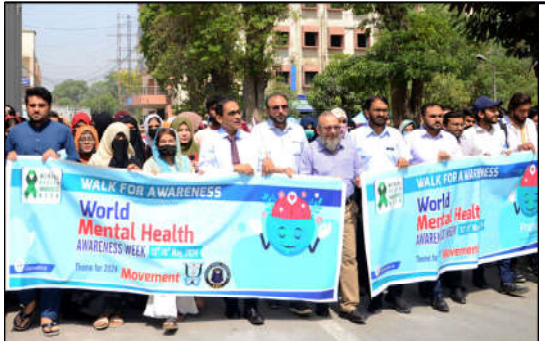
FAISALABAD: Participants hold a banner during awareness walk on the eve of World Mental Health at Allied Hospital in the city.

of pollution is grave which cannot be ignored. During the hearing of the case related to distribution of motorcycles to students scheme the court said in its remarks non-obtaining environmental NOC before project is criminal case. The court made the motorcycle distribution to students scheme conditional to NOC. The court ordered to submit report regarding restoration of 7 sports complex of LDA and cutting of tree.