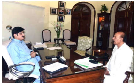
KARACHI: Sindh Chief Minister, Syed Murad Ali Shah exchanging views with Nisar Ahmed Khuhro, President Peoples Party (PPP) Sindh during meeting held at CM House in Karachi.

She said India was involved in human rights violations in occupied Kashmir and Indian forces were continuing their aggression in the occupied valley. The international community should take notice of the ongoing Indian atrocities in held Kashmir.