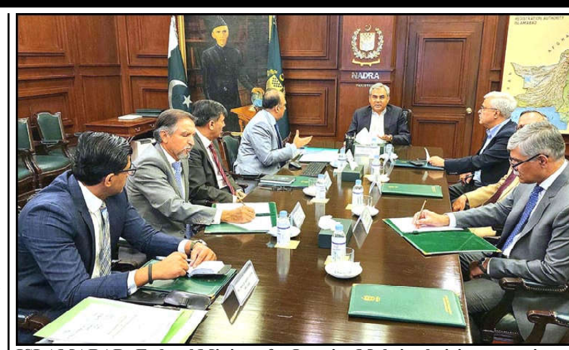
ISLAMABAD: Federal Minister for Interior Mohsin chairing a meeting at NADRA headquarters.

The family claimed that police thrown out their belongings and broke their beds and other items. They took two of the family to police station after beating them and left an 80-year-old woman and her three daughters stranded on road in the dark.