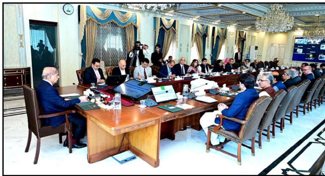
ISLAMABAD: Prime Minister Muhammad Shehbaz Sharif chairs a meeting to discuss the issue of child stunting.

On the occasion, Memon was given a detailed briefing on the construction of various BRTs, signals, and reconstruction of bus terminals, as well as the construction of a U-turn for the People's Bus Service. Additionally, it was decided to construct a parking plaza to reduce traffic pressure in the central ar-