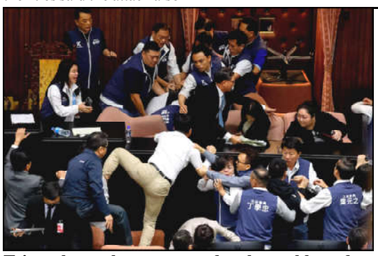
Taiwan lawmakers argue and exchange blows during a parliamentary session in Taipei, Taiwan.

national security, would still not be allowed to enlist. Separately, Zelenskyy signed a law increasing fines for draft dodgers to up to 8,500 hryvnias ($218), according to the parliament's website. The average monthly wage in Ukraine is about $560. The lack of manpower is seen by some military analysts as Ukraine's biggest problem. Weapons supplies that have been significantly delayed, particularly from Washington, are expected to reach the frontline soon. Ukraine has already lowered the draft mobilisation age from 27 to 25. The upper limit is 60. In tandem, the government has also temporarily suspended consular services for men of military age who reside abroad, complaining they were not helping the Ukrainian state fight for its survival.