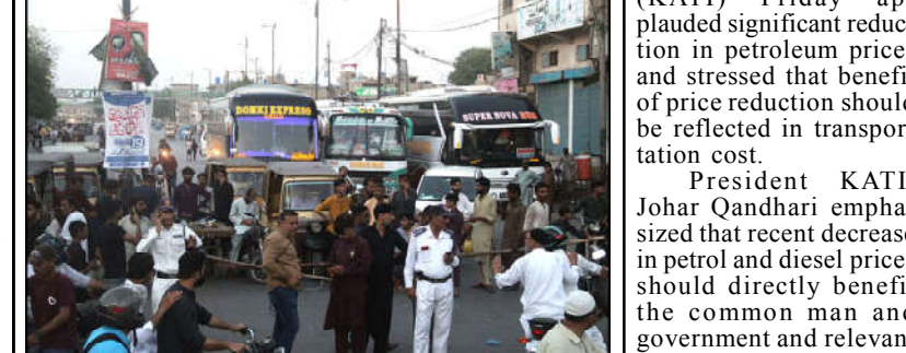
KARACHI: Residents of Lines area hold a protest at a road, against electricity load-shedding in the provincial Capital.

A solar system has also been installed to ensure the uninterrupted water supply to the residents of village Diyal Garh. Both water reservoirs have a capacity of almost half a million gallons per day. The water supply scheme at village Wagari has also been rehabilitated as both the water reservoirs are now in a working condition. The scheme had become non functional due to silting of reservoirs during floods and local population was facing a lot of difficulty in getting water for daily use from other sources. The water supply scheme at village Ghulam Mohammad Leghari at District Mirpurkhas is almost complete as well with a storage capacity of 0.625 million gallons and would provide water to both Jiskani and Leghari villages.