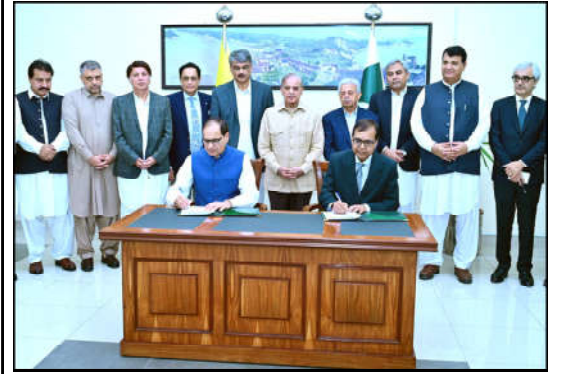
MUZZAFFARABAD: Prime Minister Muhammad Shehbaz Sharif witnesses the signing of a Memorandum of Understanding between the Government of Pakistan and the Government of Azad Jammu and Kashmir with regard to 960 MW Dudhial Hydropower Project.