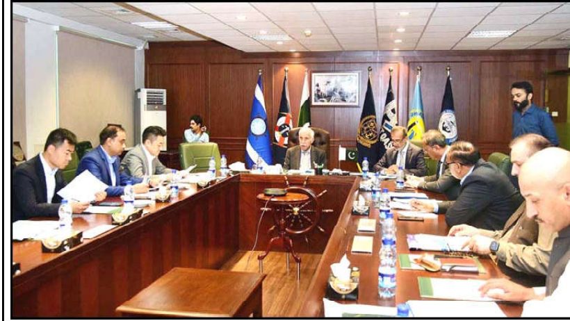
ISLAMABAD: Federal Minister For Maritime Affairs Qaiser Ahmed Sheikh chairs a meeting regarding exemption from Import/Export Policy order and foreign currency issues for Gwadar Zone.

Police man deployed outside court room has confirmed this order of the court. Police man told Online it is directive of the court that personnel affiliated with the intelligence agencies be not allowed to enter to court room.