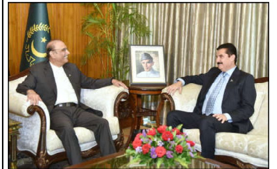
ISLAMABAD: Governor Khyber Pakhtunkhwa Faisal Karim Kundi called on President Asif Ali Zardari at Aiwan-e-Sadr.