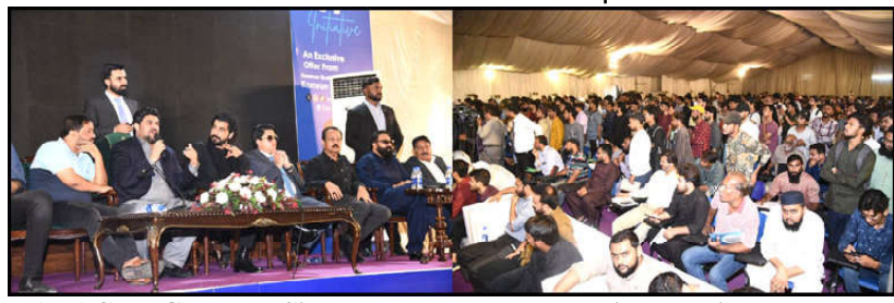
KARACHI: Governor Sindh Kamran Khan Tessori addressing a ceremony held at Governor House in connection with rozgar scheme.