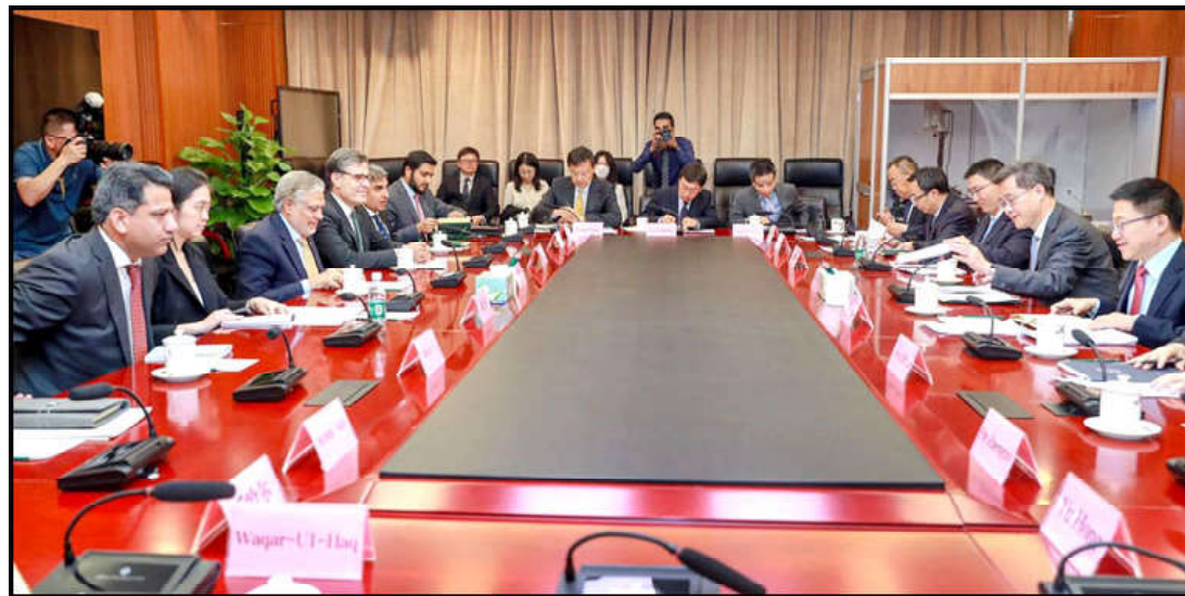
BEIJING: Deputy Prime Minister and Foreign Minister Senator Mohammad Ishaq Dar meets with the Minister of Finance of the People's Republic of China Lan Fo'an.

BEIJING (APP): Deputy Prime Minister and Foreign Minister Senator Mohammad Ishaq Dar on Thursday met with Chinese Minister of Finance Lan Fo'an and underlined the Government of Pakistan's reform agenda with a focus on governance, revenue, and ease of doing business to attract Foreign Direct Investment. The deputy prime minister, who is on a four-day visit to China, also emphasized Pakistan's high priority to investments from China, and shared an overview of the priority sectors identified for this purpose, including agriculture, IT, mines and minerals and renewable energy. Deputy Prime Minister Dar and Minister Lan expressed profound appreciation for Pakistan-China financial and banking cooperation calling it a manifestation of the 'All Weather Strategic Cooperative Partnership' between the two countries. They discussed ideas to further enhance financial cooperation, especially in view of growing business-to-business (B2B) linkages between Pakistan and China.