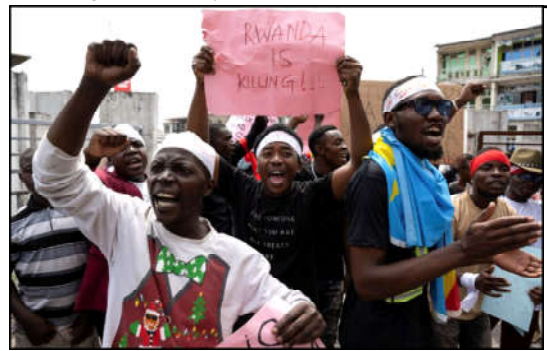
Congolese people react during the funeral of the nine victims, including seven children who were killed in a strike earlier this month at the Bulengo displaced persons camp (IDP), in Goma, North Kivu province, Democratic Republic of the Congo.

Monitoring Desk HANDLOVA: Slovak Prime Minister Robert Fico on Thursday was speaking but tired and still in a "really difficult condition" a day after being shot multiple times, the president-elect said after visiting his ally. "He is able to speak but only a few sentences and then he is really, really tired... The situation is very critical," President-elect Peter Pellegrini told reporters outside the hospital.