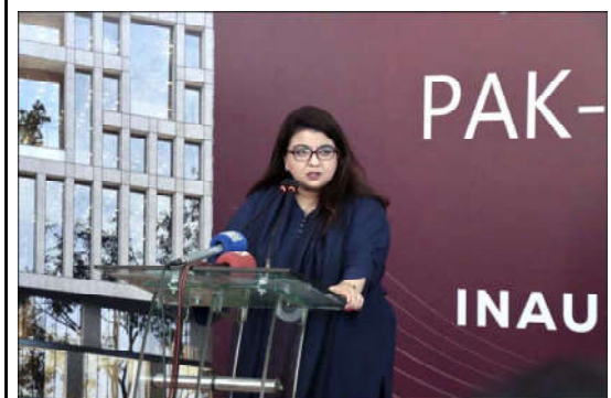
ISLAMABAD: Minister of State for IT and Telecommunication Ms. Shaza Fatima Khawaja addresses the inaugural ceremony of Pak-Qatar IT Tower.

Aleem Khan said that all the four provinces and their chief ministers would also be taken into confidence in this regard, adding that ease of doing business would provide a clear road map for the promotion of business in the country while its related proposals, legislation and other important issues would be finalized soon.