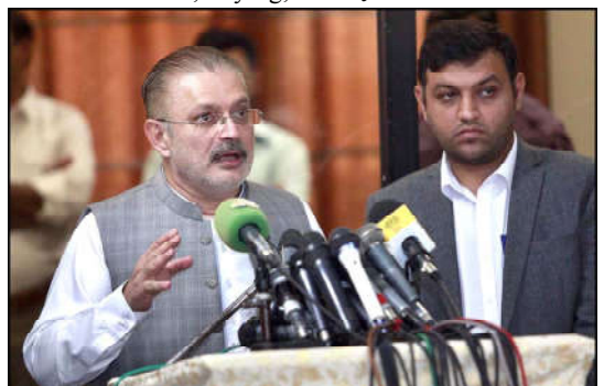
KARACHI: Sindh Minister for Transport and Mass Transit, Information and Exise and Taxation Sharjeel Inam Memon talking to media persons at Orangi Town.

Sharjeel Memon on warpath against PTI - Few days back, Memon fired a broadside at the PTI. Expressing his thoughts, Memon asserted: "The PTI is launching a smear campaign against the institutions. The PTI had been involved in terrorism on social media." Memon said: "The PTI does not want to hold negotiations, but it is pleading for the deal, but the institutions are not ready for the deal."