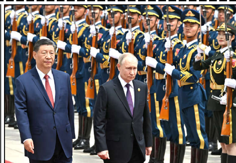
Russian President Vladimir Putin and Chinese President Xi Jinping attend an official welcoming ceremony in Beijing, China.

Monitoring Desk BEIJING: Russian President Vladimir Putin and Chinese leader Xi Jinping on Thursday reaffirmed their "no-limits" partnership that has deepened as both countries face rising tensions with the West, and they criticized U.S. military alliances in Asia and the Pacific region. At their summit in Beijing, Putin thanked China's proposals for ending the war in Ukraine, which have been rejected by Ukraine and its Western supporters as largely following the Kremlin's line. China claims to take a neutral position in the conflict, but it has backed the Kremlin's contentions that Russia was provoked into attacking Ukraine by the West, and it continues to supply key components needed by Moscow for weapons production. China, which has not criticized the invasion, proposed a broadly worded peace plan in 2023, calling for a cease-fire and for direct talks between Moscow and Kyiv. The plan was rejected by both Ukraine and the West for failing to call for Russia to leave occupied parts of Ukraine. China also gave a rhetorical nod to Russia's narrative about Nazism in Ukraine, with a joint statement Thursday that said Moscow and Beijing should defend the post-World War II order and "severely condemn the glorification of or even attempts to revive Nazism and militarism."