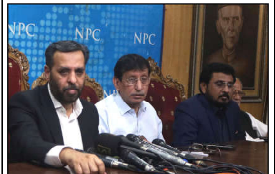
ISLAMABAD: Senior Deputy Convener Muttahida Quami Movement Pakistan Syed Mustafa Kamal addressing a press conference at National Press Club in the Federal Capital.