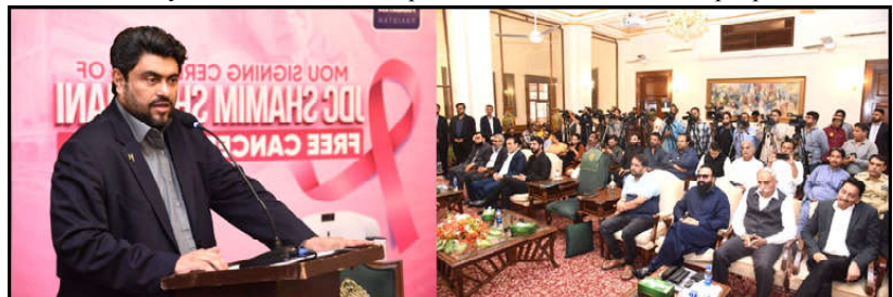
KARACHI: Governor Sindh Kamran Khan Tessori addressing a MoU signing ceremony between JDC and Shamim Sheikhani for construction of free cancer hospital.

In the preliminary meeting, the federal minister directed the stakeholders to work in unison and commitment to realize the vision of transforming Gwadar Port into a vibrant center of trade and commerce.