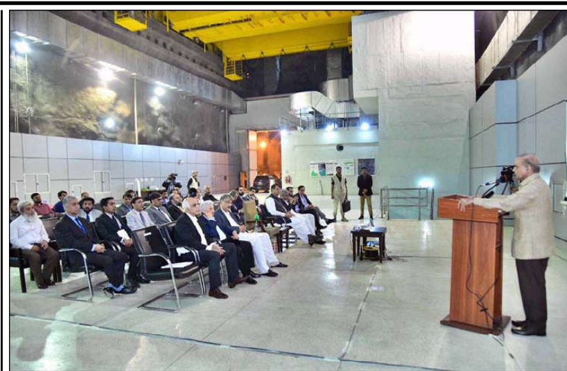
MUZAFFARABAD: Prime Minister Muhammad Shehbaz Sharif addresses at Neelum-Jhelum Hydro Power Project.

The three top trading companies were P.I.A.C (A) with 34,846,148 shares at Rs26.20 per share, Pak-Electric with 28,542,422 shares at Rs 26.47 per share and World Call Telecom with 24,078,585 shares at Rs 1.38 per share.