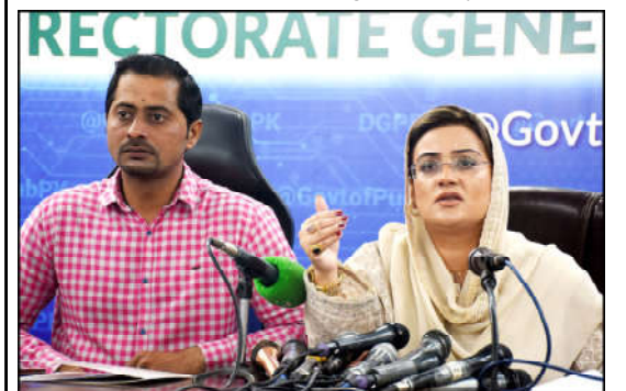
LAHORE: Information and Culture Minister of Punjab Azma Bukhari addressing a press conference at D.G.P.R office in the Provincial Capital.