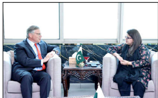
ISLAMABAD: US Ambassador to Pakistan Mr. Donald Blome calls on Minister of State for IT and Telecommunication Ms. Shaza Fatima Khawaja.

The minister of State for IT said that the present government is focusing on digitalisation in the country. Economy, governance and society are being digitalised under the Prime Minister's National Digitalisation Plan, she maintained.