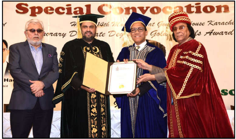
KARACHI: Governor Sindh Kamran Khan Tessori and Patron presenting honorary degree to Consul General of Indonesia during a special convocation of Indus University at Governor House.

also directed for constitution of a cabinet committee headed by the minister for planning over the development budget and PSDP. The committee would furnish a mechanism over PSDP programmes through short, medium and long terms proposals. The prime minister emphasized upon harmonizing the federal PSDP and provincial annual development programme and the need of improving links. He also asked for submission of proposals by all the federal ministries over public-private partnership projects.