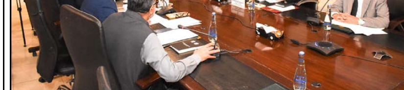
ISLAMABAD: Federal Minister for Finance and Revenue Senator Muhammad Aurangzeb chaired the meeting of Economic Coordination Committee.

ISLAMABAD (Online): Supreme Court (SC) has allowed former Prime Minister (PM) Imran Khan to appear through video link on May 16 in NAB amendment case. It has been said in court's order Attorney General should ensure appearance of Imran Khan through video link from Adialajail. Notices are issued to advocate generals of all provincial governments except KP government. Notice is issued to Khawaja Harris as amicus curiae. NAB also supported appeals.