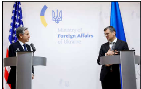
U.S. Secretary of State Antony Blinken and Ukrainian Foreign Minister Dmytro Kuleba hold a joint press conference, amid Russia's attack on Ukraine, in Kyiv, Ukraine.

A senior US official said negotiations were "at a simmer, but are at a low boil", but that conversations with the parties were continuing.