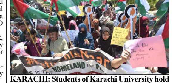
KARACHI: Students of Karachi University hold protest against Israel Government.

He stated ceasefire has taken place between PTI and JUI-F. I am not going to meet Imran Khan in jail. I don't know as to why such questions are being asked now a days, he inquired. All politicians will have to sit together for the sake of constitution. He held every election remained controversial. This will have to be rectified at every cost. He underlined that PPP is getting constitutional slots and is saying too that it is not part of the government. PPP is not in government, it means minority government is running.