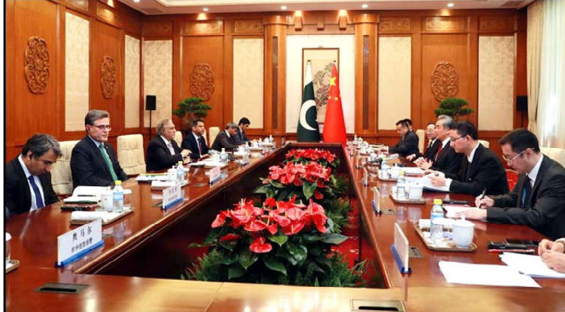
A view of 5th round of China-Pakistan Strategic Dialogue, co-chaired by Deputy Prime Minister and Foreign Minister Ishaq Dar and Chinese Foreign Minister Wang Yi in Beijing.

President Zardari prayed to Allah Almighty for the elevation of the martyr's ranks in paradise and for patience to the bereaved family.