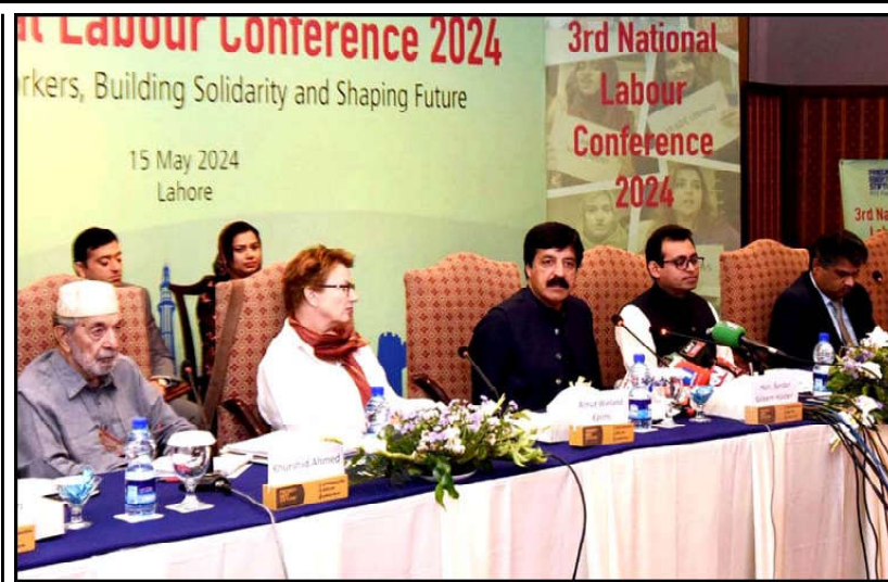
LAHORE: Governor Punjab, Sardar Saleem Haider Khan addresses during the 3rd National Labour Conference held in Lahore.

No FIR was registered till late evening.