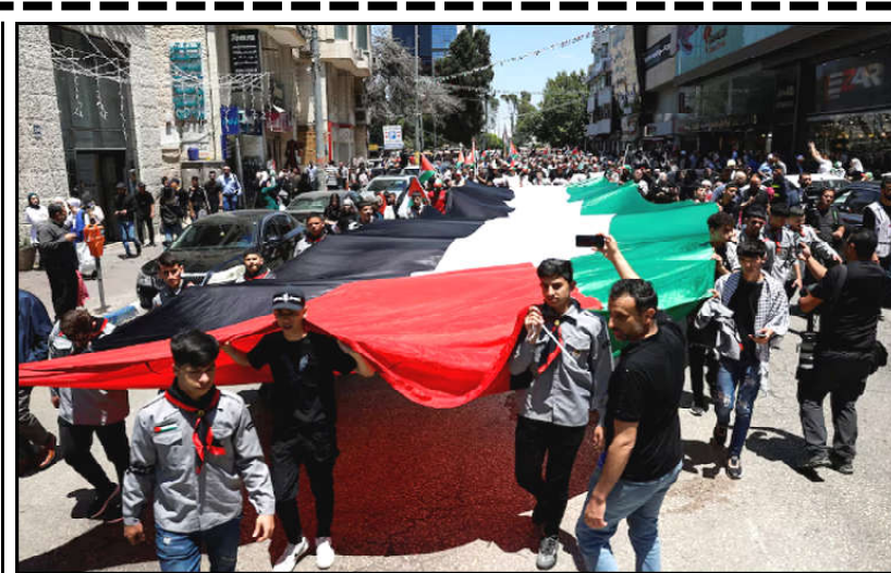
Palestinians hold Palestinian flags as they take part in a protest to mark the 76th anniversary of the Nakba, the "catastrophe" of their mass dispossession in the 1948 war surrounding Israel's creation, in Ramallah, in the Israeli-occupied West Bank.

Israeli police on Tuesday said they had opened an investigation after right-wing activists stopped and ransacked at least seven Gaza-bound aid trucks coming from Jordan, leaving food spilt on the road.