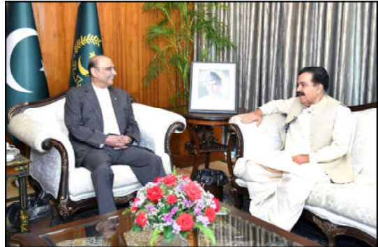
ISLAMABAD: Governor Balochistan, Sheikh Jaffar Khan Mandokhail called on President Asif Ali Zardari at Aiwan-e-Sadr.

Bilawal Bhutto urged the government to take decisive action to resolve the wheat import controversy and hold accountable those responsible during interim set-up in the wheat import scandal. He stressed that the Prime Minister should identify the bureaucrats and former ministers involved in the scandal and take prompt action against them without any further delay.