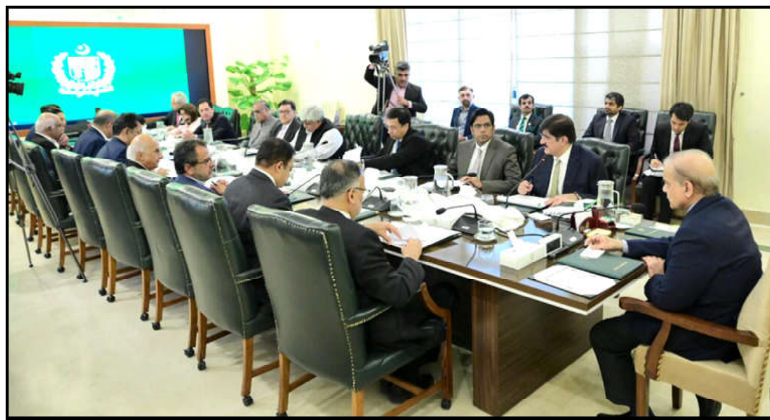
ISLAMABAD: Chief Minister Sindh Syed Murad Ali Shah calls on Prime Minister Muhammad Shehbaz Sharif.