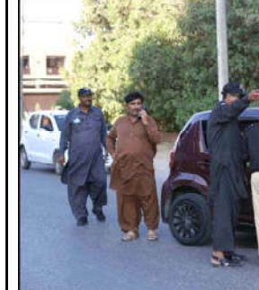
KARACHI: Police officials are searching commuters during the campaign against unregistered and tax defaulting vehicles, as the security has been tighten, under the supervision Excise Department, in Karachi.

KARACHI (APP): The upper and central parts of Sindh to bear extremely hot weather in coming days and the scorching temperature at the day times will keep the mercury soaring above 45 on Celsius scale. The Pakistan Meteorological Department (PMD), on Wednesday, forecast very hot and dry weather in most districts of the province and weather was likely to become hotter with day time Maximum Temperature ranging 45 to 47 C in Upper and Central districts of the province from Thursday, May 16. However, isolated dust-thunderstorm/rain may occur in Tharparker, Umerkot, Badin and parts of Thatta districts on Wednesday night.