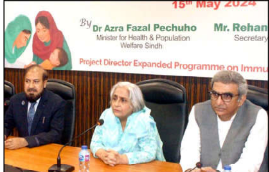
KARACHI: Sindh Health and Population Welfare Minister, Dr. Azra Fazal Pechuho addresses during Stone Laydown Ceremony of Provincial Vaccine and Dry Logistics Ware House organized by Project Director Expanded Programme on Immunization Sindh, held in Karachi.

ANF officials provided a comprehensive briefing on actions taken against drug mafias at the provincial level, highlighting the collaboration with police, Pakistan Rangers Sindh, and other law enforcement agencies. Dr. Pechuho emphasized the need for collective efforts to enhance and tighten anti-narcotics measures, with the primary goal of safeguarding the future of the nation.