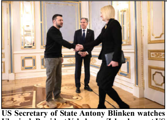
US Secretary of State Antony Blinken watches Ukraine's President Volodymyr Zelensky greet US Ambassador to Ukraine Bridget Brink prior to their meeting in Kyiv.

Monitoring Desk WASHINGTON: US national security adviser Jake Sullivan said on Monday that President Joe Biden's administration did not view the killings of Palestinians in Gaza by Israel as genocide. Sullivan, speaking to reporters at the White House, said the United States wants to see Hamas defeated, that Palestinians facing the brunt of Israeli onslaught were in "hell", and that a major military operation by Israel in Rafah would be a mistake. "We do not believe what is happening in Gaza is a genocide. We have been firmly on record rejecting that proposition," Sullivan said. Biden, who is running for re-election this year, has faced heavy criticism from his own supporters domestically for his support of Israel; some of those critics have accused Israel of committing genocide. Reiterating a comment Biden made on Saturday, Sullivan said there could be a ceasefire in Gaza now if Hamas would release prisoners. The world should be calling on Hamas to return to the negotiating table and accept a deal, Sullivan said. The United States is working urgently for a ceasefire and prisoner release deal, Sullivan said. He said he could not predict when or if such a deal would be sealed.