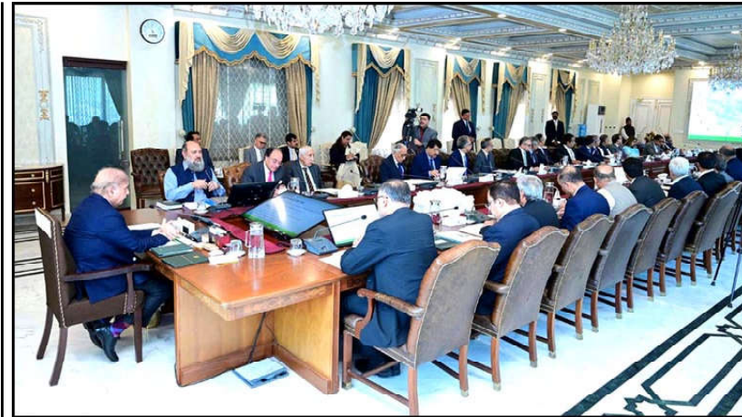
ISLAMABAD: Prime Minister Muhammad Shehbaz Sharif chairs a meeting regarding CPEC Phase II and other projects under Chinese investment in Pakistan.