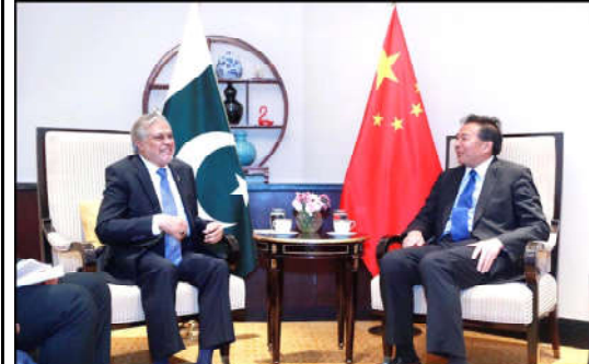
BEIJING: Deputy Prime Minister and Foreign Minister, Senator Mohammad Ishaq Dar holds a luncheon meeting with Chairman of China International Development Cooperation Agency (CIDCA) Luo Zhaoxue.

The "Property Leaks" expose the names of several political figures, government officials, and retired civil servants from around the world. Among them, Pakistanis own $11 billion worth of properties in Dubai, making them the second-largest group of non-residents purchasing properties in the city. According to the "Property Leaks", 17,000 Pakistanis have bought 23,000 properties in Dubai. Indian citizens lead among non-residents purchasing properties in Dubai, with 29,700 Indians owning 35,000 properties in the city. Additionally, there are 19,500 British citizens who own 22,000 properties in Dubai. The total value of properties purchased by British citizens in Dubai amounts to $10 billion.