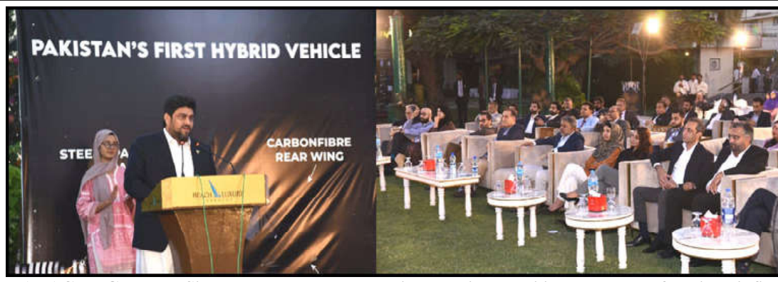
KARACHI: Governor Sindh Kamran Khan Tessori addressing unveiling ceremony of Pakistan's first hybrid vehicle organized by NUST.

ISLAMABAD (APP): Attorney General of Pakistan (AGP), Mansoor Usman Awan on Tuesday strongly denied the impression of interference in the powers of judiciary by any institution. Addressing a press conference here, he said that a wrong impression was made on a letter written to the chief justice of Islamabad High Court (IHC). He said that it was a wrong impression that if there was a conflict between executive and judiciary. The AGP said that it