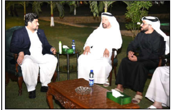
KARACHI: A delegation led by UAE Consul General Bekhait Atiq Al Romeithi meeting with Governor Sindh Kamran Khan Tessori.

For the bright future of Pakistan, the president also assured complete co-operation of all the provinces for achieving the objectives of Green Pakistan Initiative.