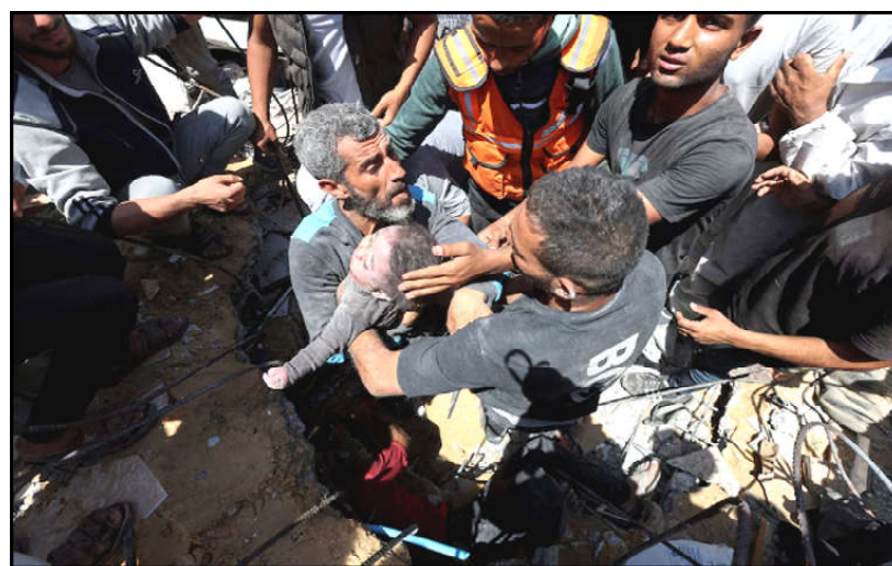
Palestinians carry the dead body of a child recovered from under the rubble of a house hit in an Israeli strike, amid the ongoing conflict between Israel and the Palestinian Islamist group Hamas, in Nuseirat refugee camp in the central Gaza Strip.

Palestinians killed in overnight airstrikes. "We don't know where to go. We have been displaced from one place to the next... We are running in the streets. I saw it with my own eyes. I saw the tank and the bulldozer. It is on that street," said one woman, who did not give her name. Attending a Memorial Day ceremony to mark Israel's fallen soldiers in Jerusalem on Monday, Prime Minister Benjamin Netanyahu said the war against Hamas is a struggle to secure Israel's "existence, liberty, security and prosperity." In Rafah, Israel stepped up aerial and ground bombardments on the eastern areas of the city, killing people in an airstrike on a house.