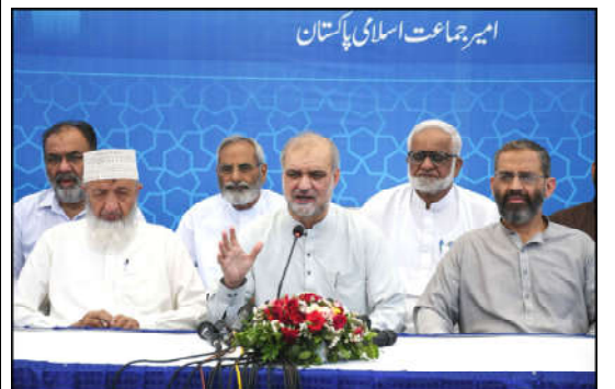
KARACHI: Ameer-e-Jamaat-e-Islami, Hafiz Naeem-ur-Rehman holding a press conference at Idara Noor-ul-Haq in the Provincial Capital.

ISLAMABAD (APP): Prime Minister Muhammad Shehbaz Sharif on Tuesday expressed his deep grief and sorrow over loss of lives during the protest incidents in Azad Jammu and Kashmir and announced that he would visit Muzaffarabad within few days to hold further consultations over the issue. Addressing the participants of the federal cabinet meeting, the prime minister said that it was a matter of immense pain that few people lost their lives during the protest, besides damage caused to buildings. "It was a very unfortunate incident," he said, adding that a police officer also lost his life, besides a number of personnel of law enforcement agencies were also hurt. The prime minister and the members of the cabinet also offered Fateha for the departed souls.