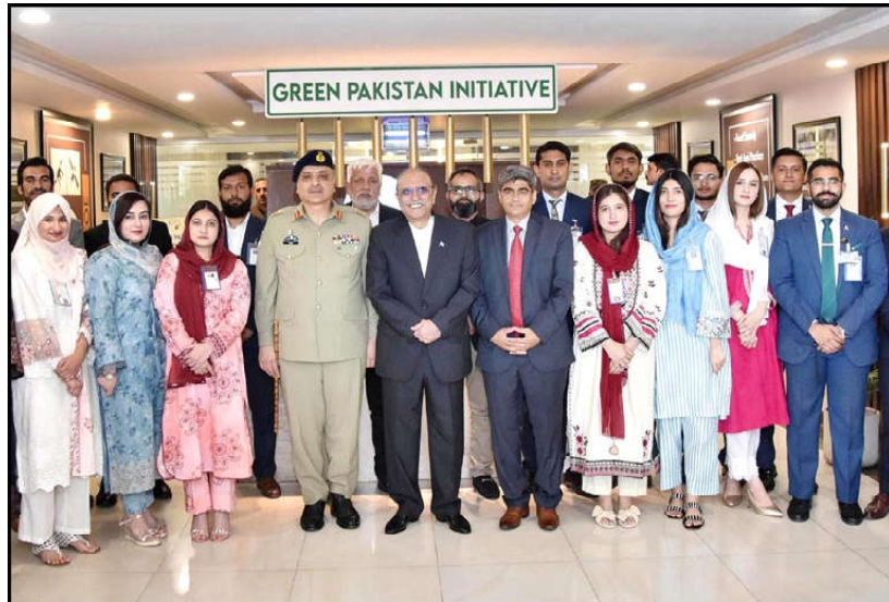
President Asif Ali Zardari in a group photo with the officials of the Green Pakistan Initiative, during his visit to its headquarters, in Rawalpindi.

These also signified a desperate attempt to deflect attention from mounting domestic and international criticism, she added.