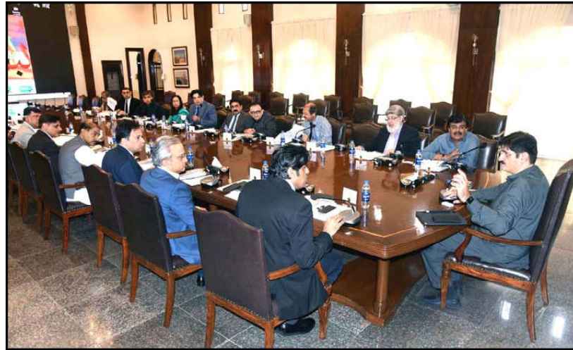
KARACHI: Sindh Chief Minister, Syed Murad Ali Shah presides over a joint meeting of different departments, held at CM House in Karachi.