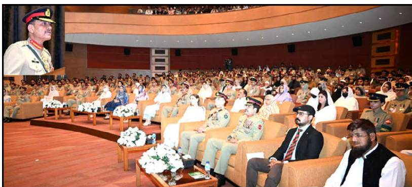
RAWALPINDI: Chief of Army Staff (COAS), General Syed Asim Munir, NI (M), addressing GHQ Investiture ceremony held at General Headquarters Rawalpindi.

ISLAMABAD (APP): Prime Minister Shehbaz Sharif has resigned as president of PML-N. Meeting of Central Working Committee (CWC) of PML-N has been summoned on Saturday May 18 in Lahore. The meeting has been called under clause 15 of the constitution of the party. PML-N secretary general Ahsan Iqbal has issued notice of meeting to all the members of CWC. In the meeting the acting president will be nominated. CWC will nominate Nawaz Sharif as acting president. PML-N General council will endorse president-ship of Mian Nawaz Sharif on May 28.