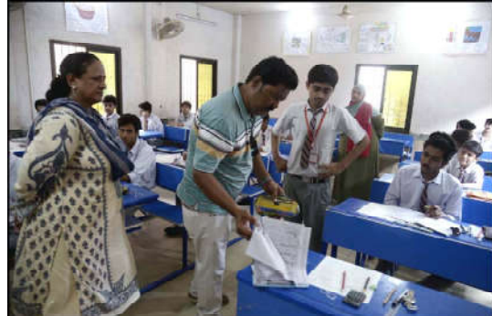
KARACHI: Students of matric class solving paper in examination center during Annual Examination of Matriculation under the supervision of Education Board, at Government Boys Secondary School Jail road in Karachi.