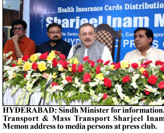
HYDERABAD: Sindh Minister for information, Transport & Mass Transport Sharjeel Inam Memon address to media persons at press club.