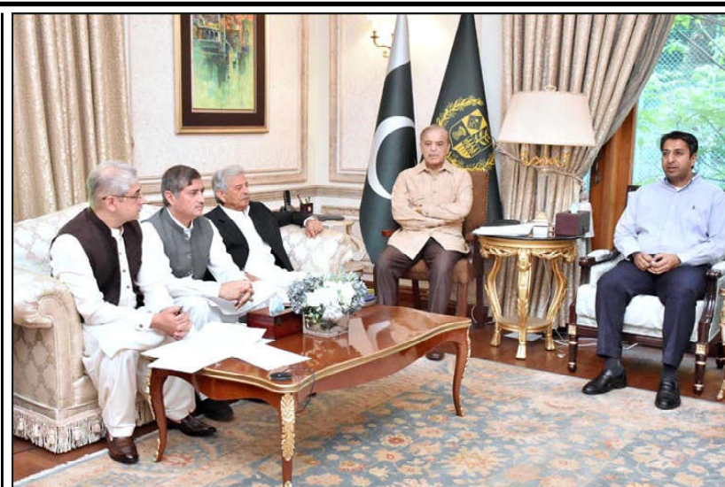
LAHORE: Prime Minister Muhammad Shehbaz Sharif chairs a meeting regarding wheat stocks.