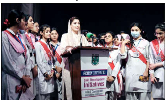
LAHORE: Punjab Chief Minister Maryam Nawaz Sharif alongwith students addressing the inaugural ceremony of Chief Minister Skills Development Initiative.

concerned also attended the meeting. The provincial minister directed the inclusion of digitization projects of the local government sector in the annual budget to bring transparency in the governance. He said that all possible relief would be provided to the people in the upcoming annual budget. He said that schemes including women development centre, parks, footpaths and construction of roads are being included in the budget to provide best facilities to the people of the district Haripur.