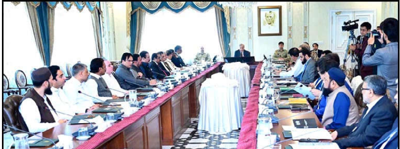
ISLAMABAD: Prime Minister Muhammad Shehbaz Sharif chairs a meeting regarding Azad Jammu & Kashmir matters.