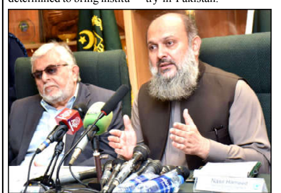
KARACHI: Federal Minister for Commerce Jam Kamal Khan addressing to media persons at Trade Development Authority of Pakistan (TDAP).

ISLAMABAD (Online): Prime Minister (PM) Shehbaz Sharif has resigned as president of PML-N. Meeting of Central Working Committee (CWC) of PML-N has been summoned on Saturday May 18 in Lahore. The meeting has been called under clause 15 of the constitution of the party. PML-N secretary general Ahsan Iqbal has issued notice of meeting to all the members of CWC. In the meeting the acting president will be nominated. CWC will nominate Nawaz Sharif as acting president. PML-N General council will endorse president-ship of Mian Nawaz Sharif on May 28.