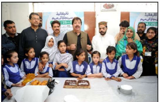
HYDERABAD: District Health officer talking to health workers during a visit to the Labor colony health facility to witness the XDR Typhoid vaccine campaign.