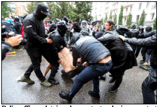
Police officers detain a demonstrator during a protest against a bill on "foreign agents" in Tbilisi, Georgia.

Russia's border city of Belgorod, where a 10-story apartment building partially collapsed after what Russian officials said was Ukrainian shelling. Ukraine hasn't commented on the incident. Belousov's candidacy will need to be approved by Russia's upper house in parliament, the Federation Council. It reported Sunday that Putin introduced proposals for other Cabinet positions as well but Shoigu is the only minister on that list who is being replaced. Several other new candidates for federal ministers were proposed Saturday by Prime Minister Mikhail Mishustin, reappointed by Putin on Friday. Shoigu's deputy, Timur Ivanov, was arrested last month on bribery charges and was ordered to remain in custody pending an official investigation.