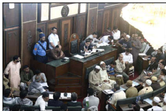
KARACHI: Mayor, Barrister Murtaza Wahab presiding district council meeting session, held at City Council Hall Old KMC building in Karachi.

LAHORE (Online): PTI president Chaudhry Pervaiz Elahi has said talks are only way to steer country out of the prevailing crisis. "dialogues are the only way to come out of the present crisis. Imran Khan has agreed for talks not for his own sake but for the sake of nation and country."