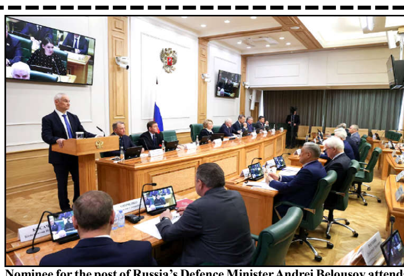
Nominee for the post of Russia's Defence Minister Andrei Belousov attends a hearing held by the defence and security committee of the parliament's upper house Federation Council as part of a confirmation process for a new government line-up, in Moscow, Russia.

aid into Gaza, a Turkish security source said. Israel's military conduct in Gaza has come under increasing scrutiny in recent weeks, as the civilian death toll and devastation in the enclave mount. Its planned assault on Rafah, hosting some 1.4 million Palestinians mostly displaced in the war, has helped fuel the deepest tensions in relations between Israel and its main ally Washington in generations. Ankara on Friday welcomed the United Nations General Assembly's backing for a Palestinian bid to become a full UN member. Erdogan on Sunday called on countries not recognising a Palestinian sovereign state to do so after the vote, but slammed Washington and others who voted against.