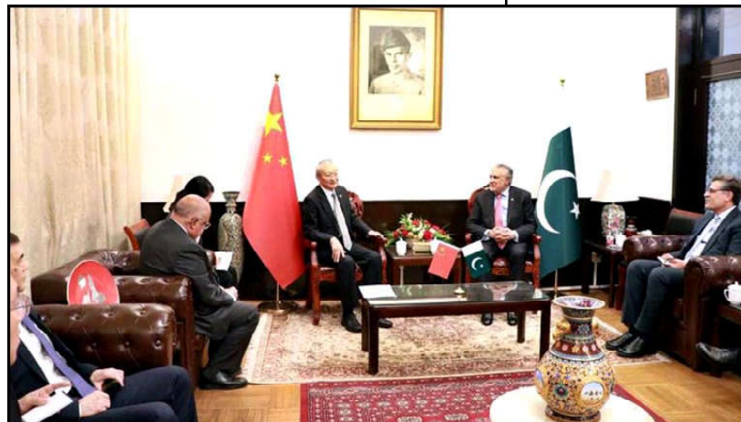
BEIJING: Deputy Prime Minister and Foreign Minister, Senator Mohammad Ishaq Dar meets with Secretary-General of the Shanghai Cooperation Organization (SCO), Ambassador Zhang Ming.

BEIJING (INP): Deputy Prime Minister and Foreign Minister, Senator Mohammad Ishaq Dar meets with Secretary-General of the Shanghai Cooperation Organization (SCO), Ambassador Zhang Ming.