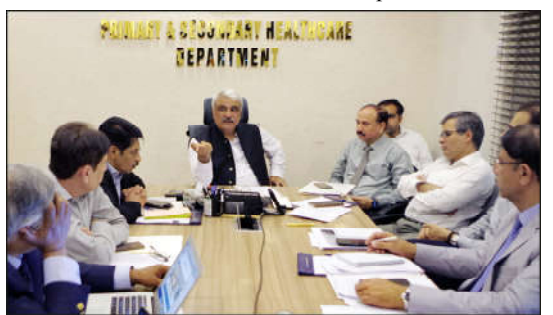
LAHORE: Provincial Minister for Health Khawaja Salman Rafique presides over the 2nd meeting of Health Insurance working group Sub Committee.

concerned also attended the meeting. The provincial minister directed the inclusion of digitization projects of the local government sector in the annual budget to bring transparency in the governance. He said that all possible relief would be provided to the people in the upcoming annual budget. He said that schemes including women development centre, parks, footpaths and construction of roads are being included in the budget to provide best facilities to the people of the district Haripur.