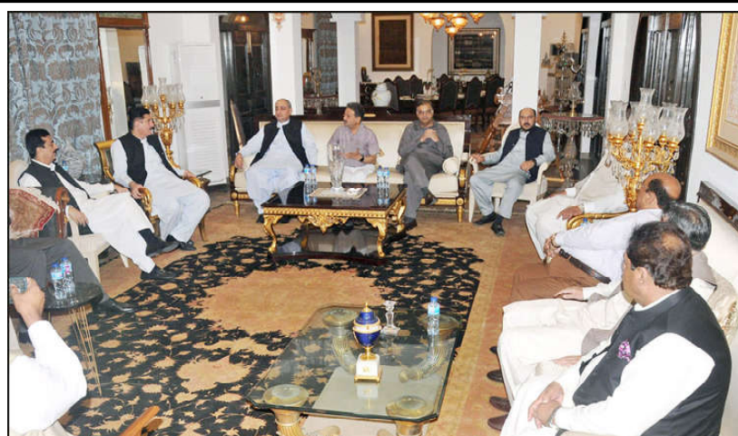
MULTAN: Chairman Senate Syed Yusuf Raza Gilani honored Governor Khyber Pakhtunkhwa Faisal Karim Kundi with a high tea at Gilani House.