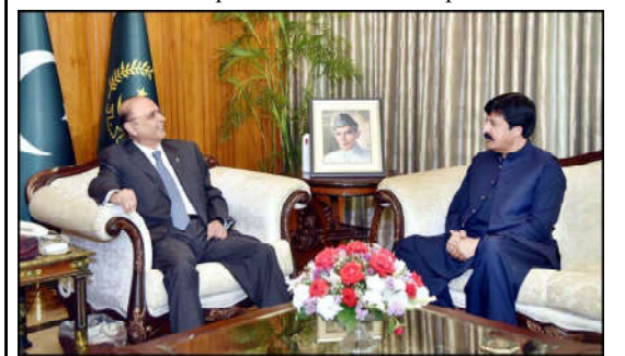
ISLAMABAD: Governor Punjab Sardar Saleem Haider Khan called on President Asif Ali Zardari at Aiwan-e-Sadr.

ISLAMABAD (APP): Prime Minister Shehbaz Sharif on Monday congratulated Dr Khalid Maqbool Siddiqui on his election as Chairman of the Muttahida Qaumi Movement-Pakistan (MQM-P). The prime minister, in a statement, said that while serving as the MQM-P convener, Khalid Maqbool had inculcated a new spirit in the party which supported the government in its tough decisions made in the national interests. He expressed the hope that under Siddiqui's leadership, the MQM-P would truly represent the people and play a more active role in the resolution of their issues.