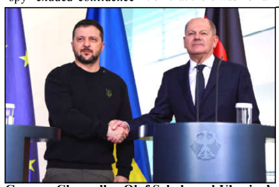
German Chancellor Olaf Scholz and Ukraine's President Volodymyr Zelenskyy shake hands at a press conference in Berlin, Germany.