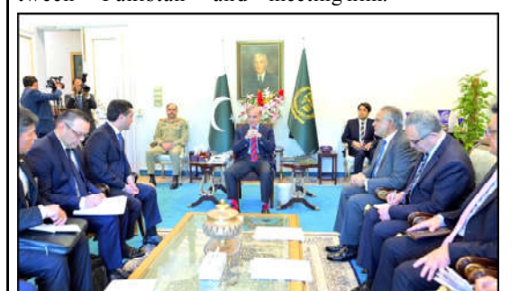
ISLAMABAD: Foreign Minister of Uzbekistan H.E. Bakhtiyor Saidov called on Prime Minister Muhammad Shehbaz Sharif.

The Prime Minister expressed his gratitude to President of Uzbekistan, Shavkat Mirziyoyev and said that he is looking forward to meeting him.