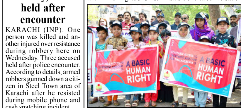
HYDERABAD: People from different organizations with children patients of Thalassaemia Day organized by Fatimid Foundation at Press Club Road.

KARACHI (INP): One person was killed and another injured over resistance during robbery here on Wednesday. Three accused held after police encounter. According to details, armed robbers gunned down a citizen in Steel Town area of Karachi after he resisted during mobile phone and cash snatching incident. Near Korangi No 6 area of Karachi, robbers shot and critically injured a man for offering resistance.