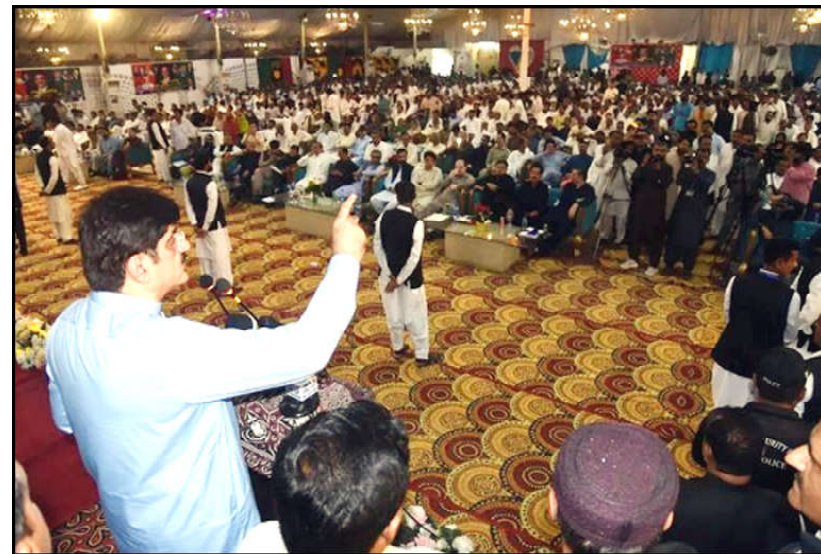
SHAHEED BENAZIRABAD: Sindh Chief Minister Syed Murad Ali Shah addresses party workers during divisional meeting at a Banquet Hall.

The revised price is expected to put an additional burden of over Rs 26 billion on the consumers.