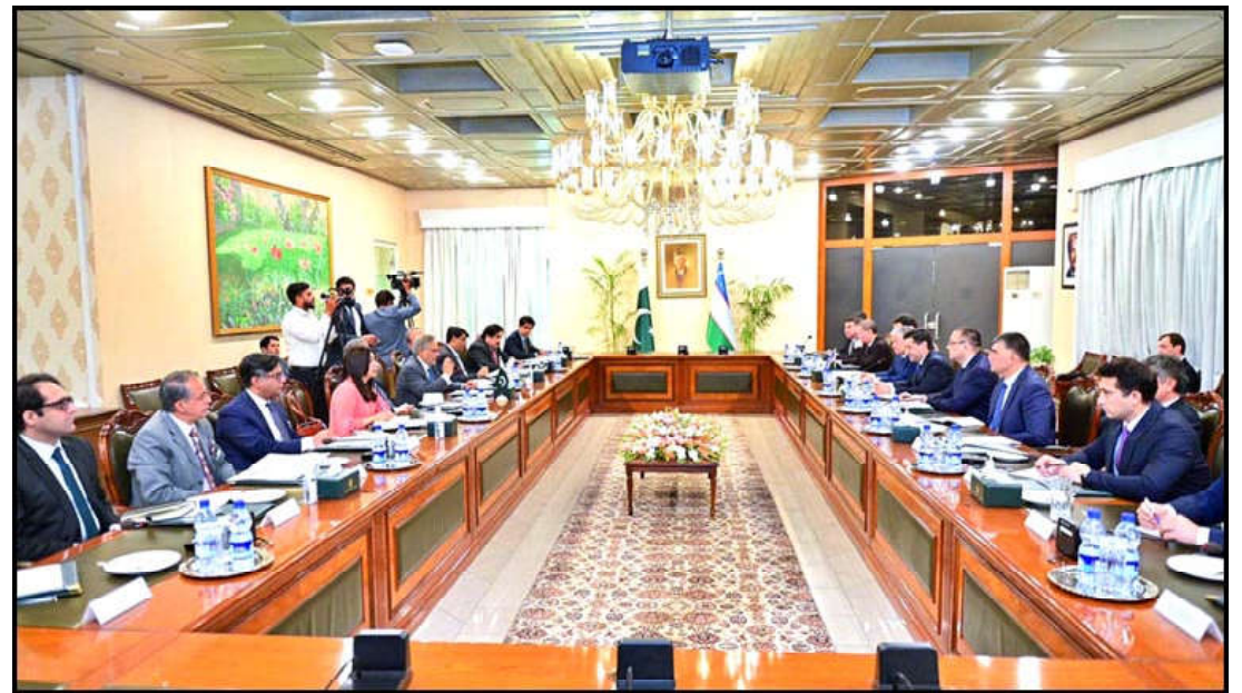
ISLAMABAD: Deputy Prime Minister and Foreign Minister Senator Mohammad Ishaq Dar and Foreign Minister of the Republic of Uzbekistan Bakhtiyor Saidov held delegation level talks at Ministry of Foreign Affairs.