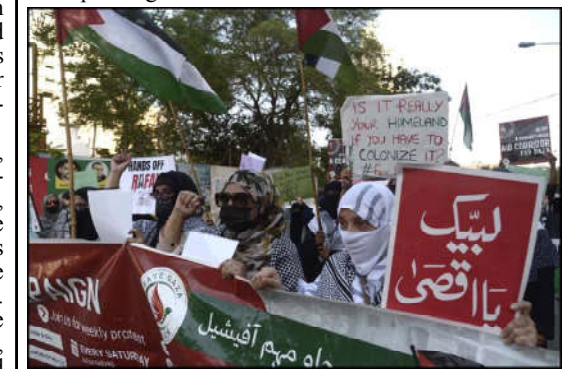
KARACHI: Members of Civil Society are holding protest demonstration against Israeli cruel and inhumane acts and express unity with the innocent people of Palestine, at Karachi press club.