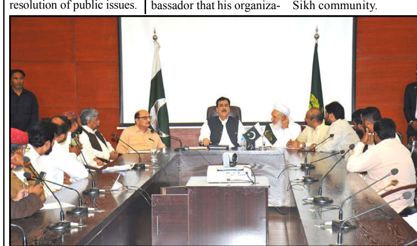
MULTAN: Chairman Senate Syed Yusuf Raza Gilani in a meeting with the different delegations at Circuit House.

KARACHI (APP): The Pak-Qatar Family Takafal Limited (PQFTL) announcing financial results for year 2023 on Wednesday, informed that it achieved a turnover of Rs16.30 billion while Shareholders Fund has posted Rs156.30 million net profit after tax. According to a statement issued here, profitability of the Shareholders Fund was calculated with earning per share (EPS) of Rs1.20 per share despite all challenges while the Participants' Takafal Fund (Waqf Fund) generated a surplus of Rs37.5 million. The company has increased its balance sheet footing through