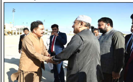
President Asif Ali Zardari seen off by the Governor Balochistan Jaffar Khan Mandokhail and Chief Minister Balochistan Mir Sarfaraz Ahmed Bugti at the conclusion of his official visit to Quetta.

The minister received a briefing regarding the facilitation center established at the SITE and directed to make the facilitation center functional at the earliest.