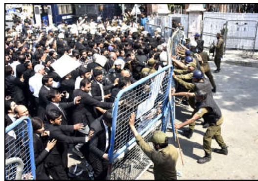
LAHORE: After clashes between lawyers and police in Lahore GPO Chowk, lawyers are throwing iron barriers to enter the High Court.