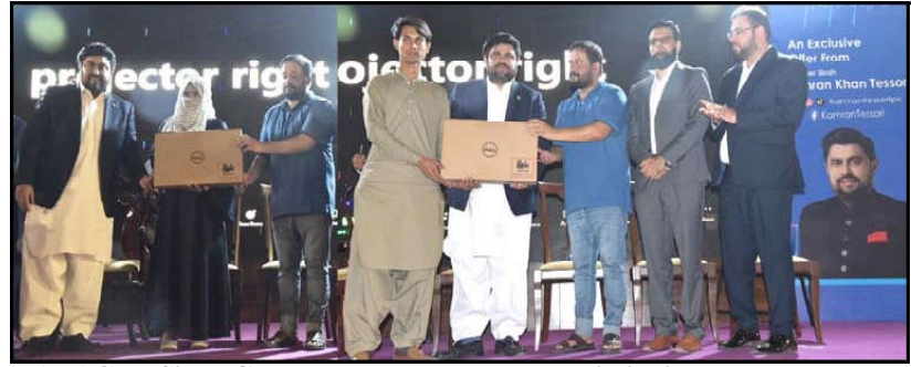
KARACHI: Sindh Governor Kamran Khan Tessori distributed laptops among IT students at the Governor House.