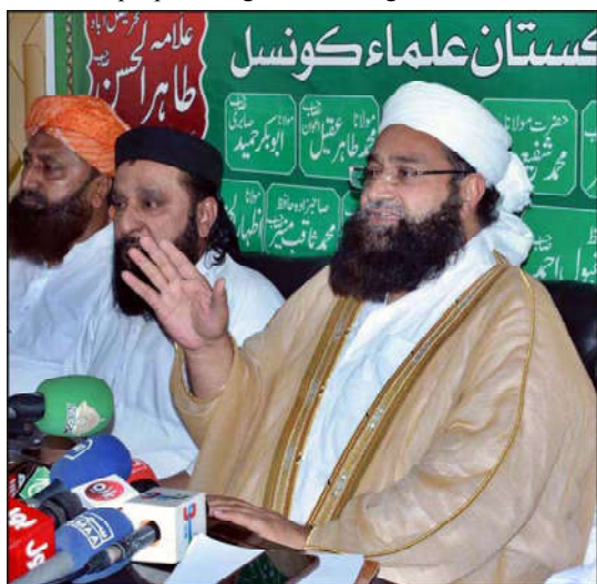
FAISALABAD: Chairman Ulema Council Hafiz Muhammad Tahir Mehmood Ashrafi addressing a press conference.

LAHORE (APP): Punjab Chief Minister Maryam Nawaz Sharif has taken note of a torture incident, committed against a teacher at the Government High School 9/95 L, Sahiwal. She sought a report from Commissioner Sahiwal in this regard and ordered for arrest of the accused at the earliest. The CM ordered to provide the best medical treatment facilities to the injured schoolteacher. She strongly condemned the attack, committed by boys on their teacher. She said, "Attack being perpetrated on a schoolteacher is unacceptable under any circumstance."