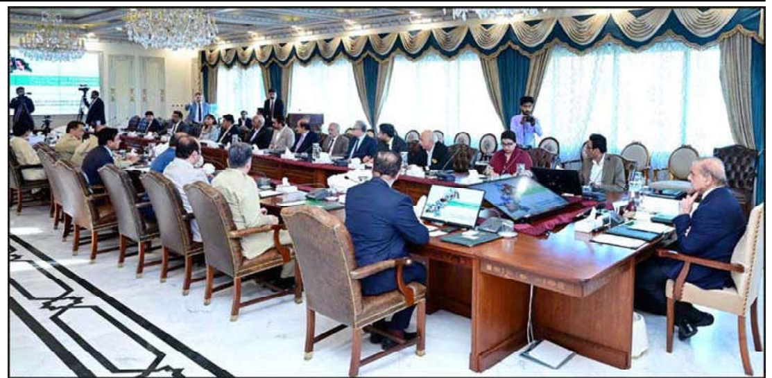
ISLAMABAD: Prime Minister Muhammad Shehbaz Sharif chairs a sectoral briefing regarding NAVTTC and Ministry of Overseas Pakistanis and Human Resource Development.