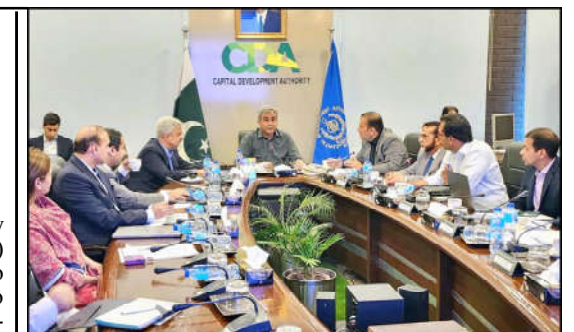
ISLAMABAD: Interior Minister Mohsin Naqvi chairing a meeting at CDA Headquarters.