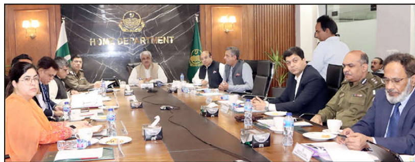
LAHORE: Punjab Health Minister Khawaja Salman Rafique chairing the fourth meeting of the Sub-Cabinet Committee on Law and Order, held at the home department.

facilities to them. "Farmers are hardworking people so their welfare and provision of facilities to them was among our priorities," he said. He emphasized that transparency and quality assurance as core principles of the procurement process and in this regard, he added, effective measures had been made. "Not buying wheat from Pakistan Agricultural Storage & Services Corporation Limited (PASSCO) resulted in a benefit of Rs 12 billion which would be utilized in the construction and maintenance of warehouses," he said.