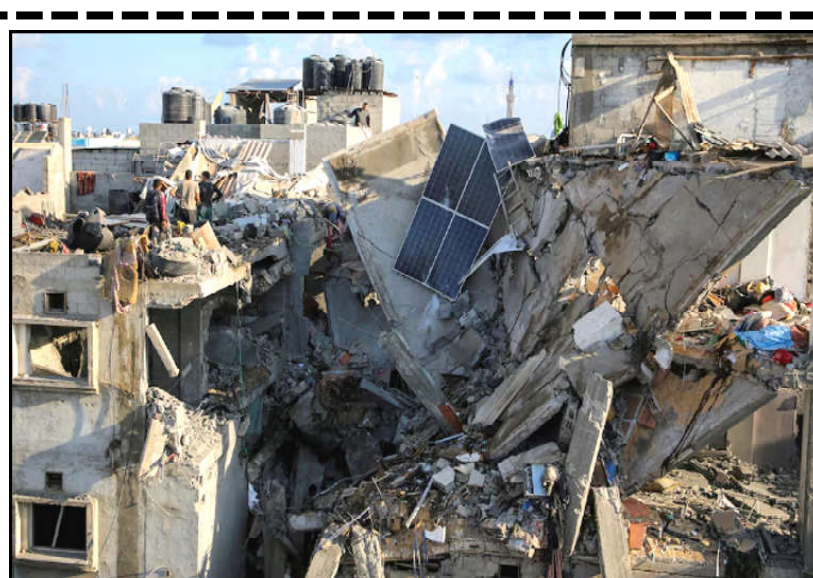
Palestinians inspect the site of an Israeli strike on a house in Rafah, in the southern Gaza Strip.

in the carefully choreographed inauguration. The West and his opponents (who are mainly in jail or abroad) cast this as 'a fig leaf of democracy', 'covering a corrupt Russian autocracy'. As the Russian elite waited in the Hall of Saint Andrew within the Grand Kremlin Palace (where the imperial throne once sat), Putin dissected documents in his office. After this, he walked down the corridors of the Kremlin saluting guards and even stopped to 'leisurely' study a picture on the wall. "We do not refuse dialogue with Western states," Putin stated after being sworn in. He added that he was ready for talks on 'security and strategic stability' but only on the condition that there was no "arrogance" on the part of the United States and its allies. Russia's chief (of more than 24 years) promised "victory" and said all Russians were now "answerable to our thousand-year history and our ancestors." He departed from the ceremony to the music "Hail" from Mikhail Glinka's opera "A Life for the Tsar". The words "Hail, hail, my Rus! Hail you are my Russian land" rang out in the Kremlin. The original words are "Hail, hail, our Russian tsar!". "The authority of our president is higher than ever, higher than the American president, higher even than the Russian tsar. So much depends on our president" said Gennady Zyuganov (a leader of the Communist Party).